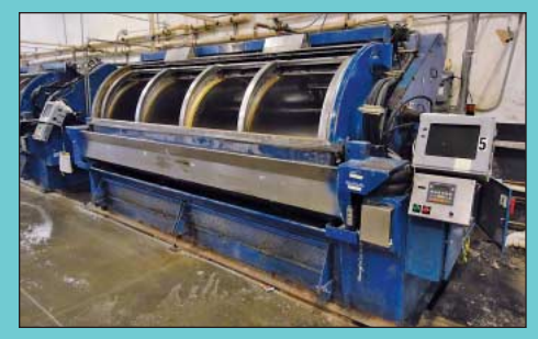
(2) 900 Lb. Ellis Model Z472Z Side-Loading Washer /