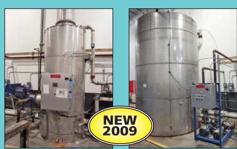
Thermal Engineering of Arizona Model DC-1-200 Natural Gas Direct Contact Heater