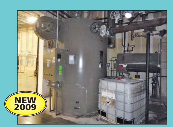
Fulton Model VMP-150 Natural Gas/ No. 2 Oil Fired Boiler