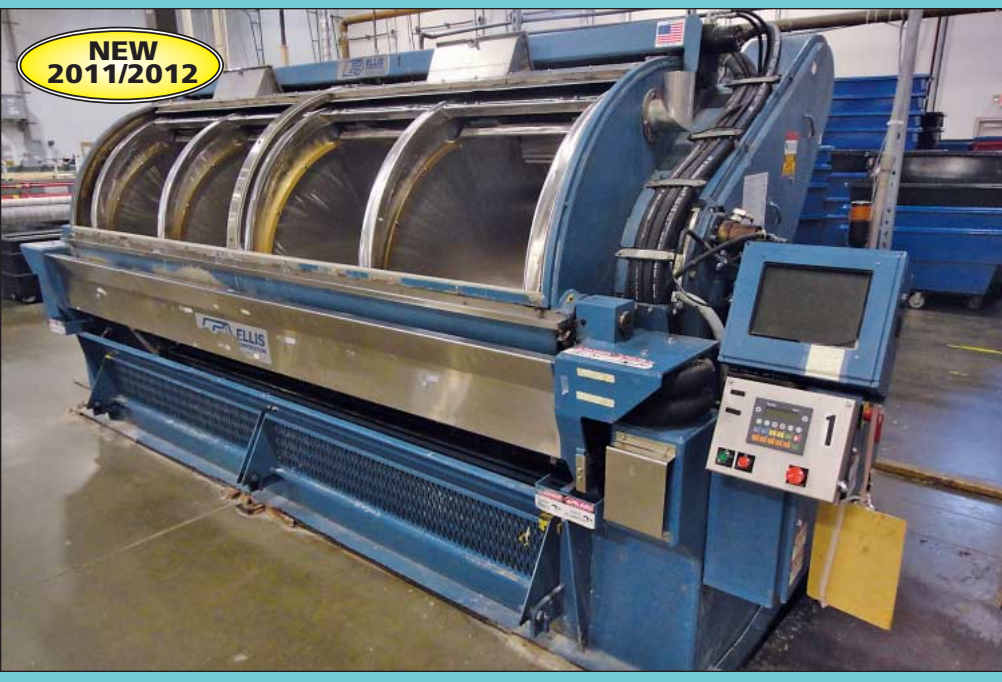
900 Lb. Ellis Model Z472Z High-Speed Side-Loading Washer / Extractor