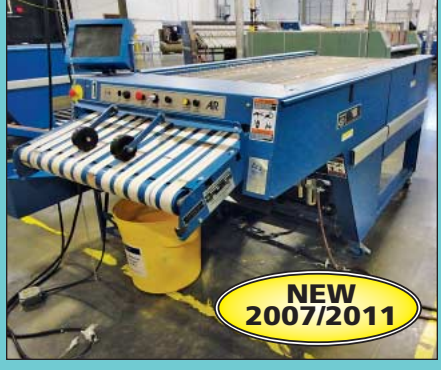
(2) 120" Wide Chicago Model Skyline S-10-2000 Large Piece Commercial Folder / Cross-Folders