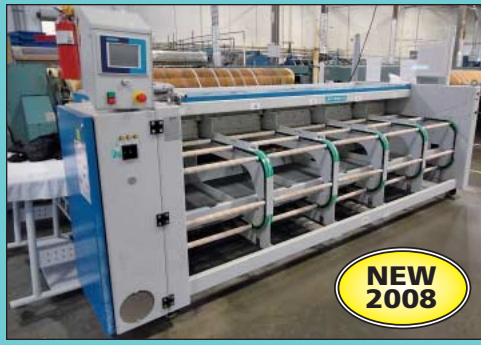
120" Wide Jensen Model Drape & Store Five-Lane