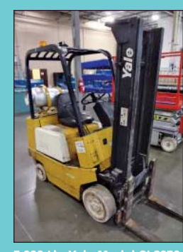
3,000 Lb. Yale Model GLC030 LP Gas Solid Tire Lift Truck