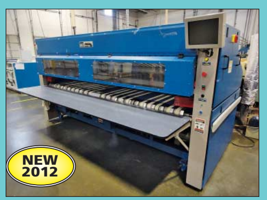
(2) 120" Wide Chicago Model Skyline S-10-CT Large Piece Commercial Folder / Cross-Folders