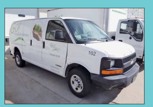
**2006 Chevrolet 2500 Express Cargo Van Subject to Owner Obtaining Titles