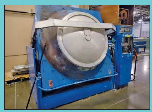
400 Lb. Braun Norman Dryer Div. Model 123H-NGF