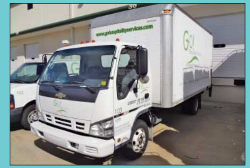
**2006 Chevrolet W3500 Model 4HK1TC Box Truck Subject to Owner Obtaining Titles