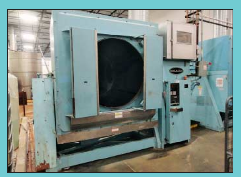
(2) 500 Lb. Braun Norman Dryer Model 440P-NGF Pass-Thru Tilting Dryers