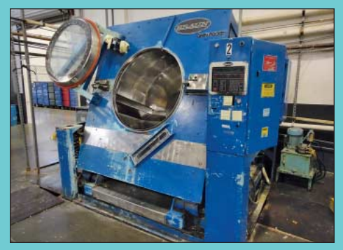
500 Lb. Braun Model 400-NOLUDPV Tilting Open-Pocket Washer / Extractor