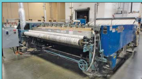
120" Wide American Laundry Model Hypro II Class 160