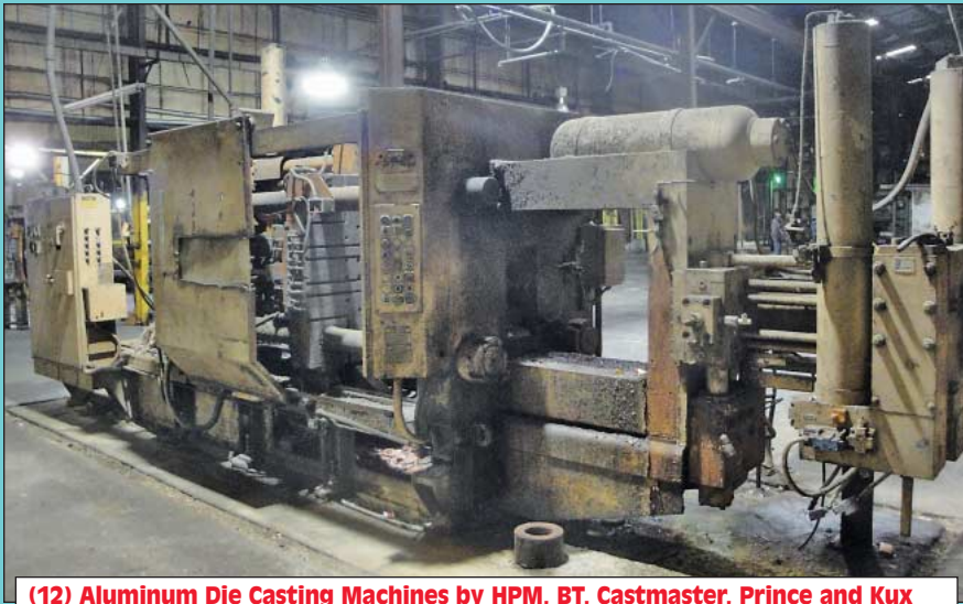
(12) Aluminum Die Casting Machines by HPM, BT, Castmaster, Prince and Kux

INSPECTION: WEDNESDAY, JANUARY 28TH FROM 8:00 AM TO 4:00 PM