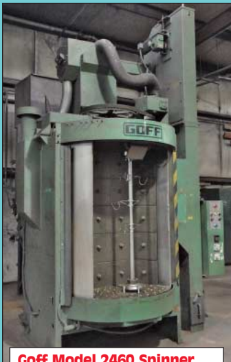
Goff Model 2460 Spinner Hanger Shot Blast Machine