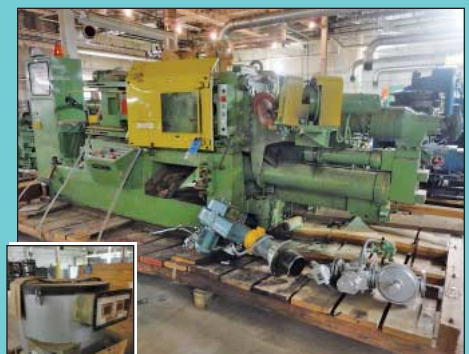
(3) 100 Ton Frech Model DAK-100H Cold Chamber Die Casting Machine Cells with Furnaces and Related