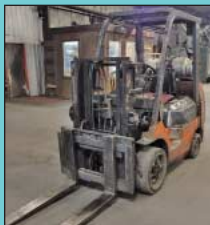
6,000 LB Toyota Model 7FGCU30 LP Gas Cushion Tire Lift Truck