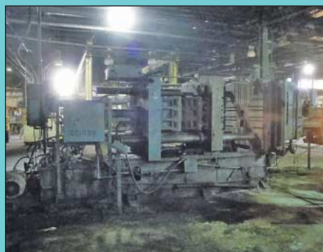
650 Ton Kux Model BH600 Cold Chamber Aluminum Die Cast Machine