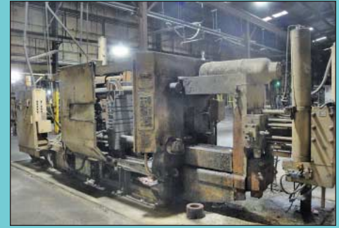
600 Ton HPM Model II 600-600A Cold Chamber Aluminum Die Cast Machine