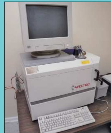
Spectro Model Spectromax Stationary Metal "Spark" Analyzer