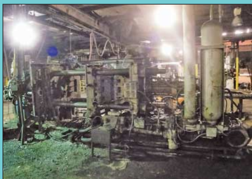
500 Ton Castmaster Model C40A Cold Chamber Aluminum Die Cast Machine