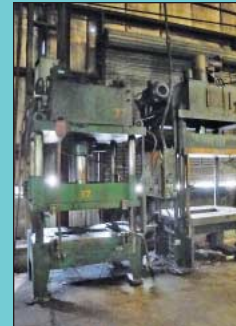
20 Ton Prince Four Post Hydraulic Trim Press