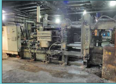
600 Ton HPM Model II 600-600A Cold Chamber Aluminum Die Cast Machine