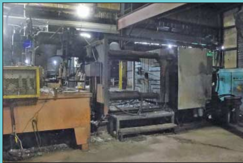
1,000 Ton B&T / XLO Micromatic Cold Chamber Aluminum Die Cast Machine