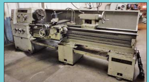
21" x 84" Mighty Turn Model ML-2180GL H.D. Geared Head Engine Lathe