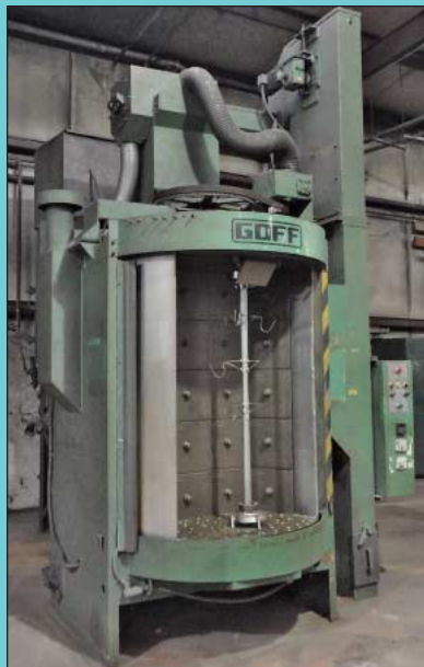
Goff Model 2460 Spinner Hanger Shot Blast Machine