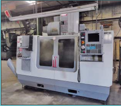
Haas Model VF-3B CNC Vertical Machining Center