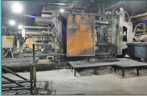
800 Ton Prince Cold Chamber Aluminum Die Cast Machine