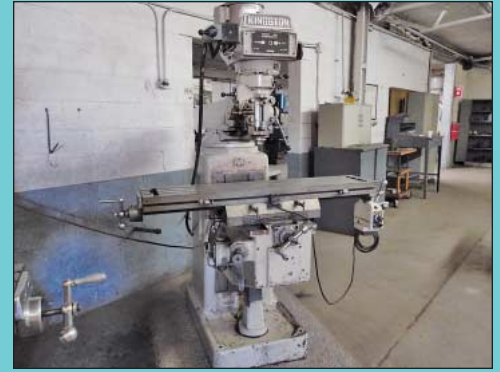
(2) 3 HP Kingston Model KMT-3V Variable Speed Vertical Mills