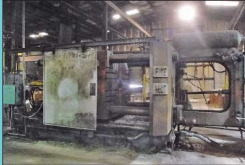
1,000 Ton B&T / XLO Micromatic Cold Chamber Aluminum Die Cast Machine