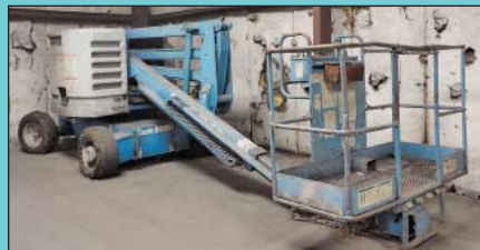
Genie Model Z-45/22 LP Boom Type Manlift