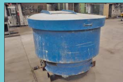
60" Diameter Roto Finish Model RT-20 Vibratory Finishing Machine