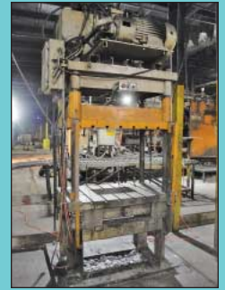
10 Ton Prince Four Post Hydraulic Trim Press