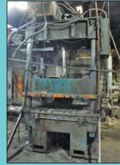
20 Ton Four Post Hydraulic Trim Press