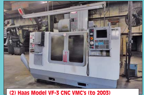
(2) Haas Model VF-3 CNC VMC's (to 2003)