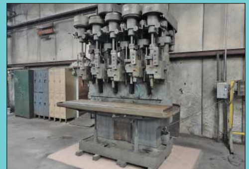
(2) 26" Allen Five-Spindle Production Drills