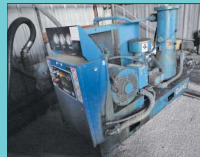
25 HP Quincy Model QSB25ANA31N Skid Mounted Rotary Screw Air Compressor