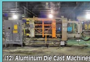
(12) Aluminum Die Cast Machines

Contact Information 2020 Dunlap St. Cincinnati, Ohio 45214 Phone 513-241-9701 Fax 513-241-6760 www.cia-auction.com