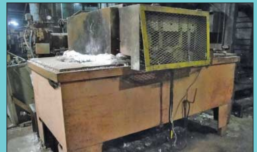
(10) 2,000 to 3,000 LB Electric & Gas Fired Holding Furnaces