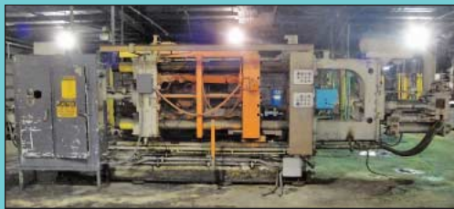
700 Ton B&T / XLO Micromatic Cold Chamber Aluminum Die Cast Machine