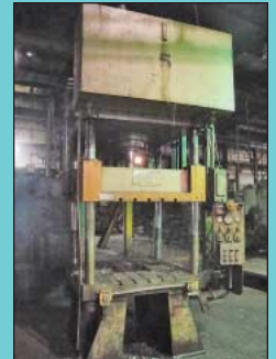
20 Ton Core Steel Four Post Hydraulic Trim Press