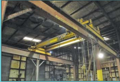
15 Ton x 22' Span x 64' Long Approx. Detroit / American Top Running Double Girder Free-Standing Bridge Crane System