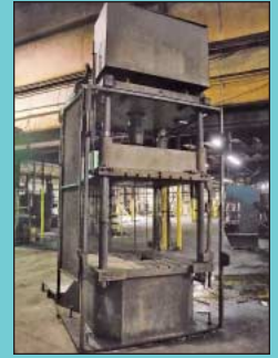
75 Ton Four Post Hydraulic Trim Press