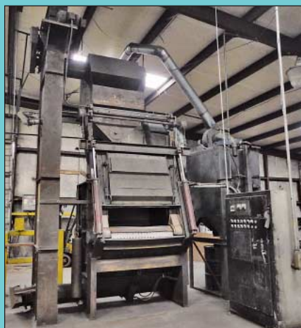
42" Wide x 30" Diameter Wheelabrator Steel Fight Tumble Blast Machine