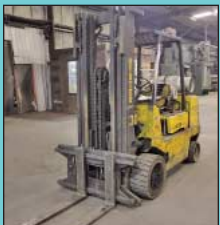
8,000 LB Hyster Model S80 XL LP Gas Cushion Tire Lift Truck