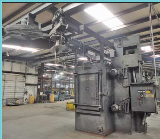
Wheelabrator Model WS210S Spinner Hanger Shot Blast Machine