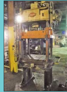
20 Ton Greenlee Four Post Hydraulic Trim Press