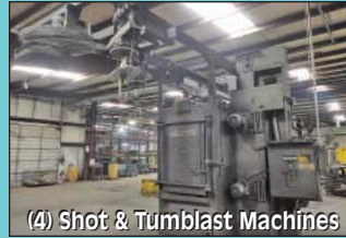
(4) Shot & Tumblast Machines