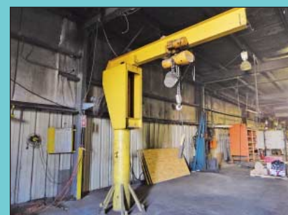
2 Ton 360 Degree Rotating Jib Crane w/ 2 Ton Yale Electric Hoist