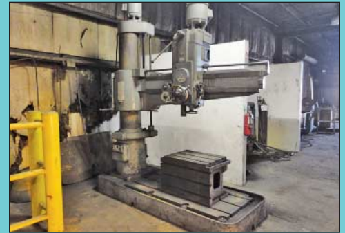
4" Arm X 13" Column Webo Model 22 Radial Arm Drill