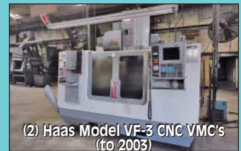
(2) Haas Model VF-3 CNC VMC's (to 2003)