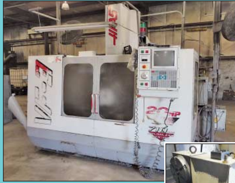
Haas Model VF-3 CNC Vertical Machining Center