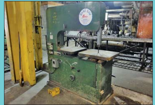
40" Enco Model 92260 Vertical Band Saw