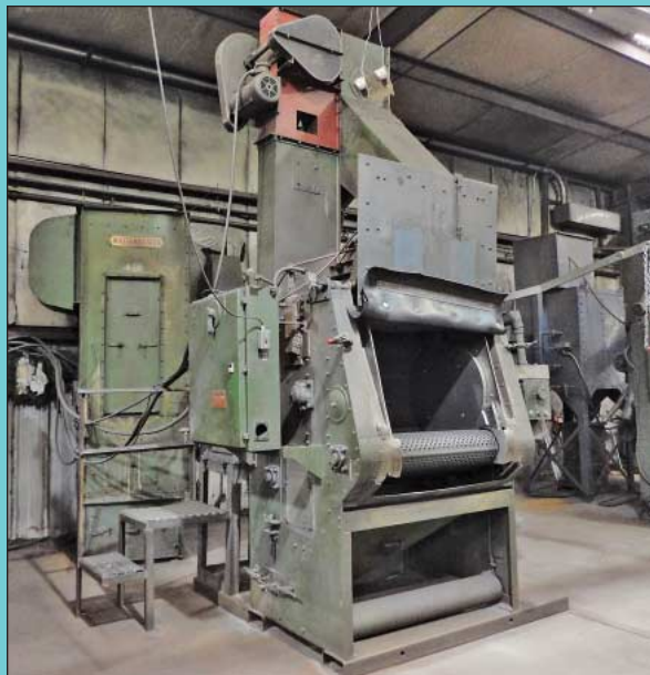
36" Wide x 27" Diameter Wheelabrator Rubber Belt Tumblast Machine