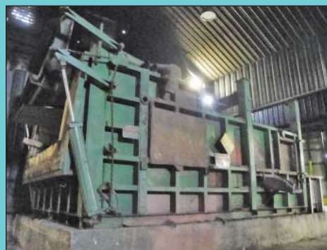
2,800 LB Lindberg / MPH Model 62-ACMP-2800 Gas Fired Bath Type Furnace