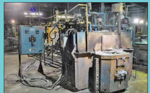
3,000 LB Schaffer Gas Fired Holding Furnace