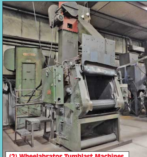
(2) Wheelabrator Tumblast Machines