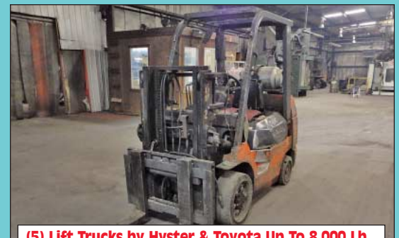
(5) Lift Trucks by Hyster & Toyota Up To 8,000 Lb