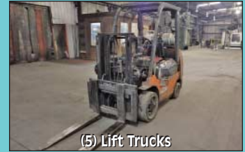
(5) Lift Trucks