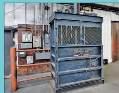
30" X 60" Cram-A-Lot Vertical Hydraulic Baler