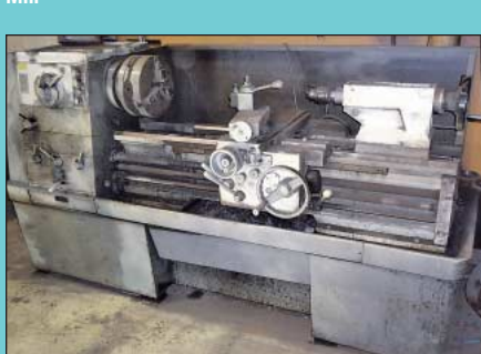
17" X 36" Colchester Geared Head Engine Lathe