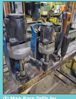
(3) Mag-Base Drills by