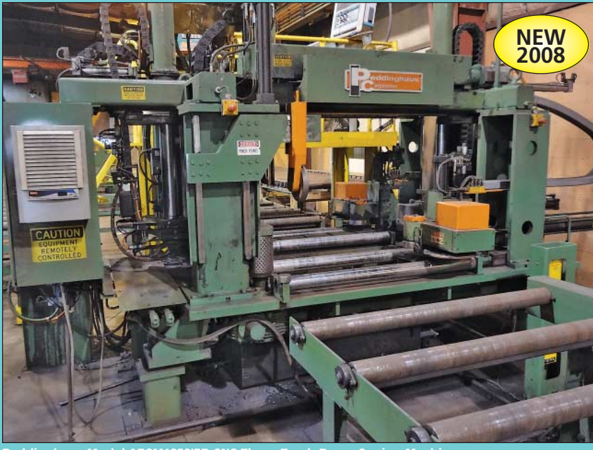
Peddinghaus Model ABCM1250I3D CNC Three-Torch Beam Coping Machine