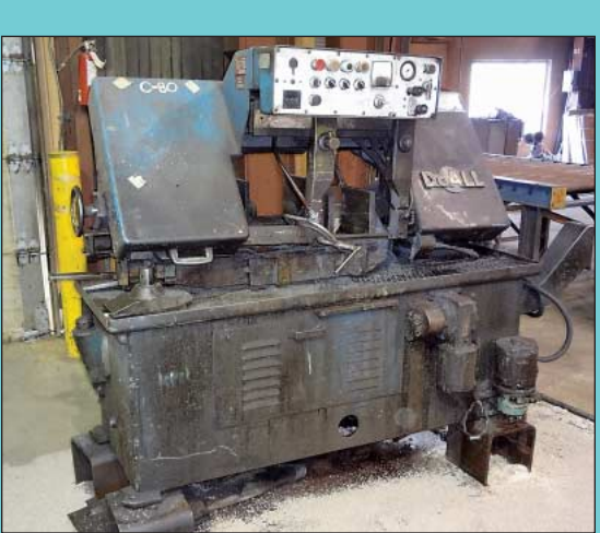
12" X 16" DoAll Model C-80 Semi-Automatic Horizontal Band