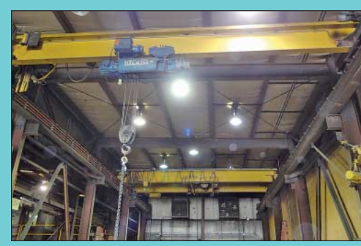
10 Ton X 28' Approx. Span Remote Control Single Girder Top Running Overhead Bridge Crane