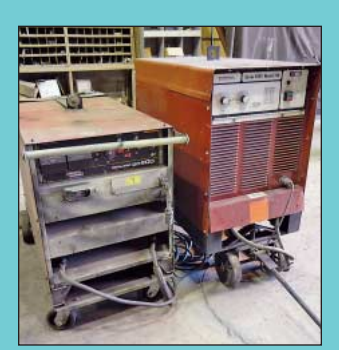
Partial View of Late Model Lincoln Welders to 1,000 Amp and Stud Welder