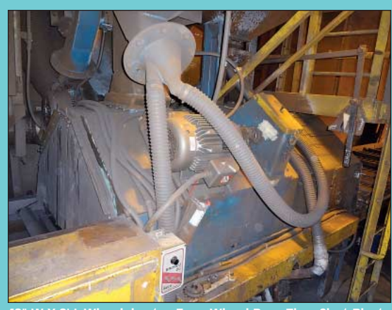
L Wheelabrator Four-Wheel Pass-Thru Shot Blast