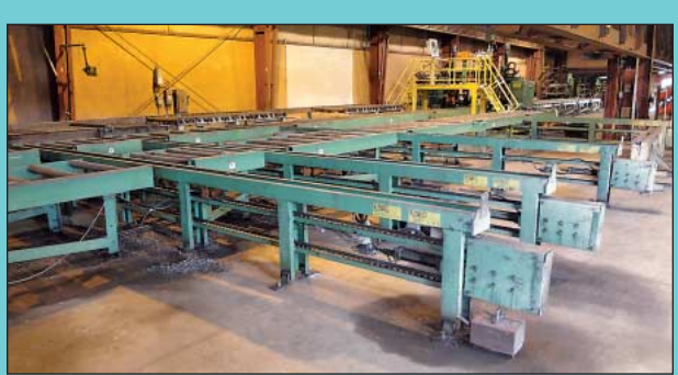
54" X 50' Peddinghaus Infeed Transfer Conveyor