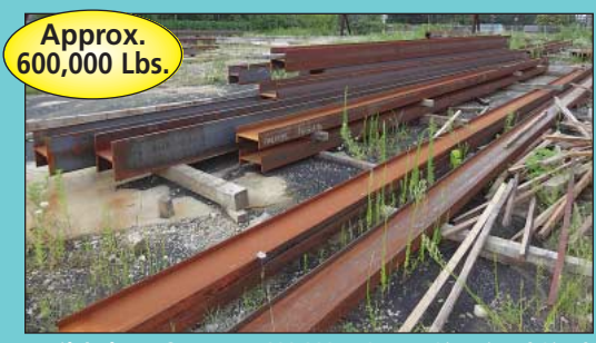
Partial View of Approx. 600,000 LBS New Structural Steel