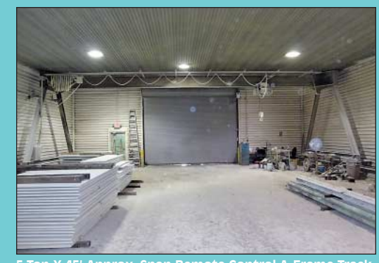
Mounted Gantry Crane