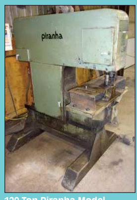
120 Ton Piranha Model