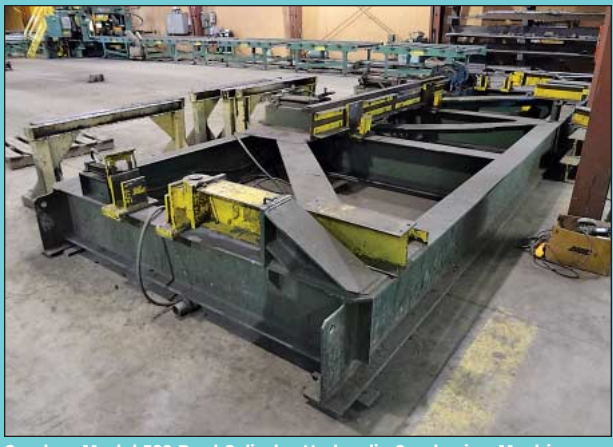
Cambco Model 520 Dual Cylinder Hydraulic Cambering Machine