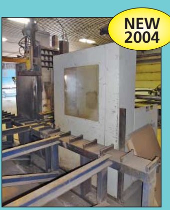
Ocean Peddinghaus Model