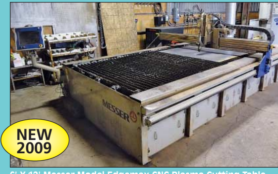
X 12' Messer Model Edgemax CNC Plasma Cutting Table

(2) 10 Ton X 25' Approx. Span Remote Control Single Girder Overhead Bridge Cranes; 10 Ton Demag Cable Hoist