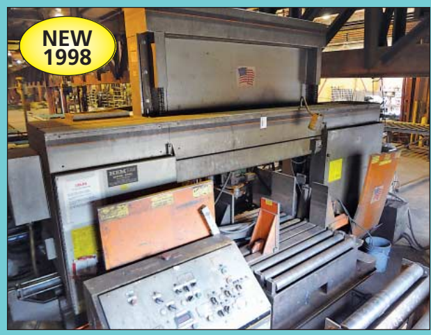
25" X 40" HEM Model WF190 M-DC Dual Column Horizontal Band Saw