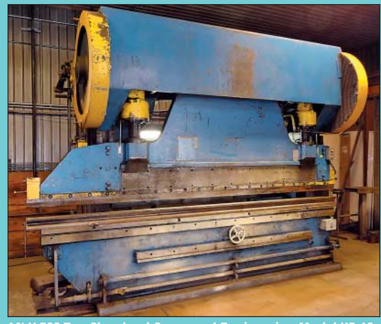
14' X 300 Ton Cleveland Crane and Engineering Model K5-10 Mechanical Press Brake