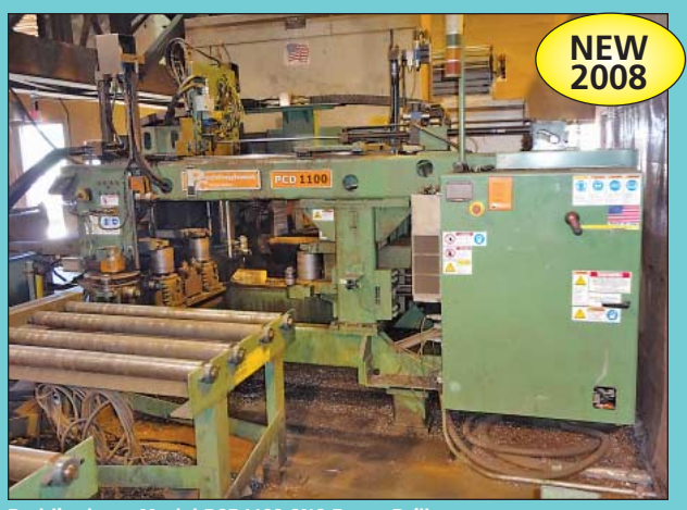
Peddinghaus Model PCD1100 CNC Beam Drill