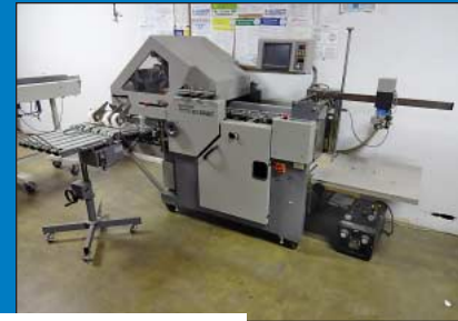
MBO B26 & B20 Continuous & Pile Feed Folders (1) w/ HHS Promelt Glue System, Horizon AFC-544AKT Cross Folder