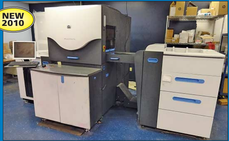
13" X 19" HP Indigo Model 3550 Four-Color Digital Press