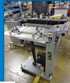
Horizon Booklet Maker, 26" Polar Paper Cutter, Paragon Inkjet Base, (2) Kirk-Rudy Tabbers, Kirk-Rudy Bump Turner