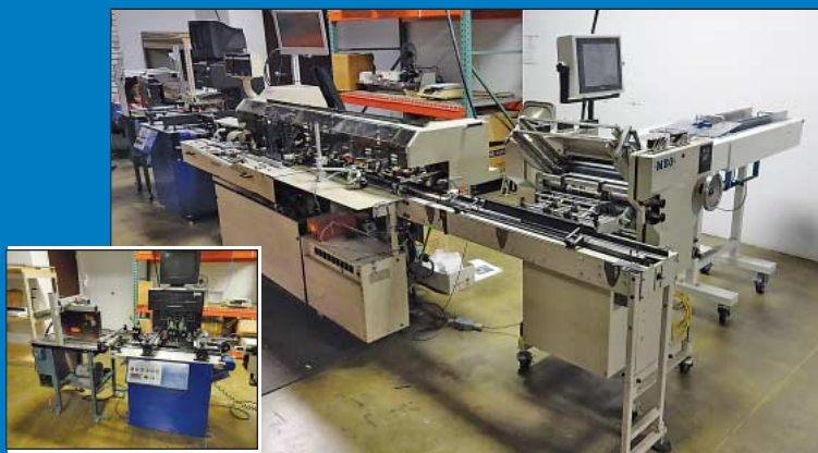
Fold/Insert/Addressing Line Consisting of: MBO Folder, EMC Conquest Inserter w/Camera System, Buskro Inkjet, and Dryer