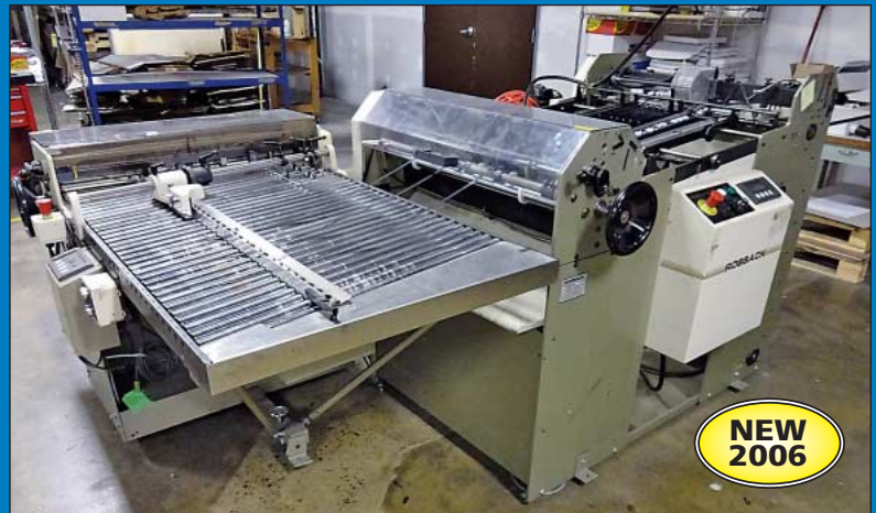
30" Rosback Model 240XL Score & Perf Machine w/ 248 Right Angle Attachment

INSPECTION: Tuesday, June 28th from 10:00 AM to 4:00 PM