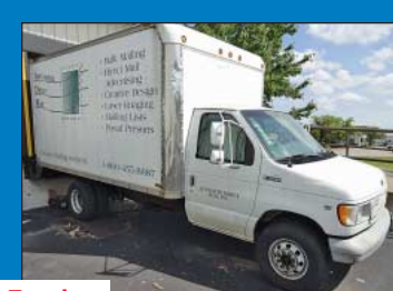
Kluge Die Cutter, Graphic Whizard UV Coater, Dynaric Strappers, Perfect Binder, Lift Truck, Box Truck