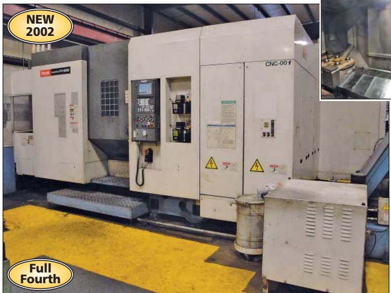
(2) Mazak Model FH-6800 Two-Pallet CNC Horizontal Machining Centers