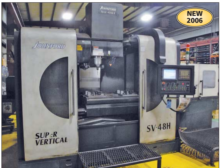
Johnford Super Vertical Model SV-48H Two-Pallet CNC Vertical Machining Center