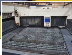
3,200 Watt Trumph Trumatic L3030 CNC Laser Cutting Machine