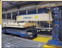
4,000 Watt Trumph Trumatic L3030 CNC Laser Cutting Machine