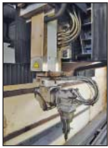
3,200 Watt Trumph LaserCell TLC-1005 Five-Axis CNC Profile Laser Cutting Machine