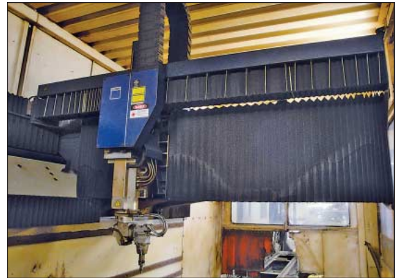
Close Up View Bridge of Trumph TLC-1005 Five-Axis Laser