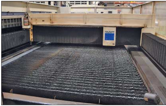
Close Up View Bridge of Trumf L4030 CNC Laser

Rotary Axis for Pipe, 20 MM Max Material Thickness, (2) 84" X 163" Shuttle Tables, Siemens 840D Control and Drives, Reidel Precision Cooling System Type L15/21 TR3/19.30 Model 2KA3040, 5 HP Handle Type MF-L Size 40/8/1 Dust Collector ( New 2001 ) SEE PHOTO