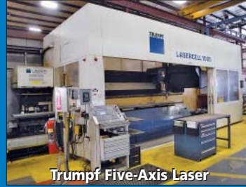
Trumpf Five-Axis Laser