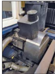
3,200 Watt Trumf Trumatic L4030 CNC Laser Cutting Machine w/ B-Axis