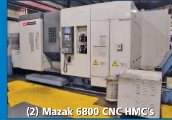
(2) Mazak 6800 CNC HMC's