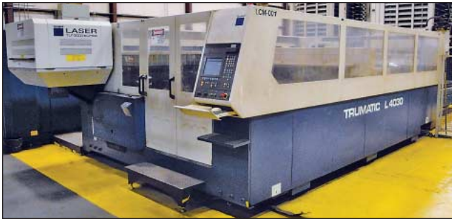
(3) Trumpf Three-Axis Lasers

All people planning on making an inspection must fill out information form 1102 by 7/25, email Kendrea@cia-auction.com for forms and approval info.