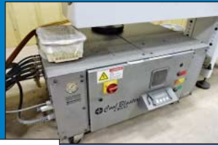
Lathe Bar Feeds and Coolant Pumps