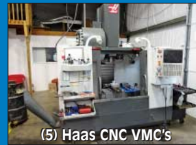
(5) Haas CNC VMC's

Contact Information 2020 Dunlap St. Cincinnati, Ohio 45214 Phone 513-241-9701 Fax 513-241-6760 www.cia-auction.com