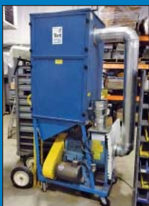
5-HP Torit Donaldson Model 200 Portable Dust Collector