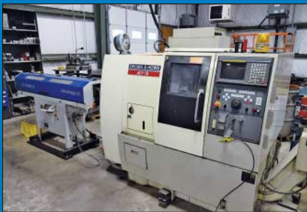
Okuma Howa Model ACT-15 CNC Turning Center