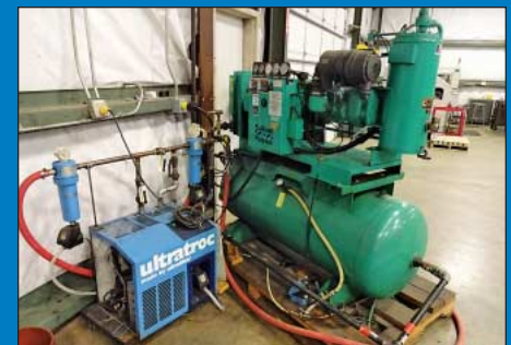
Sullivan Palatek 25-D4 Air Compressor