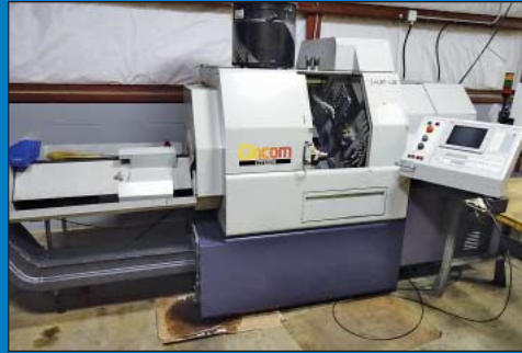
1998 Citizen Cincom L32 VII Swiss Type CNC Screw Machine