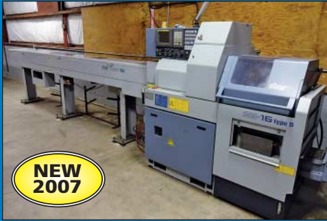
2007 Star Model SB-16D Swiss Type CNC Screw Machine