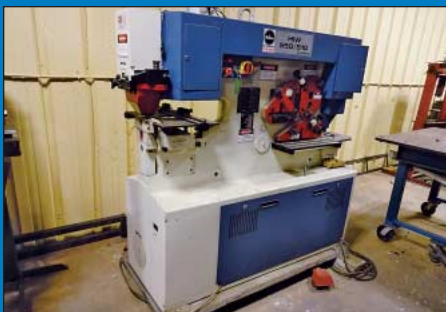
2000 Mubea Model HIW 550/510 Hydraulic Ironworker