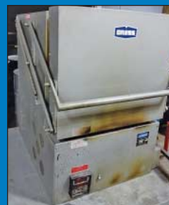
Cress Model C1220 Electric Toolroom Furnace