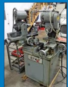
Cincinnati Milacron Monoset Cutter Grinder