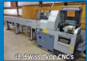
(3) Swiss Type CNC's