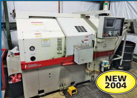
2004 Okuma Tatung BB Model ESL10 CNC Turning Center