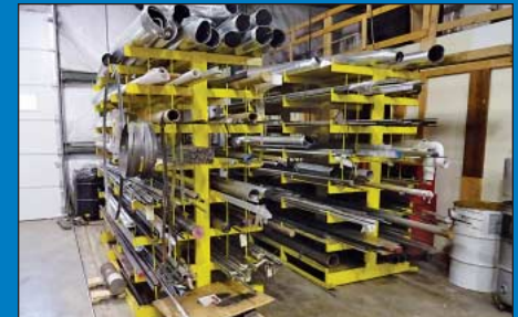
Material and Bar Stock

Very Clean Shop Equipment, Hoppers, Tools, Benches, Cabinets, Carts and Related