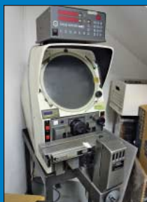
Gage Master Model GM5-29 Optical Comparator