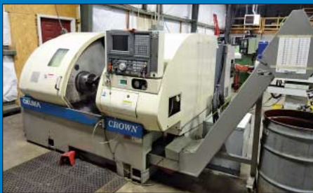
1999 Okuma Crown Model 762S-BB CNC Turning Center