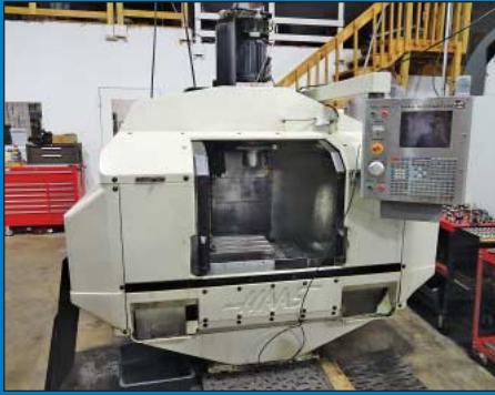
1992 Haas Model VF2 CNC Vertical Machining Center