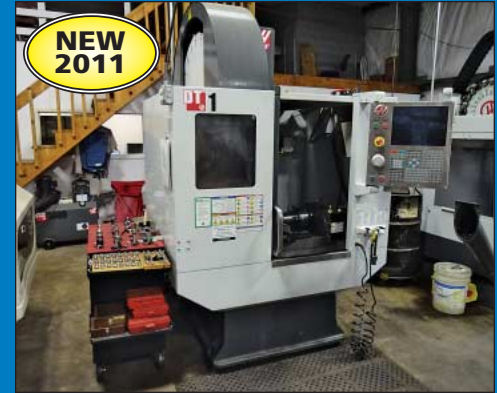
**2011 Haas Model DT-1 CNC Drilling and Tapping Center