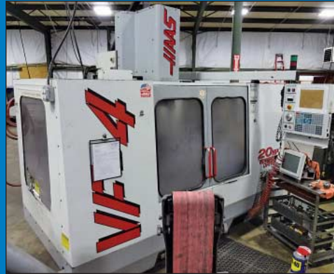
1999 Haas Model VF4 CNC Vertical Machining Center