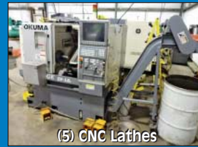
(5) CNC Lathes