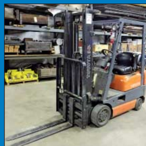
3,000 Lb. Toyota Model 42-6FGCU15 Solid Tire LPG Lift Truck