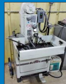
Sunnen MBB-1660 Honing Machine