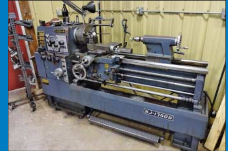
17" x 40" Osama Sr. SJ-1740G Engine Lathe

Victor Gas Straight Burner; s/n CM1473179