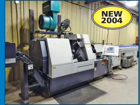
2004 Citizen Cincom Model L-32 VII Swiss Type CNC Screw Machine