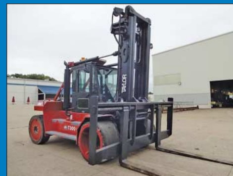
**30,000 Lb. Taylor Model T-300M Diesel Power Cushion Tire Lift Truck