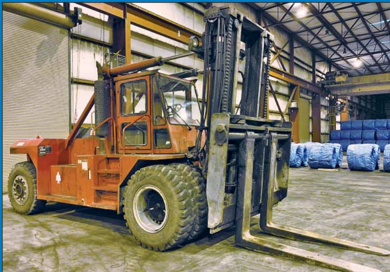
52,000 Lb. Taylor Model TE-520M Pneumatic Tire Diesel Powered Lift Truck

DIRECTIONS: From downtown Nashville, head east on Jefferson Street across the Cumberland River. Turn Left on Cowan Street. Sale Sight is on the Left after Topgolf.