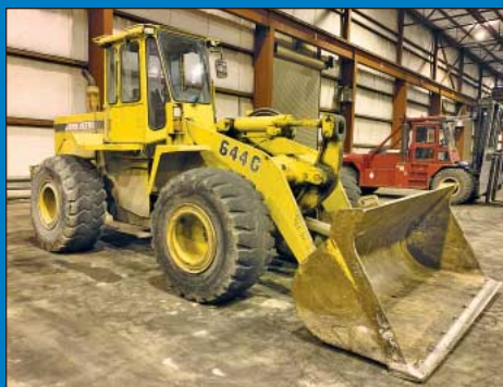
John Deere Model 644G Wheel Loader