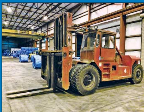
52,000 Lb. Taylor Model TY-520M Pneumatic Tire Diesel Powered Lift Truck