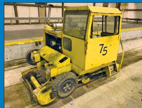
Whiting Model DT 15.6 Trackmobile