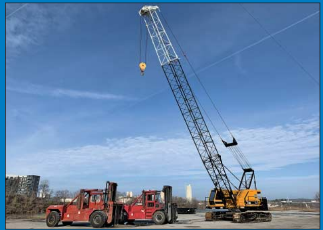
100 Ton American Crawler Crane and (2) 52,000 LB Taylor Lift Trucks