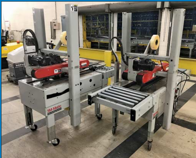
(3) 3M Model 700r Case Sealers

15% ONSITE BUYERS PREMIUM • 18% ONLINE BUYERS PREMIUM