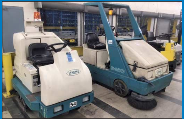
Tennant Electric Sit-Down Floor Scrubber and Floor Sweeper