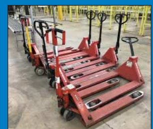
Small Hand Tools, Vertical Baler, Labelers, Zebra Label Printers, Pallet Trucks and More