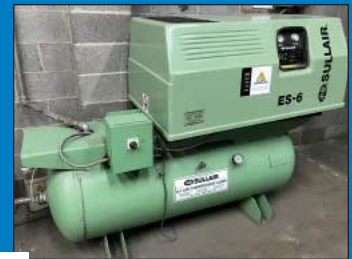
Stretch Wrappers, Sweepers, Scrubbers, Mettler Toledo Inline Scales, Air Compressors