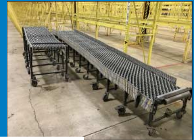
(1000') Omni Metalcraft Line Shaft Conveyor, Extending Rubber Belt Trailer Conveyor, Accordion Conveyor