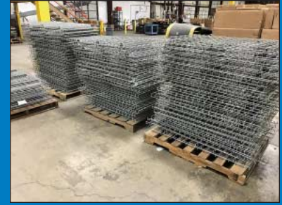
Various Size and Style Adjustable Beam Pallet Racking, Wire Decking