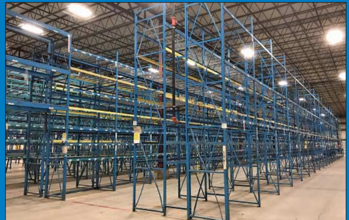
(1095) Sections of Various Size T-Bolt Pallet Rack

INSPECTION: Wednesday, March 21st from 10:00 AM to 4:00 PM