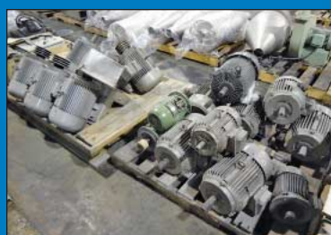
(50) (Approx.) Electric Motors (Some New) For Extrusion Equipment From 5 HP to 25 HP