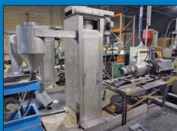
(9) Continental Polymer (Beringer Model WRP35S Type) Spin Dryers