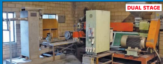
6" Continental Polymer Double Vent Dual-Stage Thermoplastic Extruder