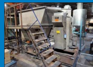
Gala Industries Model 52DWL Dryer System