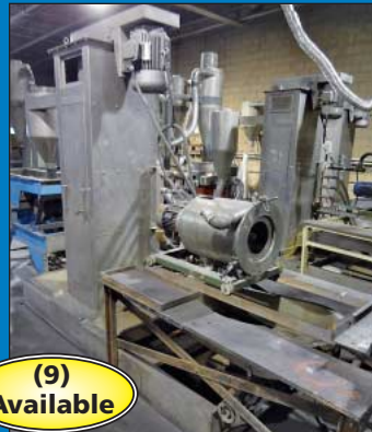
(7) Stainless Steel Blending Tanks To 48" X 60"