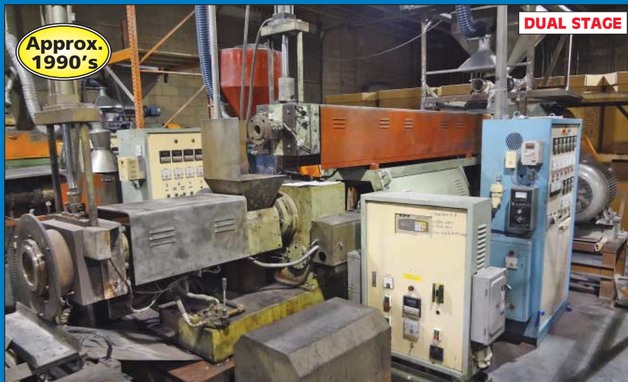
6" Continental Polymer Double Vent Dual-Stage Thermoplastic Extruder