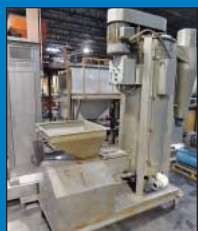
(3) Continental Polymer Stainless Steel Spin Dryers