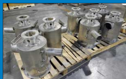
(8) Continental Polymer Stainless Steel Water Ring Pelletizers