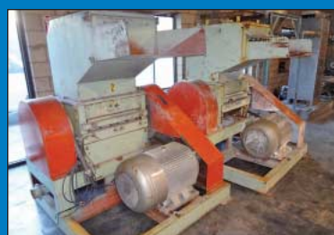
(6) 60 and 75 HP Continental Polymer Plastic Granulators To 14" X 24" Throat