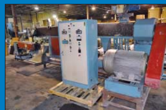
6" Continental Polymer Dual Vent Single-Stage Thermoplastic Extruder