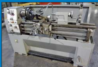
Toolroom and Misc. Machinery Including Lathe, Mill, Grinder and Related