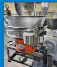
24" T.E.A. Model 30 Shaker Screen