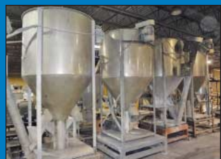
(7) Stainless Steel Blending Tanks To 48" X 60"