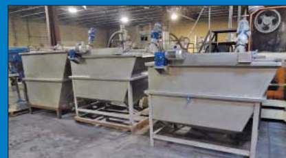
Four-Tank Stainless Steel Parts Wash Line System