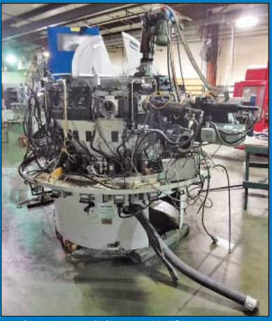
Hydromat Model HS-16 Station Rotary Transfer Machine