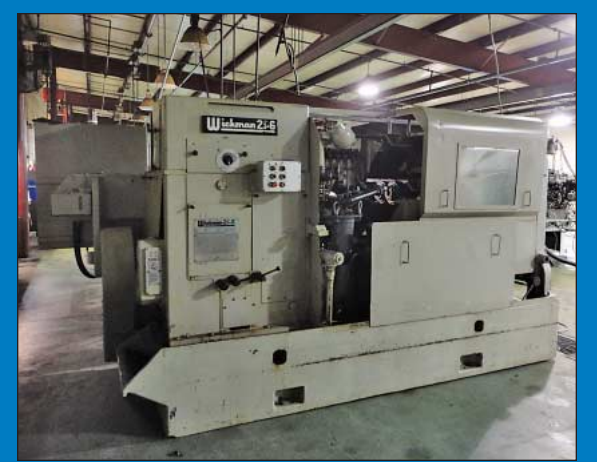
2-1/4" Wickman Model 2-1/4"-6 Six-Spindle Automatic Bar Machine

2020 Dunlap St., Cincinnati, Ohio 45214 Phone 513-241-9701 Fax 513-241-6760