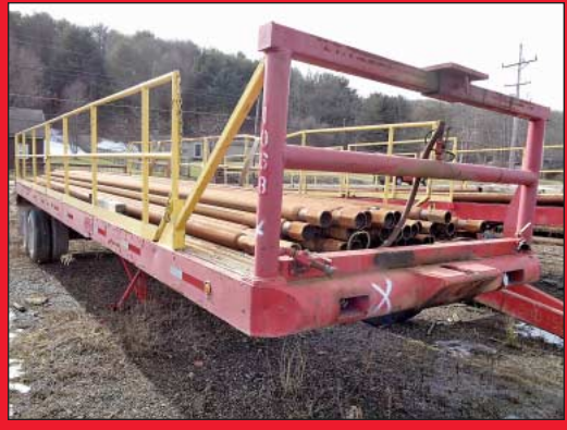
(2) 2007 Overbilt Tandem Flat Bed Float Trailers