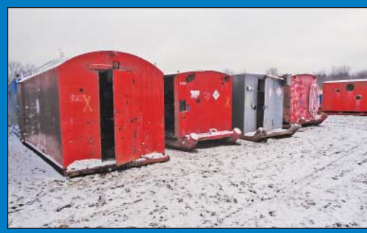
(4) 20' Long X 8' Wide X 7' High Oilfield Dog House Containers

Large Quantity of Other Items Including; Drilling Bits, Truck Tires, Vehicle and Drill Rig Parts, Other Items to Be Added During Set Up Activity