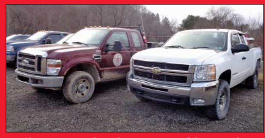
(13) Chevy, GMC, and Ford 3/4 Ton 4 X 4 Pick Up Trucks (New as 2015)