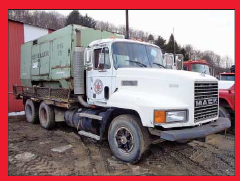
Sullair Model 1150XHHDL Skid Mounted Air Compressor on 1990 Mack Straight Truck

(4) Rectangular Construction Enclosed Skid Mounted Water Tanks;