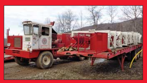
2000 Crown Remanufactured 1975 Cardwell AB-100 Service Rig