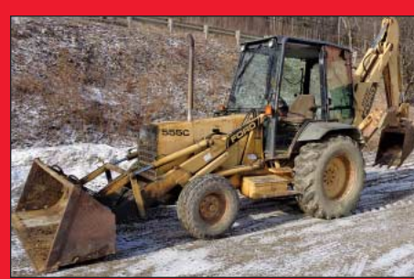
1990 Ford Model 555C 2-Wheel Drive Rubber Tire Backhoe / Front End Loader