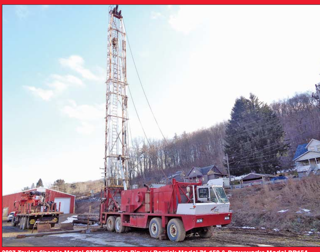
2003 Taylor Chassis Model C300S Service Rig w/ Derrick Model 71-150 & Drawworks Model DD154