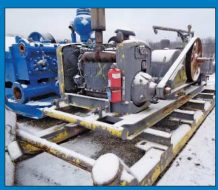
Gardner Denver Model FXN Skid Mounted Mud Pump