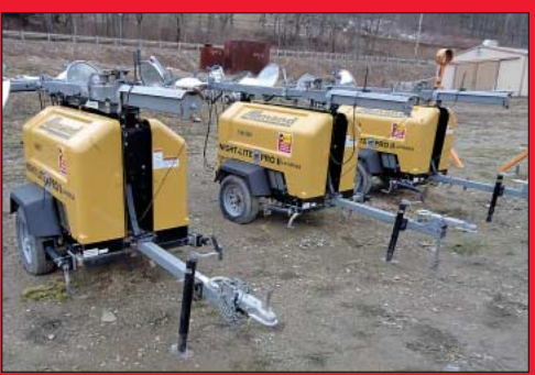
(3) Allmand Model SHO-HD-8KW Portable Light Towers