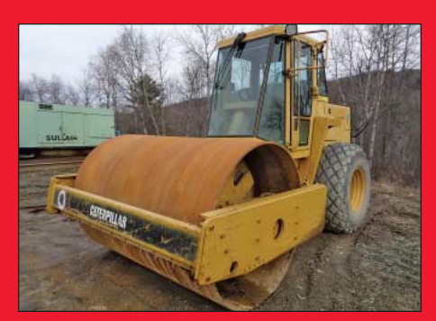
Caterpillar Model CS-563 Smooth Vibratory Compactor Roller