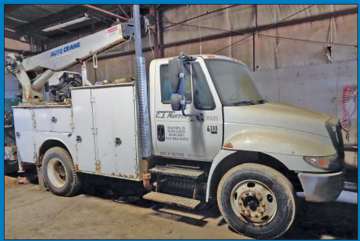
2003 International 4300 DT466 Single Axle Service Truck