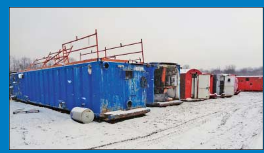
(2) 9' Wide X 50' Long X 7' High Rectangular Open Top Mud Blending Tanks