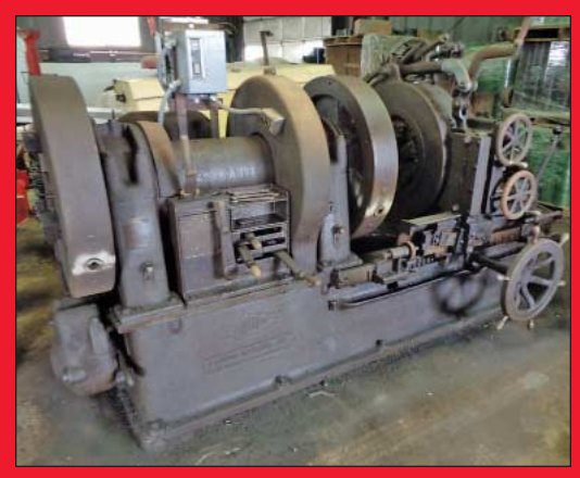
8-5/8" Landis Receding Chaser Semi-Automatic Pipe Threading and Cutting Machine