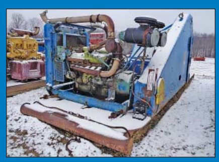
Gardner Denver Model FXD172 Skid Mounted Mud Pump