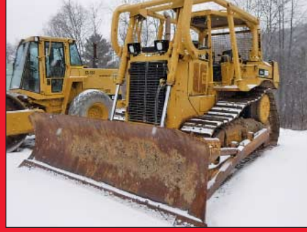
2007 Caterpillar Model D6R Incline Track Crawler

90" Wide X 24' Long X 77" Tall, Units 9036, 9035, 9033, 9037 SEE PHOTO