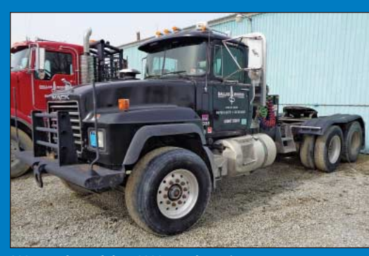
2003 Mack Model RD688S Road Tractor