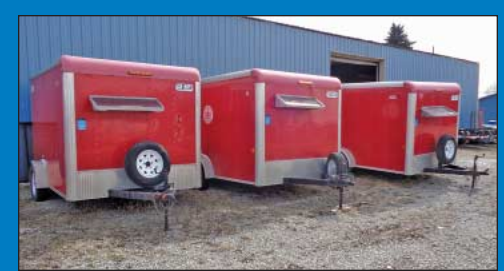
(4) 2009 / 2010 Car-Mate Model CM-710CC Single Axle Enclosed Trailers