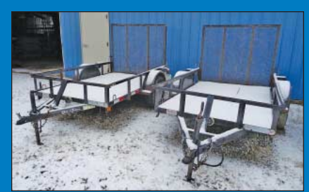
(4) Single Axle Trailer Dollies / Pup Trailers, Pintle Hitch Style