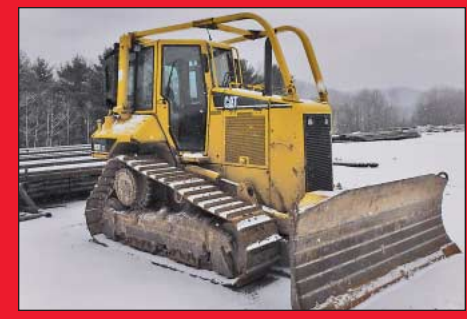
Caterpillar Model D5N XL Incline Track Crawler Dozer

2004 Peterbilt Tandem Axle Tractor with Winch; VIN # LXP-FDBOX-7-40831919, 475 HP Cad Model C-15 Engine, Tulsa Winch, Oilfield Style Front Bumper, 245,755 Miles, Unit 6040