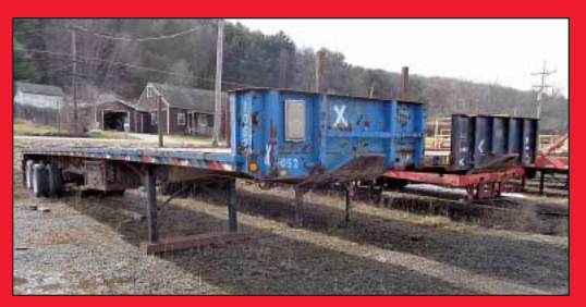
1998 Fontaine Model HFTW-5-10045FK Tandem Axle Flat