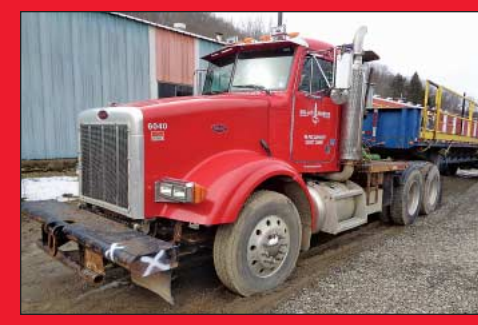
2004 Peterbilt Tandem Axle Tractor with Winch