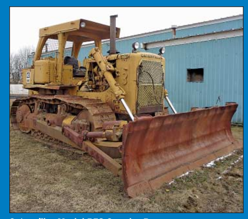
Caterpillar Model D7G Crawler Dozer