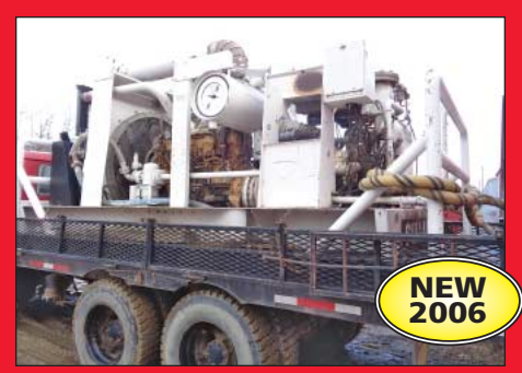
540 HP Sullair Model 900XHH-CAT Skid Mounted Air Compressor