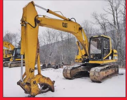
Caterpillar Model 315L Excavator