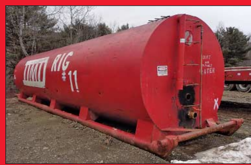
(2) 15,000 Gallon (Approx.) Skid Mounted Water Storage Vessels