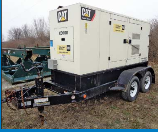
2010 Caterpillar 90/100 KW Model Cat XQ100-6 Generator