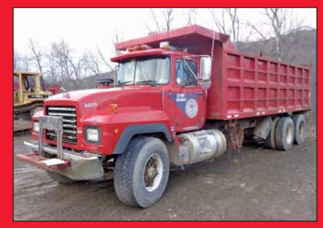
1993 Mack Model RD690S Tandem Axle Dump Truck