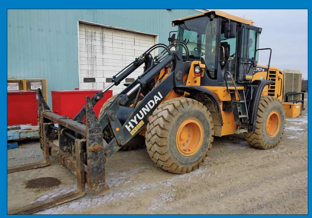
2012 Hyundai Model HL757TM-9 Rubber Tire 4-Wheel Drive Articulating Wheel Loader