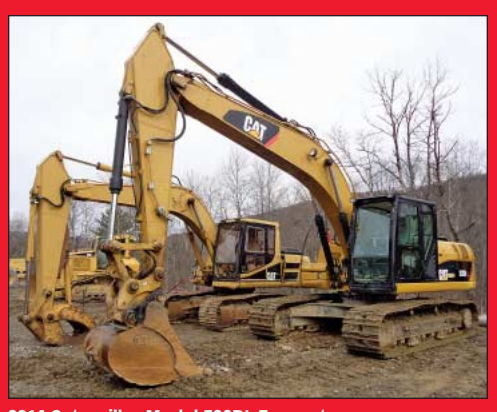
2014 Caterpillar Model 320DL Excavator