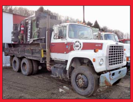
900 CFM Sullair Model 900XH Skid Mounted Air Compressor on 1985 Ford Straight Truck