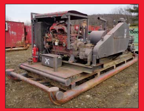
Gardner Denver Size 6-1/2 X10 Diesel Power Skid Mounted Mud Pump