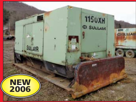
Sullair Model 150XH Skid Mounted Air Compressor