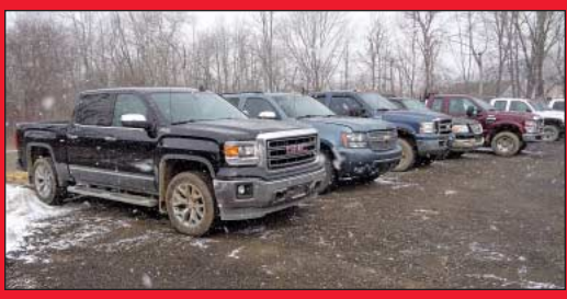
(13) Chevy, GMC, and Ford 3/4 Ton 4 X 4 Pick Up Trucks (New as 2015)