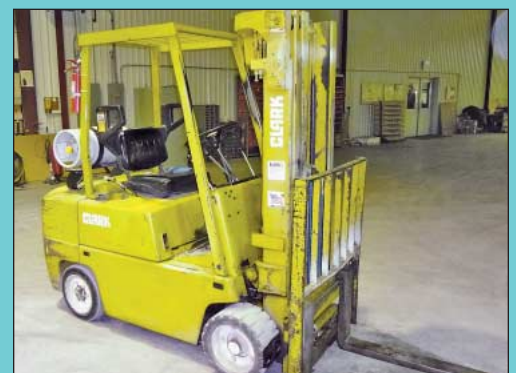
5,100 LB Clark Model C500-S60 Solid Tire LP Gas Lift Truck