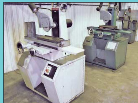
(3) Hand Feed Surface Grinders