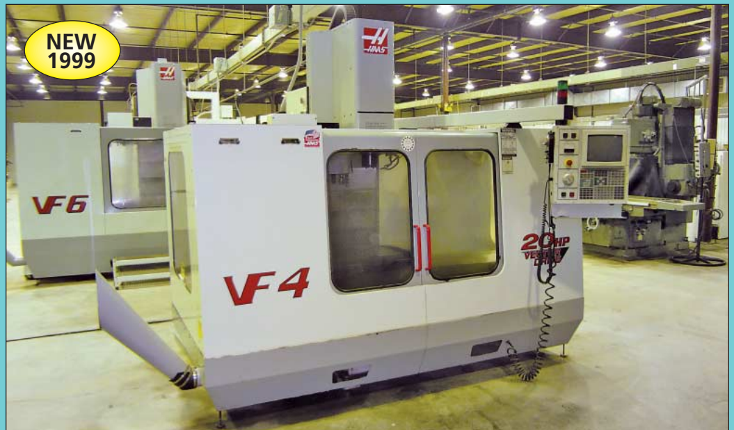
Haas Model VF-4 CNC Vertical Machining Center