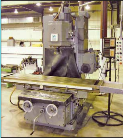
10 HP Dah Lih Model DL-V1600 Vertical Milling Machine