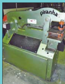
50 Ton Piranha Model P-50 Hydraulic Ironworker