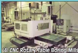
(4) CNC Rotary Table Boring Mills