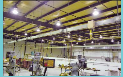
(3) 110' Runs General Electric Cat No. FVA-362 Busway