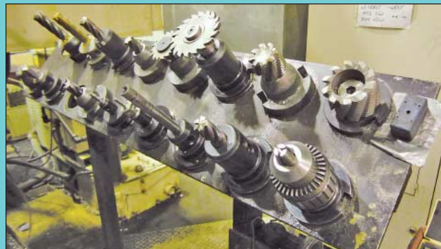
Approximately 100 No. 50 Toolholders