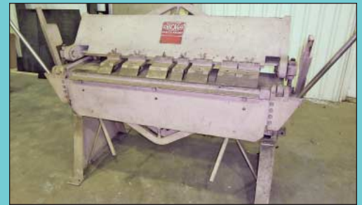
16 Ga. X 48" Chicago Dries & Krump Model BPO-414-6 Finger Brake

Office Equipment Consisting of; Modern Office Desks, Chairs, Drafting Tables, File Cabinets, Bookshelves, (2) Filex Blue Print Cabinets, Pigeon Hole Cabinets, Tables, Credenza's, (4) Schwab 500 Z Drawer Cabinet, Hon Fireproof Four-Drawer Cabinets, Conference Room Table & Chairs, Executive Office Set, Minolta Model EP2030 CS Pro Copier & Other Related Items