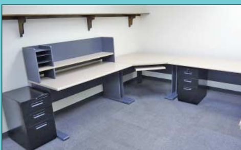
Modern Office Furniture

12% ONSITE BUYERS PREMIUM – 15% ONLINE BUYERS PREMIUM