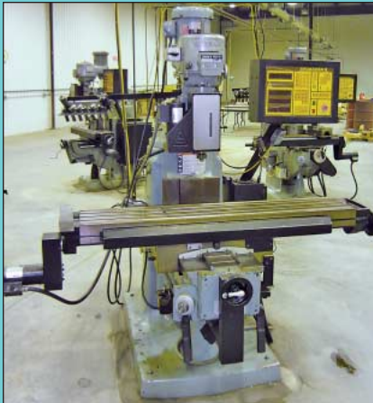
(2) CNC 2 HP Bridgeport Series II Vertical Milling Machines