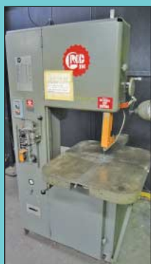
18" Grob Model 4V-18 Vertical Band Saw