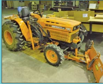
Kubota Model B8200 HST Four-Wheel Drive Tractor