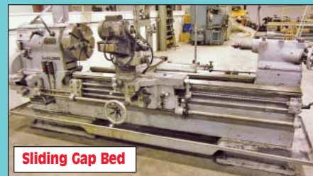
24"/48" X 60"/84" Leblond Sliding Gap Bed Engine Lathe

Machine Accessories and Tooling Consisting of; (100) No. 50 Toolholders, (50) No. 40 Toolholders, (10) Machine Vises by Kurt and Others, (4) Rotary Tables, Clamps, Taps, Dies, Reamers, Drills, Boring Bars, Indexable Tooling, Chuck Jaws, Grinding Wheels, Demagnetizers, Radius Dressers, Angle Plates, Tool Post Grinder, Stead Rest, 3 & 4-Jaw Chucks, Collets and Many Other Related Items