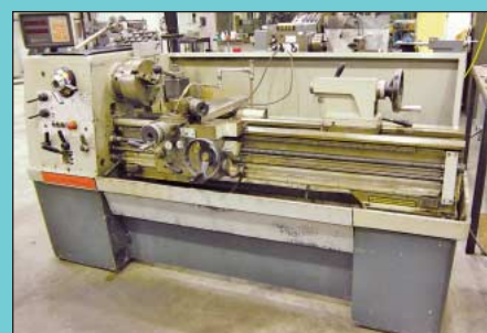
15" X 48" Clausing Colchester 15" Geared Head Engine Lathe