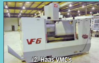
(2) Haas VMC's