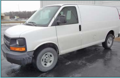
2010 Chevrolet 2500 Express Flexfuel Cargo Van