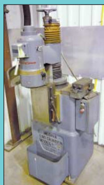
7" Medina Model B End Grinder