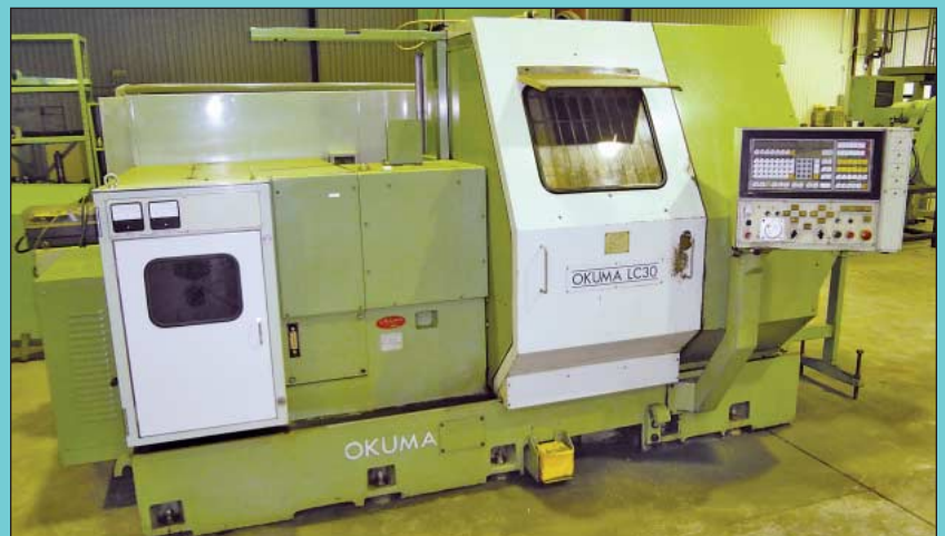
Okuma Model LC-30-2ST Slant Bed CNC Turning Center