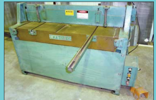
14 Ga. X 52" Wysong Model H-1452 Power Shear