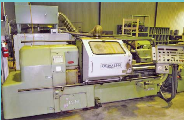
Okuma Model LS-N-BG10 Flat Bed CNC Turning Center