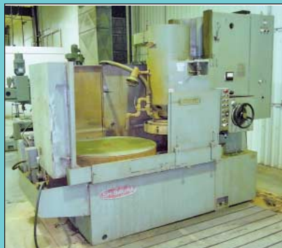
42" Shibura Model KRTC-11A Rotary Surface Grinder