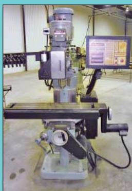
(2) 2 HP Bridgeport Series I CNC Vertical Milling Machines