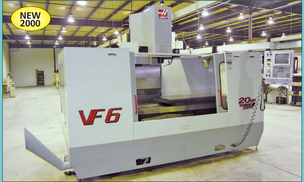
Haas Model VF-6 CNC Vertical Machining Center