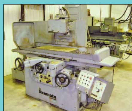
16" X 32" Okamoto Model 1632N Hydraulic Surface Grinder