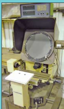
Mitutoyo Model PH-350H Optical Comparator