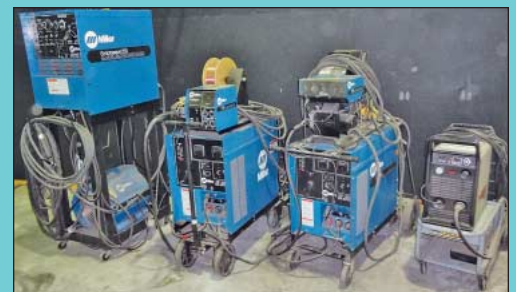
Late Model Welders and Plasma Cutter

12% ONSITE BUYERS PREMIUM – 15% ONLINE BUYERS PREMIUM