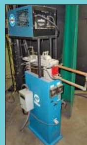
50 Ton Piranha Model P-50 Hydraulic Ironworker