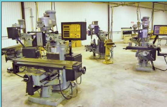
(6) 2 HP Bridgeport CNC and Manual Vertical Milling Machines