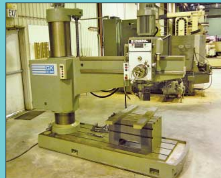
5' Arm X 13" Column South Bend Model GK-SD-1500 Radial Arm Drill