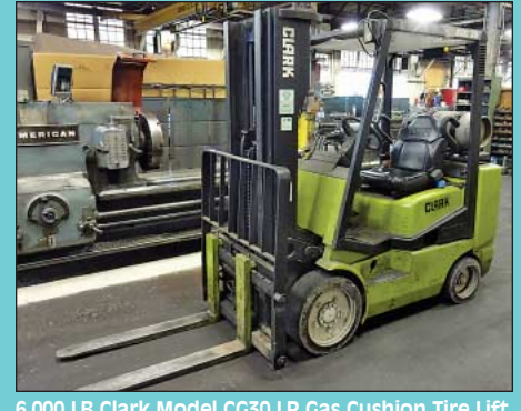
6,000 LB Clark Model CG30 LP Gas Cushion Tire Lift Truck