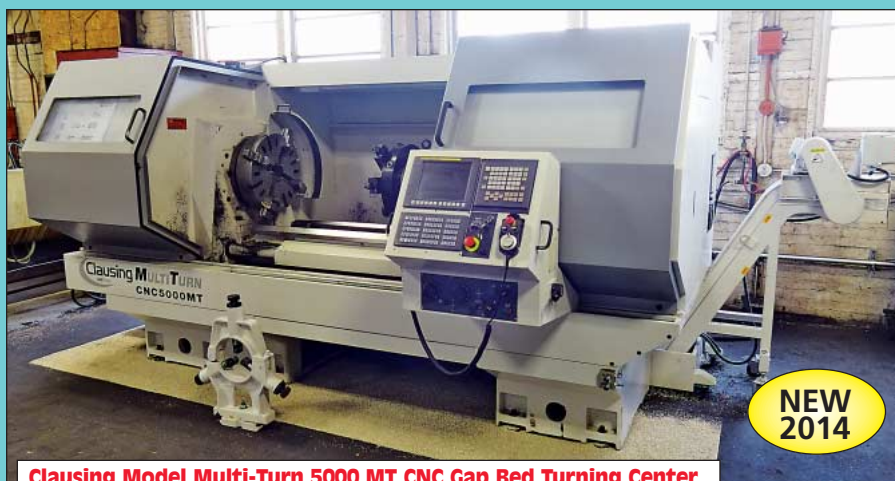
Clausing Model Multi-Turn 5000 MT CNC Gap Bed Turning Center

INSPECTION: MONDAY, JANUARY 25TH FROM 10:00 AM TO 4:00 PM