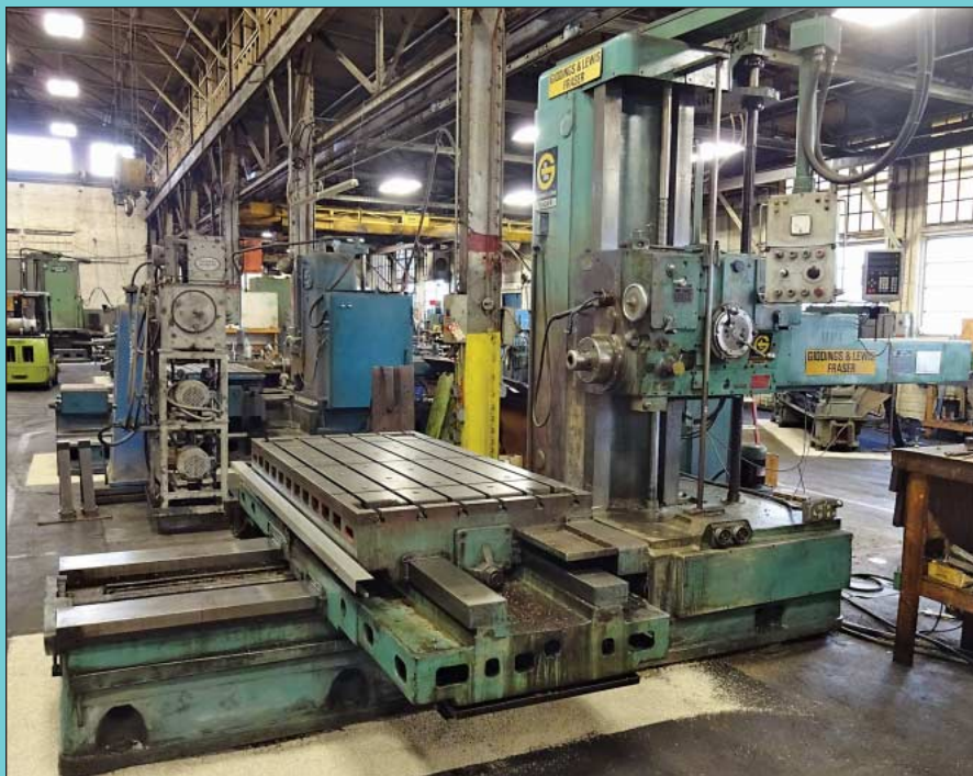
4" Giddings & Lewis - Fraser Type 70A-DP4-T Horizontal Boring Mill

(2) 7" X 48" Drilled & Tapped Angle Plate (2) 24" X 24" Drilled & Tapped Angle Plate 20" Rotary Table