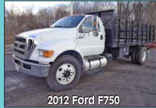
2012 Ford F750