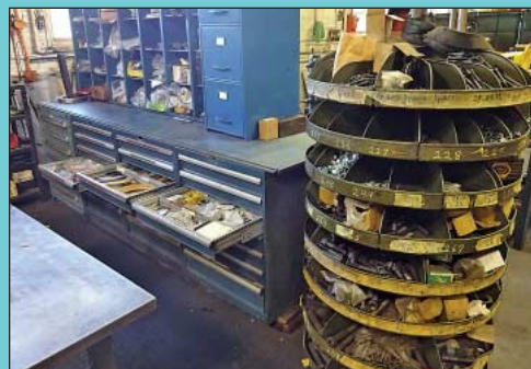
Large Quantity of Hydraulic Cylinder rebuild or manufacture parts

15% ONSITE BUYERS PREMIUM 18% ONLINE BUYERS PREMIUM