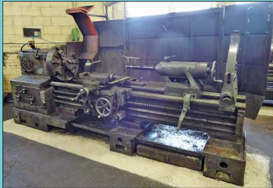
24"/32" X 84" Meuser H.D. Gap Bed Engine Lathe