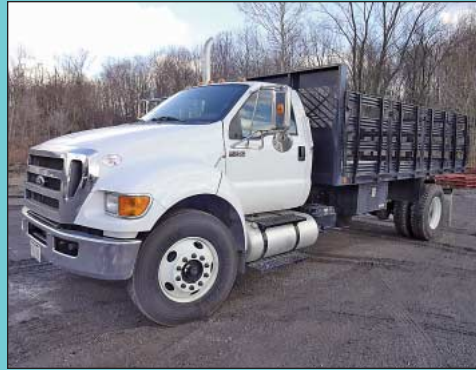
2012 Ford F750 XLT Super Duty Single Axle Straight Truck