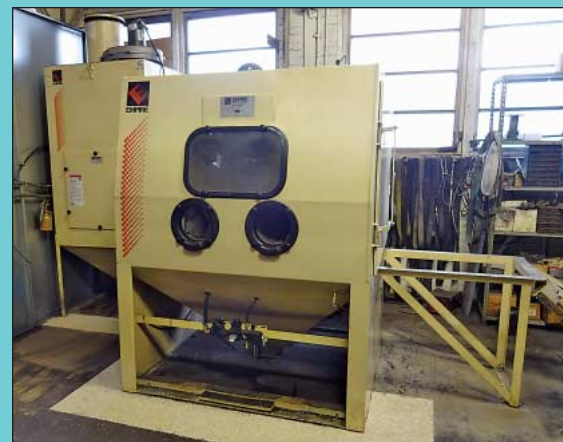
Empire Pro-Finish Model PF-6060 Abrasive Blast Cabinet