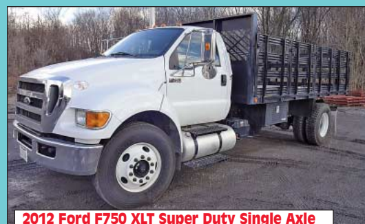
2012 Ford F750 XLT Super Duty Single Axle Straight Truck