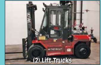
(2) Lift Trucks