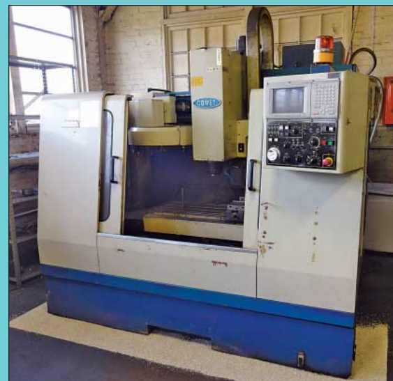
Comet "Mighty" Model VMC850 CNC Vertical Machining Center

15" X 40" Kent Model KLS-1540 Gap Bed Engine Lathe; S/N 940942, 12-Speeds from 32 to 1,800 RPM, 2" Spindle Hole, 10" 4-Jaw Chuck, Tailstock, 8" Swing Over Cross Slide SEE PHOTO