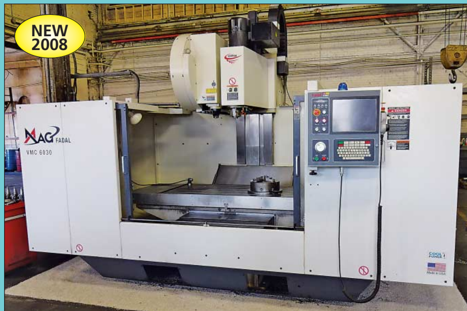
Fadal Model VMC6030HT CNC Vertical Machining Center