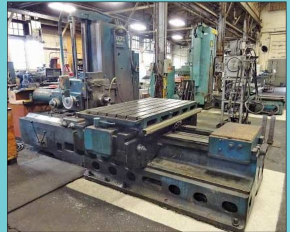
3" Lucas Model 41B-48 Horizontal Boring Mill