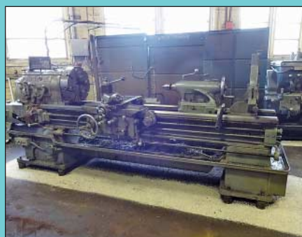
20.5" X 72" Monarch H.D. Engine Lathe