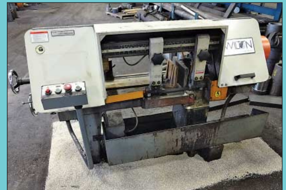
10" x 17" Wilton Model 7020 Horizontal Band Saw