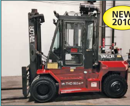
16,000 LB Taylor Model THD160 Pneumatic Tire Diesel Power Lift Truck