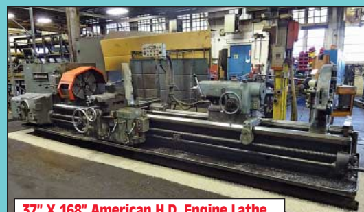
37" X 168" American H.D. Engine Lathe