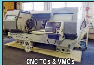
CNC TC's & VMC's

Contact Information 2020 Dunlap St. Cincinnati, Ohio 45214 Phone 513-241-9701 Fax 513-241-6760 www.cia-auction.com