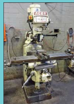
3 HP Acer Ultima Model 3VK Variable Speed Vertical Mill

6" Belt / 12" Disc Jet Combination Sander