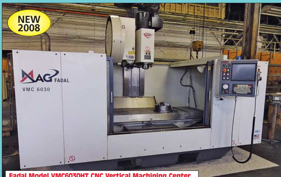
Fadal Model VMC6030HT CNC Vertical Machining Center