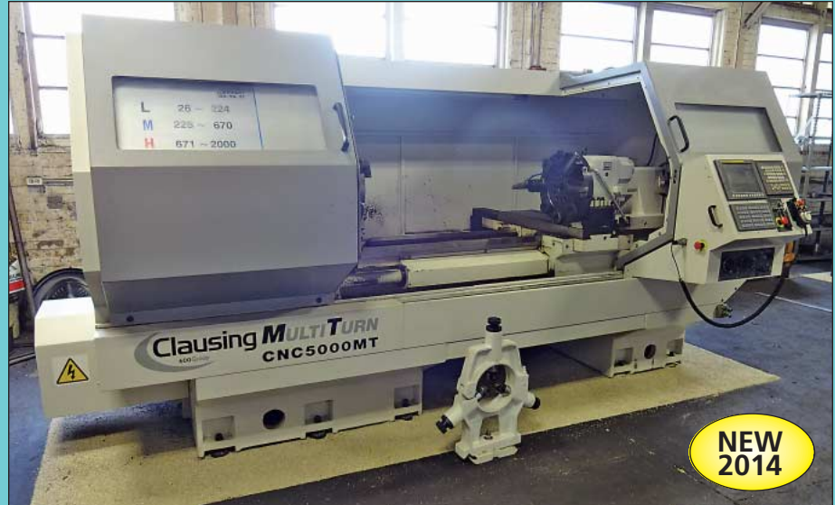
Clausing Model Multi-Turn 5000 MT CNC Gap Bed Turning Center