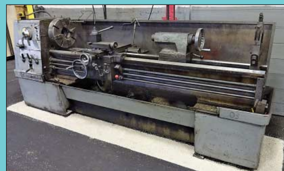
17" X 80" Clausing Colchester Geared Head Engine Lathe