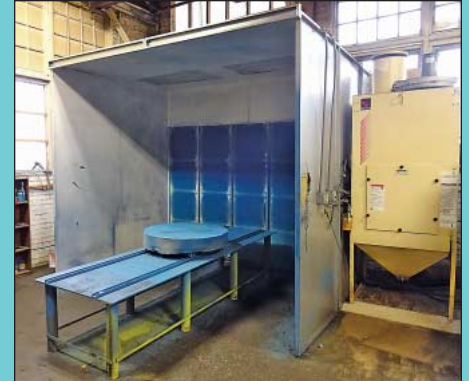
10' Wide x 7' Deep x 9' High Standard Model OFB-1000 Back Draft Paint Booth

Large Quantity Inspection Equipment Including: Large Micrometers, Starrett Machinist Levels, Micrometer Sets, Various Size Calipers