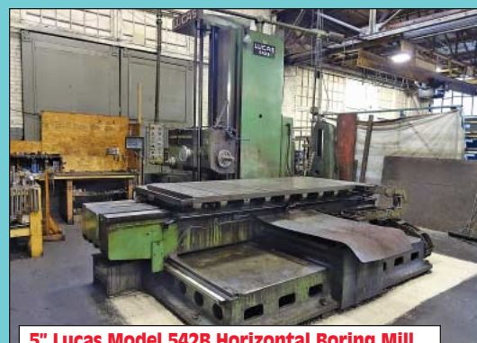
5" Lucas Model 542B Horizontal Boring Mill