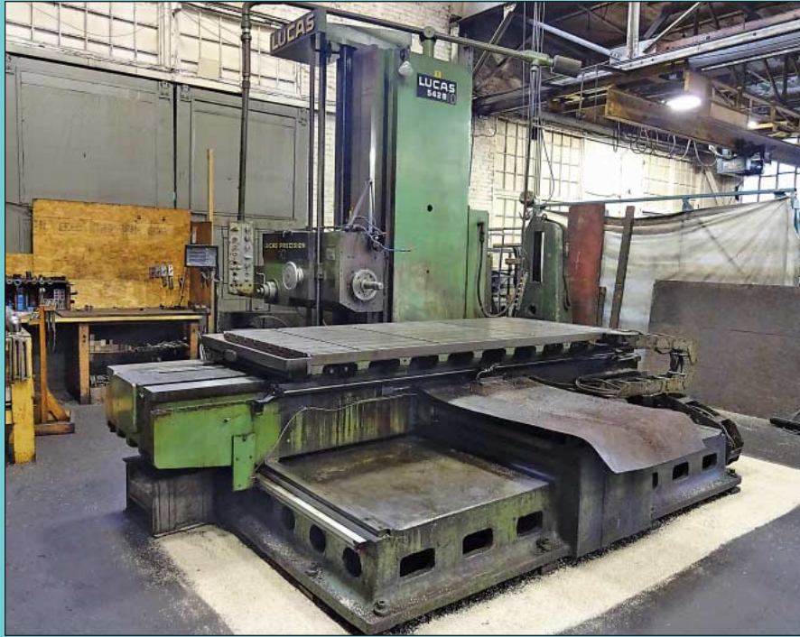
5" Lucas Model 542B Horizontal Boring Mill