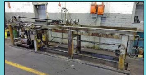
15' Long Horizontal Shop Built Cylinder Honing Machine