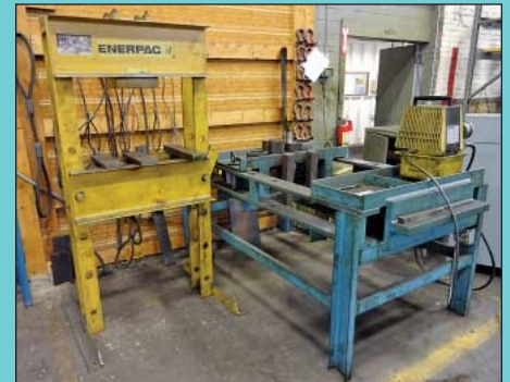
32" Wide Shop Built Horizontal / Hydraulic Straightening Press w/ Enerpac Model PEM2022 Electric Power Unit