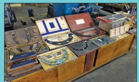
Large Quantity of Inspection Equipment Including: Large Micrometers, Starrett Machinist Levels, Calipers, & More