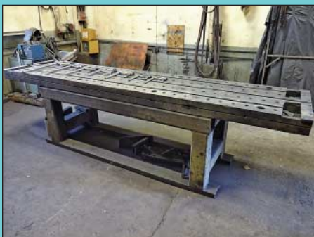
30" x 132" T-Slotted Machine Table Used as Welding Table