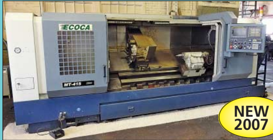
Ecoca Model MT-415/2000 CNC Turning Center