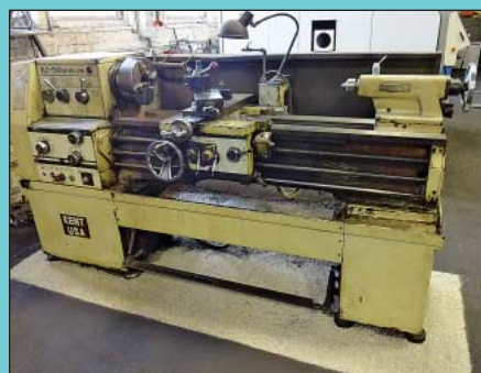
15" X 40" Kent Model KLS-1540 Gap Bed Engine Lathe