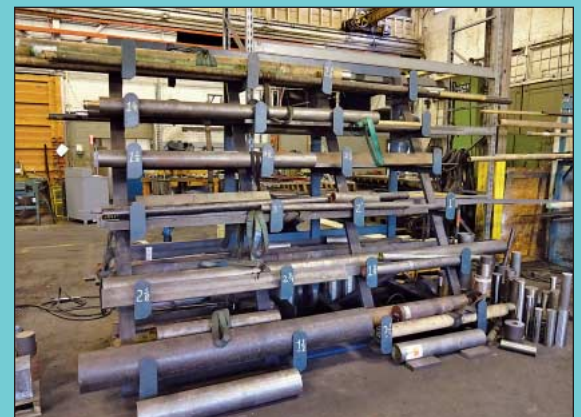
Large Quantity of Cylindrical Steel Inventory Various Diameters and Lengths, Some Chromed Cylinder Shafts