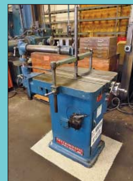
1.25" D.C. Morrison Keyseater