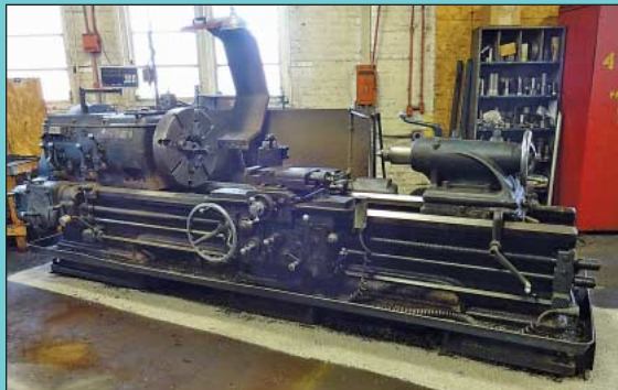
27.5" X 72" Monarch H.D. Engine Lathe