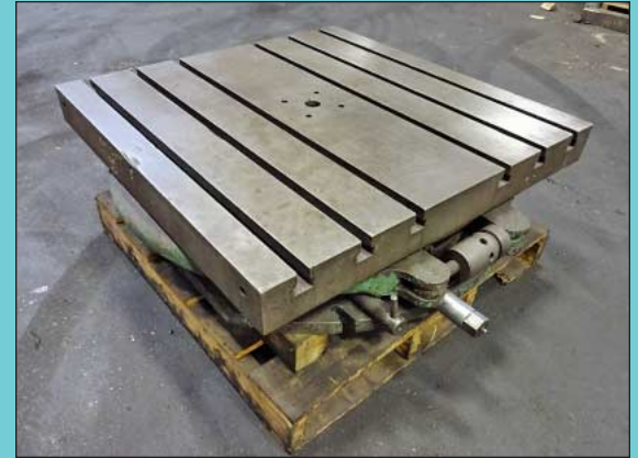
36" X 36" Rotary Table