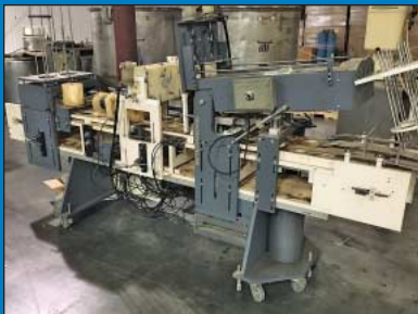
Acra Pak Model DCE-D Inline Two-Lane Piston Type Cup Filler