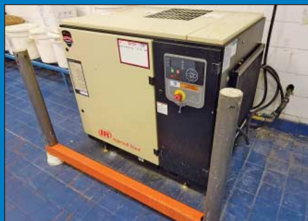
25 HP Ingersoll Rand Model UP6S-25S-125 Cabinet Type Air Compressor