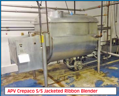
APV Crepaco S/S Jacketed Ribbon Blender

INSPECTION: WEDNESDAY, SEPTEMBER 6TH, FROM 10:00 AM TO 4:00 PM