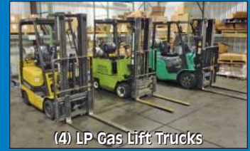
(4) LP Gas Lift Trucks