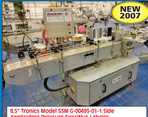
8.5" Tronics Model S3M C-00495-01-1 Side Application Pressure Sensitive Labeler