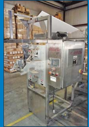
Phase Fire Systems Model SEA-1000 Sleeve Film Applicator