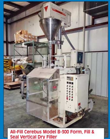
All-Fill Cerebus Model B-300 Form, Fill & Seal Vertical Dry Filler