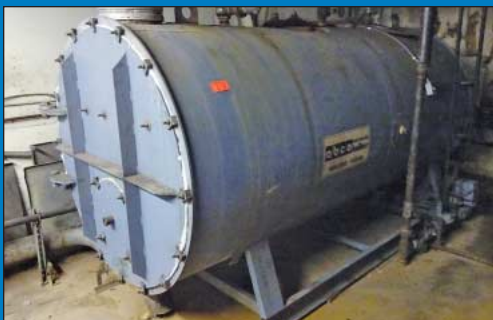
100 HP Abco Industries Inc. Model 100-RD Natural Gas Fired Steam Boiler