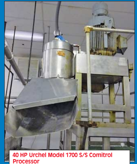
40 HP Urchel Model 1700 S/S Comitrol Processor