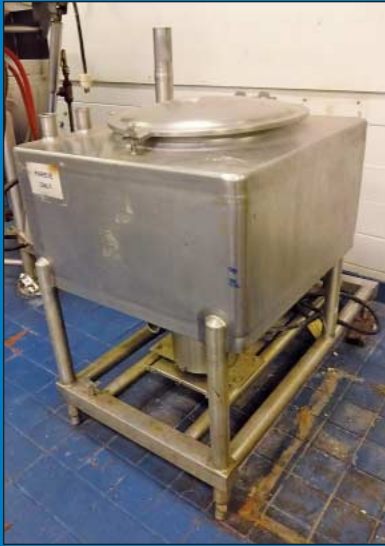
15 HP Cherry Burrell S/S Liquifier