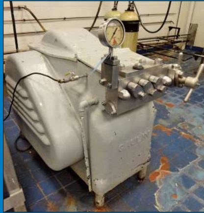
Gaulin Model 300CGD Three-Piston S/S Head Homogenizer