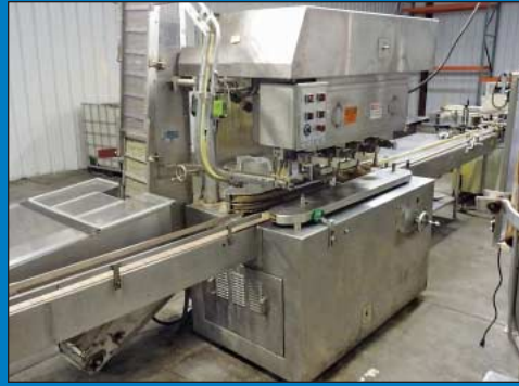
Karl Klemet Model U4 Four-Spindle Inline Screw Capper