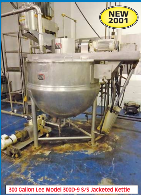
300 Gallon Lee Model 300D-9 S/S Jacketed Kettle