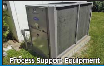
Process Support Equipment