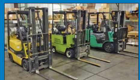
(4) LP Gas Lift Trucks Up To 5,000 LB by Mitsubishi and Caterpillar