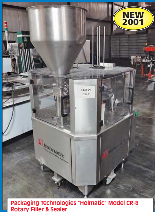
Packaging Technologies "Holmatic" Model CR-8 Rotary Filler & Sealer