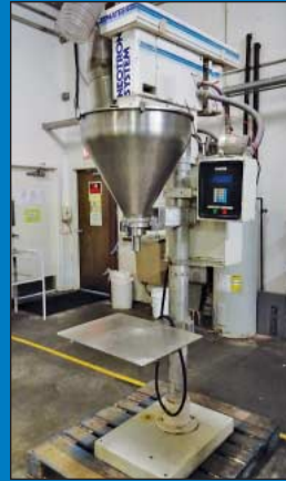
Mateer-Burt Model 1900 Vertical Dry Filler