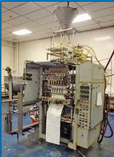
Prodo Pak Model 601-CSW-10 Form, Fill & Seal Six-Valve Pouch Filling Machine