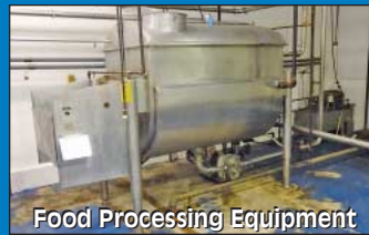
Food Processing Equipment

Contact Information 2020 Dunlap St. Cincinnati, Ohio 45214 Phone 513-241-9701 Fax 513-241-6760 www.cia-auction.com