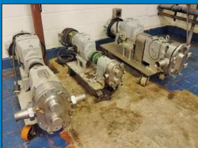
(6) Positive Displacement Pumps up to 3"