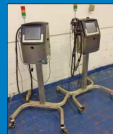
(2) Videojet Model 1550 Inkjet Printers