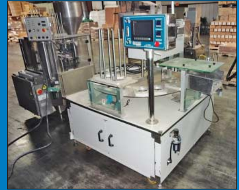
Preferred Packaging Model RT-602 Two-Up Automatic Rotary Heat Seal Machine