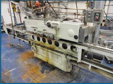
Anchor Hocking Series 2 Lug Style Steam Flow Capper