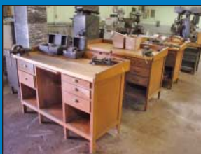
Tool Makers Benches, Machine Accessories and Tooling