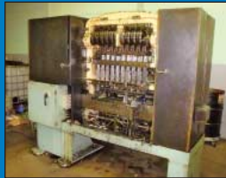
Waterbury Farrel Model 1210 ICOP Automatic Transfer Press