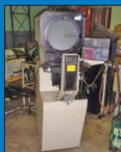
14" Micro Vu Model S14 Optical Comparator