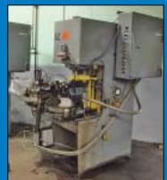
(2) 20-Ton Denison Model FH 20-20H Hydraulic Presses