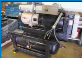
30 HP Mattei Model ERC 1022L/C110MU Rotary Screw Air Compressor