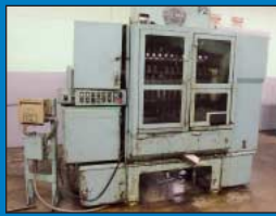
(2) Waterbury Farrel Model 1212 ICOP Automatic Transfer Press