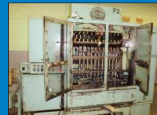
(2) Waterbury Farrel Model 1212 ICOP (Independent Cam Operated Plunger) Automatic Transfer Press