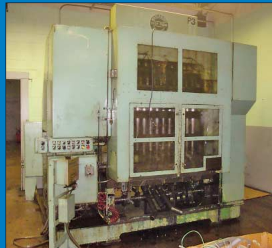
Waterbury Farrel Model 2012 ICOP (Independent Cam Operated Plunger) Automatic Transfer Press