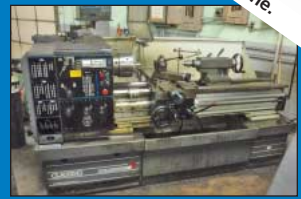
15" X 50" Clausing Colchester Model Triumph VS Geared Head Lathe