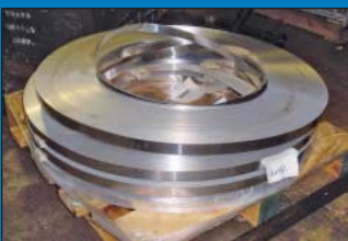
Partial View Steel Coils