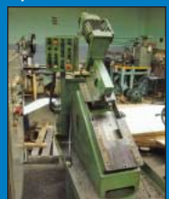
Snow Model NTBS107 Tapper