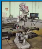
2HP Bridgeport Series I Variable Speed 2-Axis CNC Vertical Mill