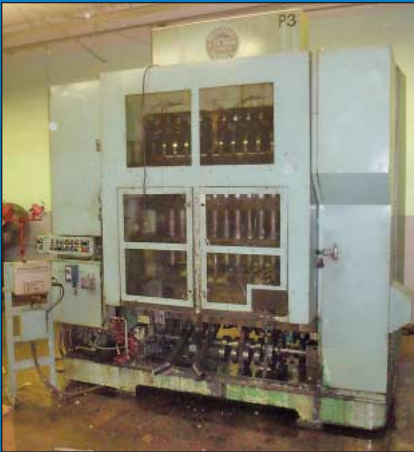
Waterbury Farrel Model 2012 ICOP (Independent Cam Operated Plunger) Automatic Transfer Press

Bidspotter.com Select Items To Be Offered Online.