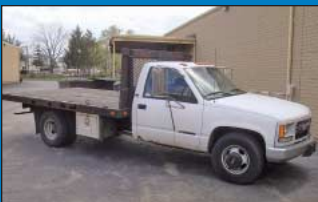
Caterpillar Type E 3-Wheel Electric Forklift Truck

All internet bidders must Post a Deposit of Approx. 25% of Your Planned Spending Budget or $5,000.00 Minimum with Cincinnati Industrial Auctioneers in Order to be approved to Bid. Those who do Not Post the Deposit Will Not be Approved. Period.