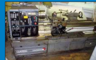
15" X 50" Clausing Colchester Model Triumph VS Geared Head Lathe