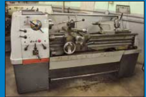
15" X 50" Clausing Colchester Geared Head Lathe