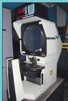
(1 of 3) 14" Deltronic Optical Comparators w/ DRO's