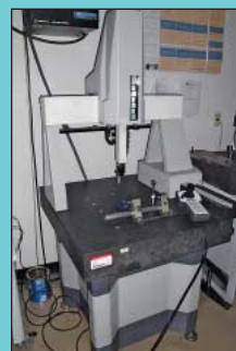
Numerex Model 1518-10 MD-CER Coordinate Measuring Machine