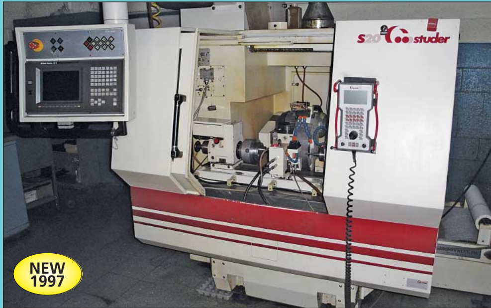
Studer Model S20 CNC O.D. Cylindrical Grinding Machine w/ I.D. Attachment