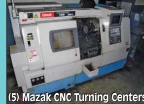
(5) Mazak CNC Turning Centers