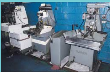
Bank View Sunnen Precision Hone Machine