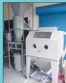
40" X 40" Abrasive Blast Cabinet w/ Dustkop Filter Bag Type Dust Collector