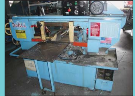
9" X 16" DoAll Model C916S Horizontal Band Saw

Shop Equipment Consisting of; Acetylene Outfit, (2) Hydraulic Pallet Tracks, 2-Wheel Drum Truck, Rubbermaid Shop Carts, 2-Door Steel Storage Cabinets, Electrometric De-Magnetizer, Work Benches, Steel Shelving, Single Spindle Drills, Double End Pedestal Grinders, Hand Tools, Dake Arbor Press, Hose Reels, Air Line Reels and Other Related Items