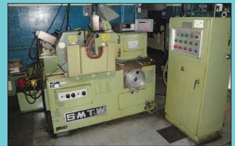
SMTW Model M1050 Centerless Grinder