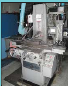
(4) 6" X 12" Parker Majestic No. 22 Surface Grinders