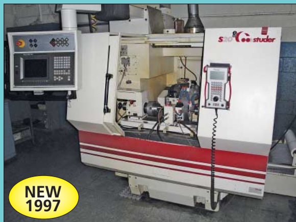
Studer Model S20 CNC O.D. Cylindrical Grinding Machine w/ I.D. Attachment