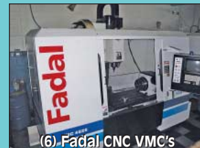
(6) Fadal CNC VMC's