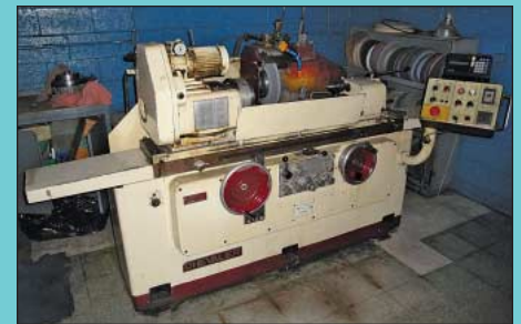
11" X 24" Falcon Chevalier Model GU1124A O.D. Cylindrical Grinder