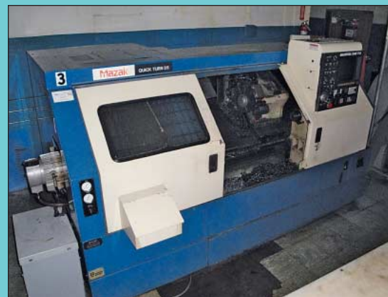
Mazak Model Quick Turn 25 CNC Turning Center