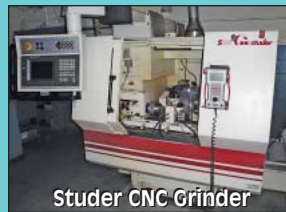
Studer CNC Grinder