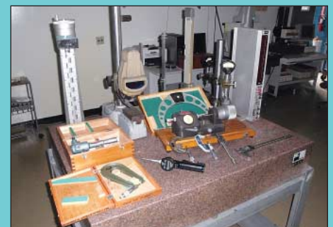
Partial View Large Quantity Inspection Tools and Equipment