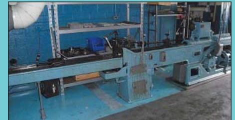
60" Stroke Lapointe Horizontal Broach