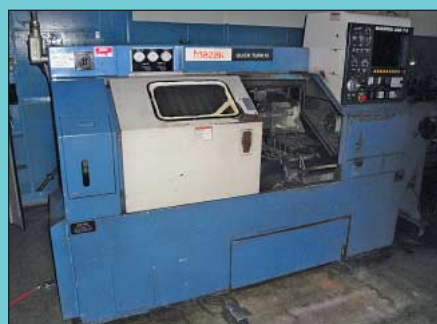
Mazak Model Quick Turn 15 CNC Turning Center

Consisting of; (6) 6" and 8" Mill Vises, 8" Hartford Super Spindle, Hold Down, Hardware, Parallels V-Blocks and Other Related Items