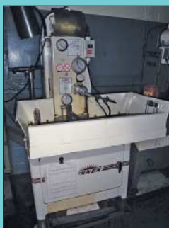
Sunnen Model MBB 1660-K Precision Hone