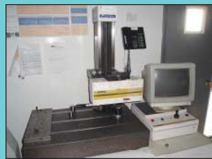
Taylor Hobson Model From Talysurf 120 Surfaces & Contour Measurement System

SELECT MAJOR ITEMS TO BE OFFERED ONLINE AT