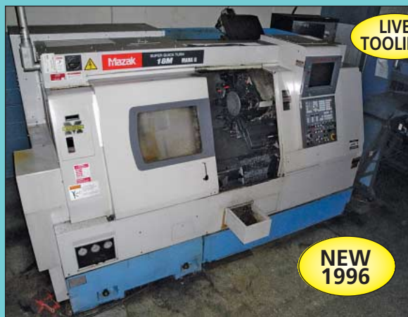
Mazak Model Super Quick Turn 18M Mark II Three-Axis CNC Turning Center