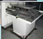
Fadal Model VMC-4020HT CNC Vertical Machining Center w/ Pallet Changer