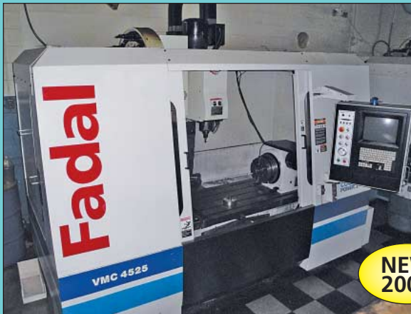
Fadal Model VMC-4525HT CNC Vertical Machining Center

Bidspotter.com™ Select Items To Be Offered Online See Instructions on Page 2 To Become a Qualified Bidder on the Internet