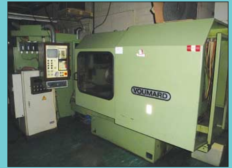
Voumard Model 200 CNC UB-T4-ID Four-Head CNC I.D. Grinding Machine