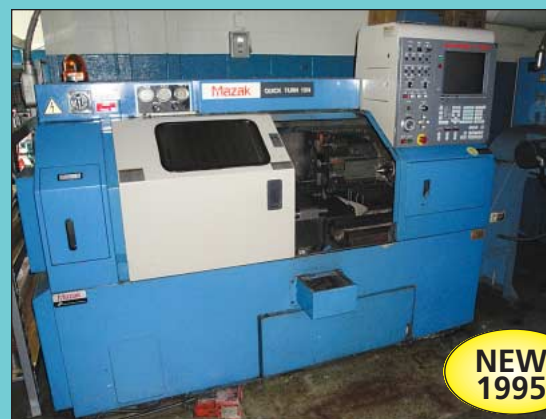
Mazak Model Quick Turn 15 CNC Turning Center