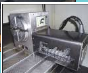
Fadal Model VMC-4020HT CNC Vertical Machining Center