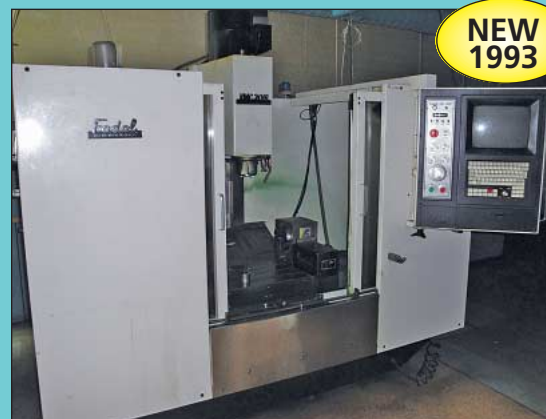
Fadal Model VMC-3016 CNC Vertical Machining Center