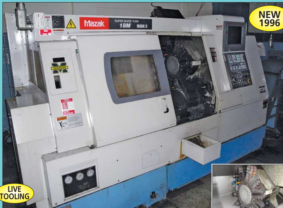
Mazak Model Super Quick Turn 18M Mark II Three-Axis CNC Turning Center