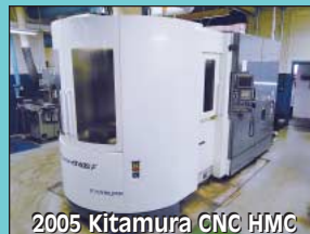
2005 Kitamura CNC HMC

2020 DUNLAP ST., CINCINNATI, OHIO 45214 PHONE (513) 241-9701 / FAX (513) 241-6760 INTERNET: cia-auction.com