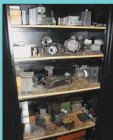
Huge Quantity (Approx. 100 Pcs.) of Grinding Accessories and Fixtures

Vibra King Model 200 5X Bench Type Vibratory Finishing Machine