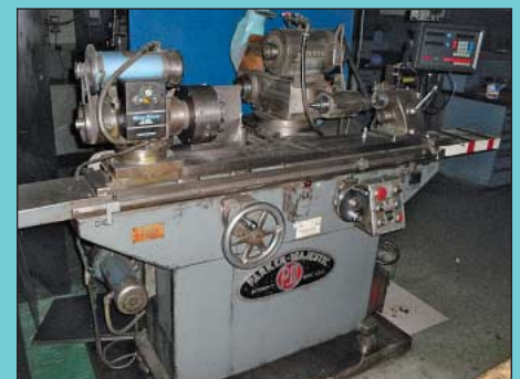
13" X 30" Parker Majestic Universal Cylindrical I.D. / O.D. Grinder