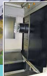
Kitamura Model MyCenter HX400iF Two-Pallet CNC Horizontal Machining Center