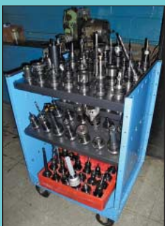
(400) Cat. 40 Tool Holders of All Types