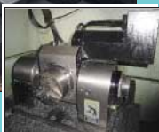
Fadal Model VMC-4525HT CNC Vertical Machining Center