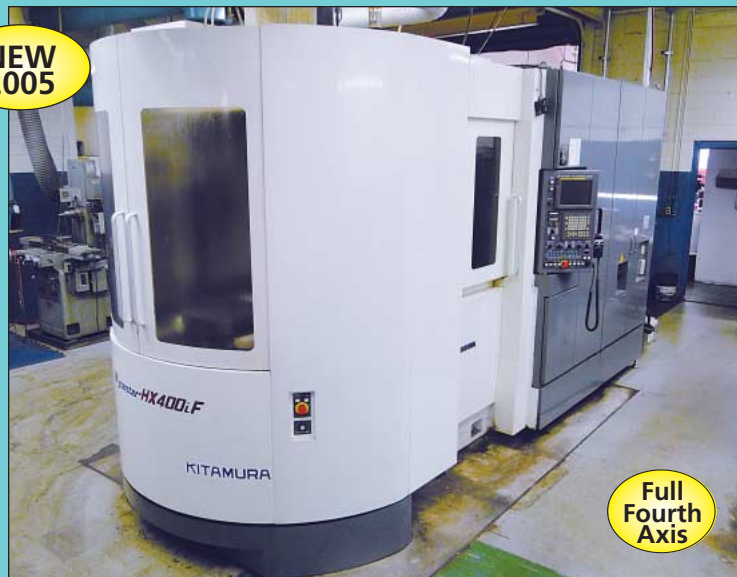
Kitamura Model MyCenter HX400iF Two-Pallet CNC Horizontal Machining Center