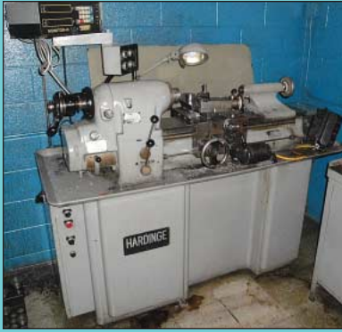
Hardinge Model HC Precision Lathe