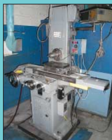
(2) 6" X 12" Parker Majestic No. 2 Surface Grinder