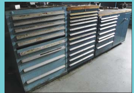
(30) Various Style Lista Cabinets Most Loaded w/ Tooling