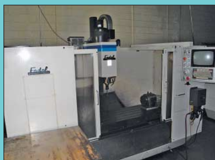
Fadal Model VMC-4020 CNC Vertical Machining Center