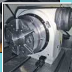
Fadal Model VMC-4525HT CNC Vertical Machining Center