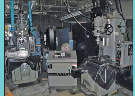
Bank View Moore No. 3 CNC and Manual Jig Grinders