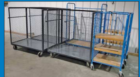
(35) Assorted Size Bindery Carts and Tables

Jay Squire (317) 782-0517 jay@jasgraphics.net