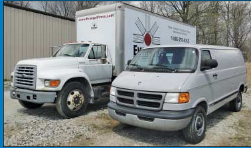
Bank View of Delivery Trucks