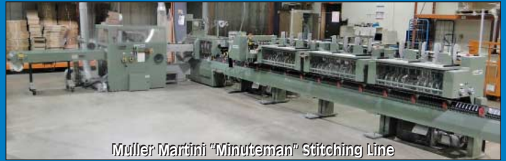
Muller Martini "Minuteman" Stitching Line