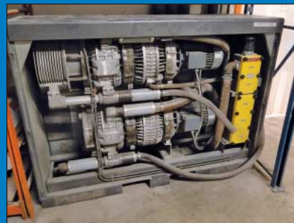
Vacuum Pump for Heidelberg 102-ZP Speedmaster