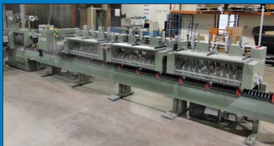
(3) Sets of 2 ea. 1533 Feeders, (1) Cover Feeder, (1) Hand-Feed for Muller Martini Minuteman