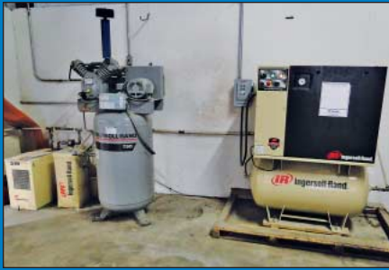
Bank View of Late Model Ingersoll Rand Air Compressors