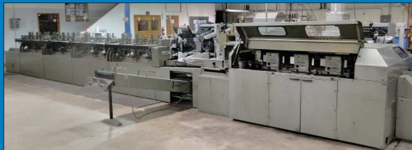
Muller "Panda" Perfect Binder & Collator

Nine Clamp Model 1530 Binder S/N 946418, (12) Model 1201-DR-D110 Pockets, (1) Hand Feeder, (1) Flat Cover Feeder & Dust Collector, Max Width: 10-5/8" - Min 4-1/2", Max Length 14-1/4" - Min 4-3/4", Max Spine 1-1/2" - Min 1/8", 2,000 - 3,000 BPH Speed SEE PHOTO