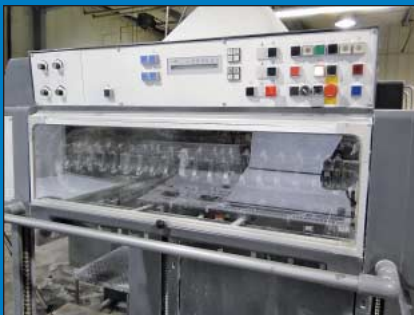
High Pile and High Develop System for Heidelberg 102-ZP Speedmaster