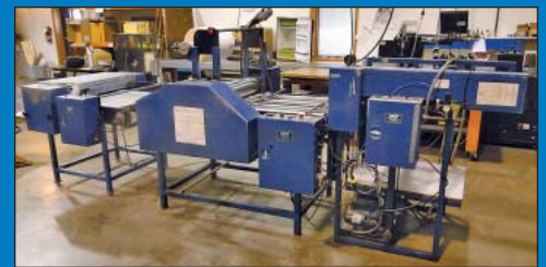
20" D&K Model Accu-Lam Junior Laminating Machine