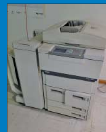
Partial View Late Model Copiers