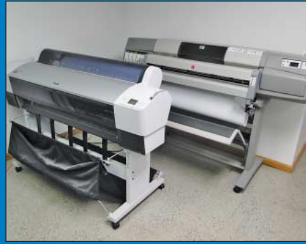
Partial View Late Model Epson and HP Plotters/Proofers