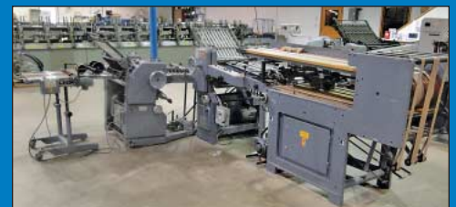
20" X 35" Stahl Model T52 Blueline Model T52/44R Folder