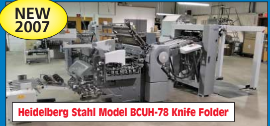
Heidelberg Stahl Model BCUH-78 Knife Folder