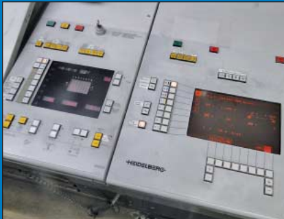
Close-Up of Heidelberg Model CPC-1-02 Console for Heidelberg 102-ZP Speedmaster