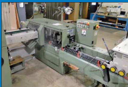
Muller Martini Model 1509 Stitcher w/ (3) HK75 Heads