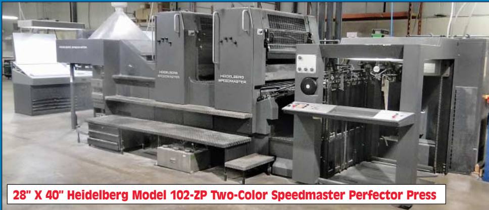
28" X 40" Heidelberg Model 102-ZP Two-Color Speedmaster Perfector Press

INSPECTION: WEDNESDAY, MAY 29TH, FROM 10:00 AM TO 4:00 PM