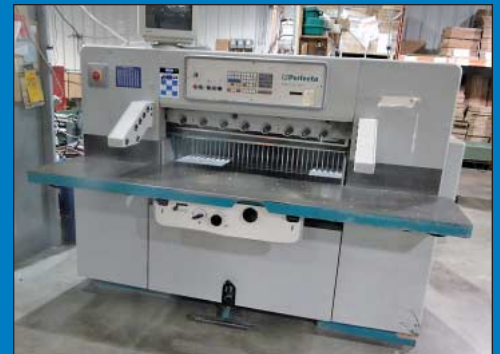
45" Perfecta Seyra Model 115 TV-2 Programmable Paper Cutter