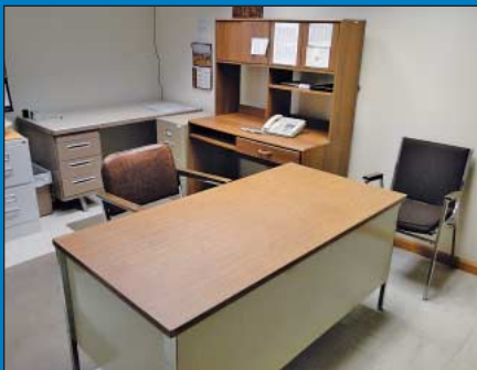
Partial View Office Furniture