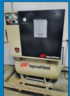
15 HP Ingersoll Rand Model UP6-150-125 Rotary Screw Horizontal Tank Air Compressor