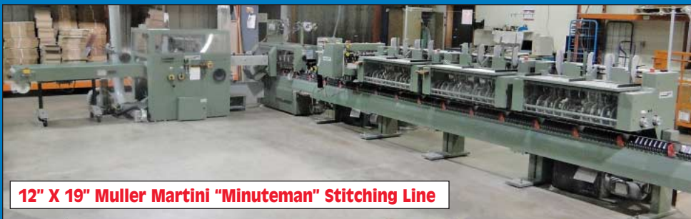
12" X 19" Muller Martini "Minuteman" Stitching Line