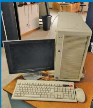
Rampage Product Code KHD2BASE300 Server/Computer Interface System with HP 6210 Printer