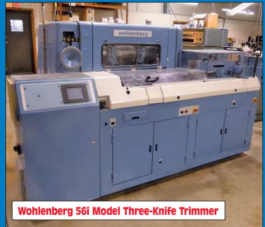
Wohlenberg 56i Model Three-Knife Trimmer