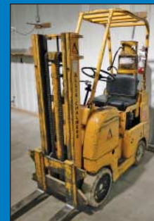
3,000 Lb. Allis Chalmers Model FT-BL-30 LP Gas Solid Tire Lift Truck