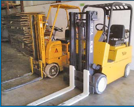
4,000 lb. Yale Model GLCO40BCNNAS072 LP Gas Cushion Tire Lift Truck