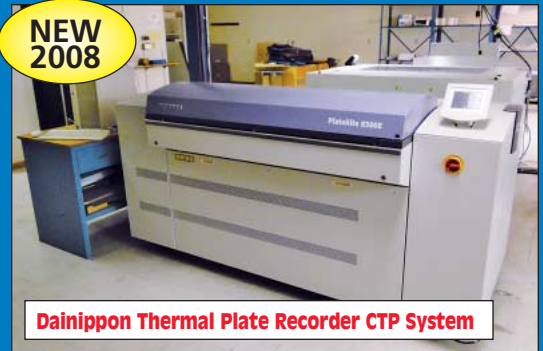
Dainippon Thermal Plate Recorder CTP System