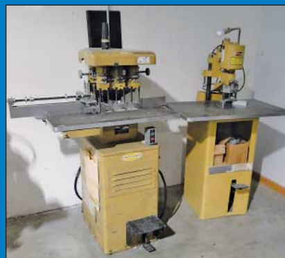
Challenge Three Spindle Paper Drill and Challenge Corner Rounder