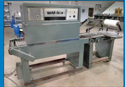
20" Wide Weldtron Model 7221A Heat Shrink Tunnel