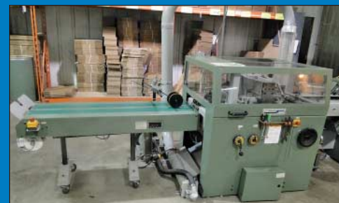
Muller Martini 1522 Three-Knife Trimmer