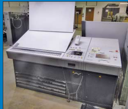
Heidelberg Model CPC-1-02 Console for Heidelberg 102-ZP Speedmaster