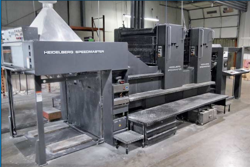
28" X 40" Heidelberg Model 102-ZP Two-Color Speedmaster Perfector Press