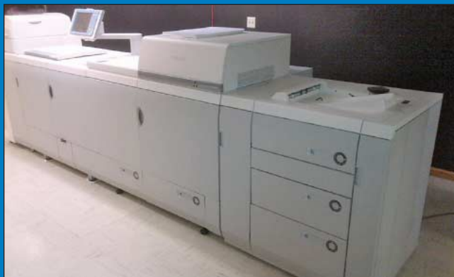
13" X 19" Cannon Model C7010VP Console Type Full Color Imaging Press