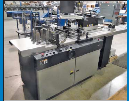
Cheshire Model 7000 High Speed Addressing System