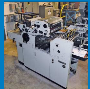
11-3/4" X 16-3/4" Hamada Model 660CD Two-Color Press