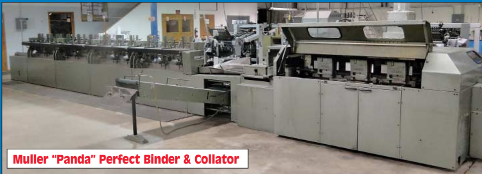
Muller "Panda" Perfect Binder & Collator