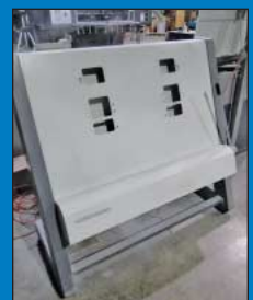
28" X 40" Heidelberg Plate Punch