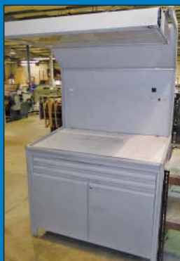
(2) GTI Model EVS-1/SC2F Executive Viewing / Proofing Stations