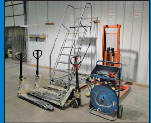
Partial View of Late Model Shop Equipment