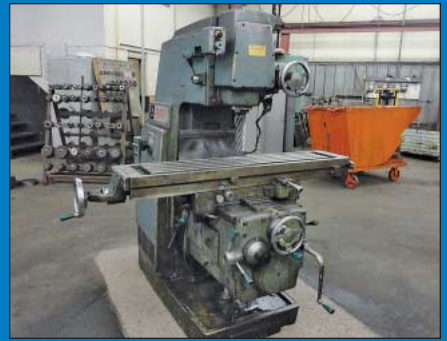
Kearney & Trecker Model S-12 Vertical Milling Machine