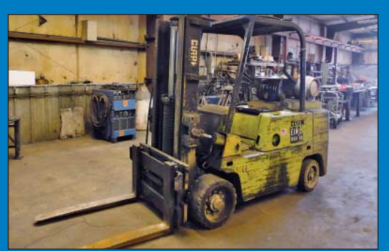
5,000 LB Clark LP Gas Solid Tire Lift Truck