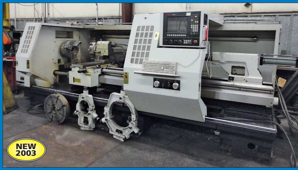
26" X 120" Willis Model 26120ENC Flat Bed CNC Lathe