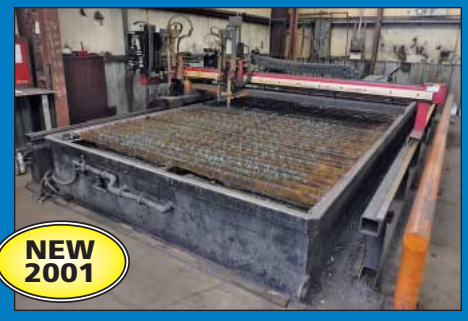
8' x 24' Koike Model PLP 2500 CNC Plasma Table