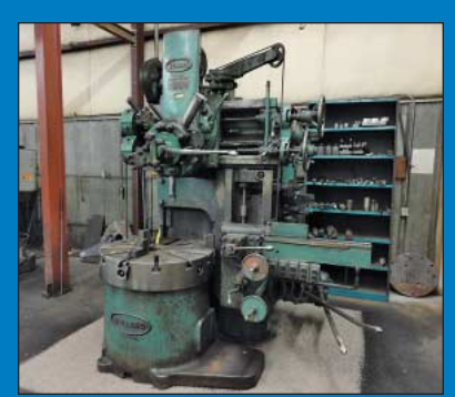
34" Bullard Vertical Turret Lathe