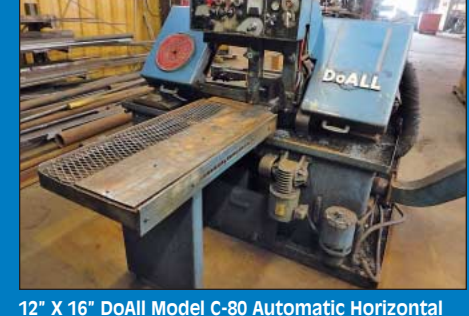
12" X 16" DoAll Model C-80 Automatic Horizontal