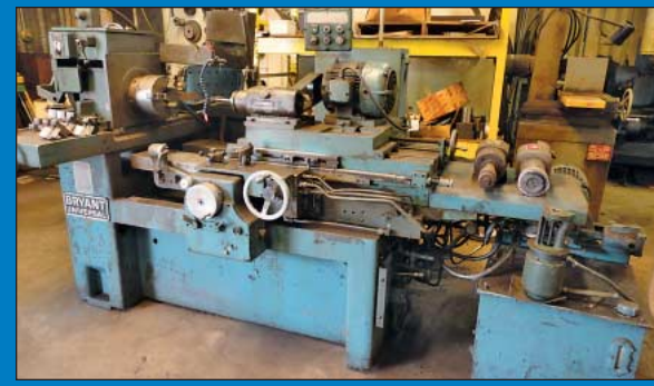
18" Swing Bryant Universal I.D. Grinder