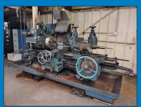
Warner & Swasey No. 2A Turret Lathe