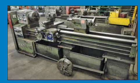
20"/28" X 74" Kingston Model HL2000 Gap Bed Geared Head Engine Lathe

Large Quantity of Shop Equipment Including ; Milwaukee Mag-Base Drill, Vidmar Cabinets, (6) Dump Hoppers, Racking, Presto Die Lift Cart, Banding Carts, Torch Carts, Warehouse Carts, Electric Cord Reels, Grinders