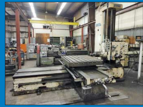
4" Wotan Type B100 Rotary Table Horizontal

6" X 18" DoAll Model C618M Hand Feed Surface Grinder; S/N 453-88244 10" X 15" Sanford Hand Feed Surface Grinder; S/N 1645004