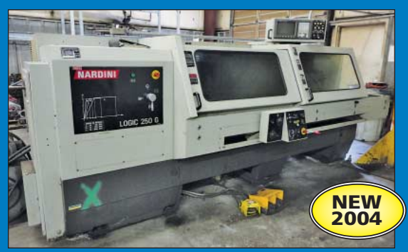
20" X 80" Nardini Model LOGIC 250 Flat Bed CNC Lathe