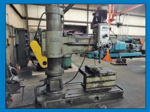
13" Col. X 5' Arm Ooya Model RE2-1450A Radial