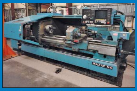
22" X 60" Mazak Model M4 Flat Bed CNC Lathe