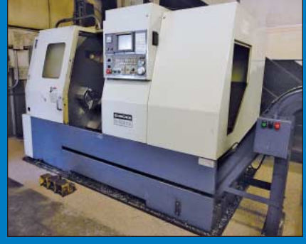
Hwacheon Model HI-ECO 31A Slant Bed CNC