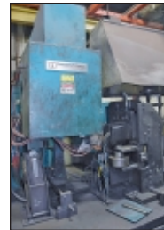
Thermatool Model VT-160 Induction Welding Station