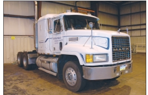
1995 Mack Model CH613 Twin Screw Road Tractor