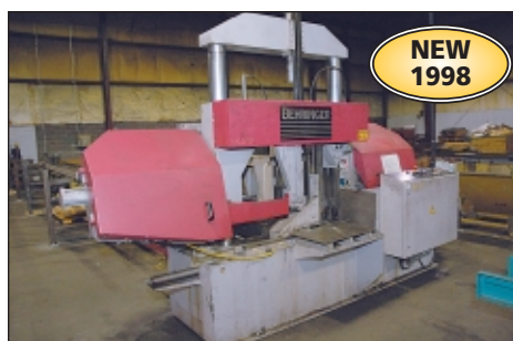
22" X 28" Behringer Model HPB-530A Programmable Column Type Horizontal Band Saw