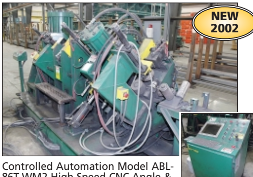
Controlled Automation Model ABL-86T-WM2 High Speed CNC Angle & Flat Bar Punching & Shearing Machine