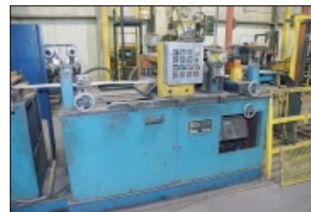
24" Iron Bay Model S54F Cropping Shear Butt Welding Station