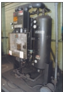
Air Tek Model TWB300 Air Dryer