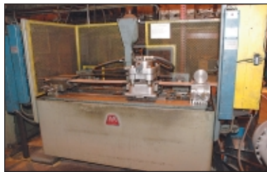
American Machinery Flying Hydraulic Cut-Off Press