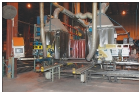
(2) 12' Rumble Automation Automatic Beam End Cap Welding Systems

30 Ton X 6' Chicago Model 46ASP Mechanical Press Brake; S/N L95, 72" Overall Length of Bed and Ram, 54" Between Uprights