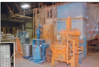
Powder Coat Systems Stainless Steel Pass Thru Powder Coat Paint Booth

Other Welding Related Equipment Consisting of; 500 Amp Hobart Arc Welder, Hypertherm Model Powermax 800 Portable Plasma Cutting System, Linde Model PCM-50 Portable Plasmarc Cutting System, Floor Mount Welding Boom w/ Accessories (removed for transport), Large Quantity Assorted Canvas Welding Curtains, (9) Assorted National Standard Fiber Welding Wire Feed Drums w/ Cone Lid