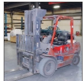
6,000 LB Kalmar Model P60BXP/5 LP Gas Solid Tire Forklift