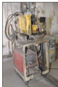
Iron Bay Model MN25 Coil Splicing Welder