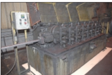
Tishken 2-1/2" Arbor 8-Stand Model 8HW-2-1/2 Roll Former

Line Tooled to Roll: C-Channel Upright Post Reinforcement Legs Approx. 1-1/2" X 2-3/4"