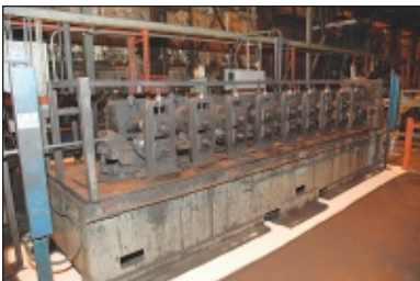
Yoder 2-1/2" Arbor X 9-Stand Model M2-1/2 Roll Former

Line Tooled to Roll: C-Channel Upright Braces Approx. 1-1/2" X 1" w/ Fold Over