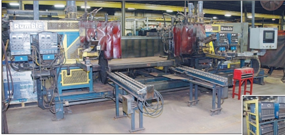
12' Rumble Automation Semi-Automatic Programmable Adjustable Width Pallet Rack Beam End Cap Welding Station