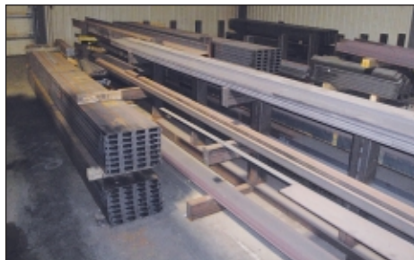
Approx. 275 Ton ($279,000 cost) Structural Inventory