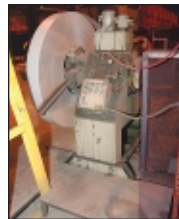
Cooper Weymouth Uncoiler and Straightener