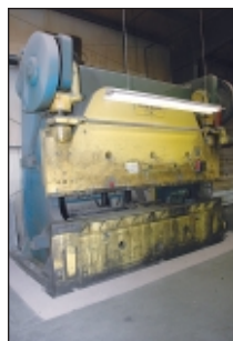
335 / 500 Ton X 12' Cincinnati Series 19 X 10 Mechanical Press Brake