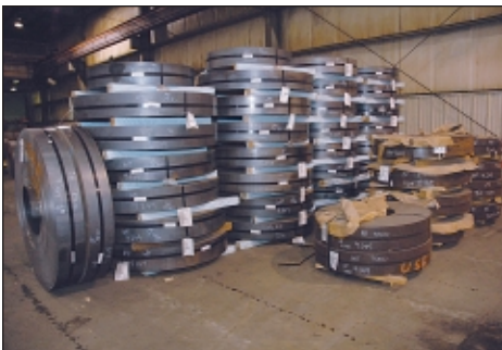
Approx. 2,000 Tons ($1,450,000 Cost) Steel Coil Inventory in Widths from 2" to 17"

Approx. 560 Ton ($600,000) In-Process Inventory for All Rack Components; Mostly in Upright Frames & Beams, Various Other Accessories, Clips, Columns, Tubes & Related SEE PHOTO