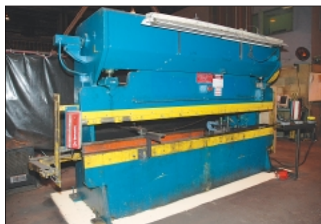
90 Ton X 12' Dries & Krump Chicago Model 1012L Mechanical Press Brake