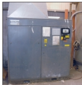
75 HP Atlas Copco Model GA75 Rotary Air Compressor

Business Machines & Office Furniture Including; ADP Full Hand Punch Digital Time Recorder; w/ Master Programmer & Power Supply, Savin 4027 Copier/Fax Machine, Sharp AR-M277 Digital Imager, HP Designjet 430 Plotter, HP Designjet 750C Plus Plotter, HP Laserjet 9000 DN Printer, HP Color Laserjet 2600N Printer, Cubicles, Work Stations, Desks, Chairs, File Cabinets, Conference Tables & Chairs, Computers, Servers, Computer Networking Equipment