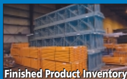
Finished Product Inventory