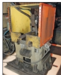
Prisma Model 50 CP-21 Cut-off Press