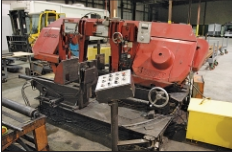
24" X 36" Amada Model H-900HD Mitre Head Horizontal Metal Cutting Band Saw