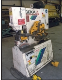
4-1/2" x 4-1/2" X 3/8" Geka Model Hydracrop 55/A Hydraulic Ironworker