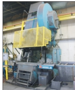
150 Ton Clearing Model LM-150 OBI Flying Cut-off Press