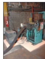
10" Wide Guild International Auto Shear & End Coil Splicing Welder