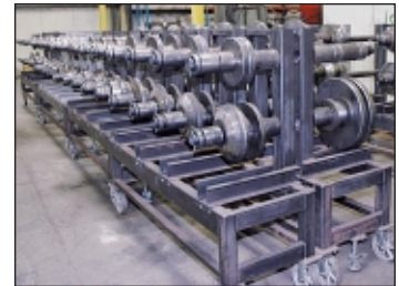
Partial View Change Over Tooling

Line Tooled to Roll: Pallet Support Decking Arms, Horizontal & Diagonal Upright Lacing (Bracing) Arms, 1" X 1" & 1" X 2" Non Welded Tube, 3-1/4" X 10" & 3-1/4" X 12" C-Channel for Cantilever Upright Posts & Legs