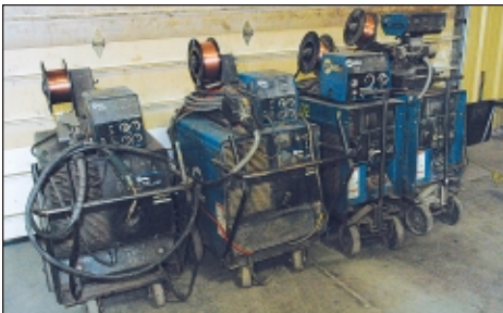
(15) Late Model Miller Mig Welders