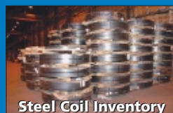
Steel Coil Inventory