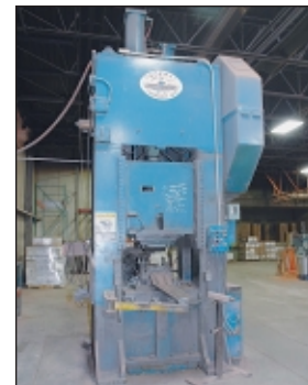
200 Ton Federal Model S1-200-36-42 Straight Side Single Crank Press