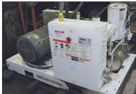
50 HP Gardner Denver Model EDE99M Skid Mounted Rotary Screw Air Compressor