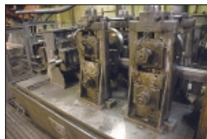
Rafter 2-Sided Sizing Station