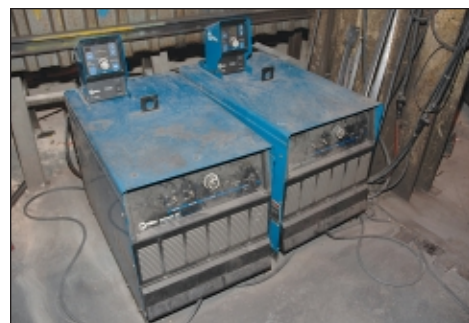
(40) Late Model Miller Mig Welders