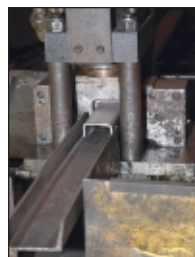
Close-Up View Post Reinforcement Leg