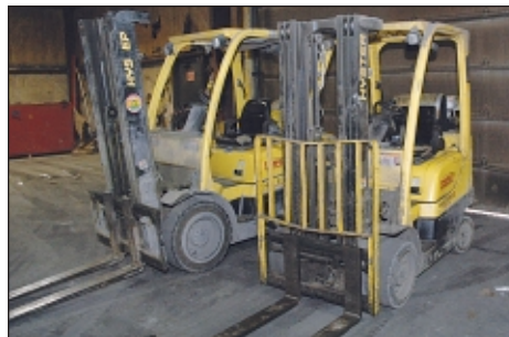
(3) 5,000 Lb Hyster Model S50FT LP Gas Solid Tire Lift Truck