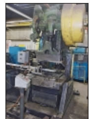
60 Ton Federal No. 55 OBI Flying Cut-off Press