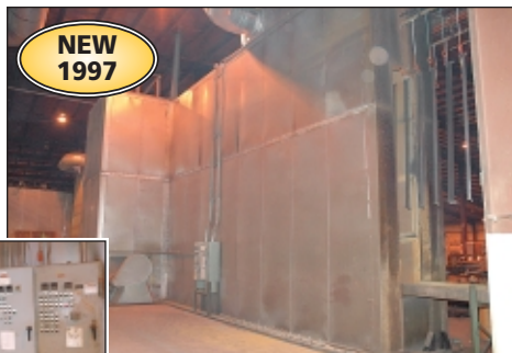
120' Long Tellkamp Natural Gas Fired Dry-Off Oven