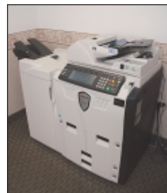
Late Model Office Equipment