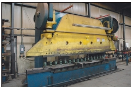
400 / 600 Ton X 19' Cincinnati Series 21 Mechanical Press Brake