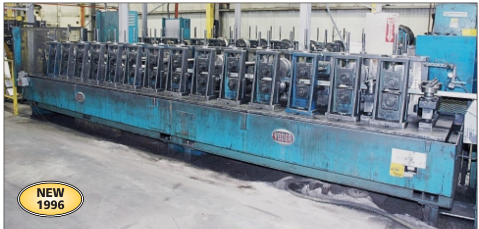
Yoder 2-1/2" Arbor X 14-Stand Model MS 2-1/2S Roll Former

Line Tooled to Roll: Pallet Support Decking Arms, Horizontal & Diagonal Upright Lacing (Bracing) Arms, 1" X 1" & 1" X 2" Non Welded Tube, 3-1/4" X 10" & 3-1/4" X 12" C-Channel for Cantilever Upright Posts & Legs