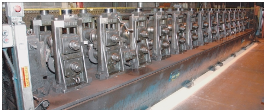
Rafter 3" Arbor X 14-Stand Model RT-3000-14 Roll Former

Line Tooled to Roll: 3" X 3", 2-1/2" X 3", 3" X 1-5/8", 4" X 2-1/2" Upright Posts, .075 - .090 and .120 Wall Thickness