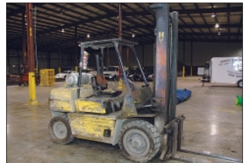
8,000 Lb Hyster Model H80XL LP Gas Pneumatic Tire Lift Truck