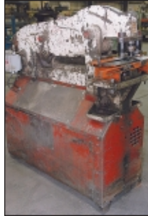
5" X 5" X 3/8" Piranha Model P3 Hydraulic Ironworker