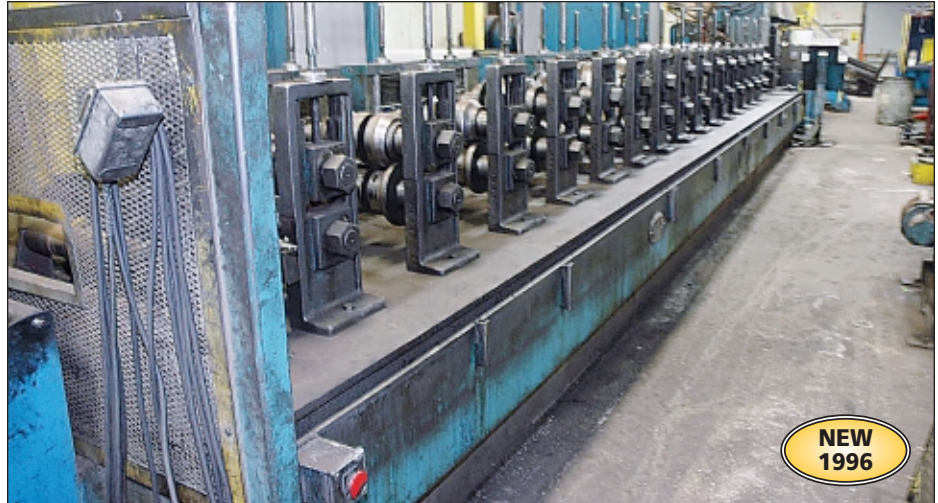
Yoder 3" Arbor X 15-Stand Model MS3 Roll Former

Line Tooled to Roll: 3" X 3" & 3" X 1-5/8" Open Back and Welded Closed Back Posts at Speeds of Approx. 55 SPM, 2-1/2" – 6" Face Welded Step Beam at Speeds of Up to 100 FPM