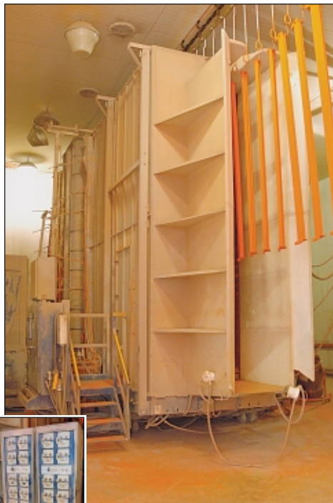
Nordson 34-Gun Poly Upper Pass Thru Automatic Powder Coat Booth