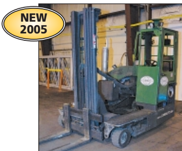
6,000 LB Combilift Model L30060LA45 LP Gas Side Loader