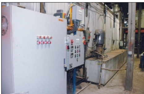
Mfg. Unk. Gas Fired Stainless Steel Construction 2-Stage Pass Thru Parts Washer