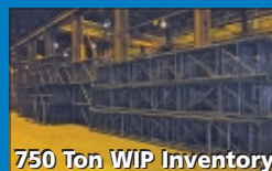
750 Ton WIP Inventory