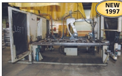
Genesis Versa-System Single Robot Dual Positioner Robotic Welding Cell