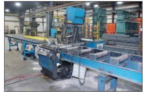
18" Marvel Armstrong-Blum Series 81/11 Model 81/11 Mitring Vertical Band Saw