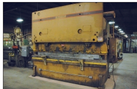
325 Ton X 12' Standard Industrial Model AB325-12 Hydraulic Press Brake