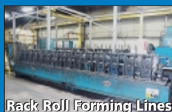
Rack Roll Forming Lines