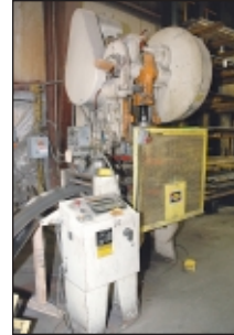
60 Ton Niagara Model M-60 Open Back Inclinable Press