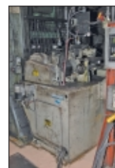
12" Wide Cooper Weymouth Model SMX HDSE4 Servo Feed