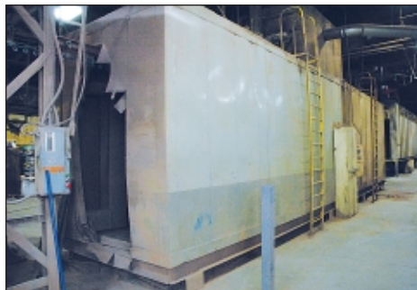
120' Long Infra Red Technologies Co. Natural Gas Fired Infra Red Pass Thru Bake Oven