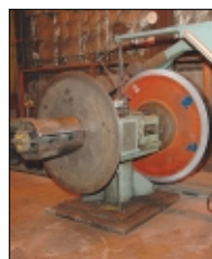
10,000 Lb Samco Model 54-10000-DE Uncoiler