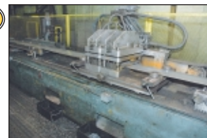
American Machine Two-Station Flying Hydraulic Punching Machine