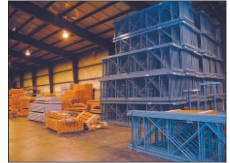
Approx. $2,000,000 Finished Product Inventory Including 14,000 Uprights and 49,000 Beams