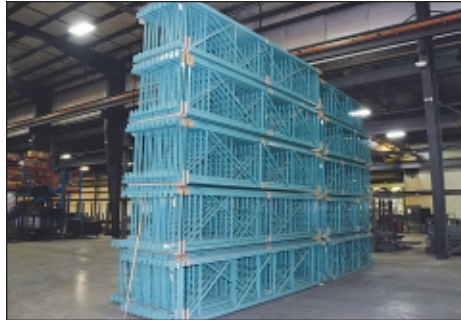
Approx. $500,000 Finished Product Inventory Including 17,400 Beams and 2,500 Uprights