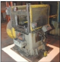
Prisma Model 50 CP-21 Cut-off Press