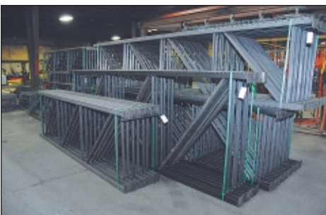
Large Work-In-Process Inventory