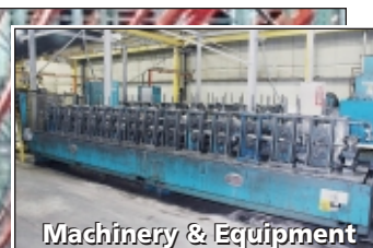
Machinery & Equipment