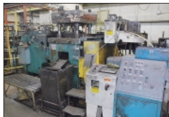
60 Ton Henry & Wright 4-Post Notching Press