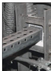
Close-Up View Upright Post Profile