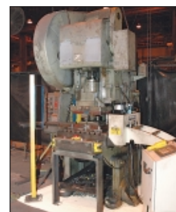
(6) OBI Presses to 125 Ton