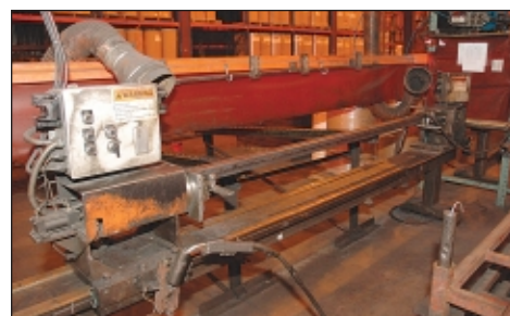
(20) Welding Stations For Beam and Upright Welding To 45' Wide