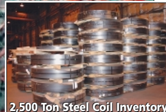
2,500 Ton Steel Coil Inventory