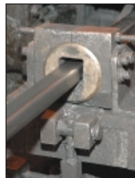
Close-Up View Upright Braces