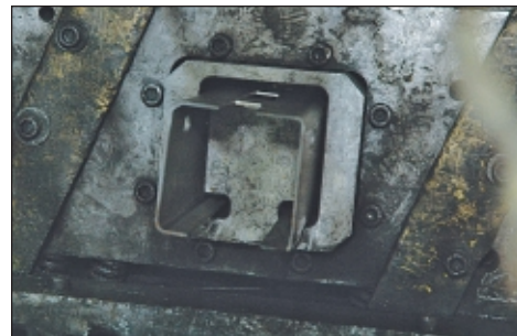
Close-Up View Upright Profile