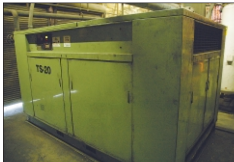
125 HP Sullair Model TS-20-125L AC Rotary Screw Cabinet Type Air Compressor