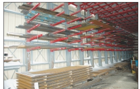
(32) Sections 52" W X 18" H X 42" Arm Adjustable Arm Cantilever Rack