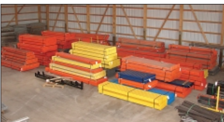
Huge Finished Product Inventory Including Approx. (500) Uprights, (2000) Beams and (1000) Wire Decking Shelves