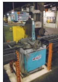
KMT Model SIRO SH-E Programmable Mitre Base Cold Saw