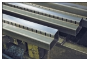
Close-Up View of Beam Profile