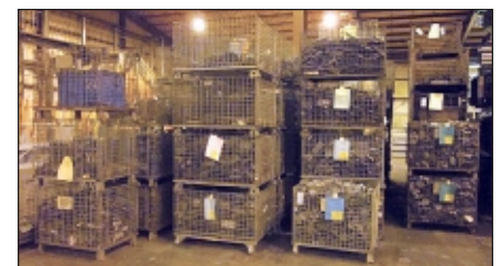
Approx. 150,000 End Caps