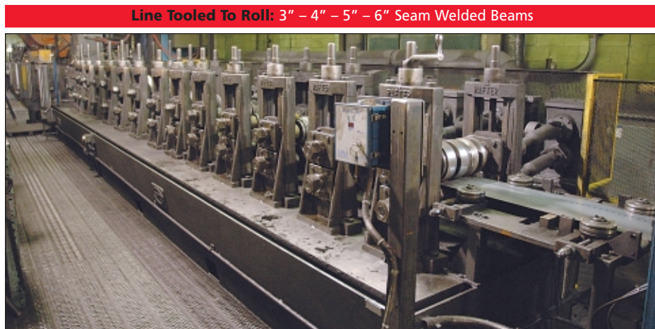
Rafter 3" Arbor X 16-Stand Model RT-3000-16 Roll Former

150 Ton South Bend Model 150BG-AC OBI Cut-Off Press; S/N 77012, 10" Stroke, 24" Shut Height, 33" X 50" Bed 75' Powered Rubber Belt & Roller Type Run-Out Conveyor