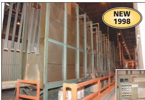
150' Long Tellkamp Natural Gas Fired Three-Stage Parts Washer