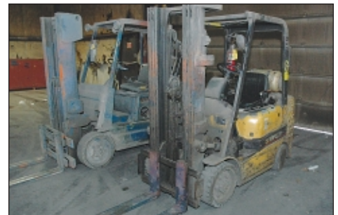
Partial View Other Lift Trucks