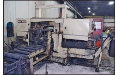
24" X 24" (Est.) Wagner Model WPB520A Automatic Horizontal Band Saw