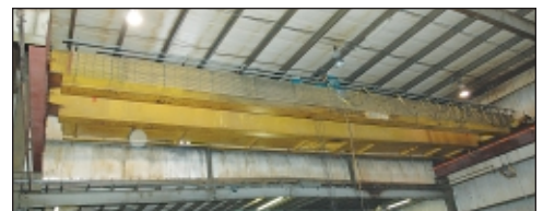
7-1/2 Ton X 60' Span Shaw Box Double Girder Top Running Overhead Bridge Crane