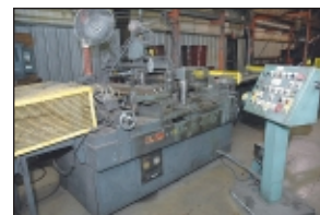
Kent Corporation Model 21.2005AB Auto Shear & End Coil Splicing Welder