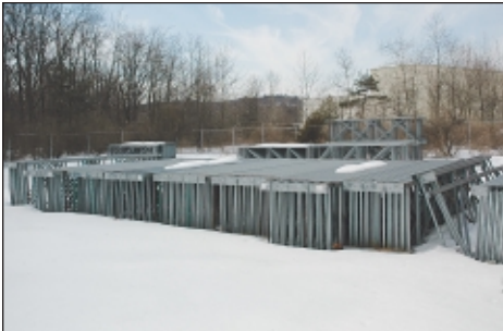
Partial View Finished Galvanized Inventory