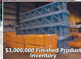
$3,000,000 Finished Product Inventory