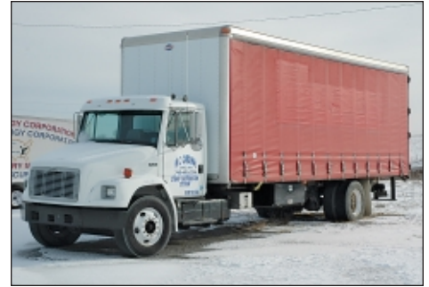
2002 Freightliner FL70 Box Van Truck