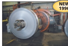
12,000 LB Per Side Canadian Automation Model CAT-12DCR Double End Uncoiler