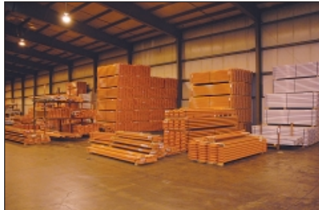
Approx. 49,557 ($900,000) Finished Beams of All Sizes