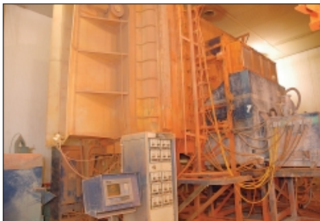
Nordson 20-Gun Poly Upper Pass Thru Automatic Powder Coat Booth