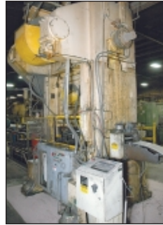
350 Ton Minster Model 40-E Straight Side Single Crank Press