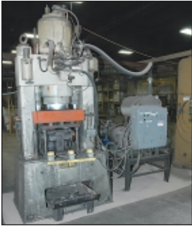
300 Ton Manufacturer Unknown Model HPS-300 H-Frame Hydraulic Down Stroke Press