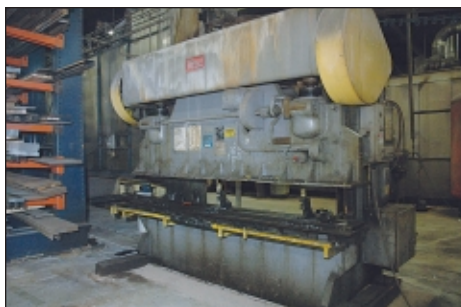
120 Ton X 10' Warco Mechanical Press Brake