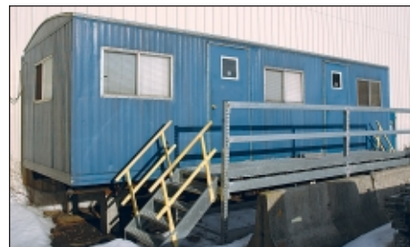
10'W X 28' Long Dual Axle Office Trailer

Office Equipment Consisting of: Copy Machines, Misc. PC's & Printers, Executive Wood Office Sets, Conference Room Table & Chairs, Modular Office Units, Free-Standing Desks, Tables, Chairs, File Cabinets & Related – Located at 447 Building