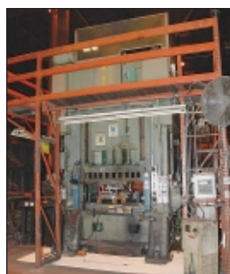
300 Ton Minster Hevi-Stamper Model E2-300-54-36 SSDC Press