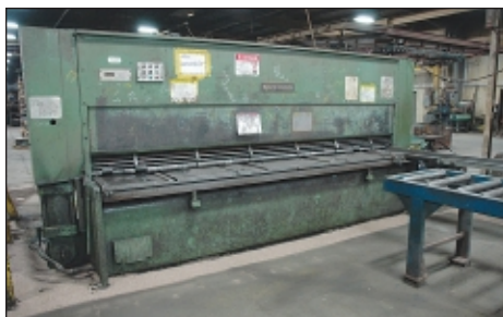
12' X 1/2" Cincinnati Model 4H12 Century Hydraulic Power Squaring Shear