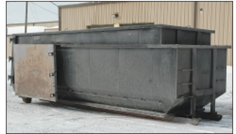
(19) 30 Yard and (11) 20 Yard Roll-Off Containers