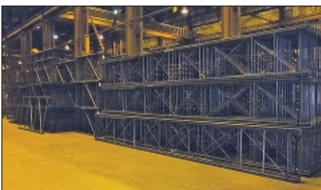
Approx. 560 Ton ($600,000) In-Process Inventory for All Rack Components

THE INVENTORY FIGURES WERE GATHERED FROM MANAGEMENT AND COURT DOCUMENTS AND ARE MEANT TO BE USED AS AN ESTIMATE GUIDE ONLY. INTERESTED PARTIES ARE STRONGLY ADVISED TO INSPECT AND ANALYZE QUANTITIES INCLUDED IN THE INDIVIDUAL CATEGORIES AND LOTS OFFERED IN THE AUCTION. AUCTIONEER MAKES NO GUARANTEES AS TO THE ACCURACY OF ANY OF THE FIGURES.