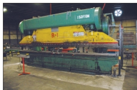
150 Ton X 20' Chicago Mechanical Press Brake