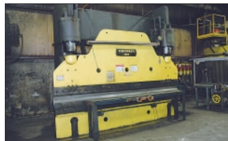
500 Ton X 14' Cincinnati Model 500H Series X 10 Hydraulic Press Brake