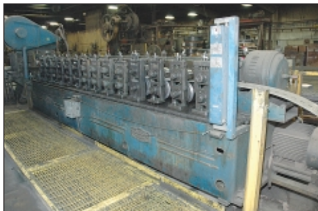
Tishken 2-1/2" Arbor X 14-Stand Model 14-HW-2-1/2 Roll Former

Custom Built Hydraulic Punch w/ (4) Punch Stations and 20 HP Hydraulic Unit