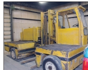
10,000 LB Allis Chalmers Model ACS100-D-PS Gasoline Pneumatic Tire Side Loader Forklift