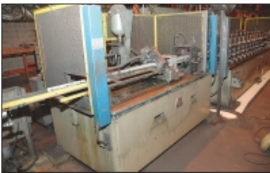
American Machinery Flying Hydraulic Pre-Punch Press