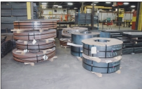
Approx. 25 Ton ($23,000 Cost) Steel Coil Inventory