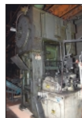
300 Ton Minster Hevi-Stamper Model E2-300-36-36 Straight Side Press