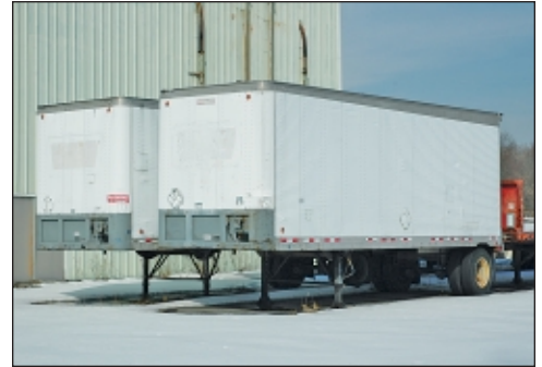
(2) 48' Utility Mfg. Type ES2CHE Tandem Axle Flat Bed Trailers