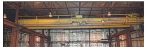
5 Ton X 65' Approx. Span Shaw Box Double Girder Top Running Overhead Bridge Crane