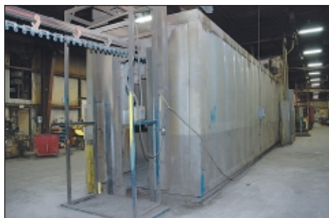
40' Long Natural Gas Fired Pass Thru Dry Off Oven

24" X 36" Amada Model H-900HD Mitre Head Horizontal Metal Cutting Band Saw; S/N 500402, Hydraulic Clamping, 2" Blade Width, Coolant System, 20' Gravity Feed Roller Infeed Conveyor, 40' Gravity Feed Roller Outfeed Conveyor SEE PHOTO