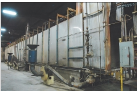
36' Long Herr Industrial Three-Stage Stainless Steel Pass Thru Parts Washer