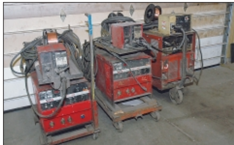
(3) Lincoln Mig Welders