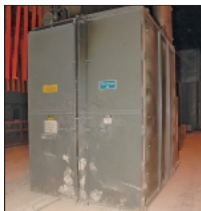
Steelman Industries Model 698BC Natural Gas Fired Drive-In Burn-Off Oven