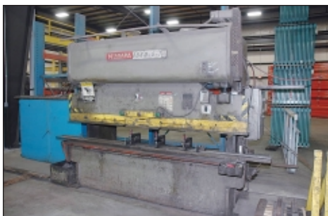
150 Ton X 12' Verson Model B-710-150 Mechanical Power Press Brake