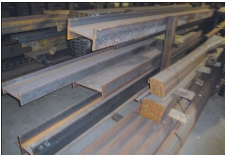
Approx. 275 Ton ($279,000 Cost) Structural Steel Angle, Channel, Tube and I-Beam Inventory for Mezzanine Construction