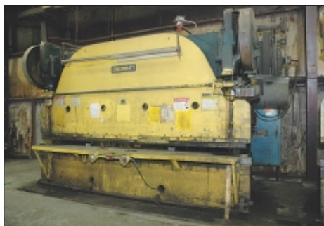
225 / 400 Ton X 14' Cincinnati Series 130 X 12' Mechanical Press Brake