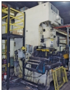
160 Ton Stamtec Model G1-160 Open Back Gap Notching Press