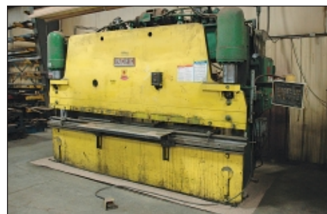
150 Ton X 12 Pacific Model K150-12 CNC Hydraulic Press Brake