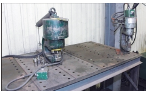
Whitney Portable C-Frame Dual Head Hydraulic Punching Station