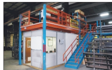
10' X 10' X 25' (Est.) Overhead Storage Mezzanine