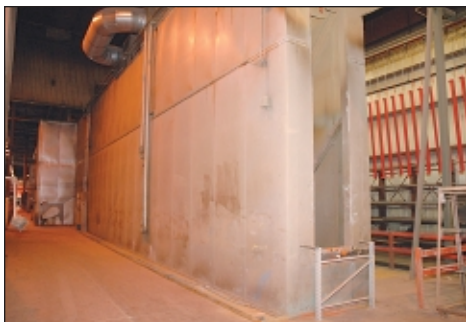
250' Long Tellkamp Natural Gas Fired Cure Oven