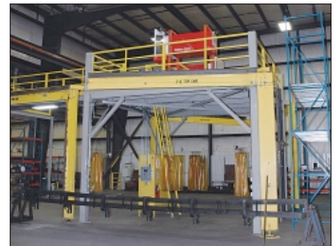
18' X 18' X 18' High (Est.) Overhead Welding Station Mezzanine (for Power Supply Placement)