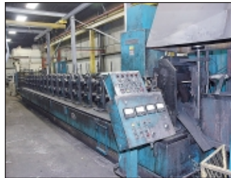
Reverse View Yoder 3" Arbor X 15- Stand Roll Former