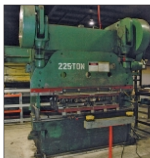
225 Ton X 8' Cincinnati Series 9 Mechanical Press Brake