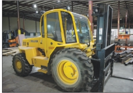
8,000 Lb Sellick model S-80JDS-4 Diesel Pneumatic Tire Lift Truck

Office Equipment Consisting of; Executive Office Furniture, Flat Screen Dell PC's Monitors, LP Desks, Lateral File Cabinets, File Cabinets, Credenzas, Chairs, Lobby Furniture & Other Related Items