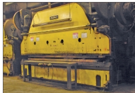
400 / 600 Ton X 18' Cincinnati Series 21 Mechanical Press Brake