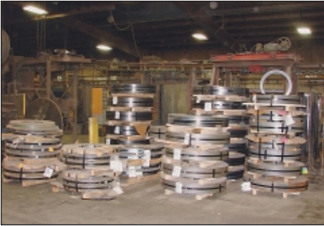
Approx. 60 Ton Mild and 70 Ton Galvanized Steel Coil Inventory