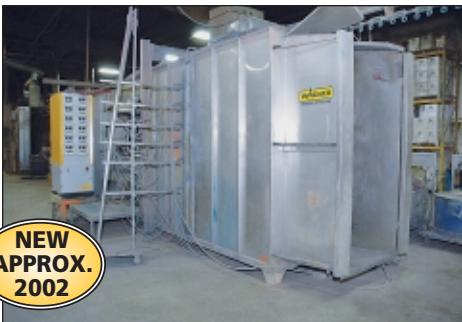
25' Long Wagner Stainless Steel Pass Thru Powder Coat Booth