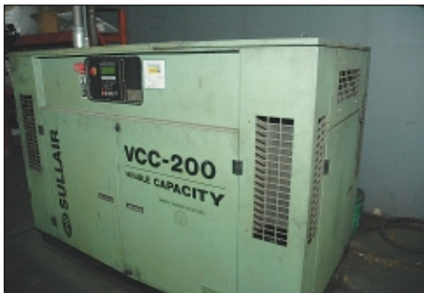
100 HP Sullair Model VCC-200-100HA Rotary Screw Cabinet Type Air Compressor