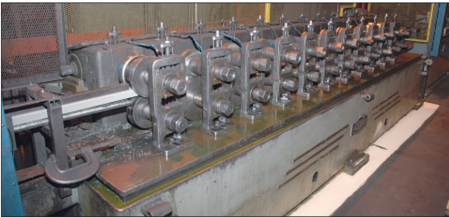
Tishken 2-1/2" Arbor X 12-Stand Model 12HW-2-1/2 Roll Former

Line Tooled to Roll: C-Channel Pallet Support Slats Approx. 1-1/2" X 2-3/4"