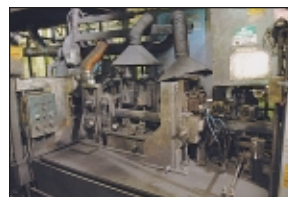
Thermatool Model TC-150 High Frequency Oscillator Seam Welding System