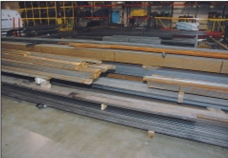
200 Ton Various Shape Full Length Structural Steel Inventory