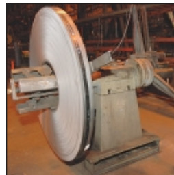
5,000 Lb Cooper Weymouth Model 5000-18DP D.E. Uncoiler

Line Tooled to Roll: C-Channel Upright Post Reinforcement Legs Approx. 1-1/2" X 2-3/4"