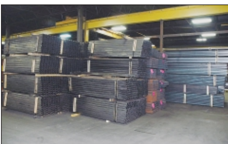
Approx. 220 Tons ($225,000) WIP Inventory Including Beams, Frames, Cantilever, Columns, Tube and Accessories