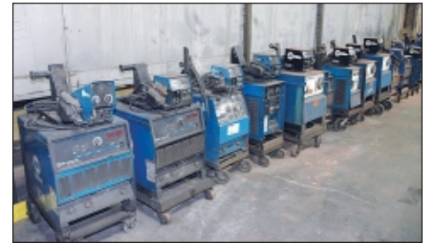
Partial View (25) Various Model Miller MIG Welders