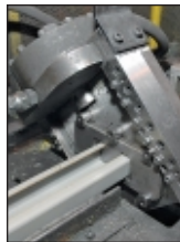
Close-Up View Pallet Support Slat Profile