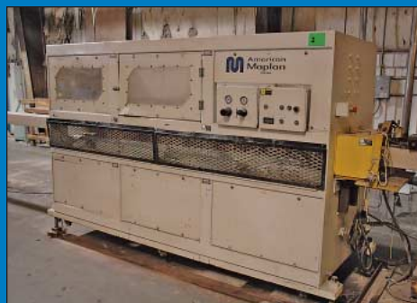
14' X 7' Belt American Maplan Cleated Belt Puller