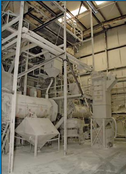
Overall View 450 LB and 850 LB Capacity Intensity Type Batch Mixer Blending Systems