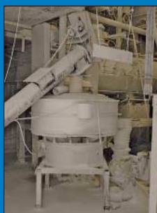
48" Dia. Sifter Unit w/ Surge Bin and Avenger Conveyor