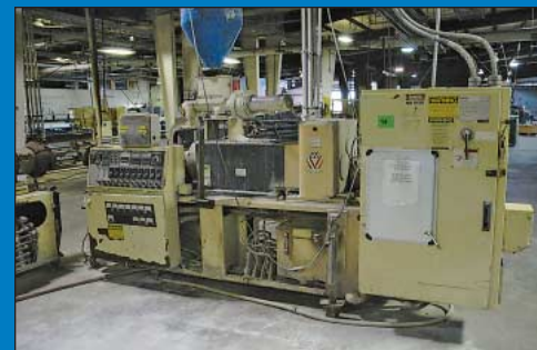
55 MM Cincinnati Milacron Model CM-55HP Twin Screw Co-Extruder

OUT-OF-SERVICE EXTRUDERS (13) Cincinnati Milacron and Krauss Maffei Extrusion Machines, Out Of Service, Parts Machines