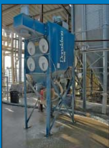
Torit Cartridge Type Dust Collector

Office Furniture and Equipment Consisting; (15) 4 & 5-Drawer Letter Files, (6) 2-Drawer Lateral Files, 2-Door Storage Cabinets, Steel & Wood Bookshelves, Reception Area Furniture, Conference Room Furniture, Desks, Office Chairs, Media Carts, Brother Model 63 Fax Machine, Printek Printer, HP Laser Printers, Ink Jet Printers, and Other Related Items