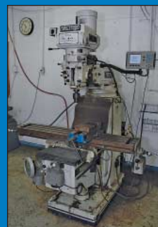
5 HP Vectrax Model GS20V Variable Speed Vertical Milling Machine