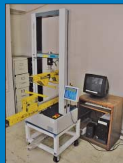
Lloyd Instruments Model LR10K Plus Universal Tensile Testing Machine