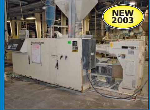
90 MM Krauss Maffei Model KDM 90-26 Twin Screw Extruder