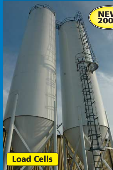
(2) 59'-1" High X 11'-11" Dia. Columbian Tectank Welded Steel Material Silos