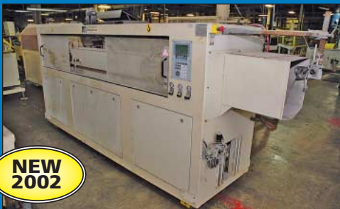
9' X 10' American Maplan Battenfeld Model P250 SE/2000 Belt Puller