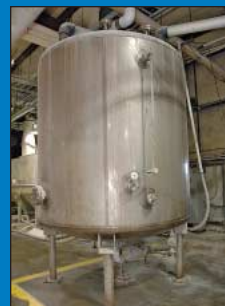
96" Dia. X 96" High Stainless Steel Water Holding Tank