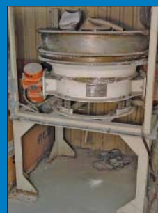
36" Dia. Sweko Model XS48S86 Vibro-Energy Separator