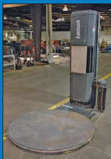
65" Dia. Lantech Q-Series Rotary Pallet Stretch Wrap Machine