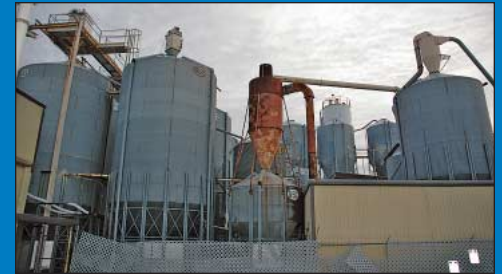
Overall View (14) Corrugated Bolt Together Material Storage Silos