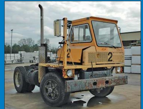
1986 Ottawa Model 30 Single Axle Spotting Tractor

Dynetics Corp. Model HL-90 Hydraulic Extrude Hone; S/N: H2386, Dual 10" Work Heads, 30 HP Hydraulic System, Auto Clamping, Low Use Machine