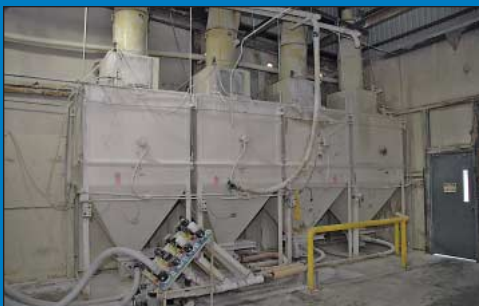
(8) 60" X 60" X 60" IMS Surge Bins