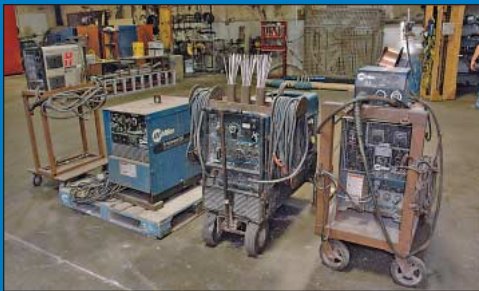
Partial View Late Model Welding Equipment