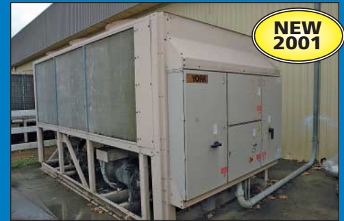
110 Ton York Model YCAS0110EC46XFASB Central Water Chiller