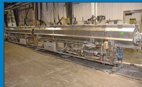
Partial View 1 of 15 Various Stainless Steel Vacuum Calibration Tanks By American Maplan, Conair and Others