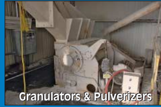
Granulators & Pulverizers