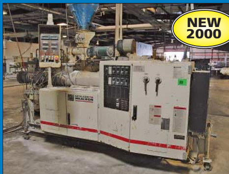
50 MM Cincinnati Milacron Model TC-50 Twin Screw Co-Extruder