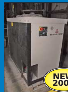
Domnick Hunter Model CRD1800 Air Dryer