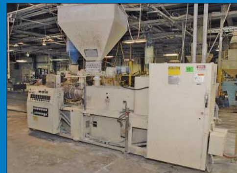
80 MM Cincinnati Milacron Model CM-80 HP Twin Screw Extruder

90 MM Krauss Maffei Model KDM 90-26 Twin Screw Extruder; S/N 51001878, 100 HP at 1750 RPM, Ratio 42.1:1, Digital Control Panel w/ Monitor, Loader Hopper, Line 7 (New 2003) SEE PHOTO