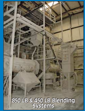
850 LB & 450 LB Blending Systems