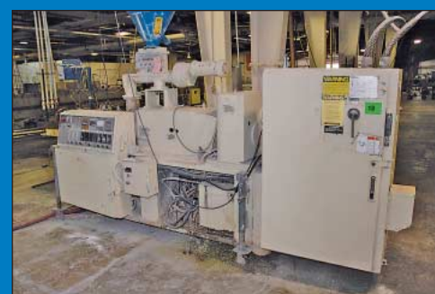
55 MM Cincinnati Milacron Model CM-55HP Twin Screw Co-Extruder

INFORMATION AND PHOTOS OF ADDITIONAL DOWNSTREAM EQUIPMENT INCLUDING CUT-OFF SAWS ON PAGES 6 AND 7