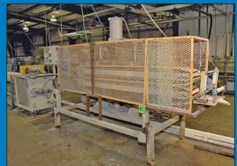
(1 of 20) Cincinnati Milacron Cleated Belt Pullers To 11' Wide and 8' Long

ALL EXTRUSION LINES WILL BE SOLD SEPARATE AND OVERALL HIGHEST BIDS OR BID TO PREVAIL