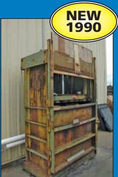
Cram-A-Lot Model 60 Cont BD Hydraulic Baler