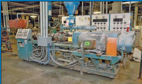
100 MM American Maplan Model TS-100 Twin Screw Extruder