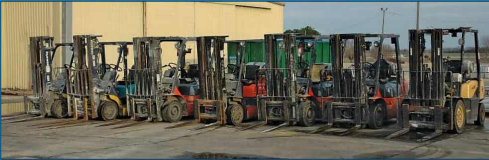
(11) Lift Trucks of All Types By Komatsu, Toyota, Daewoo and Others