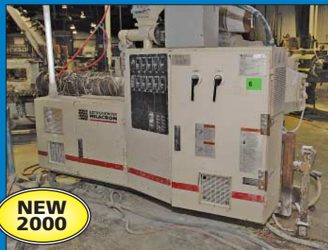
50 MM Cincinnati Milacron Model TC-50 Conical Co-Extruder