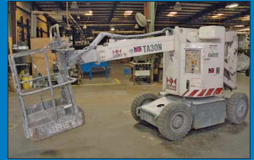
Terex Model TA30N Pneumatic Tire Electric Boom Lift