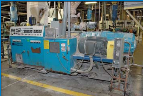
88 MM American Maplan Model TS-88 Twin Screw Extruder