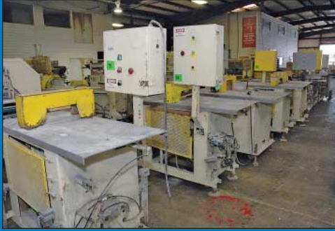
(15) Conair, RDN and American Maplan Upacting Cut-Off Saws In Various Stages of Repair