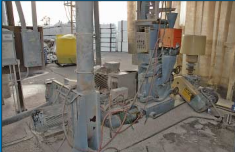
55 KW Herbold Type PU500ZR Central Pulverizer