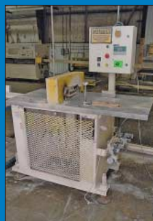
Partial View 1 of Numerous RDN Upacting Cut-Off Saws