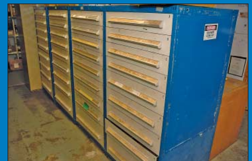
Partial View Large Quantity Maintenance Parts