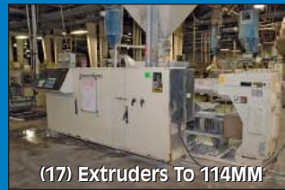
(17) Extruders To 114MM

2020 DUNLAP ST., CINCINNATI, OHIO 45214 PHONE (513) 241-9701 / FAX (513) 241-6760 WEBSITE: cia-auction.com