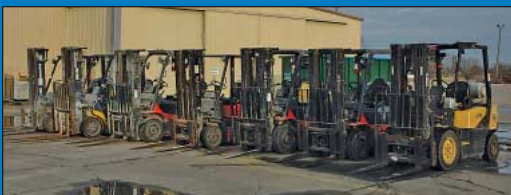
(11) Lift Trucks of All Types By Komatsu, Toyota, Daewoo and Others

Featuring: (9) Complete PVC Co-Extrusion Lines w/ Krauss Maffei, Cincinnati & American Maplan Twin Screw Extruders from 50mm to 115mm Capacity, Lines Include: Vacuum Calibration & Cooling Tanks, Belt Pullers & Cut-off Saws, Lg. Qty. Additional Belt Pullers, Cut-Off Saws & Cooling Tanks, Extruder Parts & Spare Gear Boxes, Late Model Chillers, Air Compressors, Complete Mixing Room w/ 850 Lb. and 450 Lb. Intensity Mixers w/ Hoppers, Coolers and Related, 100 HP Rapid & 150HP Cumberland Granulators (To 2004), 55KW Herbold Pulverizer, 200HP Blower System, (2) Late Model Columbia Tectank Welded Steel Silos w/ Load Cells, (14) Various Size Bolt Together Steel Silos, Surge Bins, Vacuum Unloading Systems, Extrusion Routers, Weima Pull Rod Shredder, 30" X 30" Weima Central Granulator, Extrude Hone, Lift Trucks, Pallet Racks, Huge Quantity Shop Equipment & Supplies.