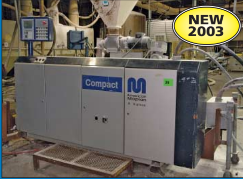
54 MM American Maplan / Battenfeld Model MBEX2-54 Twin Screw Co-Extruder