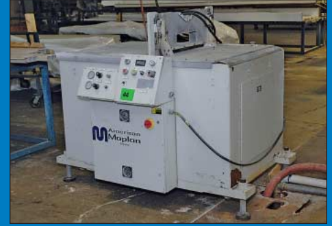
Partial View 1 of 5 Late Model American Maplan Upacting Cut-Off Saws