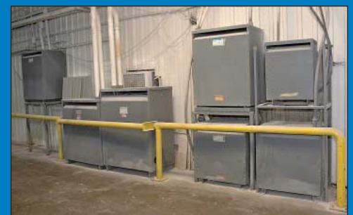
(24) Transformers From 75 to 250 KVA Manufacturers Include Federal Pacific, GE, Cutler Hammer and Square D