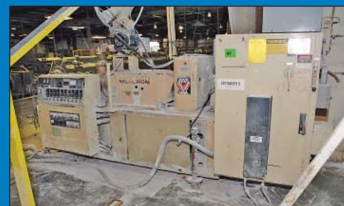
55 MM Cincinnati Milacron Model CM-55HP Co-Extruder