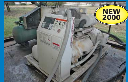
100 HP Gardner Denver Model EBP99D Electra Saver II Rotary Screw Air Compressor