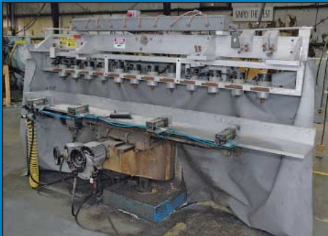
(6) Supermax Model YCM-16VS Multi-Head Custom Built Extrusion Routers