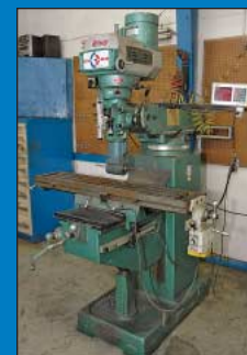
3 HP Grizzly Model 34029 Variable Speed Vertical Milling Machine