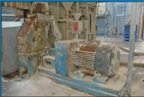
150 HP Mfg. Unk. Central Pulverizer