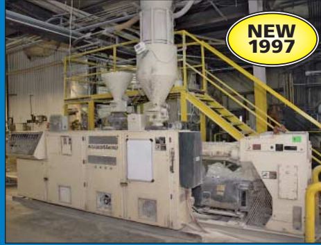
114 MM Krauss Maffei Model KMD 114-26 Extruder