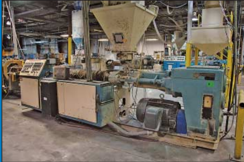
110 MM Krauss Maffei Model KMD 2-110 Counter Rotating Twin Screw Extruder