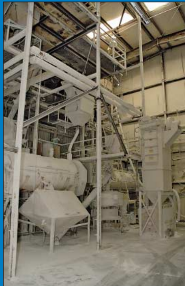
Overall View 450 LB and 850 LB Capacity Intensity Type Batch Mixer Blending Systems