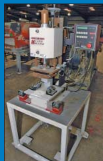
United Silicone Model US10 Decorating Press