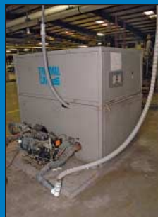
Thermal Care Accuchiller Portable Chiller