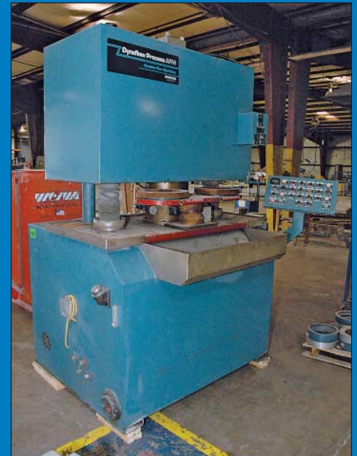
Dynetics Corp. Model HL-90 Hydraulic Extrude Hone