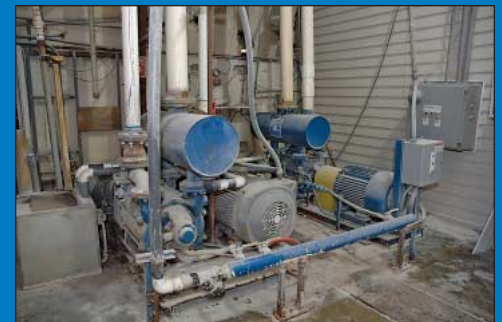
(3) 75 HP Sihu Central Water Pumps