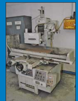
12" X 24" Okamoto Model PSG-6FUA Hydraulic Surface Grinder