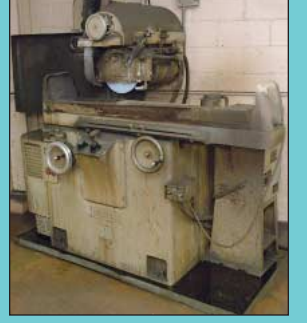
6" X 18" Thompson Hydraulic Surface Grinder