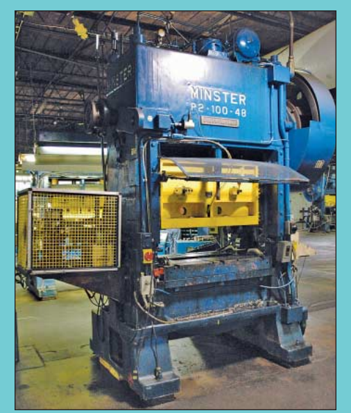
(2) 100 Ton Minster P2-100-48 Piece-Maker Straight Side Double Crank Variable Speed Presses