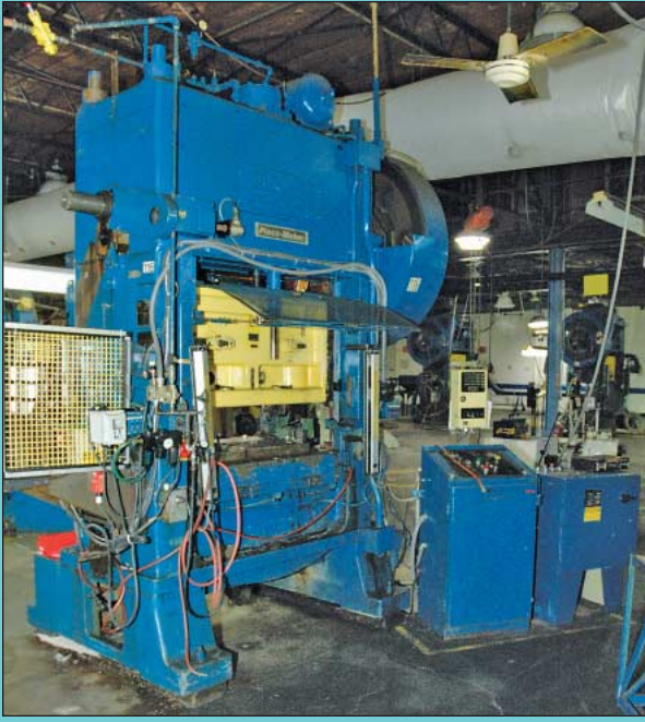
Straight Side Double Crank Presses

SPEED STAMPING DING PRESSES, TOOLROOM, FINISHING SUPPORT EQUIPMENT