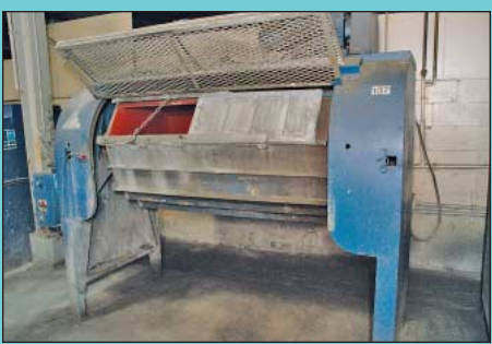
(4) 32" X 60" Rampart Model HT3260 Twin Compartment Tumbling Barrel Part<u>s Deburring</u>