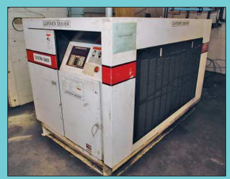
100 HP Gardner Denver Model EAPOMB Cabinet Type Rotary Screw Air Cooled Air Compressor