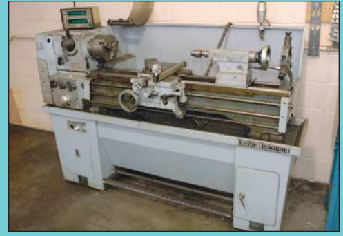
13" X 40" Victor Model 1340GHE Geared Head Engine Lathe