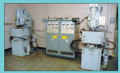
Bank View (2) Cincinnati Ram Type EDM Machines