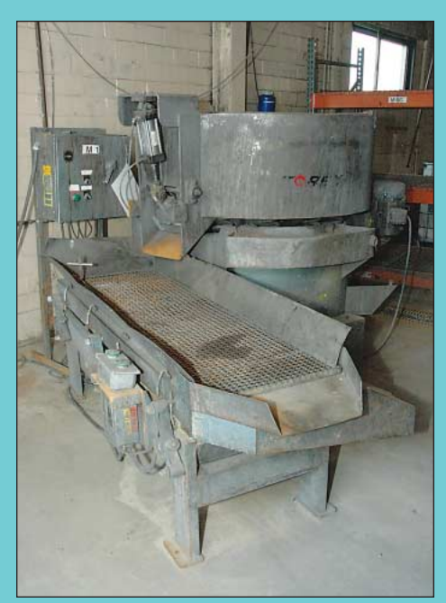
(1 of 2) Torex Model T-6026-F Vibratory Bowl Type Finishing Machine