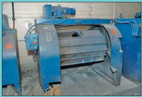
(5) 30" X 48" Rampart Model HT3048 Twin Compartment Tumbling Barrel Part<u>s Deburring</u> Machines