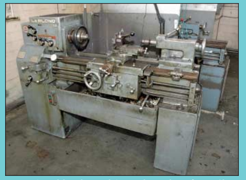
15" X 30" Leblond Regal Geared Head Engine Lathe