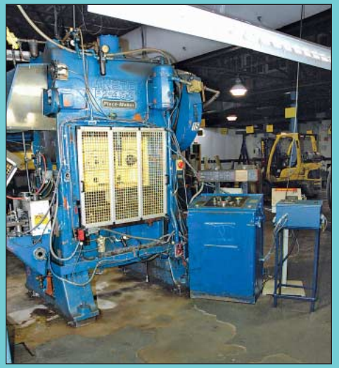
45 Ton Minster Model P2-45-36 Piece-Maker Variable Speed Straight Side Double Crank Press