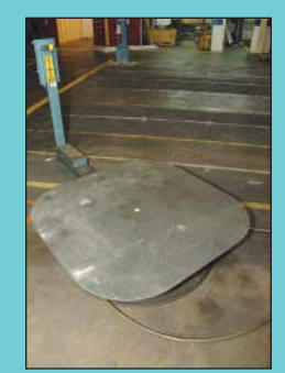
Mate Model EZ504 Horizontal Coil Reels