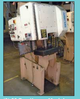
(2) 20 Ton Kenco Model P2A OBI Presses