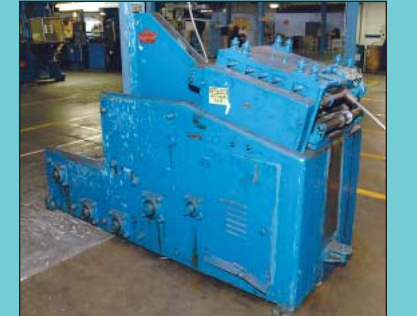
1,000 LB X 18" Cooper Weymouth Cradle