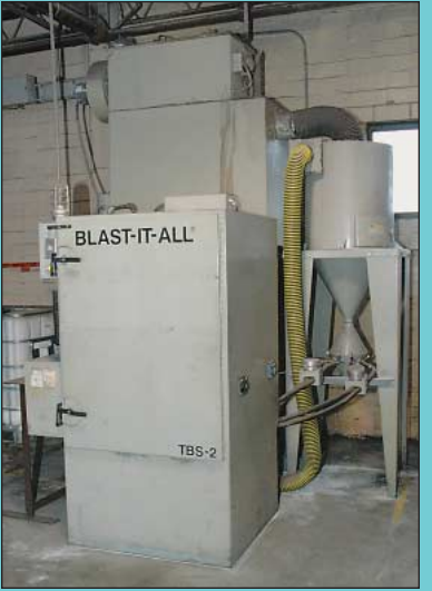
2 Cubic Foot Blast-It-All Model TBS2RPJT-3 Cabinet Type Tumbling Barrel Parts Deburring Machine