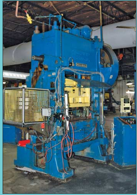
(2) 100 Ton Minster Model P2-100-48 Piece-Maker Variable Speed Straight Side Double Crank Presses