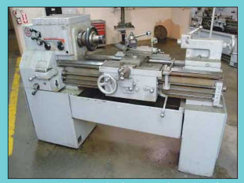
15" X 30" Leblond Dual Drive Geared Head Engine Lathe