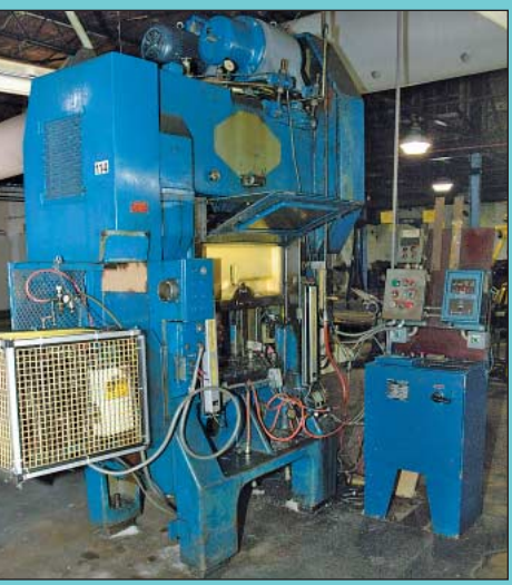
45 Ton L&J Model EM-45 Variable Speed Straight Side Double Crank Press