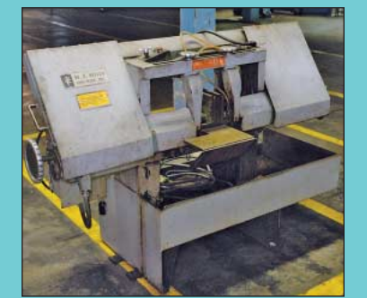
0" X 16" W.F. Wells Model L-10 Twin ost Horizontal Band Saw