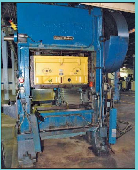
(2) 100 Ton Minster P2-100-48 Piece-Maker Straight Side Double Crank Variable Speed Presses