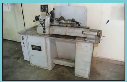
9" X 18" Hardinge Dovetail Toolroom Engine Lathe