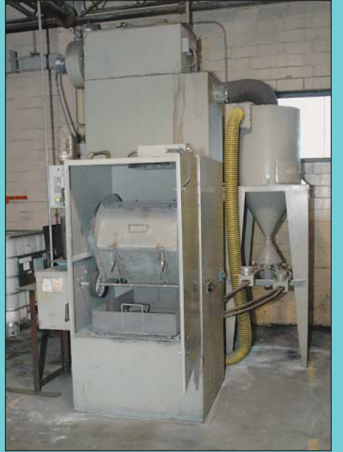
2 Cubic Foot Blast-It-All Model TBS2RPJT-3 Cabinet Type Tumbling Barrel Parts Deburring Machine