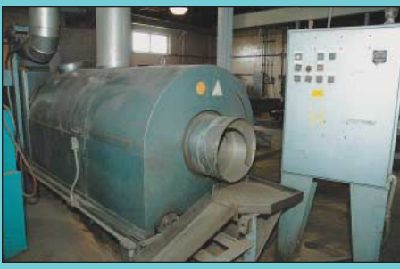
Parts Tumbling Thur-Feed Barrel Deburring and Drying Machine