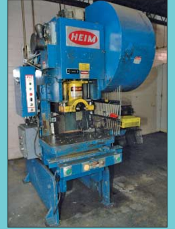
Flywheel Type OBI Press

S/N 14953 and 15364, 3" Stroke, Variable Speed 70 - 250 & 100 - 200 SPM, 4" Adjustment, 18" Shut Height, 48" X 31" Bed Size, Air Clutch, Air Cushion (No Motors or Controls) SEE рното