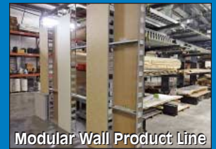
Modular Wall Product Line