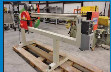
16" Blade x 60" Unique Machine and Tool Co. Model 42 Horizontal Panel Saw