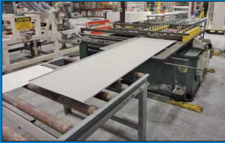
60" Maplewood Nine-Stand Adjustable Duplex Roll Former