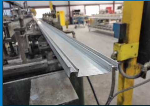
SampleView of Product Rollformer on Tishken Line