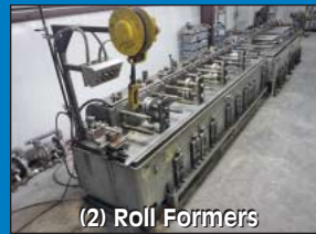
(2) Roll Formers

Contact Information 2020 Dunlap St. Cincinnati, Ohio 45214 Phone 513-241-9701 Fax 513-241-6760 www.cia-auction.com