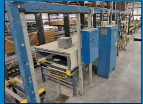
48"W x Approx. 20' Long Roller Conveyor Pass-Thru Electric Glue Drying Oven

Ridgid Model 1210 Bench Pipe Threader with Foot Control