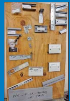
View of Sample Parts