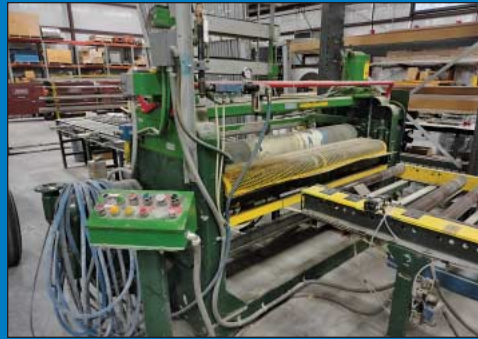
66" Black Bros. Roller Press