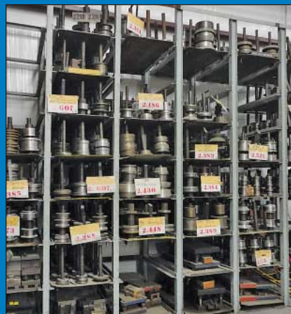
(25) Sets Rollformer Tooling for Rolling Various Modular Wall Panel Components & Steel Studs