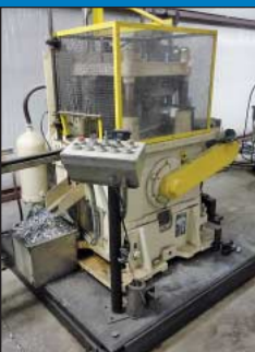
Yoder Four-Post Cutoff Press