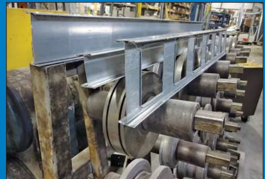
(25) Sets Rollformer Tooling for Rolling Various Modular Wall Panel Components & Steel Studs