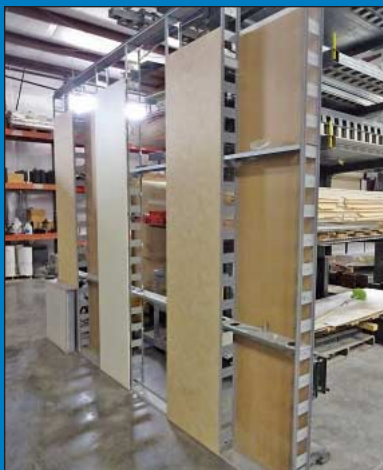
Tooling To Manufacture Steel Studs & Modular Wall Panel Systems