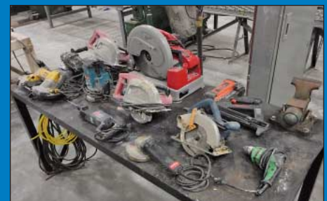
(100+) Lots of Power Tools and (10) Job Boxes, All Clean and Late Model

Tooling to Manufacture Modular Wall Systems