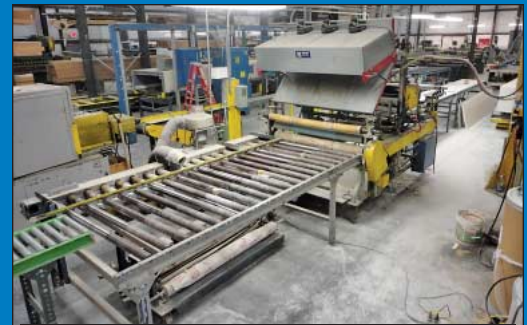
Vinyl To Dry Panel Application & Gluing Line