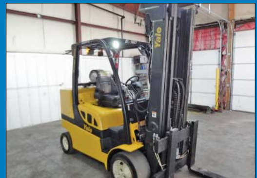
(4) Late Model Fork Lifts To 12,000 Lb.