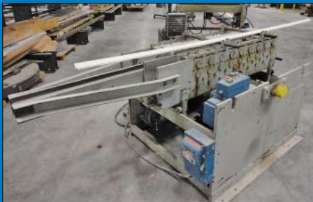
24" Approx. Nine-Stand Duplex Roll Former