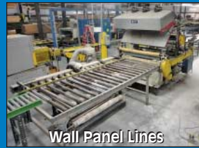
Wall Panel Lines