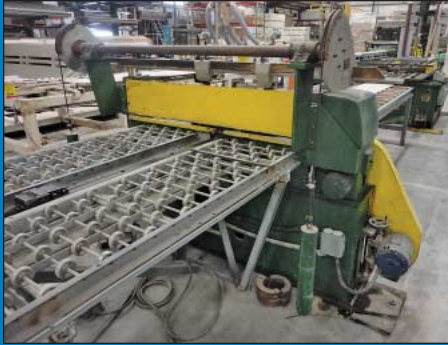
52" x 4" Arbor Motorized Slitting Machine w/ Infeed and Outfeed Tables