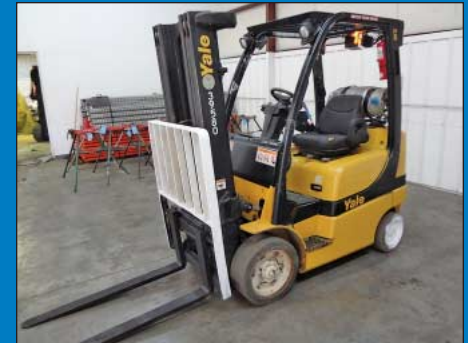
5,000 Lb. Yale Model GLC050 Solid Tire LP Gas Lift Truck

Clean Shop Equipment Consisting of; 6 HP Excel 2750 PSI Gas Power Washer, Morse Barrel Cady, Jib Rig Fork Lift Boom, (5) Hydraulic Pallet Trucks, (7) Various Size and Style Die Carts, (10) Various Size Dump Hoppers, (2) Advance Box Strappers, (3) Banding Outfits, Roll-A-Round, Step and Extension Ladders, Fireproof Cabinets, DE Grinders, Bench Vises, Tote Bins with Rack, Digital Floor Scale, Office Furniture and Related