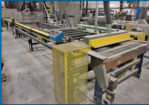
Overall View Dry Wall Panel Sizing Line