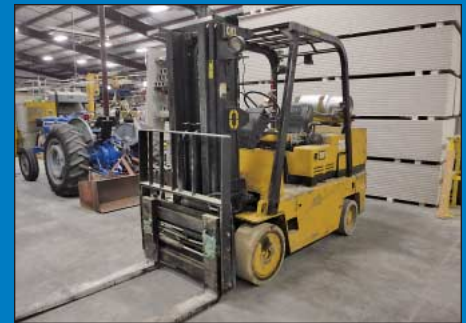
10,000 Lb. Caterpillar Model TC-100D LP Gas Solid Tire Lift Truck