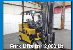
Fork Lifts to 12,000 Lb.