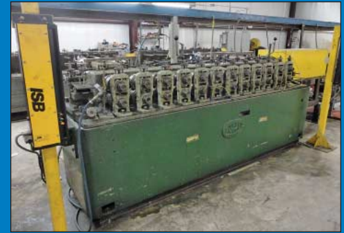
Tishken Model 12-HMW-1-1/2" Twelve-Stand x 1-1/2" Arbor Roll Former