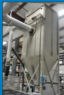
AAF Model Fabri-Pulse Dust Collector