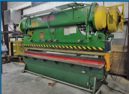
65 Ton x 12' Verson Mechanical Press Brake