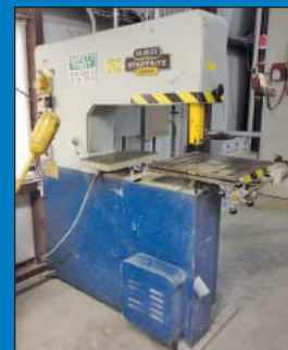
30" Kalamazoo Startrite Vertical Band Saw w/ Welder