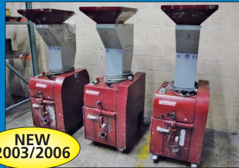
(4) 8" X 8" CMB Wittmann Model MB88 Granulators

Approx. 2400' 2" Aluminum Feed Tubing, Sweeps, Elbows and Couplings