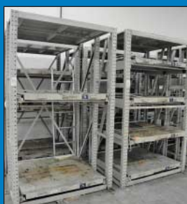
(9) 2,000 LB Ridg-U-Rak Sliding Shelf Die / Mold Racks