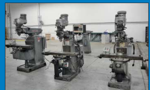
(3) Vertical Milling Machines By Bridgeport and Others