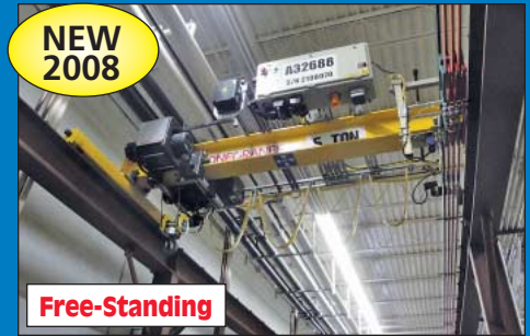
5 Ton X 13'-2" Approx. Span X 113' Approx. Long Free-Standing Overhead Crane System