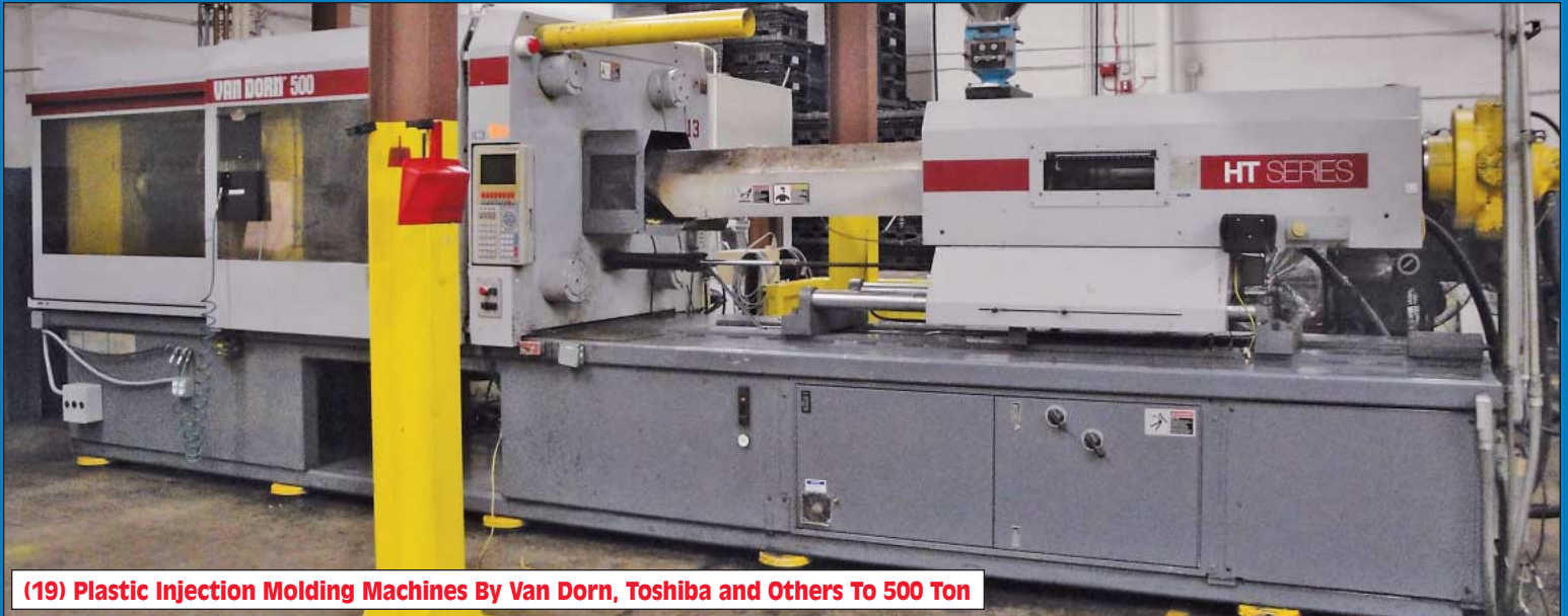
(19) Plastic Injection Molding Machines By Van Dorn, Toshiba and Others To 500 Ton

INSPECTION: TUESDAY, FEBRUARY 12TH FROM 10:00 AM TO 4:00 PM