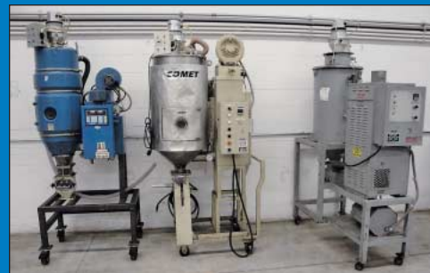
Partial View Dehumidifying Dryer Systems