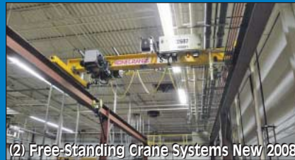
(2) Free-Standing Crane Systems New 2008