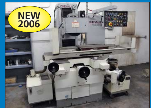
12" X 24" Chevalier Model FSG-3A1224 Hydraulic Surface Grinder