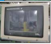
450 Ton X 60 Oz. Van Dorn Model 450-RS-60VV Horizontal Toggle Clamp Plastic Injection Molding Machine