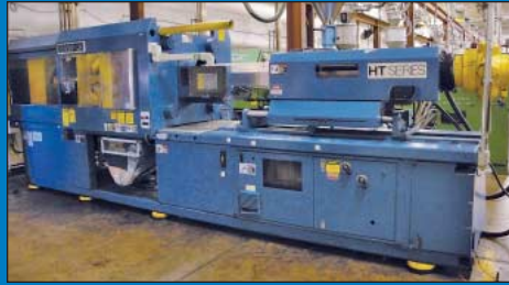
300 Ton X 30 Oz. Van Dorn Model 300-RS-30F-HT Horizontal Toggle Clamp Plastic Injection Molding Machine