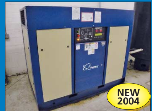
60 HP Quincy Model QS1300ACA31EC Cabinet Enclosed Rotary Screw Air Compressor