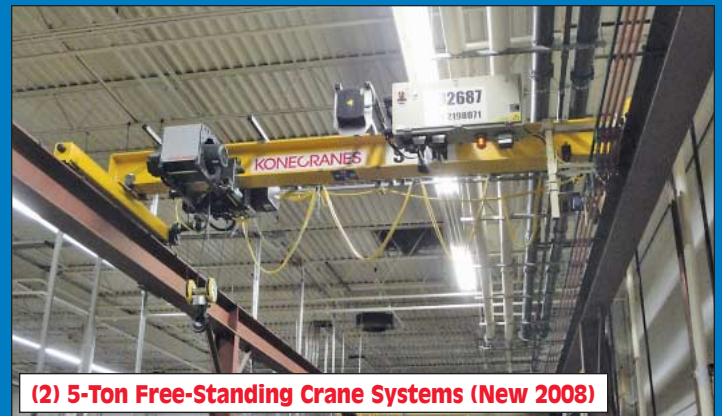
(2) 5-Ton Free-Standing Crane Systems (New 2008)