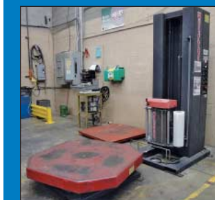
Wulftec Model WHP-200 Rotary Stretch Wrap Machine

(9) 2,000 LB Ridg-U-Rak Sliding Shelf Die / Mold Racks; 48" X 48" Platforms, Adjustable Pull-Out Shelves SEE PHOTO