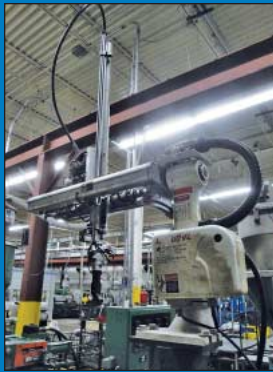
(2) Star Automation Model XO-800-VC Sprue Picker Robots