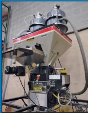
Maguire Model WSB-221 Three-Component Weigh Scale Blender