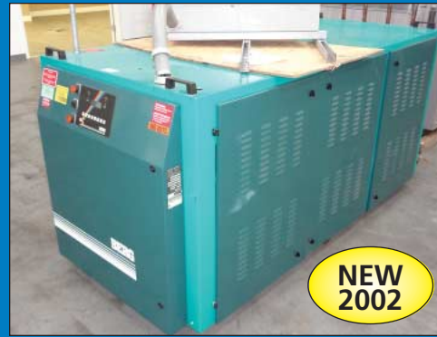
30 Ton Berg Model PR-30-2-3P Cabinet Enclosed Chilling System