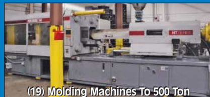
(19) Molding Machines To 500 Ton

2020 DUNLAP ST., CINCINNATI, OHIO 45214 PHONE (513) 241-9701 / FAX (513) 241-6760 WEBSITE: cia-auction.com