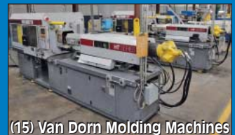
(15) Van Dorn Molding Machines