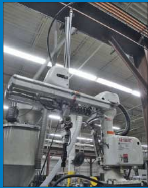
(1) Star Automation Model XO-800-VC Sprue Picker Robot