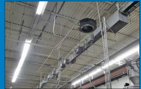
120' ITE Cat No. U310AVP 800-Amp / 600-Volt 3-Pole Busway

Building Maintenance Supplies & Machine Parts Including; 30 HP General Electric Motor, 30 HP US Tools Electric Motor, 50 HP Lincoln "Ultimate E1" Electric Motor, 7.5 HP Dayton Electric Motor, Approx. (120) Heater Bands of Various Sizes, 7.5 HP Vector 460 Volt Variable Speed AC Drive Motor; Contrac Gearbox & Baldor Control (These are loose surplus components on skid), Motors, Fuses, Electrical Components, Hold Downs and Many Other Related Items