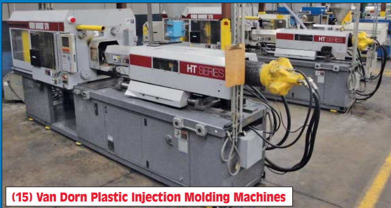
(15) Van Dorn Plastic Injection Molding Machines