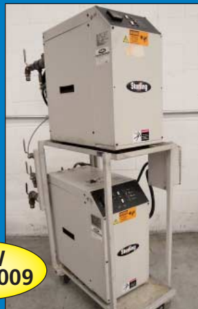
(18) Sterico Model SEUC-9-4-2 Mold Temperature Controllers