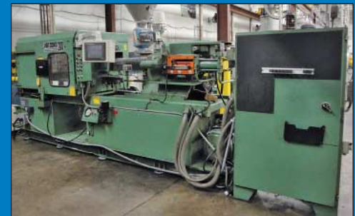
(2) 200 Ton X 30 Oz. Van Dorn Model 200-RS-30F Horizontal Toggle Clamp Plastic Injection Molding Machines