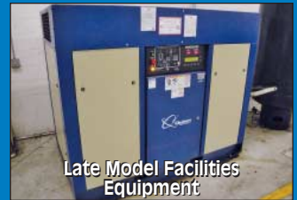
Late Model Facilities Equipment