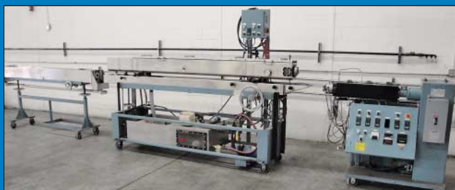
1.5" Dia. Killion 20:1 L/D Air Cooled Single Screw Extruder