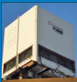
120 Ton Advantage Cooling Tower System