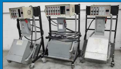
(9) Assorted (2-8) Zone ITC Portable Hot Runner Controllers