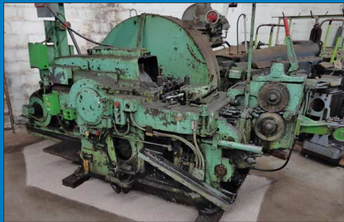
5/16" National 3-Die 3-Blow Cold Header

Contact Information 2020 Dunlap St. Cincinnati, Ohio 45214 Phone 513-241-9701 Fax 513-241-6760 www.cia-auction.com