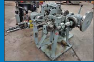
(10) DSSD Cold Headers by Waterbury and Manville frm 1/4" to 1/2" and Nilson 4-Slide