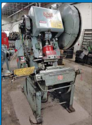
(5) Bliss OBI Presses To 45 Ton

15% ONSITE BUYERS PREMIUM • 18% ONLINE BUYERS PREMIUM