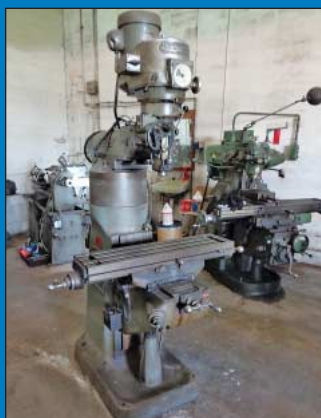
Toolroom Machinery Including Mills, Lathes, Grinders