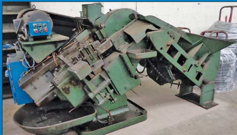
(13) Waterbury and Hartford Thread Rollers To 1/2"

INSPECTION: Tuesday, September 1st from 10:00 AM to 4:00 PM