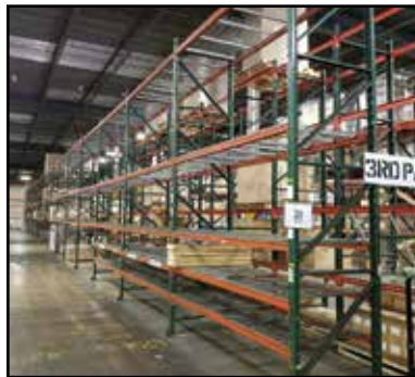
Assortment of Pallet Racking