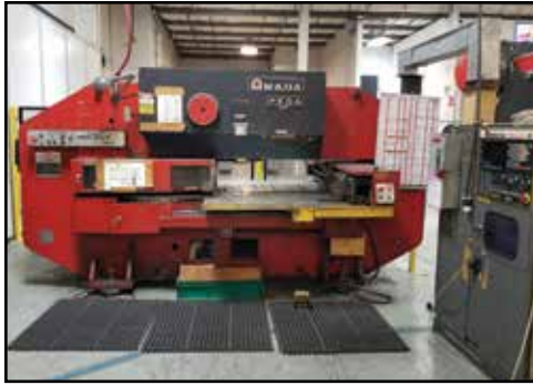
AMADA Pega-344 30-Ton Turret Press