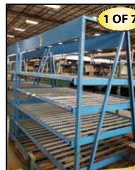
(7) Gravity Flow Racks

A&A RIGGING IS THE EXCLUSIVE RIGGER. ALL MACHINERY WILL BE PRE-PRICED FOR REMOVAL. CALL FOR MORE DETAILS: 800/626-6330