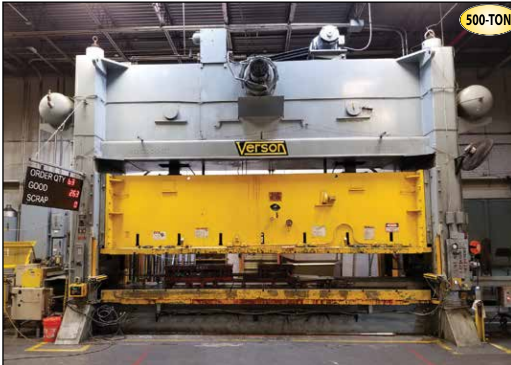
VERSON S2-500-240-60T 500-Ton Straight Side Press