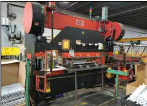
HEIM 200-12 200-Ton Flanged Bed Press Brake