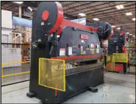
CINCINNATI 9 Series 225-Ton x 10' Press Brake