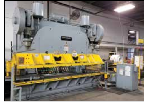
CINCINNATI 400-Ton x 10' Press Brake