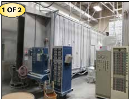
(2) NORDSON N-500 & 512 Automatic Powder Coating Spray Booths