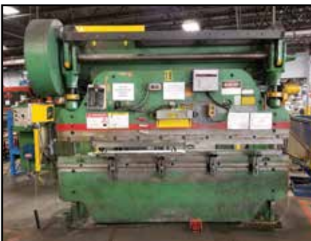
CINCINNATI 135-Ton x 8' Press Brake