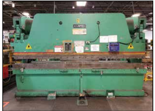
ACCURPRESS 740014 400-Ton x 14' Press Brake

INSPECTION: DAY PRIOR TO AUCTION FROM 9AM - 4PM