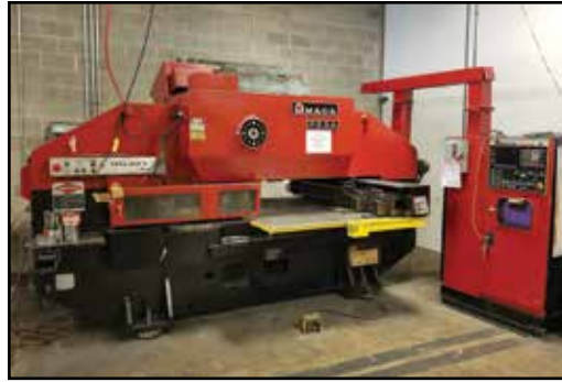
AMADA Pega-344 30-Ton Turret Press