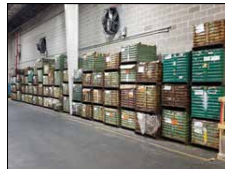
Stackable Material Transfers Bins