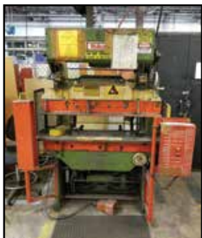
DI-ACRO Hyrapower Press Brake