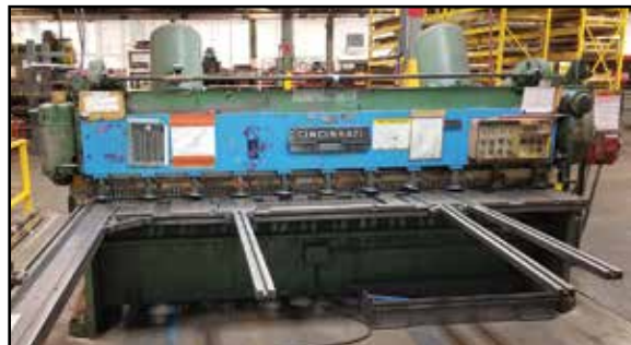
CINCINNATI 1410 3/16" Cap x 10' Auto Shear