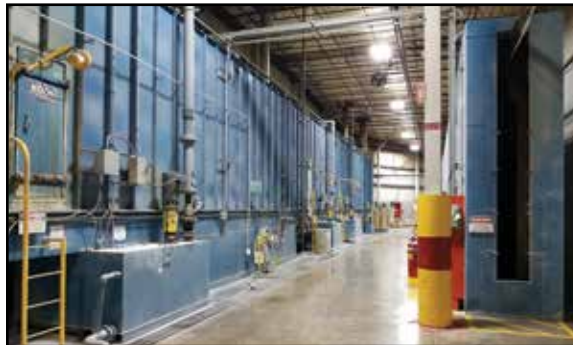
KOCH Multi-Stage Surface Prep Wash System