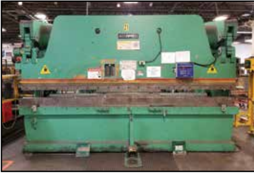
ACCUPRESS 740014 400-Ton x 14' Press Brake