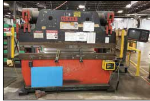
ACCUPRESS 71008 100-Ton x 8' Press Brake