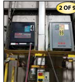
(9) 36 & 48-Volt Battery Chargers