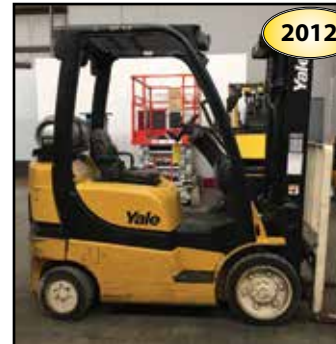
(4) YALE GLC050VX 5,000-lb. LPG Forklifts