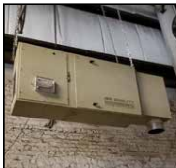
AIR QUALITY ENGINEERING Smog Collector