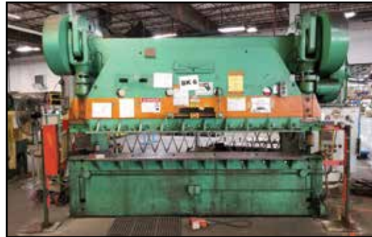
CINCINNATI 9 Series 225-Ton x 10' Press Brake