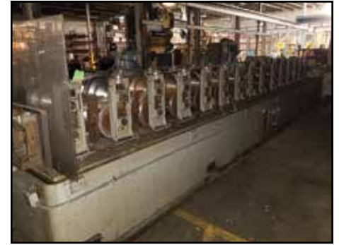
CONTOUR CR-A-H-2-12R 12-Stand Rollformer