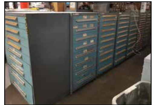
(25+/-) VIDMAR Cabinets w/Assorted Drawer Counts