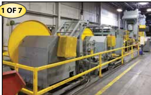
Multiple AMERICAN, SESCO & COE Feed Lines