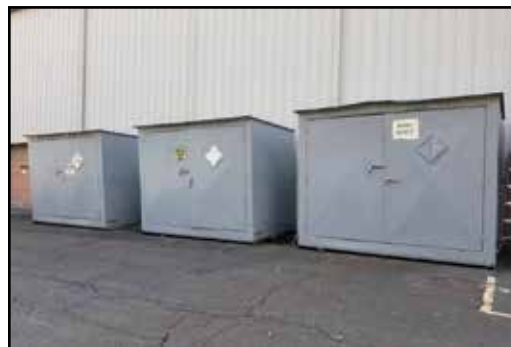
(3) Industrial Environmental Containment Sheds