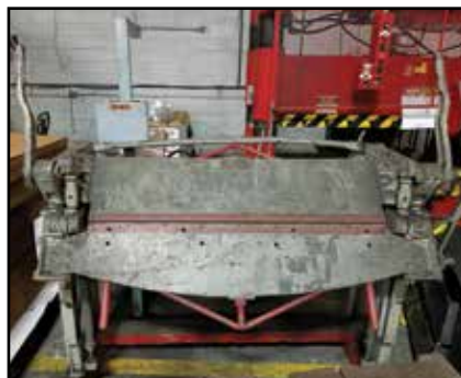
CHICAGO 48" Bending Brake