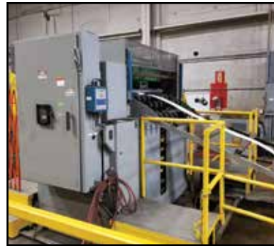
SESCO 12-1029 Straightener