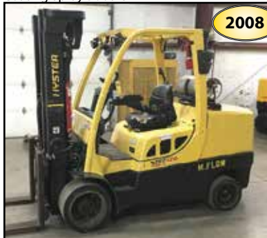
HYSTER S120FT 12,000-lb. LPG Forklift