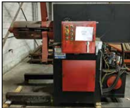
DALLAS INDUSTRIES 10,000-lb. x 24" Coil Reel