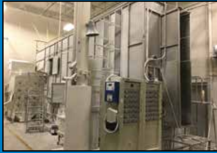
GEMA Automatic Powder Coating Spray Booth

Myron Bowling Auctioneers Inc. P.O. Box 369 ROSS, OHIO 45061