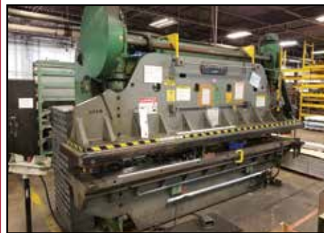
(2) CINCINNATI 135-Ton x 10' & 225-TON x 10' Flanged Bed Press Brakes