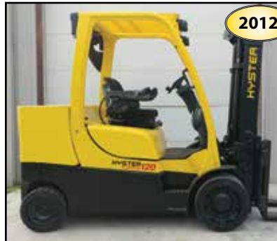
(2) HYSTER S120FT 12,000-lb. Gas Forklifts