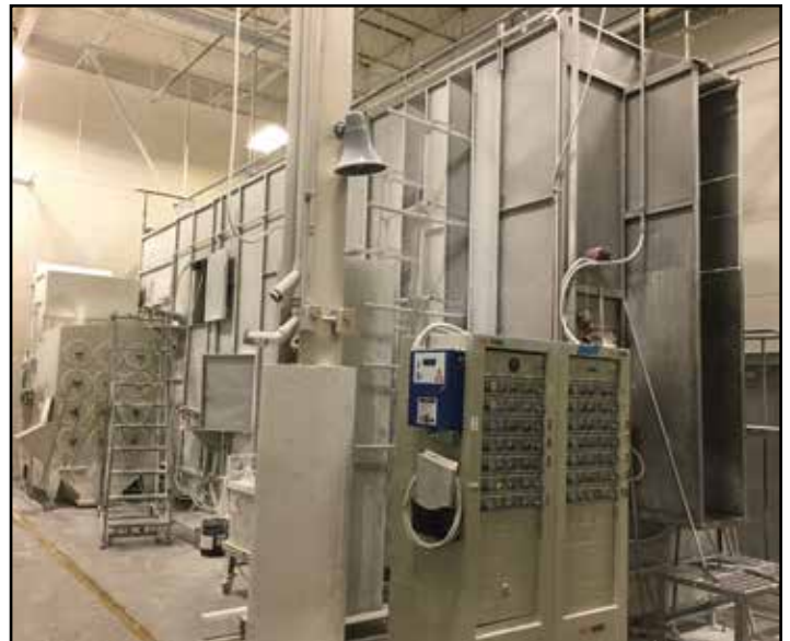
GEMA Automatic Powder Coating Spray Booth