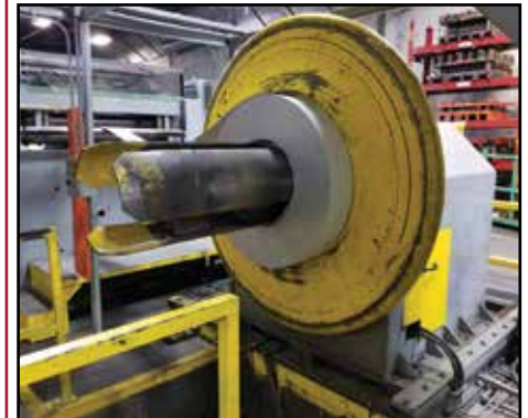
(2) 30,000-lb. Coil Reels