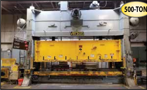
VERSON S2-500-240-60T 500-Ton Straight Side Press

INSPECTION: Day Prior to Auction from 9:00 AM - 4:00 PM