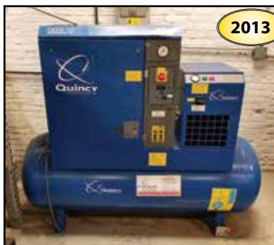
QUINCY QGS-10 Horizontal Air Compressor