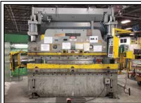
(2) CINCINNATI 135 DAM 135-Ton x 8' Press Brakes