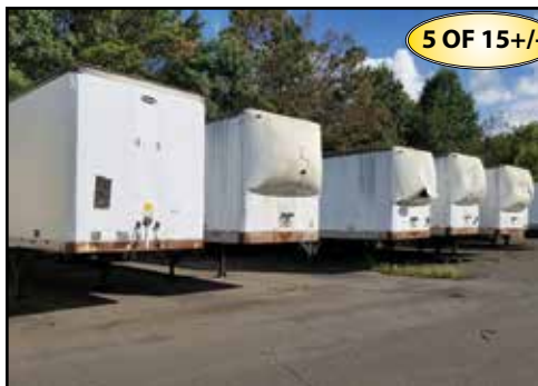
(15+/-) MORGANS & BUDD Box Trailers