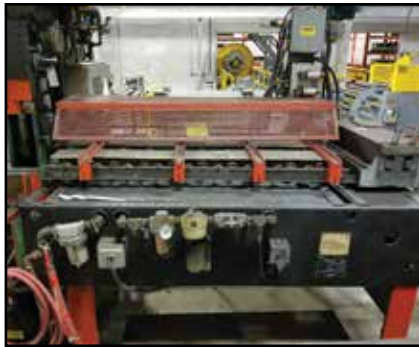
COIL-MATIC RF2-2450-RH Power Stock Infeed