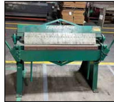
TENNSMITH 48" x 12-Ga. Finger Brake