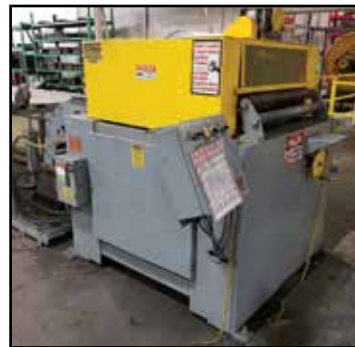
AMERICAN 3-11 Straightener