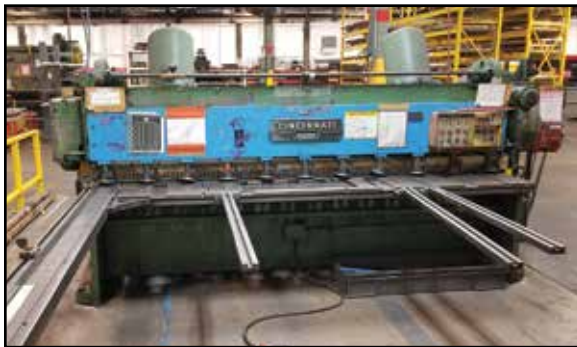
CINCINNATI 1410 3/16" x 10' Auto Shear