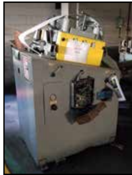
COE J4802-2 Press Feeder