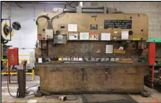
HTC 155-12H 155-Ton x 11.6' Press Brake