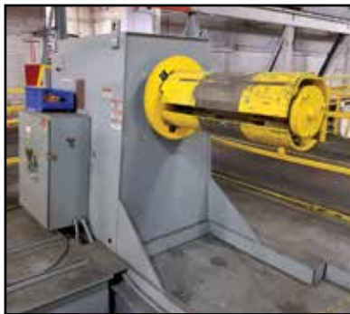
COE CPR-15036 Coil Reel