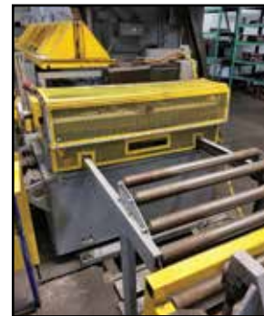
SESCO EF-400-42 Power Stock Infeed