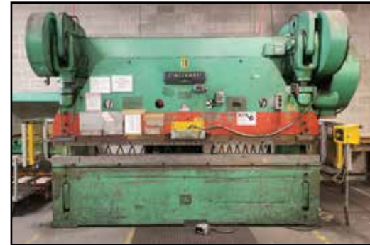
CINCINNATI 9 Series 225-Ton x 10' Press Brake