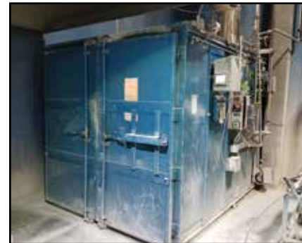
CONTROLLED PYROLYSIS Cleaning Furnace