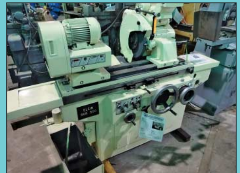
**11" x 20" Elgin O.D. Grinder