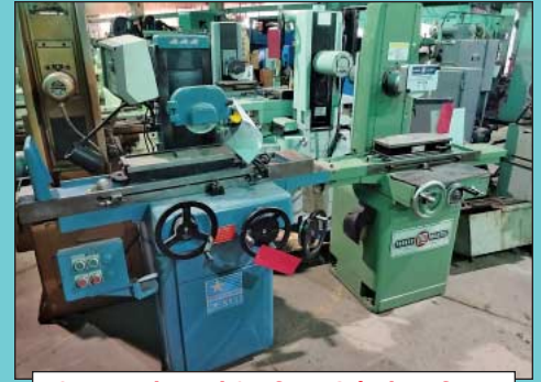
(25) Hand Feed Surface Grinders from 5" x 10" to 8" x 24"