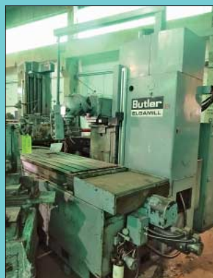
Butler Elgamill Model T Universal Vertical / Horizontal Mill