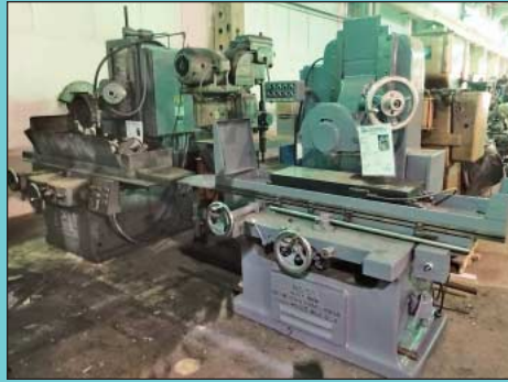
(3) Gallmeyer and Livingston Hydraulic Surface Grinders