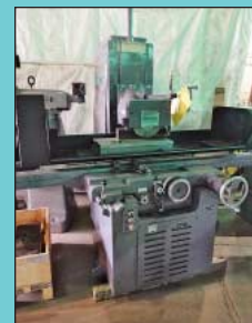
12" X 24" Gardner Hydraulic Surface Grinder