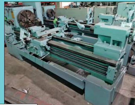
(35) Engine Lathes to 40" Swing and 234" Centers, Gap, Taper, Tooling

3-3/4" Cincinnati Gilbert Model T-350 Table Type Horizontal Boring Mill; 42" x 78" Table, 60" Vertical, DRO