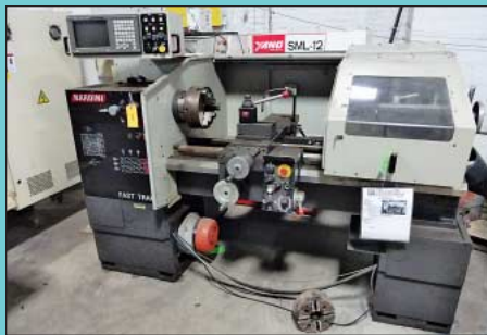
16" x 40" Nardini Model Fast Trace FB CNC Lathe