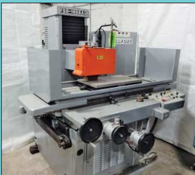
(32) Hydraulic & Hand Surface Grinders