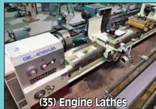
(35) Engine Lathes

Contact Information 2020 Dunlap St. Cincinnati, Ohio 45214 Phone 513-241-9701 Fax 513-241-6760 www.cia-auction.com