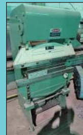
(7) Squaring Shears, Press Brakes & Fabricating Equipment