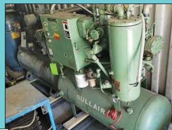
(30) Air Compressors to 60-HP