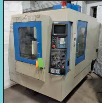
** (6) Kia Model V-25P Two-Pallet CNC Vertical Machining Centers