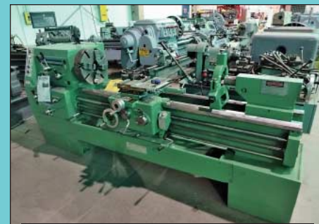
(20) Engine Lathes From 19" x 102" to 13" x 30"

(25) Hand Feed Surface Grinders by Parker Majestic, Harig, K.O. Lee, Boyar, Reid, Brown and Sharpe and Others from 5" x 10" to 8" x 24"