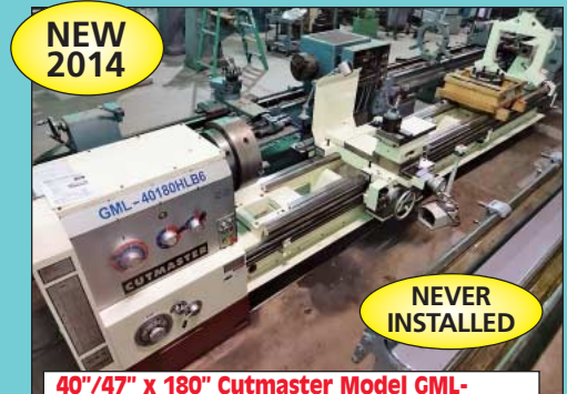
NEW 2014 40"/47" x 180" Cutmaster Model GML- 40180HLB6 Cap Bed Engine Lathe