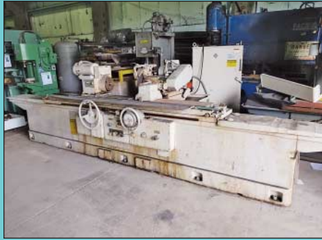
12" x 72" Cincinnati Milacron Model DE Universal Hydraulic Cylindrical Grinder