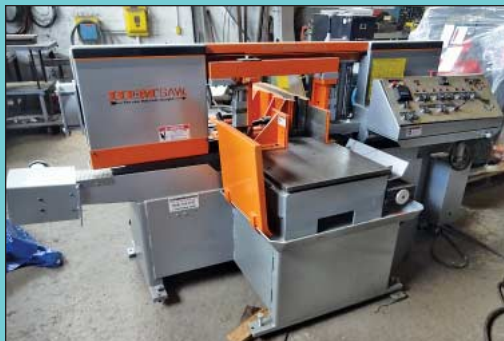
(50) Vertical & Horizontal Band Saws