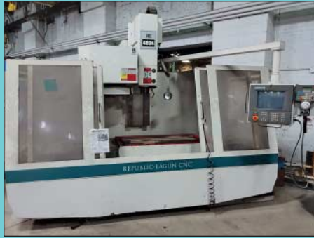
Republic Lagun Model 4824 CNC Vertical Machining Center