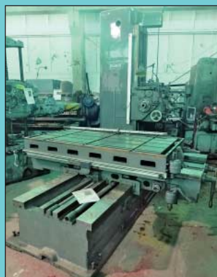
3-3/4" Cincinnati Gilbert Model T-350 Table Type Horizontal Boring Mill