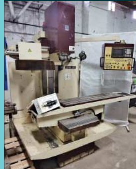
Chevalier Model 2040-MV CNC Vertical Machining Center