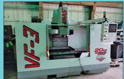
**Haas Model VF3 CNC Vertical Machining Center