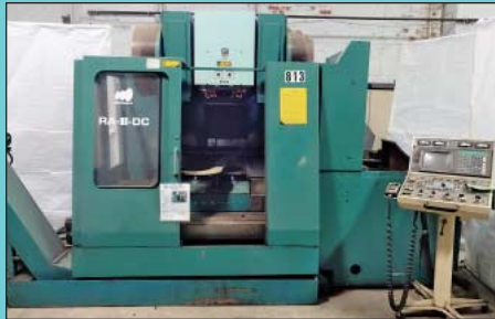
Matsuura Model RA-2-DC Twin-Spindle Two-Pallet CNC Vertical Machining Center