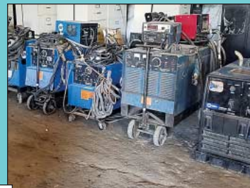
Large Inventory of Small Machinery