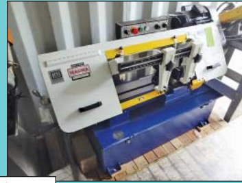
(45) Tilt Frame, Horizontal & Vertical Band Saws