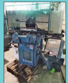
K.O. Lee Model SZ818-HS Slicing and Dicing CNC Surface Grinder