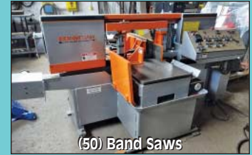
(50) Band Saws