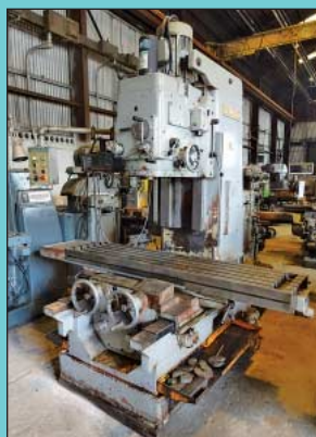
(15) Dial Type Vertical Milling Machines