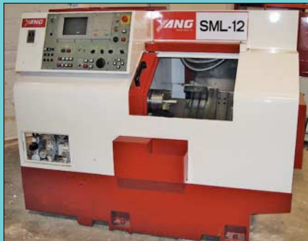
Yang Model SML-12 Gang Tool CNC Turning Center