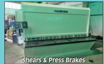
Shears & Press Brakes