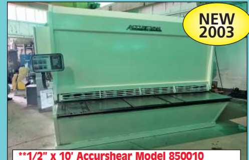
NEW 2003 **1/2" x 10' Accurshear Model 850010 Hydraulic Power Squaring Shear