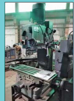
(30) Conventional Vertical Milling Machines by Bridgeport, Alliant, Supermax, Lagun, South Bend and Others from 1/2 HP to 3 HP

Complete Listing With Photos @ cia-auction.com