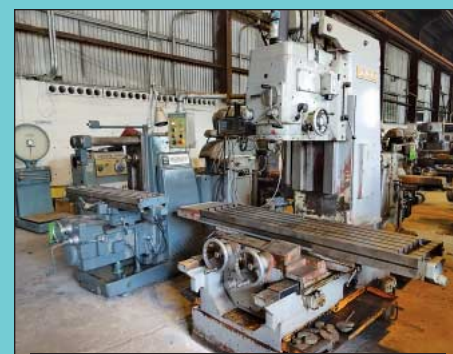
(35) Dial Type Vertical & Horizontal Mills