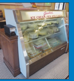
Numerous Various Style Display Coolers