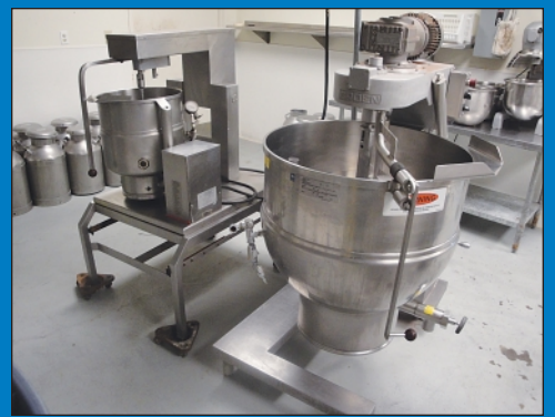
(2) Groen Electric Steam Jacketed Cookers/Mixers