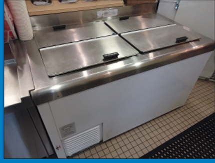
Approximately (40) Chest Type Freezer/Coolers