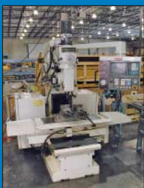
RBI Model CNC Vertical Milling Machine