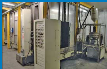
Complete Powder Coat Line With Goff Blast, ITW Gema Booths, HW Infra-Red Oven and 200' Oven/Cooling Chamber