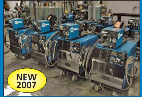
(12) 300 Amp Miller Model CP-302 Constant Voltage DC Arc Welders w/ 22A Wire Feeds