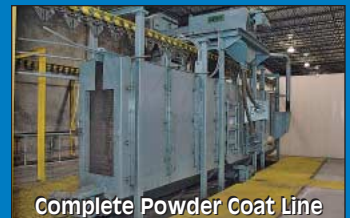
Complete Powder Coat Line