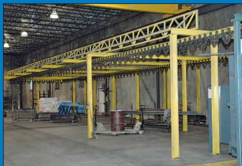
Approx. 1100' Floor Mounted Overhead Conveyor