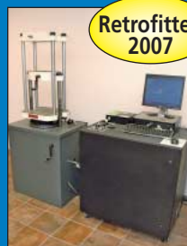
60,000 LB Tinius Olsen Model Super L Split Frame Tensile Tester