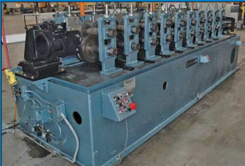
Complete Roll Form Line Tooled To Roll 3-3/4" Angle and U-Channel