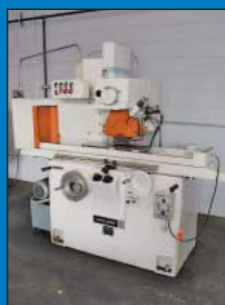
Thompson Model 2F 8" X 24" Hydraulic Feed Surface Grinder