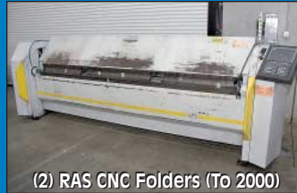
(2) RAS CNC Folders (To 2000)