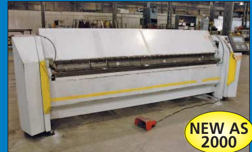
(2) 126" Ras Model 62.30 CNC Folders

Yoder 8-Stand Roll Former; S/N N/A, 9.5" Max Width, 15" Between Centers, 6.5" Adjustment, Small Curve Slat Approx. 2" (Rebuilt 2000's)