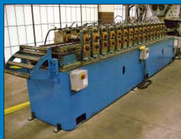
**Samco 16-Stand X 2" Arbor Precision Rollforming Machine **Located in Michigan