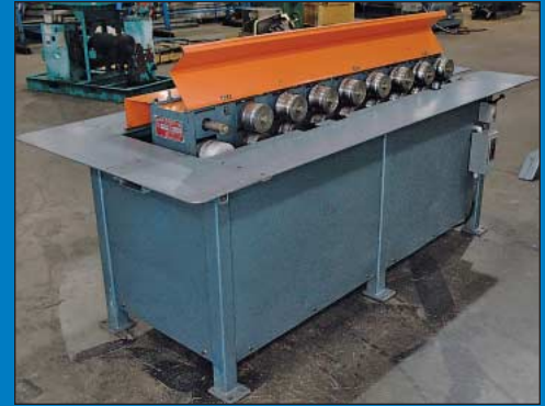
Clinton Model 9ST-SHT-CHAN 9-Stand Roll Former