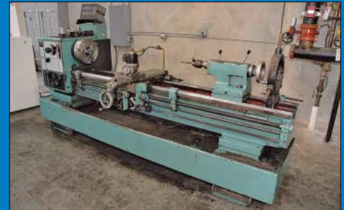
21" X 96" Harrison Model M500 Geared Head Engine Lathe

Large Quantity Shop Equipment Consisting of; Large Quantity Angle Grinders, Power Drills, Floor Drills, Dewalt Mitre Saws, Pallet Trucks, 2-Wheel Hand Trucks, Barrel Movers, (30) Sections Adjustable Beam Pallet Racks Up To 144" X 96" X 42", Various Sized Disassembled Adjustable Beam Pallet Rack, Large Quantity Miscellaneous Electrical Wiring, Gear Boxes, Electrical Enclosures, Electric Motors, Miscellaneous Hydraulic Fittings, Bearings, Oxy-Acetylene Torch Carts, (8) Portable Steel Frame Work Benches, Steel Frame Material, Handling Carts and Much More