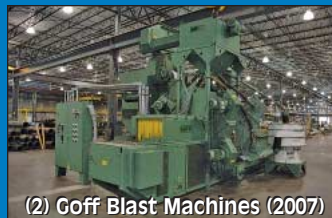
(2) Goff Blast Machines (2007)

2020 DUNLAP ST., CINCINNATI, OHIO 45214 PHONE (513) 241-9701 / FAX (513) 241-6760 WEBSITE: cia-auction.com