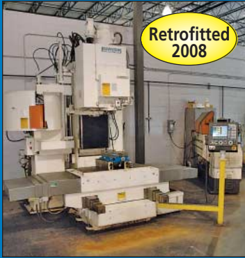
Cincinnati Milacron Model 10VC-1000 CNC Vertical Machining Center