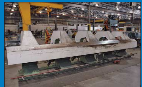
21' Jorns Model Maxi-Line-150-SO-6-4 CNC Folder

Other Items Consisting of; 50 HP Palatek Skid Mount Air Compressor, 10,000 Lb American Steel Line Uncoiler, 2,500 Lb Melon Uncoiler, 52" National Air Power Shear, Niagara A-35 Press, Niagara M45 Press, 5-Ton Benchmark Press, 40" Mattison Surface Grinder, 18" Uni-Tek Surface Grinder, MSC Gap Bed Lathe, MSC Milling Machine, (5) Miscellaneous Brand Generators, Round Curtain Window Punch Hydraulic Power, Lons Spot Welder, Aluminum Saw, Bewo Metal Saw, Vent Die Hydraulic Table, 36" X 20' Powered Belted Conveyor, (30) 42" X 42" Fans, Pittsburgh Seam (No Tooling), Clincher Floor Table, (5) Various Electric Hoists