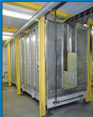
ITW Gema Stainless Steel Manual Pass-Thru Powder Coat Booth

Metal Form 16-Stand Roll Former; S/N N/A, 3" Shaft Diameter, 24" Between Centers, 36" Maximum Width, 25 - 30 HP Motor SEE PHOTO