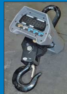
10,000 LB Cas Model STHB Digital Crane Scale