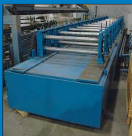
Metal Form 16-Stand Roll Former