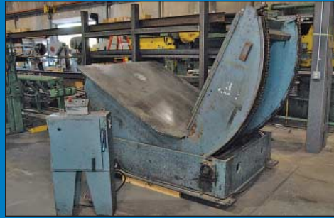
10,000 LB Manufacturer Unknown Hydraulic Coil Flipper w/ 5 HP Hydraulic Unit