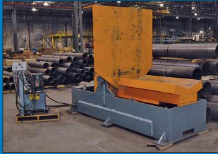
20,000 LB Capacity Dahlstrom Model CT20-60-60 Motorized Coil Flipper