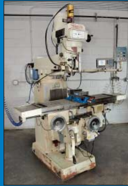
Hafco Model VS300 3 HP Variable Speed Vertical Milling Machine