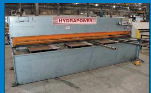
10 Ga. X 14' Hydrapower Model S01014SS Hydraulic Power Squaring Shear