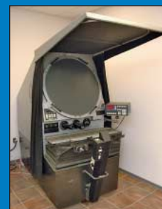
Scherr Tumico Model 22-2500 30" Optical Comparator