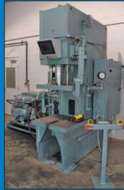
60 Ton PH Hydraulics Model OGF-60 PLC Controlled C-Frame Hydraulic Press