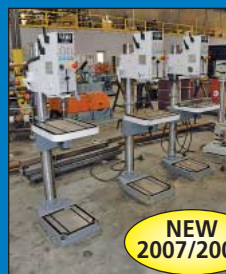
(3) Arboga Wilton Model A3008W 25" Geared-Head Floor-Type Drills