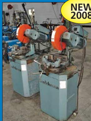
(5) Scotchman Model CLM350LT 14" Cold Saws