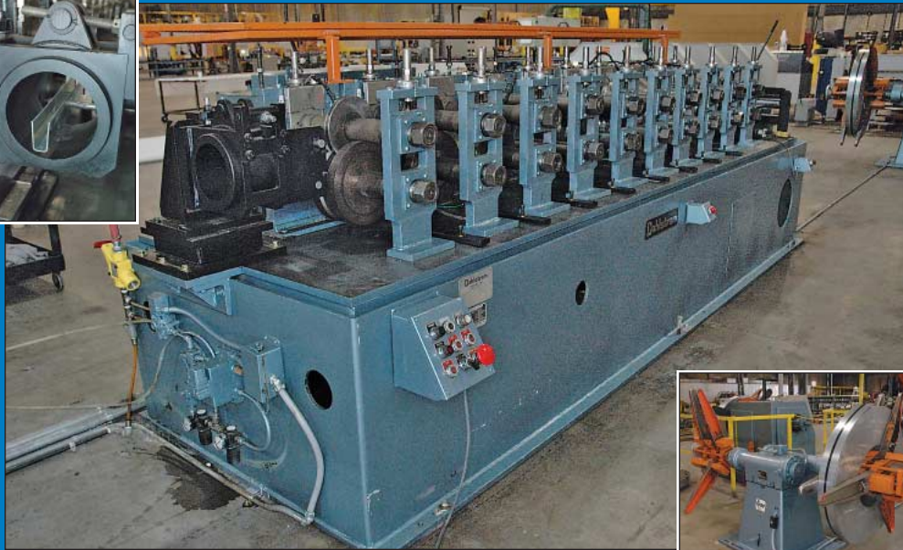
Complete Roll Form Line Tooling To Roll 3-3/4" Angle and U-Channel