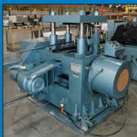
Dahlstrom Model 50TP Four Post Cut Off Press