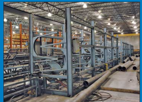
(3) Custom Designed & Fabricated Storage & Feed System for 6", 8" and 10" Dia. Pipe w/ PLC Controls