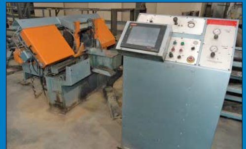
DoAll Model C-3300-NC CNC Horizontal Band Saw