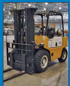
8,000 LB Yale Model GLP080LCNSBE088 Solid Pneumatic Tire LP Gas Lift Truck