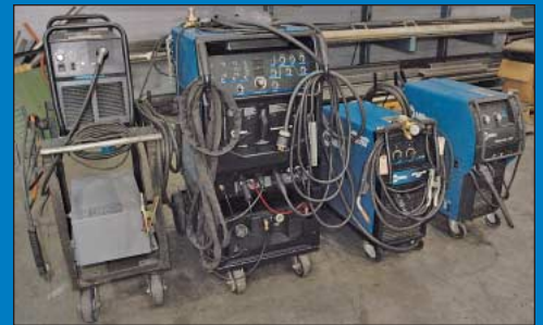
Other Late Model Miller Welding Equipment

15,000 LB Rival Crane Type Fork Lifting Attachment