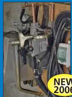
Lors Machinery Inc TE300 Model 3321A Hanging Spot Welder