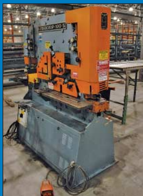
100 Ton Geka Model Hydracrop-100-S Hydraulic Power Ironworker