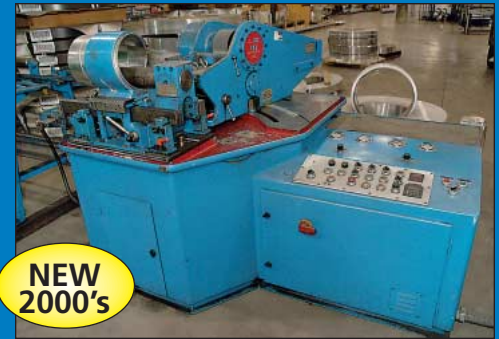
(2) Spiral Helix Model 200H Spiral Rolling Machines