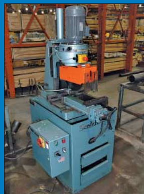
Scotchman Model CP0275LT 11" Cold Saw