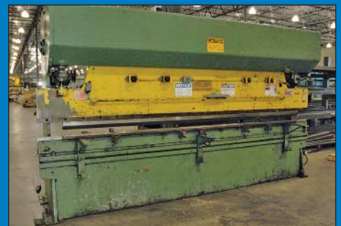
36/55 Ton X 14' D & K Model 1214-B Mechanical Power Press Brake