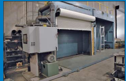
Custom Designed & Fabricated Garage Door Wind Test Chamber