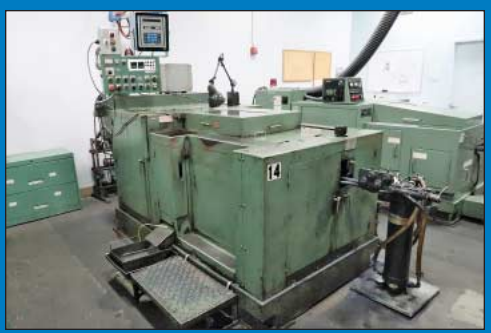
Asahi Okuma Model AOT-6XL High Speed Long Stroke 2-Die 2-Blow Cold Header