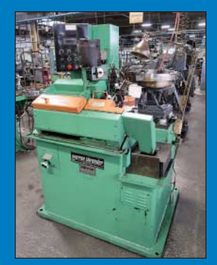
Warren Model WT-500 High Speed Flat Die Thread Roller