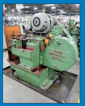
Waterbury Farrel Model 20 Horizontal Heavy Frame Hand Feed