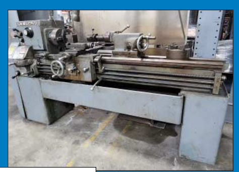
CNC and Toolroom Machinery, Swiss Lathes, Engine Lathes, Hardinge Lathes, Grinders