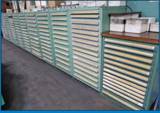
(75+) Vidmar / Lista Multi-Drawer Tooling Cabinets Loaded W/ Header Punches, Threader Dies, Tooling Accessories and Parts