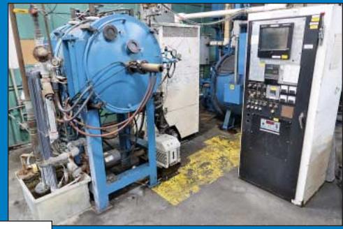
Heat Treat Department w/ Vacuum Furnaces to 60" x 82"