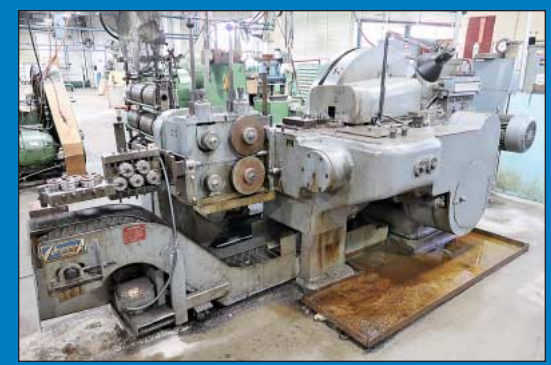
#52 Greenbat Model 4 DSOD Cold Header, 1/2" x 8"