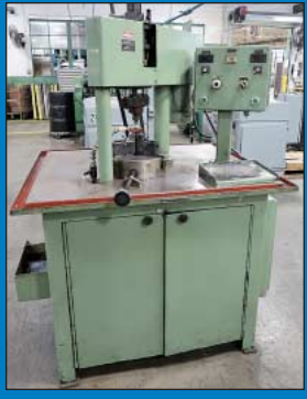
PC Engineering 3-Roll Fillet Roll