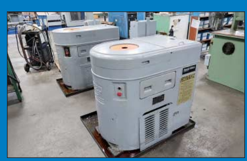
(2) Reed Model A22 3-Die Cylindrical Thread Rollers