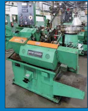
(2) Warren Model WT-1500 High Speed Flat Die Thread