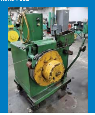
(20) Wire Drawers by RMG, FE and Others from 1/8" thru 1/4" Capacity