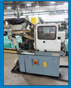
Traub Model TD-26 Single Spindle Automatic Lathe