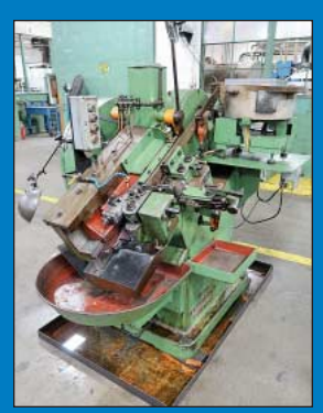
Waterbury Farrel Model 10 Flat Die Thread Roller