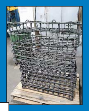
Parts Washing / Finishing Department, Tempering Line, Induction Heaters, Inconel Baskets