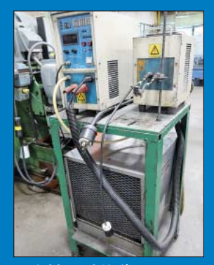
Portable and Stationary Induction Heat Systems