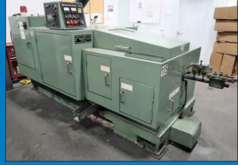
Nakashimada Model NP-60 2-Die 3-Blow Cold Header

(75+) Vidmar / Lista Multi-Drawer Tooling Cabinets Loaded w/ Header Punches, Threader Dies, Tooling, Accessories and Parts; Large Quantity of Inspection Items and Toolroom Accessories in Vidmars