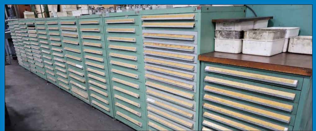
(75+) Vidmar / Lista Multi-Drawer Tooling Cabinets Loaded w/ Header Punches, Threader Dies, Tooling Accessories and Parts