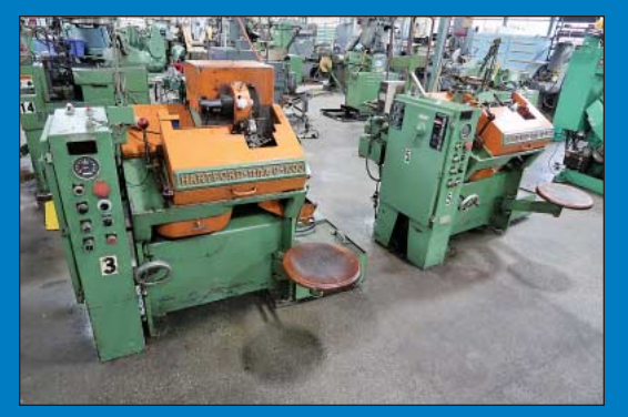
(2) Hartford Model 000-1000 High Speed Flat Die Thread Rollers