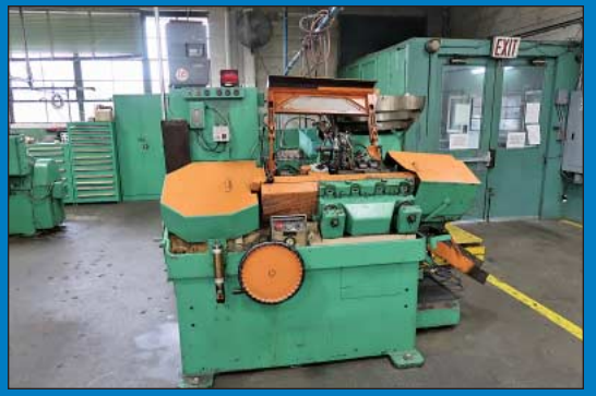
Harford Model 20-225 High Speed Flat Die Thread Roller