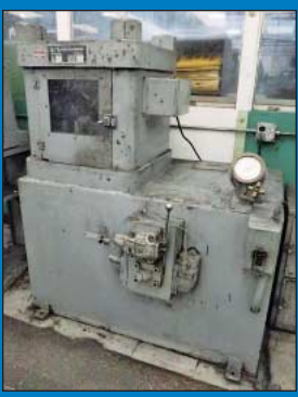
200 Ton Modern Model 1A200 Hydraulic Hobbing Press