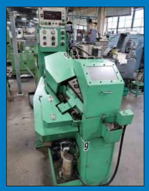
Kyoei Model SRO High Speed Flat Die Thread Roller