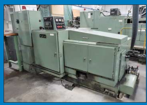
Asahi Okuma Model AOT-6XL High Speed Long Stroke 2-Die 2-Blow Cold Header