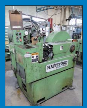
Hartford 5-700 and 6-600 Pinch Pointers