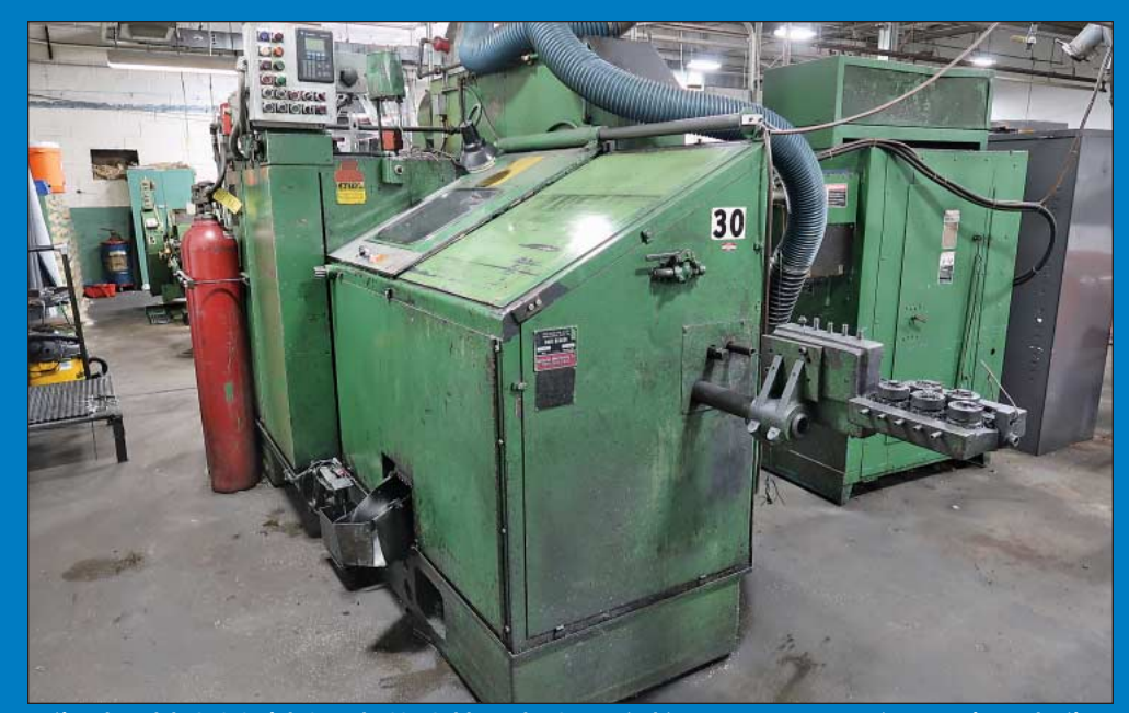
National Model 56HSLS High Speed DSSD Cold Header Converted to Run Aerospace Fasteners Using Induction Heat

Length, 3/8" PKO Stroke, 220 PPM, Equipped w/ Bushing Cutoff, Face of Die Stripper, Impax Process Monitor