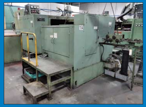
Nakashimada Model TH4-8A 4-Die Cold Header