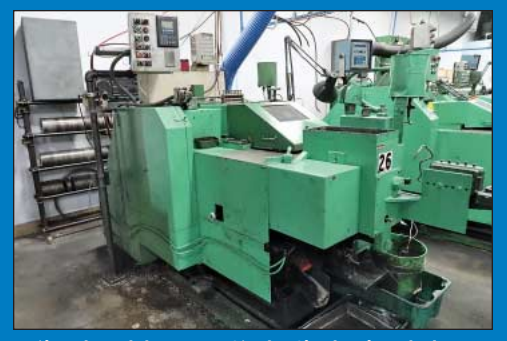
National Model 45 Long Stroke Single Die Tubular Rivet Header