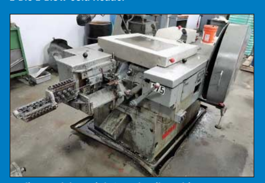
Wafios Model N5 High Speed Nail Machine