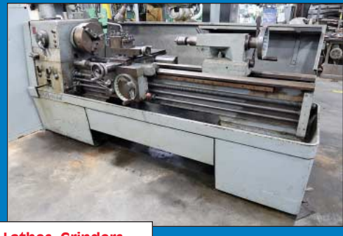
CNC and Toolroom Machinery, Swiss Lathes, Engine Lathes, Hardinge Lathes, Grinders