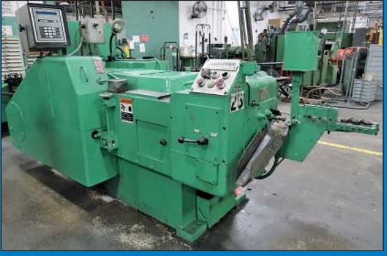
Hartford Model 3-500 High Speed Single Stroke Solid Die Long Stroke Cold Header