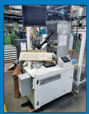
Laser General Model V-100 Versatile Measuring Machine