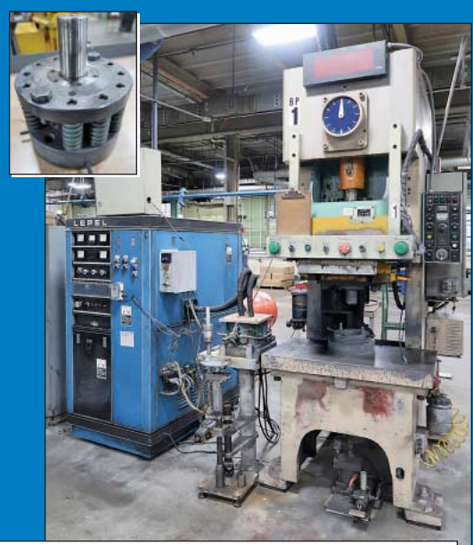
88-Ton & 66-Ton Seyi Clearing Presses Converted to Forge 12-Point Aircraft Engine Bolts