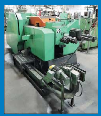
Asahi Okuma Model ORH-80 2-Die 3-Blow Cold Header