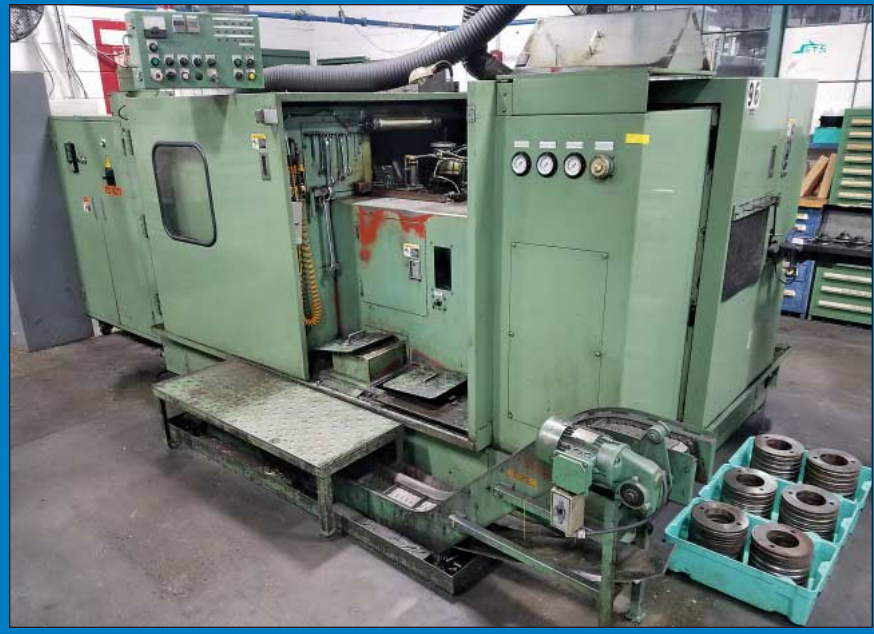
Asahi Sunac Model RH-80 2-Die 3-Blow Cold Header