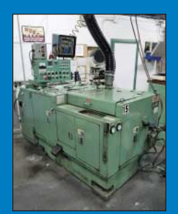
Asahi Sunac Model AT-425 High Speed 2-Die 2-Blow Cold Header