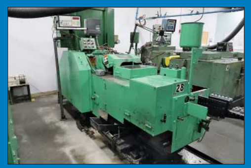
National Model 45 Long Stroke DSSD Cold Header