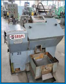
Saspi Model MPA-100 High Speed Shave Pointer