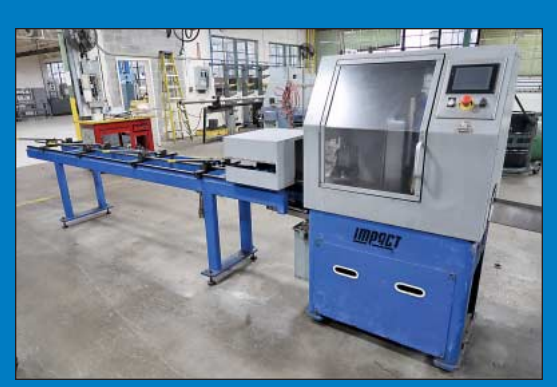
Soling PHF Model ASM-04 Abrasive Cutoff