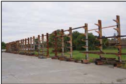
(9) Sections Adjustable Cantilever Rack