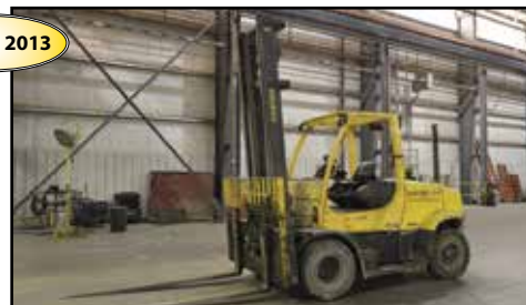
(11) YALE, HYSTER, LINDE & NISSAN Forklifts to 30,000-lb. Capacity, New as 2013