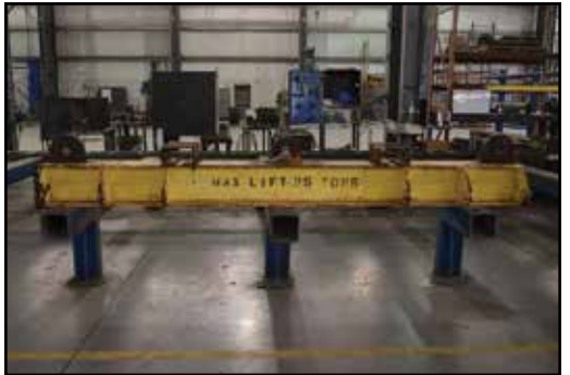
25-Ton Spreader Bar