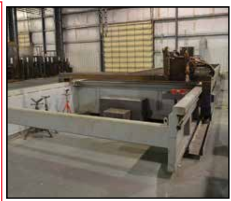
2008 AKS Accu-Kut 140"x50' CNC Burning Table