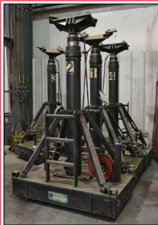
LIFT SYSTEMS INC. 2000/4160 4-Point Gantry Lift System