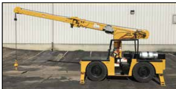
(2) GROVE Carry Deck Jib Cranes to 5-Ton Capacity