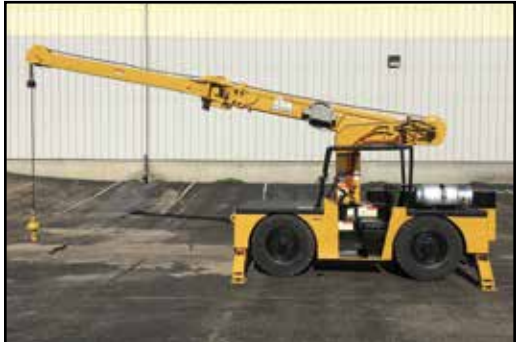
GROVE IND-24 5-Ton Carry Deck Jib Crane