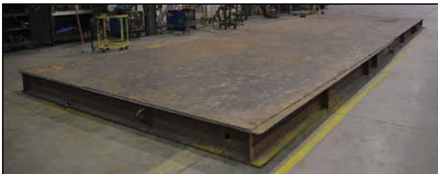
(4) Steel Layout Tables, Large as 14' x 38' x 16"