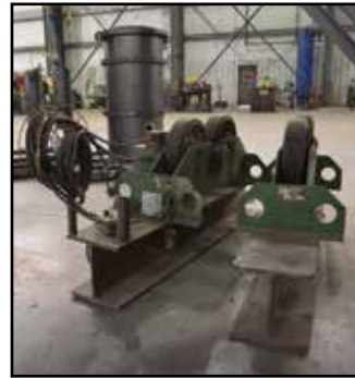
CWI Power Roll Set