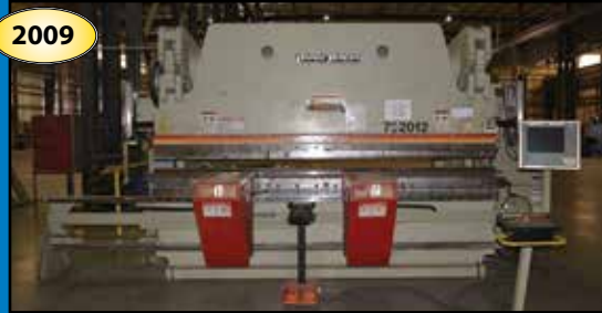
2009 ACCURPRESS 732012 320-Ton x 12' Hydraulic Press Brake