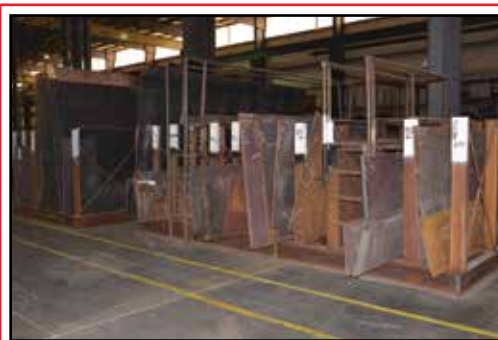
Steel Racks w/Raw Material & Plate Steel, up to 8' x 15' x 1/8" - 3/4"