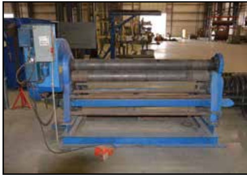
LOWN Plate Roll Machine