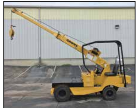
GROVE 4,000-lb. Carry Deck Jib Crane