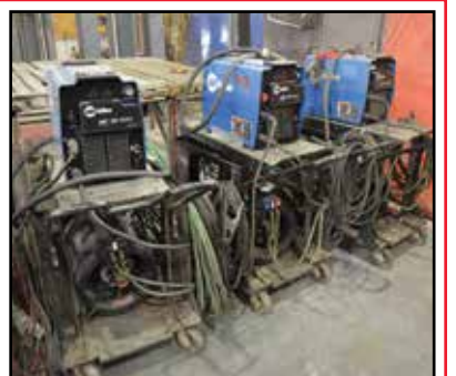
(30+) MILLER Deltaweld & Millermatic Welders