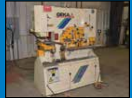
2008 GEKA 110/A Hydra Crop Ironworker