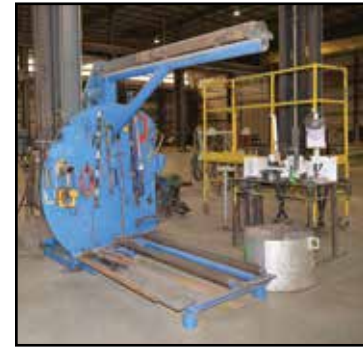
Custom Power Coil Roller