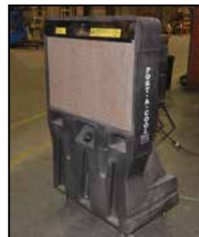
PORT-A-COOL Portable A/C Unit