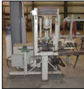
Custom Forming Machine