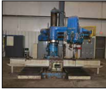
CARLTON 5' x 15" Radial Arm Drill