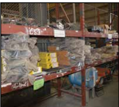
New Welding Wire Inventory