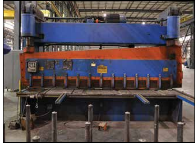
CINCINNATI 5FL12 5/8" x 12' Hydraulic Squaring Shear