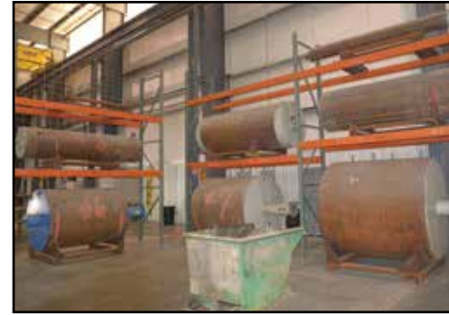
(7) Drums for Roll Machine