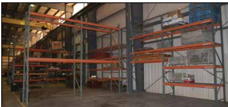
(10+) Sections Pallet Racking