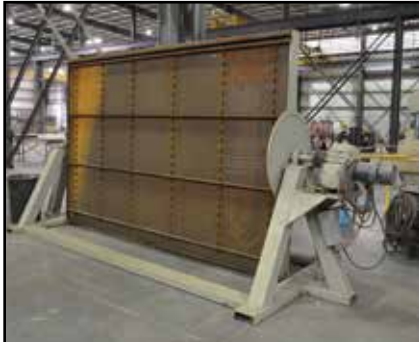
SNR Power Rotating Welding Position Table