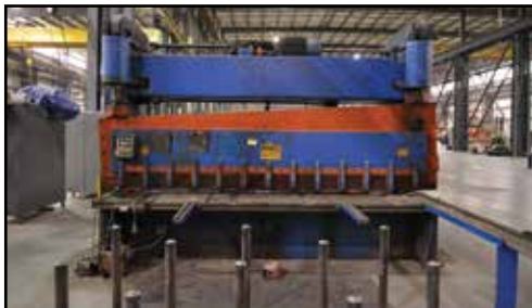
CINCINNATI 5FL12 5/8" x 12' Hydraulic Squaring Shear