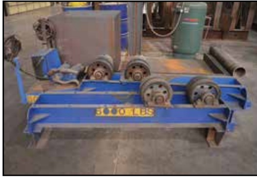
WEBB 6,000-lb. Power Rolls w/Idler & Control