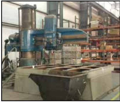
CARLTON 8' x 22" Radial Arm Drill