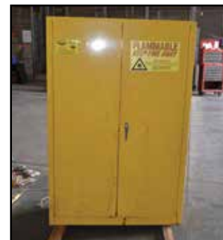
(8) Various Size Flammable Cabinets