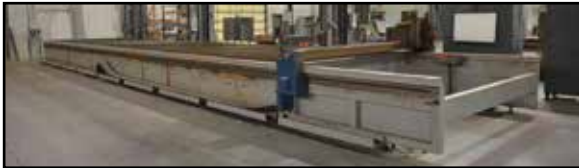
2008 AKS Accu-Kut CNC Burning Table

INSPECTION: Day Prior to Auction from 9:00 AM - 4:00 PM