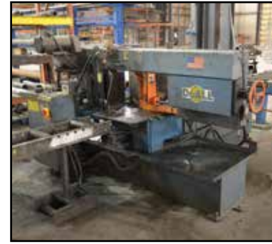
DOALL 500 SNC Horizontal Band Saw