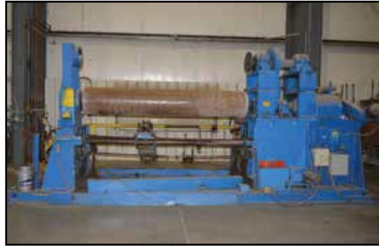
Custom Spiral Drum Roll Machine