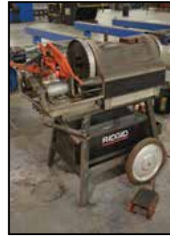
RIDGID 1224 Pipe Threader