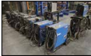
(11) Forklifts to 30,000-lb. Capacity (30+) MILLER Welders

Myron Bowling Auctioneers Inc. P.O. Box 369 ROSS, OHIO 45061