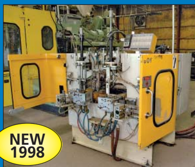
Akei Model Smart Boy SB-40-TS-DH-PVC Continuous Extrusion Blow Molder

Sleeve Co Model SL-1800 Label Applicator