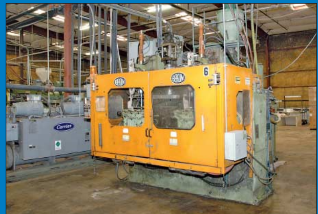
Bekum Model H-202/S103 Continuous Extrusion Blow Molder