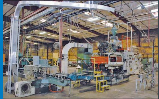
Uniloy Model 2015 Reciprocating Screw Blow Molder