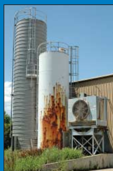
12' X 48' Lipp Spiral Aluminum and 10' X 32' Schuld Welded Steel Bins