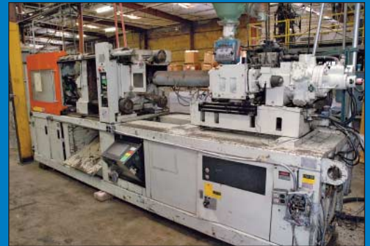
180 Ton X 12 OZ Niigata Type NN180UH Hypershot 3000 Toggle Clamp Plastic Injection Molding Machine