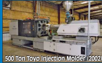
500 Ton Toyo Injection Molder (2002)