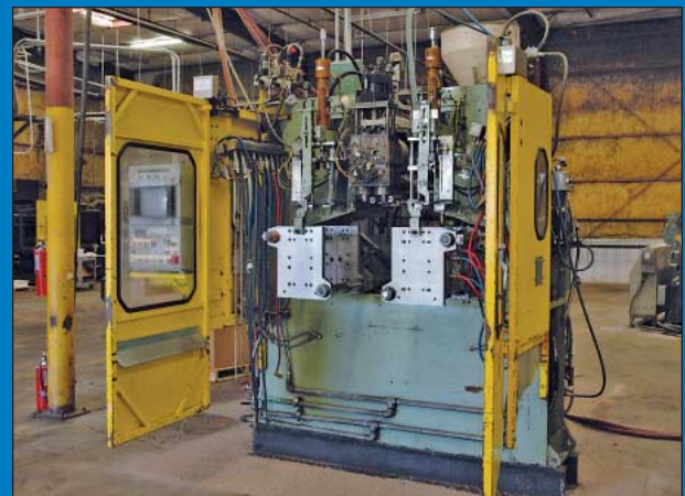
Bekum Model H-121 Continuous Extrusion Blow Molder

Large Quantity Various Blow Molder Parts and Accessories Consisting of; (5) Propane Flame Treat Units, (1) Four-Head Blow Molder Attachment for Bekum Machines, Uniloy Pick and Place Attachment, (2) Uniloy Knife Trimming Attachments, (2) Uniloy Bench Type Trimmers, Sterling Blow Molder Head Rings, Nozzles, Electric and Hydraulic Repair Parts and Many Other Related Items