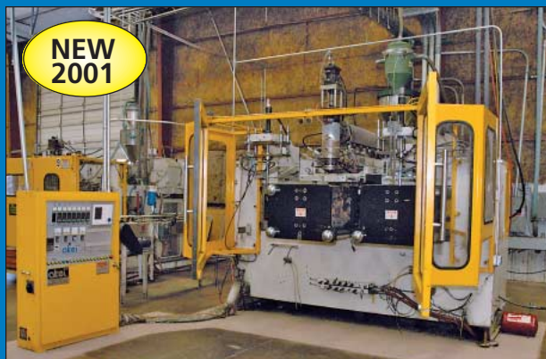
Akei Model A090-NL-TS-DH-PE-PP Continuous Extrusion Blow Molder