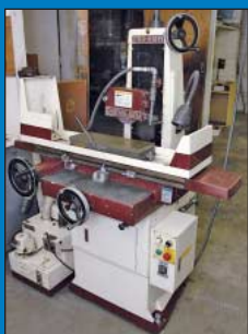
6" X 18" Chevalier Model FSG-618M Surface Grinder