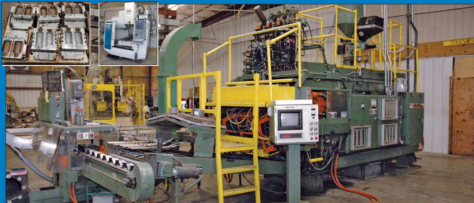
Uniloy Model 350-R3 Four-Head Reciprocating Screw Blow Molder

INSPECTION: WEDNESDAY, JUNE 13TH, FROM 10:00 AM TO 4:00 PM