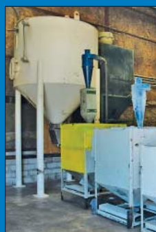
Partial View Various Material Storage Bins