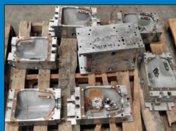
Approx (125) Various Size and Style Bottle Blow Molds