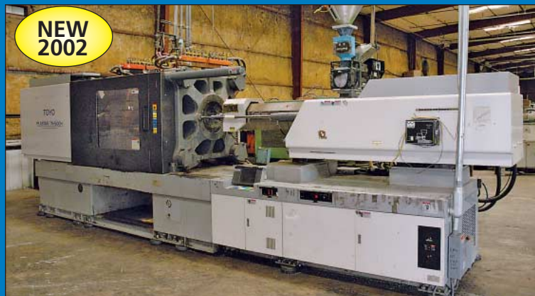
500 Ton X 67.9 Oz. Toyo Model TM-500H Plaster Toggle Clamp Plastic Injection Molding Machine