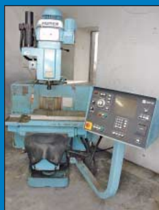
Hurco CNC Vertical Milling Machine