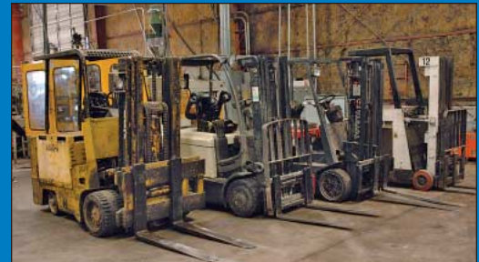
Overall View (4) Various Style Electric Lift Trucks