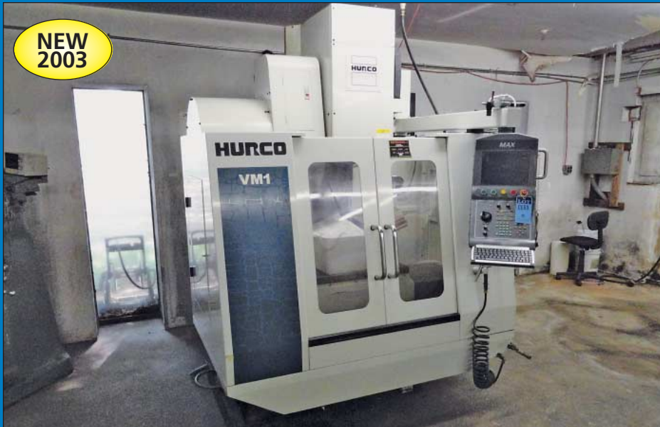
Hurco Model VM1 CNC Vertical Machining Center