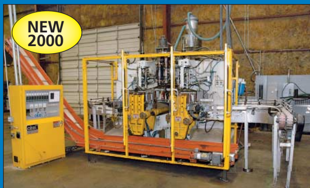
Akei Model A070-SNL-TS-DH-PP-PE Continuous Extrusion Blow Molder