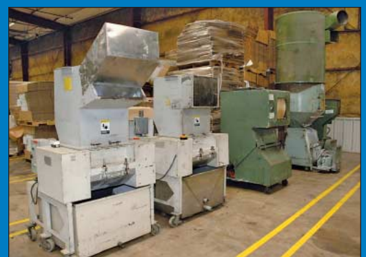
Partial View (4 of 13) Plastic Granulators To 14" X 18" and 30 HP