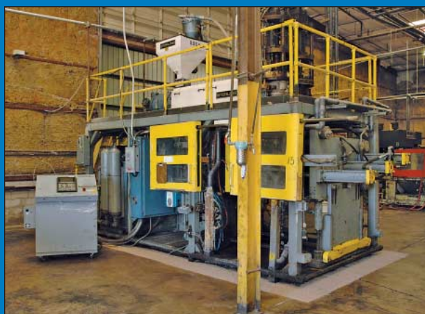
Sterling Dual 5 Lb. or 8 Lb. (Est.) Accumulator Head Blow Molder