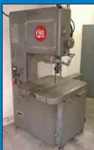
18" Grob Model 4V-18 Vertical Band Saw