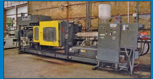
500 Ton X 60 Oz. Van Dorn Model 500 HRS-60F Hydraulic Clamp Plastic Injection Molding Machine