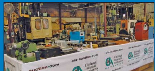
Partial View Small Tools