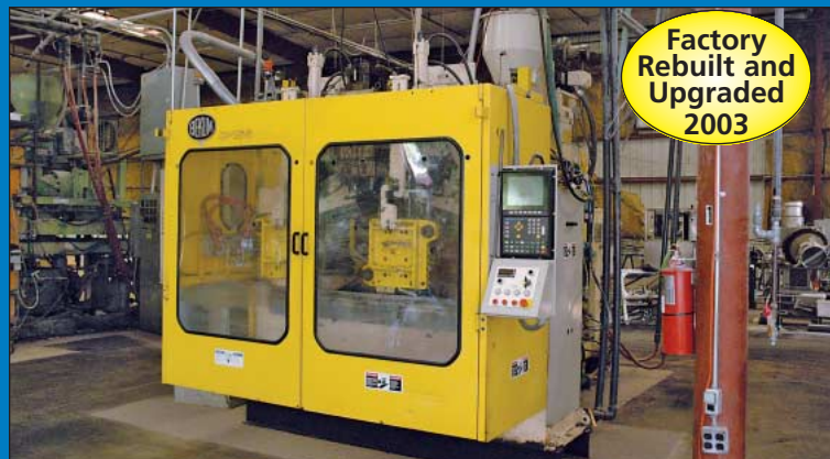
(4) Bekum Blow Molders Including Model H151, H121, and H202