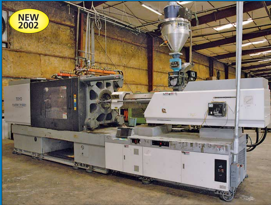
500 Ton X 67.9 Oz. Toyo Model TM-500H Plaster Toggle Clamp Plastic Injection Molding Machine