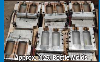
Approx. (125) Bottle Molds