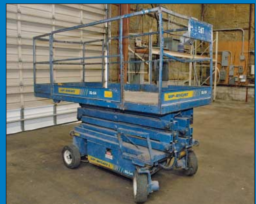
Up-Right Model 61950 XL-24 Electric Scissor Lift