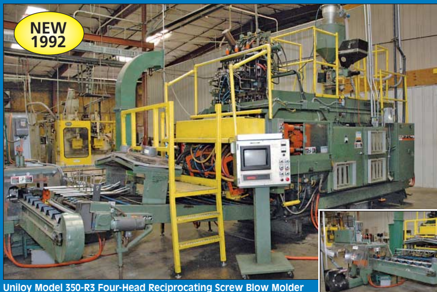
Uniloy Model 350-R3 Four-Head Reciprocating Screw Blow Molder