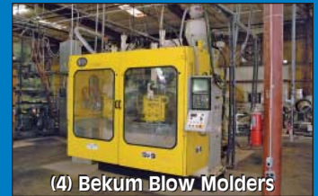
(4) Bekum Blow Molders