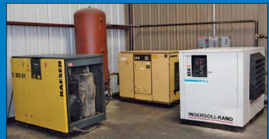
Overall View Air Compressor System