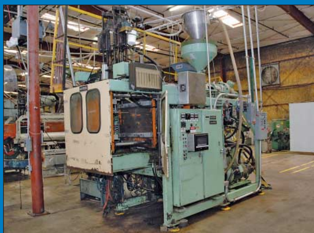
Hayssen Econablow Model 7540-BD-375 Accumulator Head Blow Molder