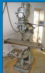
1-1/2 HP Bridgeport Variable Speed Vertical Mill