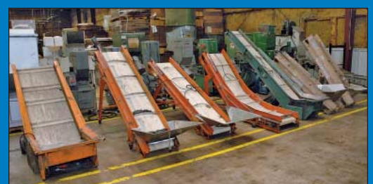
Partial View Rubber Belt Incline Conveyors