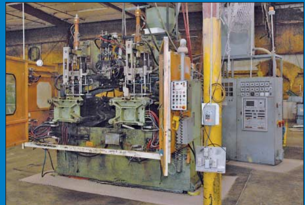
Bekum Model H-202/S103 Continuous Extrusion Blow Molder