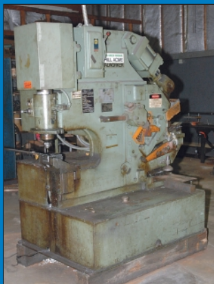
Hill Acme No. 4 Mechanical Ironworker

INSPECTION: Monday, May 24th from 10:00 AM to 4:00 PM