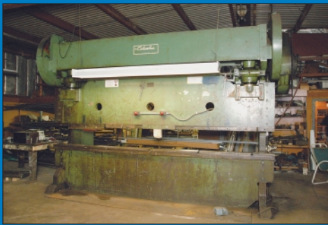
180 Ton X 14' Columbia Model 180PB12 Mechanical Press Brake