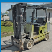
5,000 LB Clark Model GCS25MB LP Gas Cushion Tire Lift Truck

Large Quantity Assorted Shop Equipment Consisting of; Hougren Mag Base Drill, Foley-Relsaw Blade Sharpener, Electric Angle Grinders & Drills, Pneumatic Hand Tools, Wrenches, Sockets, C-Clamps, Other Hand Tools, Bench Model Skil Saw, Enerpac Hand Pumps, Hold Down Straps, McCulloch Chain Saws, Benches, Cabinets, Shelving & Many Other Related Items