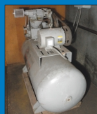
10 HP Ingersoll Rand Model T30 Two-Stage Horizontal Tank Air Compressor