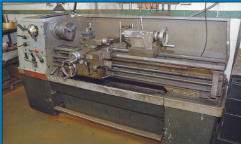
15' X 48' Clausing Colchester Geared Head Engine Lathe