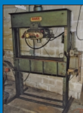
75 Ton Dake Model 6-275 Hydraulic H-Frame Shop Press