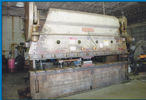
90 Ton X 14' Cincinnati Model 90-12 Mechanical Press Brake