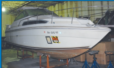
1982 Sea Ray 26' Express Boat