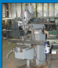
1-1/2 HP Bridgeport Variable Speed Vertical Mill