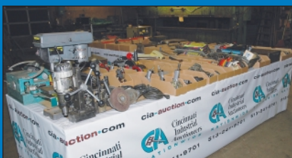
Partial View Table Lots Including: Machine Accessories, Tooling, Power Hand Tools