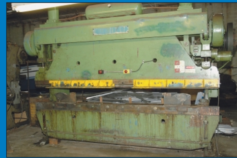
60 Ton X 12' Wysong Model 6510 Mechanical Press Brake