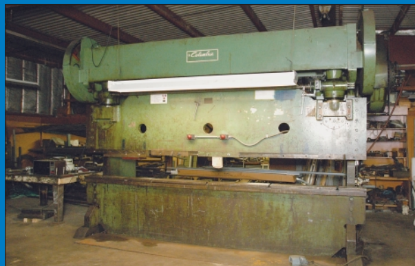
180 Ton X 14' Columbia Model 180PB12 Mechanical Press Brake

DIRECTIONS: From I-80 North of Youngstown, Proceed South on I-680 Approx. 1 Mile to Exit No. 2 Meridian Road. Proceed West on Meridian 1 Block to Leharps Road, Turn Right & Proceed 1 Block to Sale Site on Left. Watch for Auction Parking & Entrance Signs.