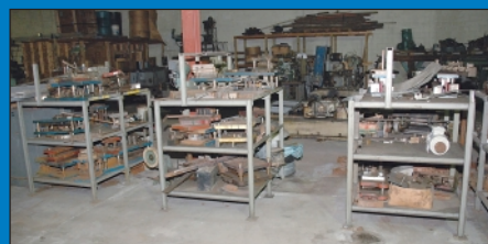
(75) Pieces (Approx.) Machine Tools In Various Conditions Held In Storage at Auction Location