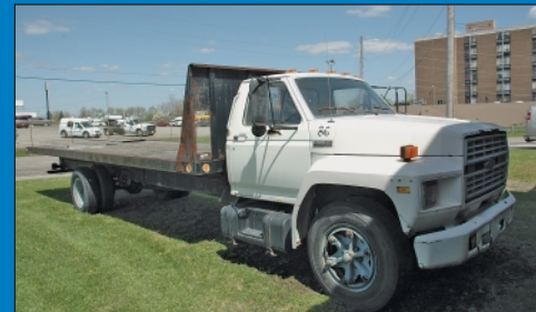
Ford F-600 Single Axle 24' Straight Truck