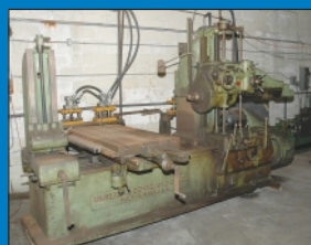
Universal Boring Machine Horizontal Boring Mill