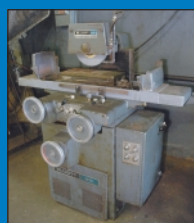
8" X 20" Elliott Model 921 Surface Grinder