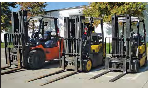
Partial View Late Model Lift Trucks Up to 9,000 LB