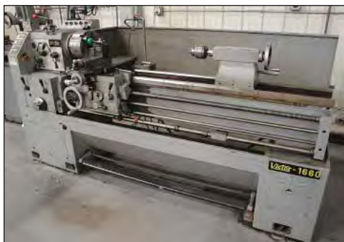
16" / 26" X 60" Victor Model 1660 Gap Bed Geared Head Engine Lathe