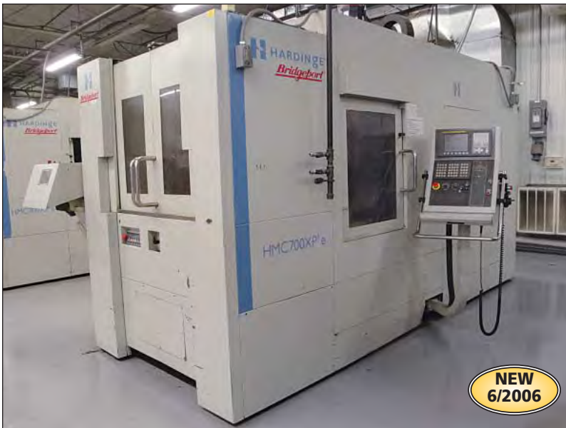
(2) Bridgeport Model HMC700XP3E Two-Pallet CNC Horizontal Machining Centers