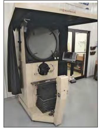
20" Scherr Tumico Industries Model 20-2450 Optical Comparator

14" / 24" X 40" Jet Model 1440-3PGH Gap Bed Geared Head Engine Lathe; S/N 6099B12-6, 12-Spindle Speeds: 40-1600 RPM, Inch & Metric Threading, Chasing Dial, 3-1/4" Spindle Bore, 9" 3-Jaw, 12" 4-Jaw, Foot Bar, Push Button, Coolant, Ship Pan, Acu-Rite DRO