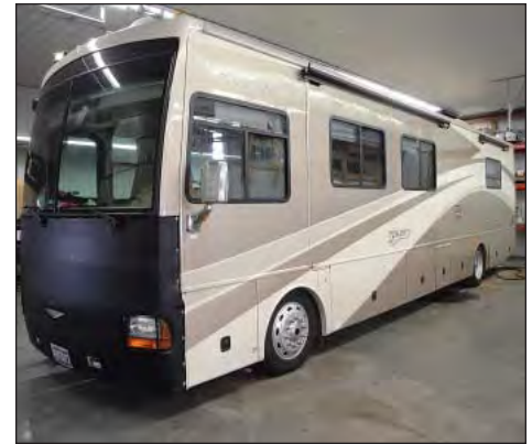
**2006 Fleetwood Discovery Model S Motor Home