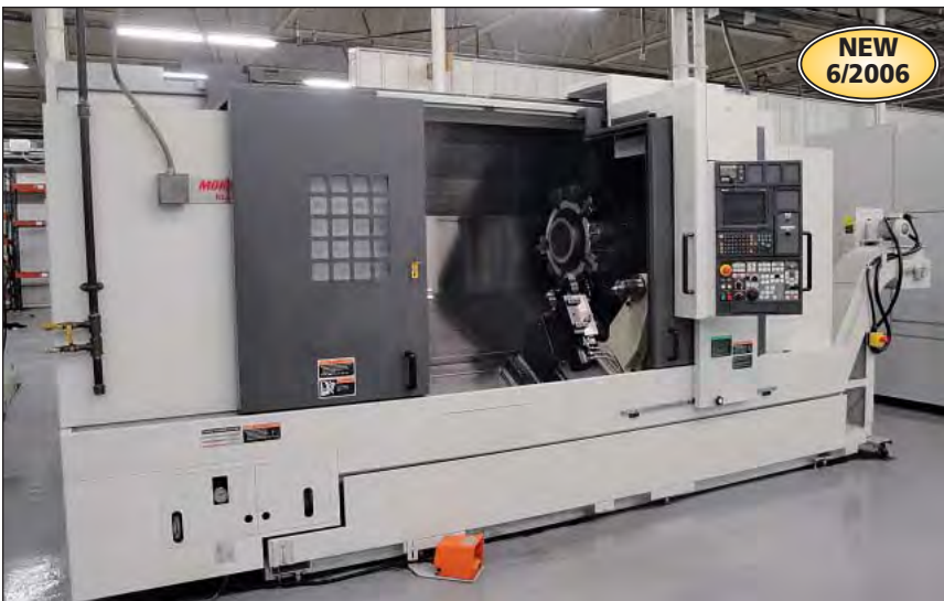
Mori Seiki Model NL-3000Y / 1250 Four-Axis CNC Turning / Milling Center