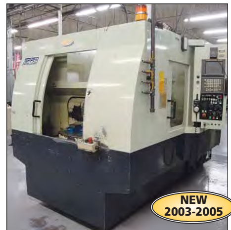
(2) Tongtai Topper Model TMV-510.APC Two-Pallet CNC Vertical Machining Centers