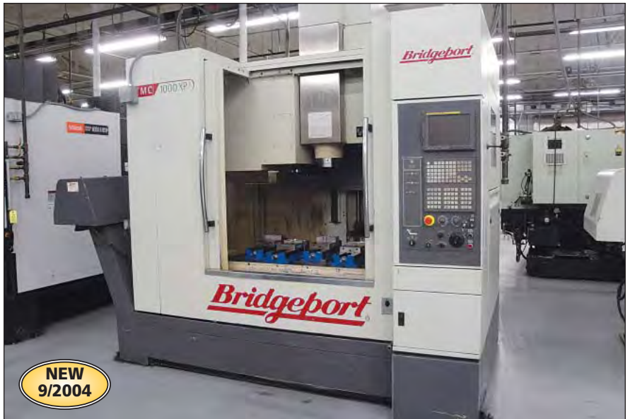
(2) Bridgeport Model XP3-1000 Three-Axis CNC Vertical Machining Centers