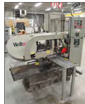
12" X 12" Wellsaw Model 1270A Automatic Horizontal Band Saw