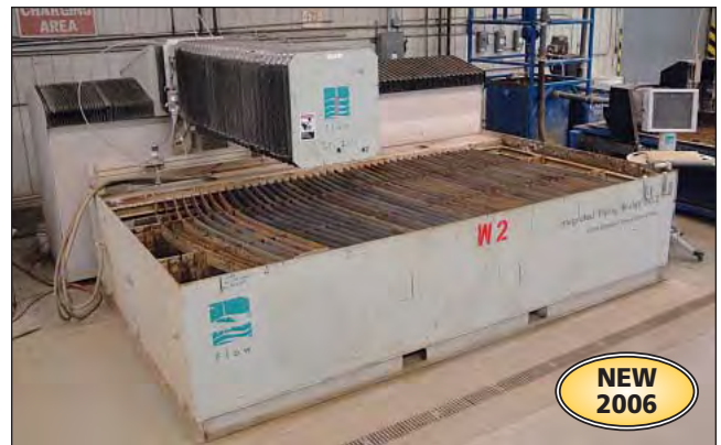
Flow Model 6012 Integrated Flying Bridge CNC Water Jet Cutting Table

Flow Model 6012 Integrated Flying Bridge CNC Water Jet Cutting Table; S/N 366610, Flow Control, 7' X 13' Overall Table Area, 72" X-Axis, 144" Y-Axis, 8" Z-Axis, Flow Sand Tank Unit, 100 HP Flow Pump & Motor System, 60K PSI (New 2006) SEE PHOTO