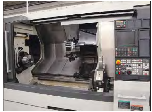
Inside View Mori Seiki NL-300Y / 3000