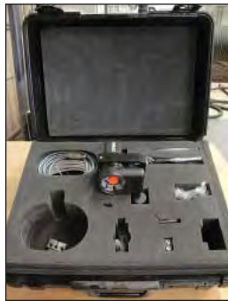
Close Up View Omax Components