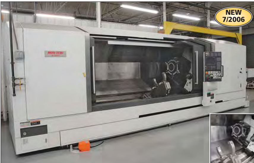
Mori Seiki Model NL-3000MC / 3000 Three-Axis CNC Turning / Milling Center

Mori Seiki CNC Lathe Tooling Consisting of; (5) WTO Right Angle Live Tool Holders, (7) WTO Straight Shank Live Tool Holders, Numerous Heavy Duty Standard I.D. & O.D. Turret Tool Blocks, Large and Standard Indexable Boring Bars to 3" Dia. & 2' Long, Large Spade Drills to 3" Dia. & 2' Long Chuck Jaws, Coolant Feed Indexable Drills, Various Die Spindle Tubes and Many Other Related Items