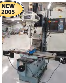
SWI Trak Model DMP52 Three-Axis CNC Bed Type Vertical Milling Machine