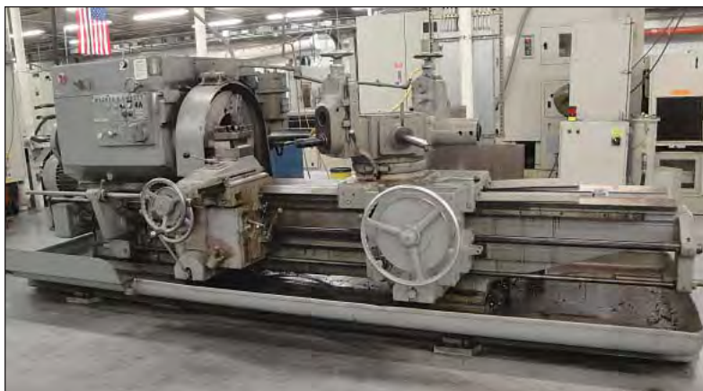
Warner & Swasey No. 4A Universal Saddle Type Square Head Turret Lathe