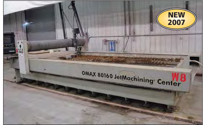
(2) Omax Model 80160 CNC Water Jet Cutting Tables