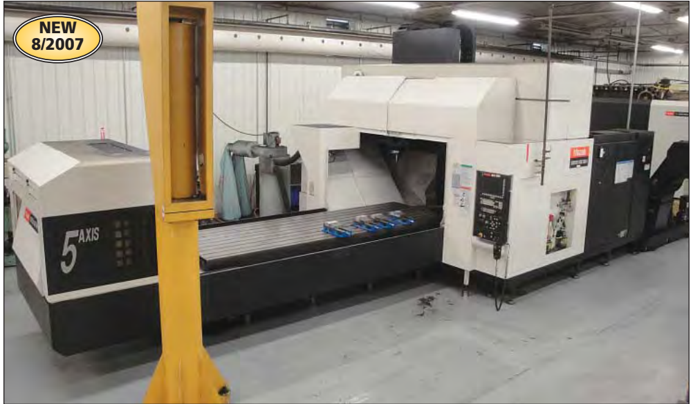
Mazak Model Vortex 1400/160-II Five-Axis CNC Bridge Mill