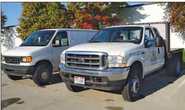
Partial View of Late Model Ford Vehicles