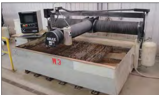
(4) Omax Model 55100 CNC Water Jet Cutting Tables