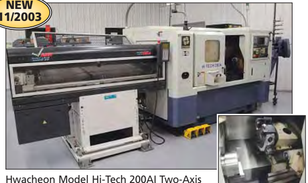
Hwacheon Model Hi-Tech 200AI Two-Axis CNC Turning Center