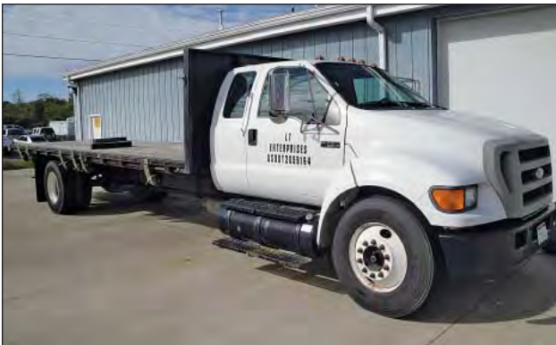
2003 Ford F-650 Super Duty Single Axle 24' Stake Bed Truck