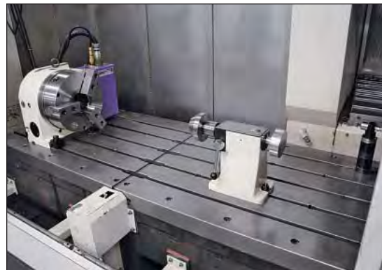
Kitagawa Tecnara Model MR320RAE06 4th-Axis Rotary Table