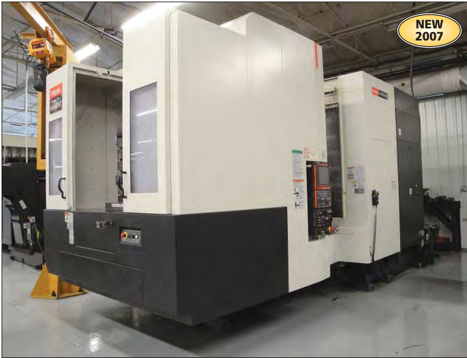
Mazak Model Nexus HCN-6800II Two-Pallet CNC Horizontal Machining Center