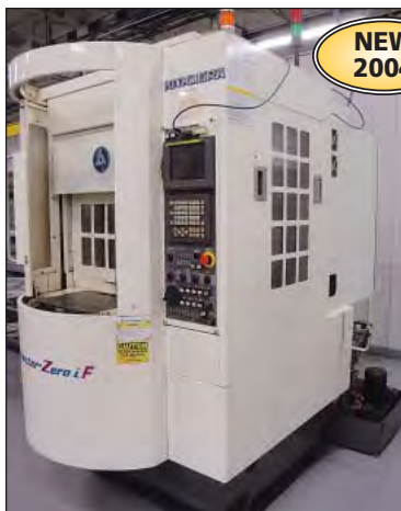
Kitamura Model Mycenter (Zero) OiF Sparkchanger Two-Pallet CNC Vertical Machining Center

No Last Minute Registrations will be accepted. Make Sure to Register & Post Your Deposit No Later than 48-Hours Prior to the Start of the Auction.