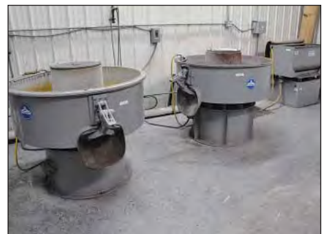
Bank View of Vibratory Finishing Tubs By Sweco and Mr. Debur