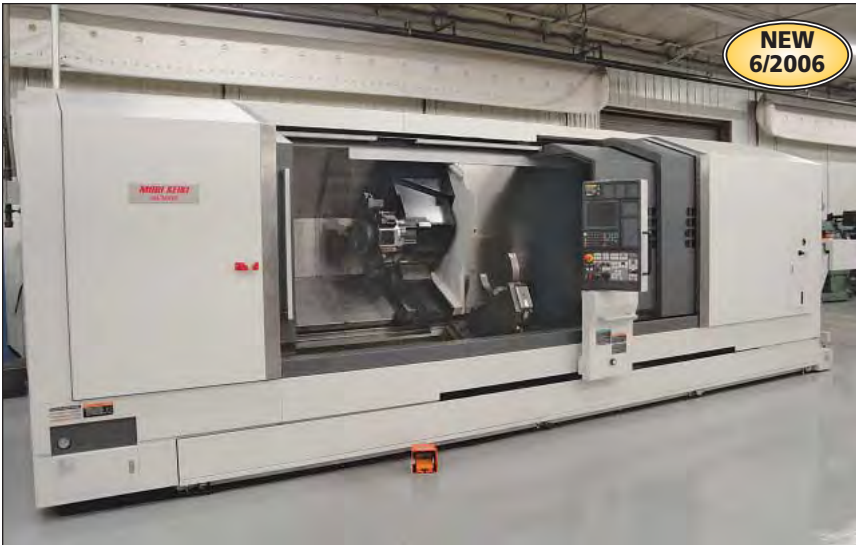
Mori Seiki Model NL-3000Y / 3000 Four-Axis CNC Turning / Milling Center