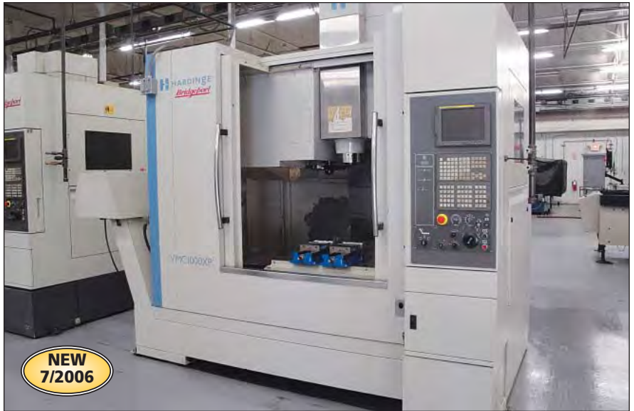
Hardinge Bridgeport Model VMC-1000XP3 Three-Axis CNC Vertical Machining Center