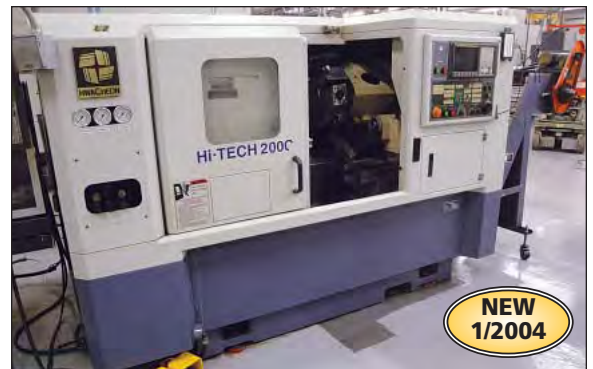
Hwacheon Model Hi-Tech 200CI Three-Axis CNC Turning / Milling Center