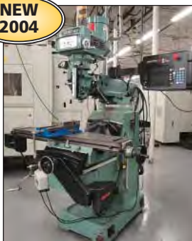
(2) SWI Trak Model K3 Edge Two-Axis CNC Vertical Milling Machines