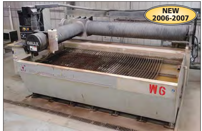
(4) Omax Model 55100 CNC Water Jet Cutting Tables