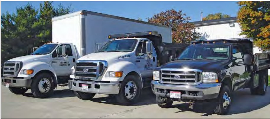
Partial View of Late Model Vehicle Fleet