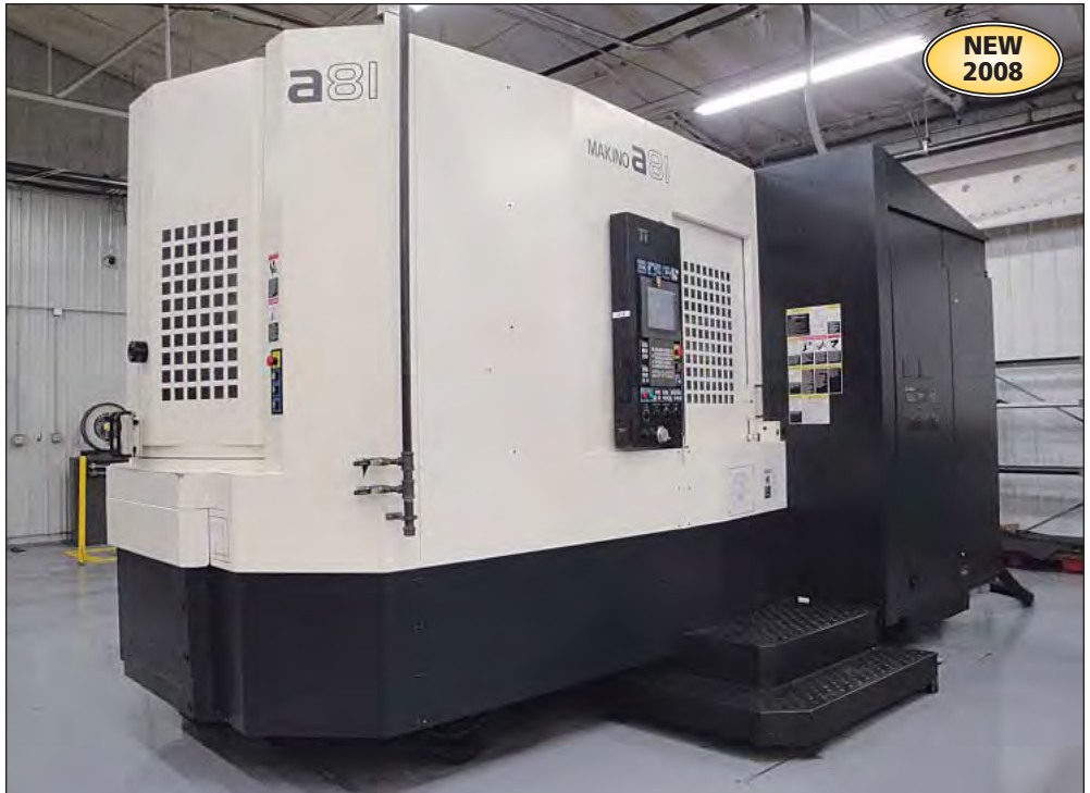
Makino Model A81 Two-Pallet CNC Horizontal Machining Center