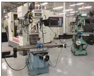
Partial View (2) of (4) Trak Two-Axis Vertical Milling Machines