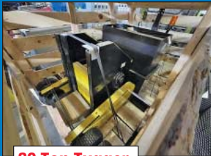
80 Ton Tugger