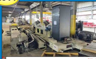
20' x 20' Pandjiris Manipulator w/ Mobile Base