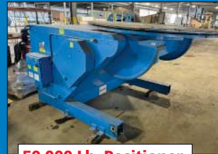
50,000 Lb. Positioner