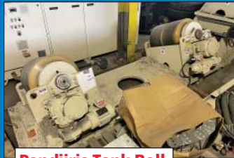
Pandjiris Tank Roll