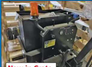
New in Crate