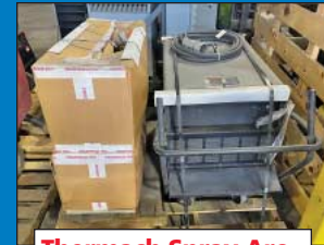
Thermach Spray Arc