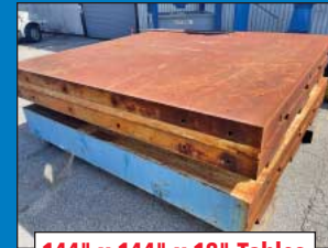
144" x 144" x 18" Tables