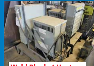
Weld Blanket Heaters