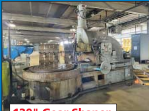
120" Gear Shaper