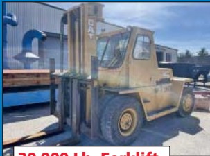
30,000 Lb. Forklift