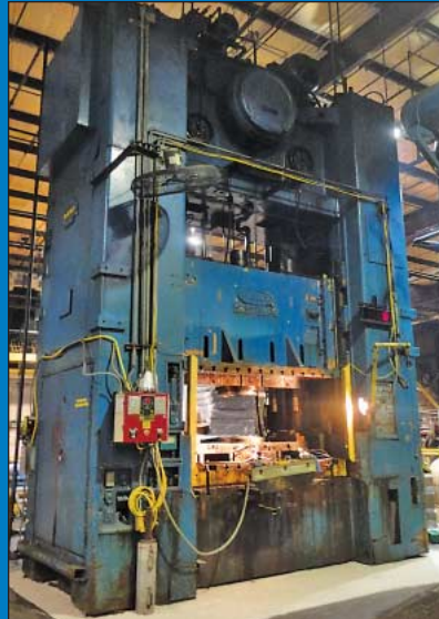
(2) 500 Ton Danly Model S2-500-84-60 Straight Side Double Crank Presses