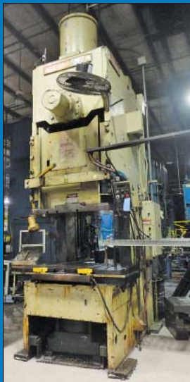
150 Ton Niagara Model E-150 Open Back Inclinable Press