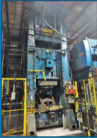
(2) 250 Ton Verson Model S1-250-42-36T Straight Side Single Crank Presses