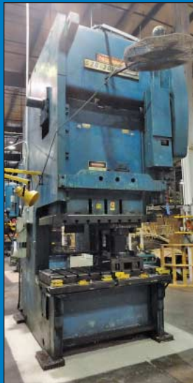
(5) 200 Ton Niagara Model S2G-200-60-30 Double Crank Gap Frame Presses