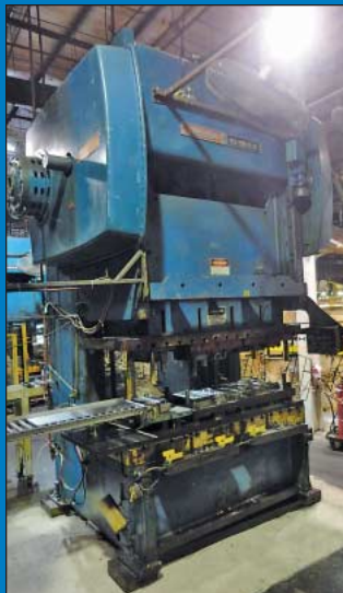
(3) 250 Ton Niagara Model S2G-250-96-36 Double Crank Gap Frame Presses