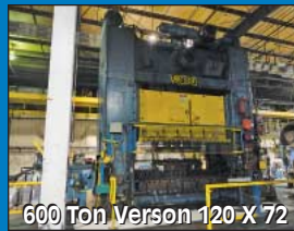
600 Ton Verson 120-X 72

Contact Information 2020 Dunlap St. Cincinnati, Ohio 45214 Phone 513-241-9701 Fax 513-241-6760 www.cia-auction.com