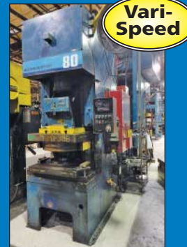
88 Ton Komatsu Model OBS-80-1 Single Crank Gap Frame Press

15,000 Lb. Hyster Model S155FT Diesel Power Cushion Tire Lift Trucks; 2-Stage Mast, 134" Lift Height, 105" Mast Height, 48" Forks, Harris Cab Enclosures, Side Shift, Fork Positioning (New 2012) ** To Be Sold Via Photo Located in Detroit, MI - Inspection by Appointment **