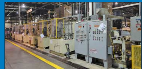
Automated Jetting Systems 7-Stage Electric Tunnel Type Pass Thru Parts Washer