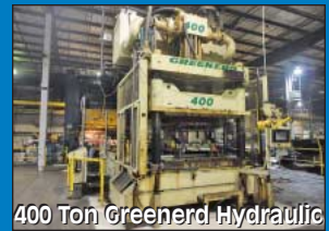
400 Ton Greenerd Hydraulic