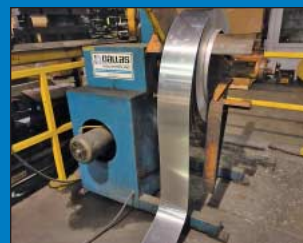
Press Feed Equipment