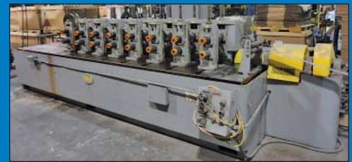
Yoder 2" Arbor x 8-Stand Rollformer