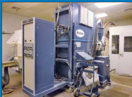
Nordson Model Horizontal 300 Electrostatic Powder Coat System