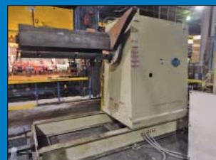
48" COE Servo Feed Line