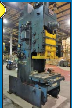
(3) 90 Ton Niagara Model E-90 OBS Open Back Inclined Presses