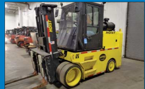
** 22,000 Lb. Silent Hoist Model FKS11 Diesel Power Cushion Tire Lift Trucks ** To Be Sold Via Photo