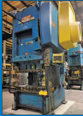
(5) 200 Ton Niagara Model S2G-200-60-30 Double Crank Gap Frame Presses