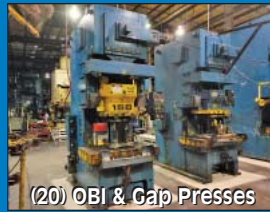
(20) OBI & Gap Presses