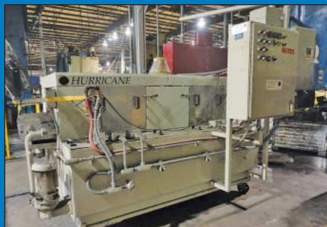
Midbrook Model Hurricane 5018 Mini-W/R Electric Tunnel Type Pass Thru Parts Washer