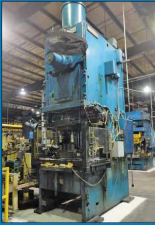
(3) 250 Ton Niagara Model E-250 Single Crank Gap Frame Presses