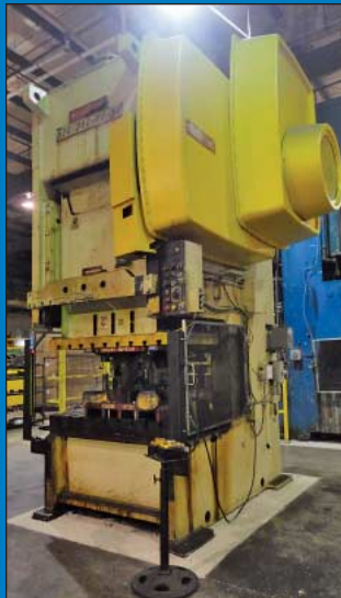
(5) 200 Ton Niagara Model S2G-200-60-30 Double Crank Gap Frame Presses