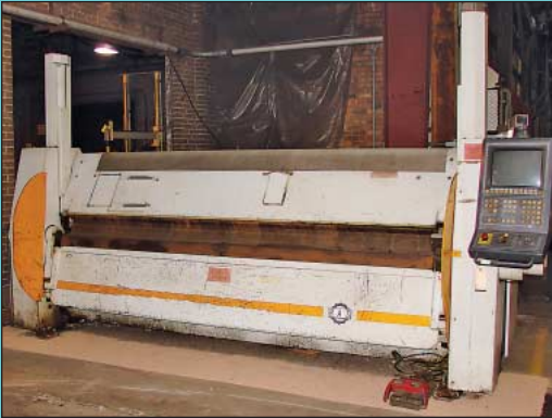
126" RAS Type 74-30 CNC Metal Folder