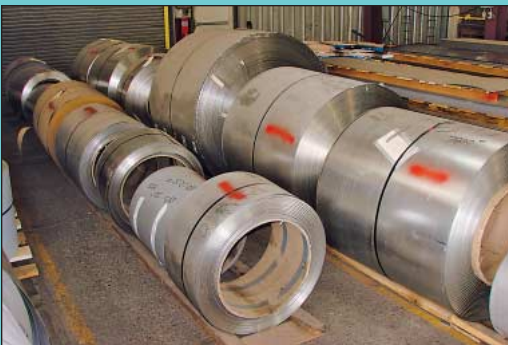
Approximately 175,000 Steel Coil Inventory

Featuring: Huge Material Inventory Including Approx. (6,700) Sheets Corrugated Stainless Steel Arch Grade Roofing Panels, Large Quantity Raw Material Including Coils, Sheets, Structural, Tube & Pipe, Large Quantity Components Including Cutters, Siding, Brackets, Hardware & Related, 126" Ras Type 74-30 CNC Folder, 10,000 LB X 42" Wide X 10 Ga. Cut-To-Length Line w/ Herr Voss Leveler, 20,000 LB X 40" Wide Coating Line w/ Herr Voss Recoiler, Large Quantity Other Steel Processing Components Including Uncoilers, Recoilers, Slitter Heads, Straighteners, Brush Stands & Related, (2) ESE Model Panel Former 100 and (2) Model K9 Portable Roofing Panel Machines (New As 1999), 1/4" X 10' Cincinnati Shear, Other Brakes, Rolls & Shears, Bridge Cranes, Saws, Toolroom, Woodworking Shop and Support Equipment