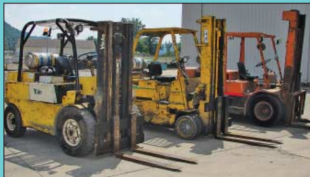
Bank View Lift Trucks To 15,000 Lb. Capacity