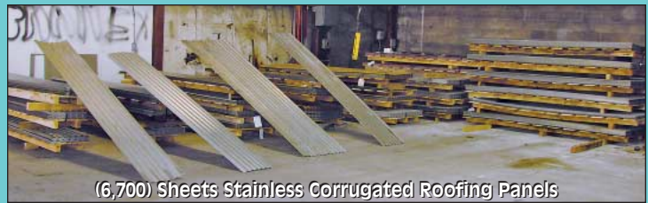
(6,700) Sheets Stainless Corrugated Roofing Panels

2020 DUNLAP ST., CINCINNATI, OHIO 45214 PHONE (513) 241-9701 / FAX (513) 241-6760 WEBSITE: cia-auction.com