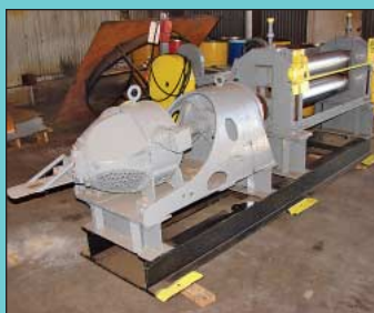
36" Wide Mfg. Unknown Pinch Rolls

Large Quantity Shop Equipment Consisting of; Hydraulic Pallet Trucks, Pedestal and Floor Fans, (50) Various Sized Safety Cabinets, Self Dumping Hoppers, Steel Shelving, Lockers, Steel Tables, Storing Cabinets; Crib Area with Maintenance Items Including: Plumbing, Electrical, Hardware, Pipe, Conduit, Electric and Pneumatic Hand Tools, Hydraulic Jacks and Other Related Items