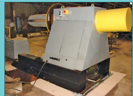
16,000 LB Cincinnati / Century Motorized Uncoiler w/ Coil Car