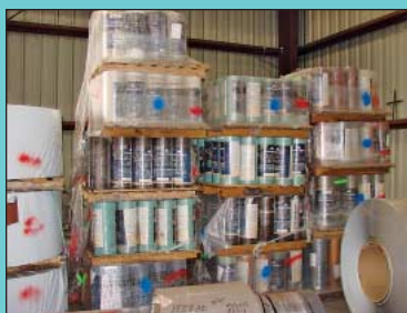
New Coils Painted Trim Roofing Material