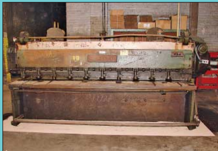
1/4" X 10' Cincinnati Model 1810 Mechanical Power Squaring Shear