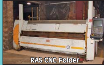
RAS CNC Folder