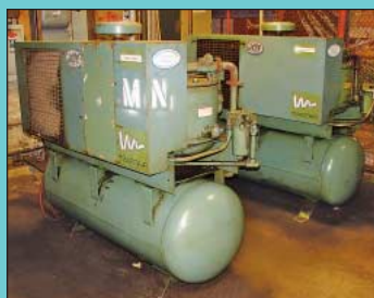
(2) 25 HP Joy Twist-Air Model A-025TAN2C Rotary Screw Horizontal Tank Air Compressors

No Last Minute Registrations will be accepted. Make Sure to Register & Post Your Deposit No Later than 48-Hours Prior to the Start of the Auction.