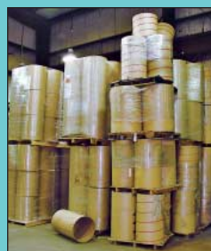
Approx. (200) 19-1/2" to 36" Dia. Various Width Corrugated Coil Liners