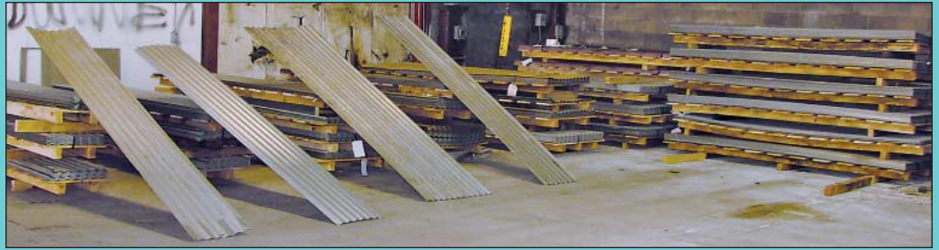
Approximately 6,700 Sheets of Corrugated Roofing Panels