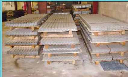
Approximately 6,700 Sheets of Corrugated Roofing Panels