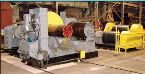
20,000 LB Herr Voss Motorized Recoiler w/ Coil Car