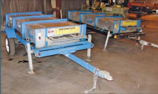
(2) ESE Model Panelformer 100 Trailer Mounted Standing Seam Roof Panel Formers

Bidsnorter.com™ To Become a Qualified Bidder on the Internet See Instructions on Page 2