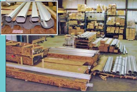
Partial View Large Quantity Roofing Accessories Including Gutters, Downspouts, Elbows, Brackets and Hardware