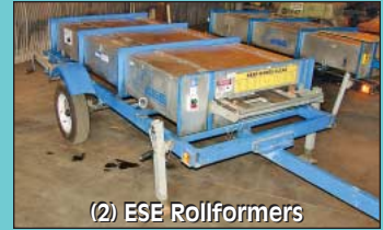
(2) ESE Rollformers