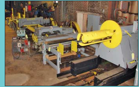
Overall View 10,000 X 42" Wide X 10 Ga. Cut-to-Length Line