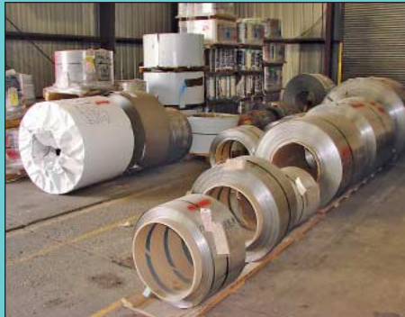
Approximately 175,000 Steel Coil Inventory