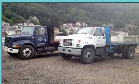
Bank View 1999 GMC C6500 Flat Bed Dump Truck and 1998 International 4700 Flat Bed Truck