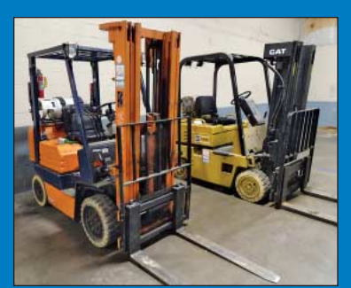
(4) Toyota and Caterpillar