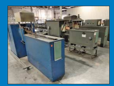
(4) C.I. Hayes Type MY Electric Fired Pass-Thru Stoker Furnaces