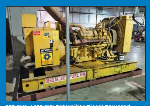
569 KVA / 455 KW Caterpillar Diesel Powered Stand-By Power Generator Set