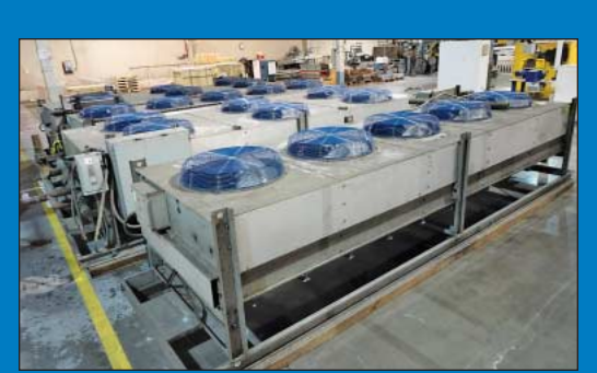
(4) Five and Six Fan Hiross Chillers