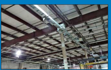
Approx. 1,100' of Copper Buss Duct