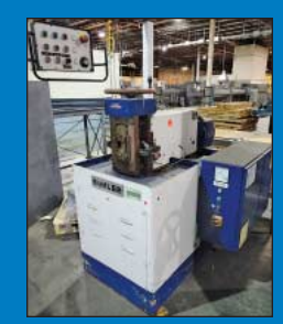
Buehler Type EW100 Strip Finishing Mill

.020", Machine Speed up to 300 FPM** Sold Subject to High Bid