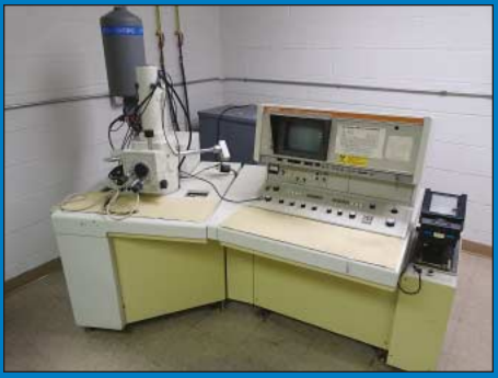
Jeol Model JSM-T330A Scanning Microscope