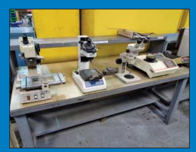
Beuhler Polishers and Microscopes