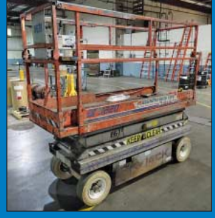
Skyjack Model 3220 Electric Scissor Lift