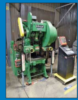
35 Ton South Bend Model 35-FW-AC OBI Press