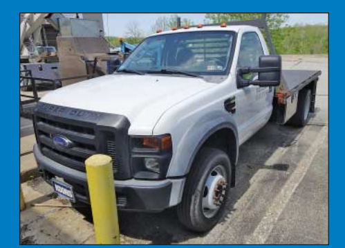
2008 Ford F550 Super Duty Flat Bed Truck