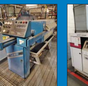
JWI 12-Plate Filter Press

Large Quantity of Shop Equipment Including ; 900 KG Multiton Electric Stacker, (3) Presto Electric Stackers, Economy & Crown Stackers, 2 Ton Hydraulic Shop Crane, Pedestal Fans, Safety Cabinets, Pallet Trucks, Milwaukee Mag Base Drill, Rotary Hammers, Large Qty. of Electric & Pneumatic Hand Tools, Avery Digital Scales, Vacuum Pumps, 1,000 Lb. Capacity CAS Digital Crane Scale, Pipe Wrenches, Greenlee Knockouts, Steel Cabinets & Benches w/ Vises, Shop Carts, (12) Sections of 42" x 96"/144" x 12' High Pallet Racking w/ Decking, (25) Sections of Various Size Pallet Racking, (2) 45' x 50' x 12' High Crib Enclosures w/ 10' Sliding Gates & Much More