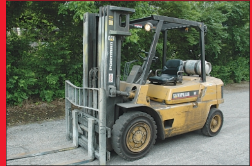
8,000 LB Caterpillar Model GP40 LP Gas Pneumatic Tire Lift Truck

Shop Equipment Consisting of; (3) Milwaukee Magnetic Drills, (2) Dump Hoppers, (3) Oxy Acetylene Carts, (2) Job Boxes, Banding Cart, Portable A-Frame Rack, 1,000 LB Fairbanks Platform Scale, (2) 1,000 LB Lifting Magnets, Flex Arm Tapper, Pipe Bender, 5' X 8' X 7" & 18" X 24" X 4" Granite Surface Plates, 42" Box Fan, Pedestal Model Fans, Wall Mount Fans, 12' Fiberglass Step Ladder, 4' Portable Steps, Self Dumping Hopper, Rubbermaid Shop Carts, Steel Saw Horses, Hardware, Steel Storage Cabinets, H.D. Bar Clamps, 24-Volt Hertner Battery Charger, 100 Ton Enerpac Hydraulic Jack & Other Related Items – SOME OF THESE ITEMS ARE LOCATED AND AT THE GLENDALE MILFORD FACILITY, SEE AUCTION CATALOG FOR EXACT ITEM LOCATION INFORMATION