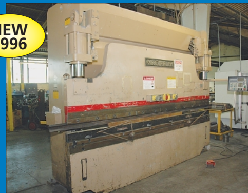
135 Ton X 12' Cincinnati 135CBII Hydraulic Power Press Brake