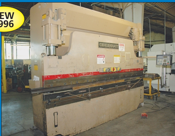
135 Ton X 12' Cincinnati 135CBII Hydraulic Power Press Brake