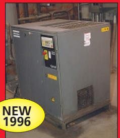
25 HP Atlas Copco Model GA18 Cabinet Enclosed Rotary Screw Air Compressor