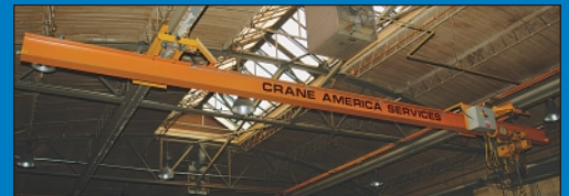
(3) 2 Ton X 32' Approx. Span Crane America Services Single Girder Bottom Running Overhead Bridge Cranes