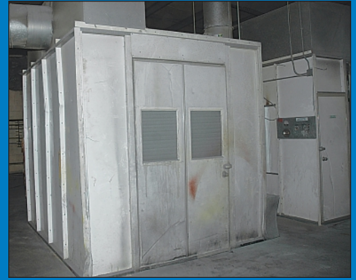
9'W X 10'L X 9'H Mfg. Unknown Modular Panel Construction Drive-Thru Rear Draft Spray Booth