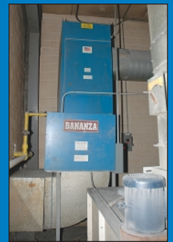
10 HP Bananza Model B-1000 Air Make Up Unit