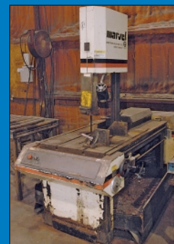
Marvel Model 8-Mark II Tilt Frame Vertical Band Saw