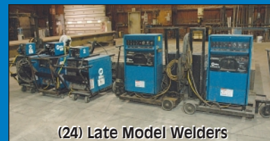
(24) Late Model Welders