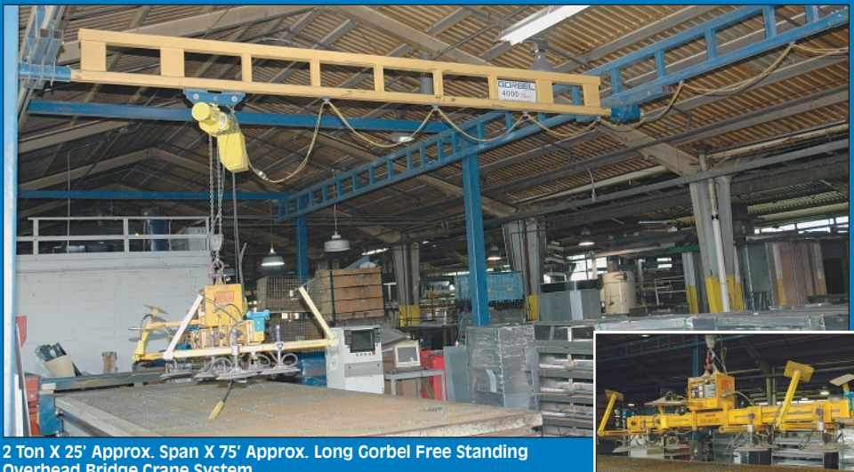
2 Ton X 25' Approx. Span X 75' Approx. Long Gorbel Free Standing Overhead Bridge Crane System