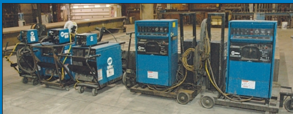
(24) Late Model Miller Welders Of All Types and Models

Featuring: AKS CNC Hi-Def Plasma Cutting Table (1997), Cincinnati 135CBII Hydraulic Press Brake (1996), Geka Hyd-50 Ironworker, Whitney 2530 CNC Punch, (4) Cincinnati Milacron CNC VMC's (To 1996), Franklin W550X7 Beam Punch, Euromac 220/6S Notcher, (2) Cincinnati Shears, (6) Marvel Band Saws, (24) Welders, Late Model Toolroom Machinery, Anver Vacuum Lift, Panjiris 30-6AB Positioner, (3) Late Model Lift Trucks to 10,000 Lbs., (7) Overhead Bridge Cranes to 10 Ton, (2) Drive In Spray Booths to 15' X 25', Air Compressors, Large Quantity Shop & Support Equipment