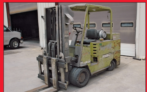
10,000 LB Kalmar Model ACC100TL2PS LP Gas Solid Tire Lift Truck

No Last Minute Registrations will be accepted. Make Sure to Register & Post Your Deposit No Later than 48-Hours Prior to the Start of the Auction.