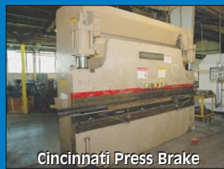
Cincinnati Press Brake

2020 DUNLAP ST., CINCINNATI, OHIO 45214 PHONE (513) 241-9701 / FAX (513) 241-6760 INTERNET: cia-auction.com