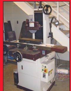
6" X 18" Chevalier Falcon Model 618M Hand Feed Surface Grinder