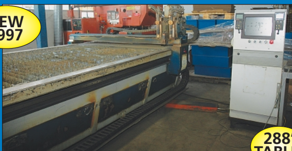
AKS Accu-Kut-System Model P-2030 Hy-Definition Dual Torch CNC Plasma Cutting Table