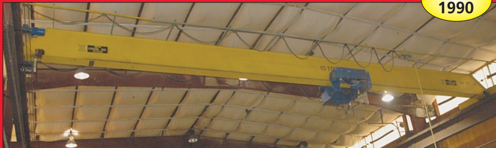
(2) 10 Ton X 50' Span MPH Crane Inc. Single Girder Top Running Overhead Bridge Cranes

(2) 13" X 40" Kent Model TRL 13X40 Geared Head Engine Lathes; S/N 1340471592 & 1340471595, Newall Digital Readouts, Chucks, Late Model, Low Hour, Excellent Condition (New 7/2004) SEE PHOTO