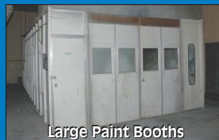
Large Paint Booths