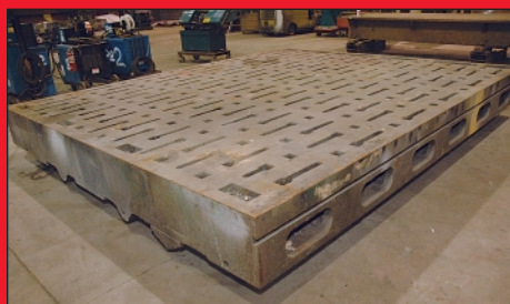
(2) 138" X 169" X 14" Thick Heavy Duty Cast Iron Slotted Welding Tables