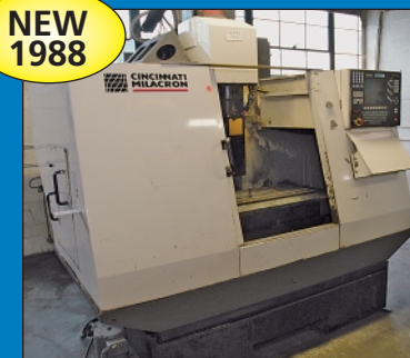
Cincinnati Milacron Model Sabre 750 EAA CNC Vertical Machining Center