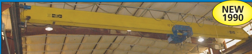
(2) 10 Ton X 50' Span MPH Crane Inc. Single Girder Top Running Overhead Bridge Cranes

Monday, June 28th From 10:00 AM to 4:00 PM