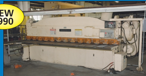
1/4" X 12' Cincinnati Model 2CC12 Mechanical Power Squaring Shear