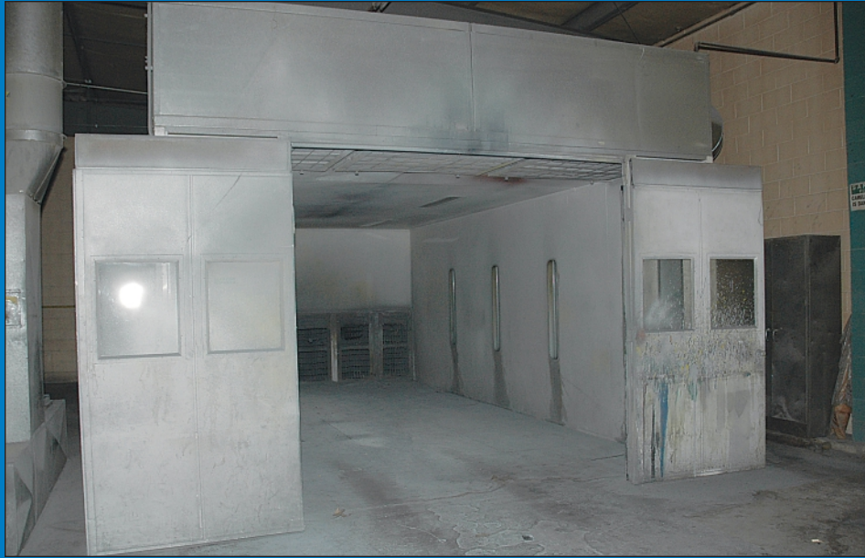
15'W X 25'L X 12'H Mfg. Unknown Modular Panel Construction Drive-In Rear Draft Spray Booth