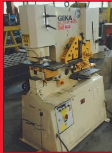
50 Ton Geka Model Hyd-50 Hydracrop 50/A Hydraulic Power Ironworker