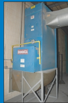
3 HP Bananza Model B-650 Air Make Up Unit