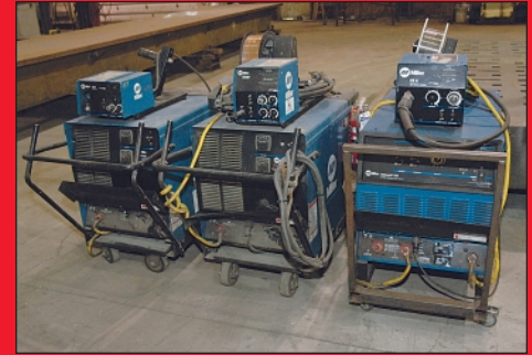
Close Up View (3 of 19) Late Model Miller Mig Welders