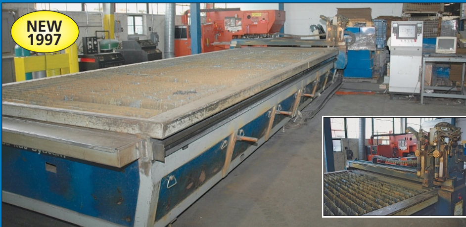
AKS Accu-Kut-System Model P-2030 Hy-Definition Dual Torch CNC Plasma Cutting Table