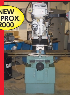
SWI Trak Model Sport B3 Proto-Trak CNC Bed Type Vertical Milling Machine