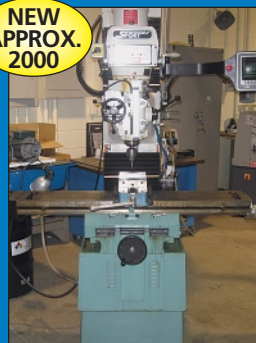
SWI Trak Model Sport B3 Proto-Trak CNC Bed Type Vertical Milling Machine