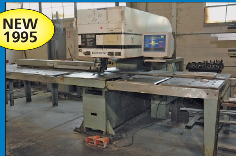
50 Ton Esterline Whitney Model 2530 CNC Single End Punch