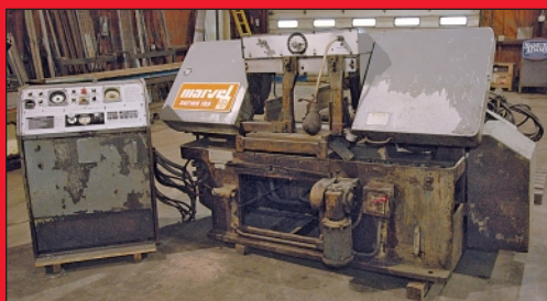
Marvel Series 15A Model 15A4/M1/M8 Automatic Horizontal Band Saw

SWI Trak Model Sport B3 Proto-Trak CNC Bed Type Vertical Milling Machine; S/N 00-0612, Proto Trak M3 Control, 10" X 50" Approx. Table Size, Late Model, Low Hour, Excellent Condition (New Approx. 2000) SEE PHOTO