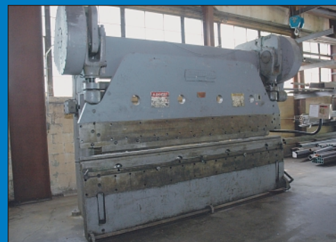
150 Ton X 12' Cincinnati 9 Series Mechanical Power Press Brake