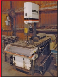
Marvel Model 8-Mark II Tilt Frame Vertical Band Saw