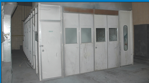
15'W X 25'L X 12'H Mfg. Unknown Modular Panel Construction Drive-In Rear Draft Spray Booth