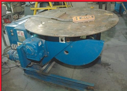
3,000 Lb. Pandjiris Model 30-6AB Welding Positioner