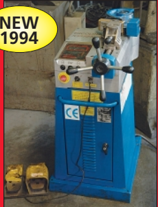
NEW 1994 Ercolina Model 050 Top Bender Pipe Bender