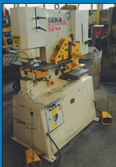
50 Ton Geka Model Hyd-50 Hydracrop 50/A Hydraulic Power Ironworker