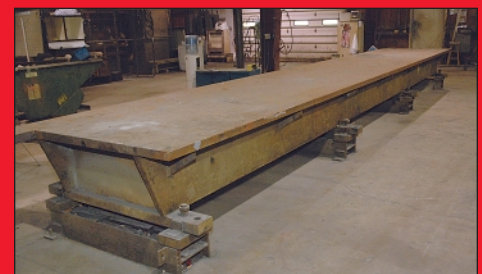
60"W X 30"L X 2" Thick Heavy Duty Welding Table