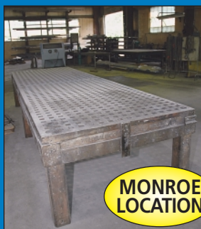
Partial View (1 of 4) Various Style Welding Tables