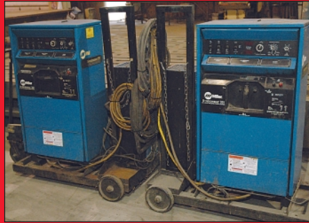
Close Up View (2 of 4) Late Model Miller Tig Welders