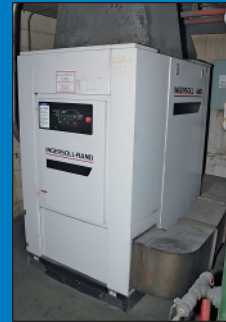
50 HP Ingersoll Rand Model SSR-EP50SE Cabinet Enclosed Rotary Screw Air Compressor

(3) 2 Ton X 32' Approx. Span Crane America Services Single Girder Bottom Running Overhead Bridge Cranes; (2) w/ 2 Ton Coffing Electric Chain Hoists & Pendant, (1) w/ 2 Ton Harrington Electric Chain Hoist & Pendant SEE PHOTO