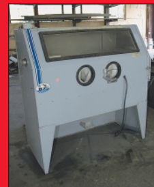
60" Wide Skat Blast Abrasive Blast Cabinet