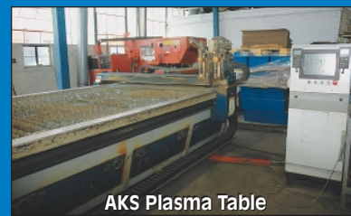
AKS Plasma Table