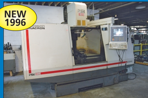
Cincinnati Milacron Model Sabre 1000 ERO CNC Vertical Machining Center