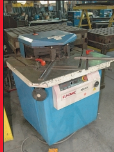
8-1/2" X 8-1/2" Euromac Model 220/6S Hydraulic Power Notcher