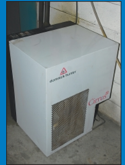
Domnick Hunter CRD200 230/1/60 EL.DR Refrigerated Air Dryer