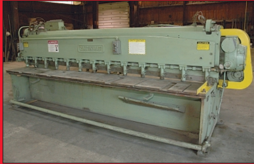
10 Ga. X 12' Cincinnati Model 1012 Mechanical Power Squaring Shear