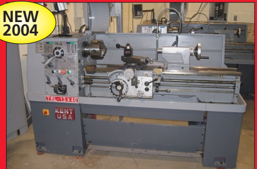
(2) 13" X 40" Kent Model TRL 13X40 Geared Head Engine Lathes