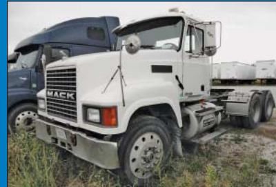
2001 Mack Model CH613 Conventional Cab Tandem Axle Road Tractor