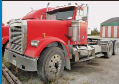
(3) 2003 Freightliner Model FLD120 Conventional Day Cab Tandem Axle Road Tractors