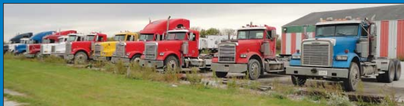
(15) Truck Tractors By Freightliner, Volvo and Mack To 2005