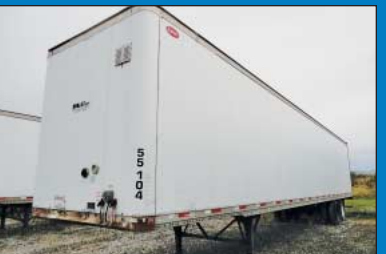
(7) 1999 - 53' Dorsey Model AIDT-LS Tandem Axle Aluminum Dry Van Trailers