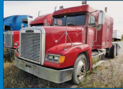
2000 Freightliner Model FLD120 Sleeper Cab Tandem Axle Road Tractor