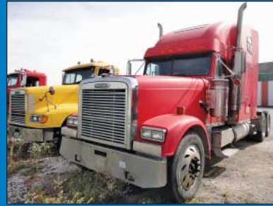
2000 Freightliner Model FLD120 Sleeper Cab Tandem Axle Road Tractor