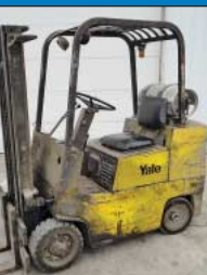
4,000 LB Yale Model G10040AAJUS071 Solid Tire Propane Lift Truck