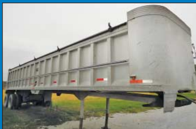
1992 - 39' Ti-Brook Aluminum End Dump Tandem Axle Trailer