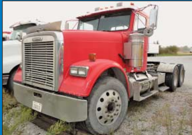
(3) 2003 Freightliner Model FLD120 Conventional Day Cab Tandem Axle Road Tractors