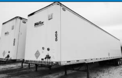
(7) 1999 - 53' Dorsey Model AIDT-LS Tandem Axle Aluminum Dry Van Trailers