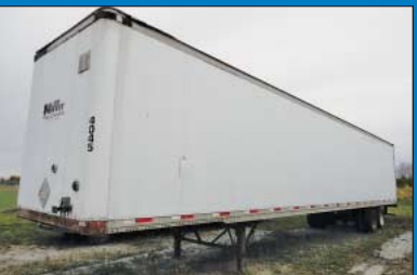
(7) 1999 - 53' Dorsey Model AIDT-LS Tandem Axle Aluminum Dry Van Trailers