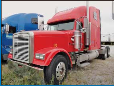
2002 Freightliner Model FLD120 Classic XL Sleeper Cab Tandem Axle Road Tractor