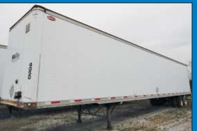
2000 - 53' Dorsey Model AIDT-LS Tandem Axle Aluminum Dry Van Trailer