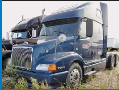
2001 Volvo Model VNL64T Sleeper Cab Tandem Axle Road Tractor