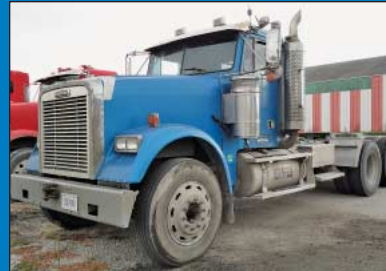
2003 Freightliner Model FLD120 Conventional Day Cab Tandem Axle Road Tractor