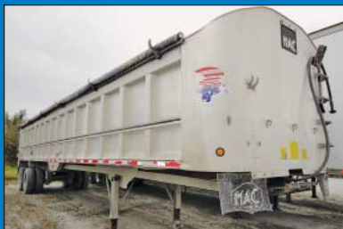
(2) 2001 - 39' Mac Aluminum End Dump Tandem Axle Trailers

MORE PHOTOS AVAILABLE ON WEBSITE www.cia-auction.com