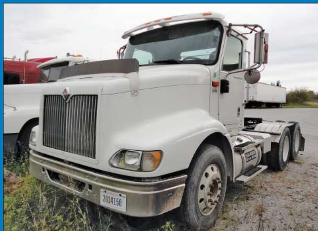
2005 International Model 9200i Conventional Day Cab Tandem Axle Road Tractor

INSPECTION: Monday, November 21st from 10:00 AM to 4:00 PM