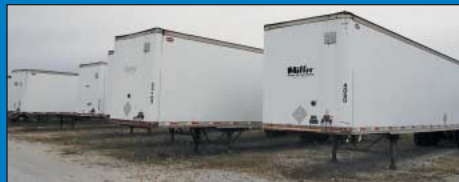
(7) 1999 – 53' Dorsey Model AIDT-LS Tandem Axle Aluminum Dry Van Trailers