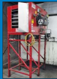
280,000 BTU Clean Burn Model CB2800 Waste Blower Motor Burning Furnace