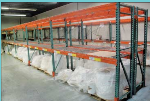
(23) Sections 30" Deep X 108" Wide X 96" High Tear Drop Adjustable Beam Pallet Racking with Wire Decking