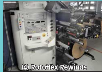
(4) Rotoflex Rewinds