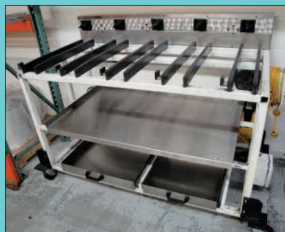
(2) Five-Station Print Cylinder Wash Carts

Jay Squire, (317) 782-0517 jay@jasgraphics.net