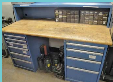
28" X 72" Maple Top Lista Workbench with (2) Four-Drawer Cabinets