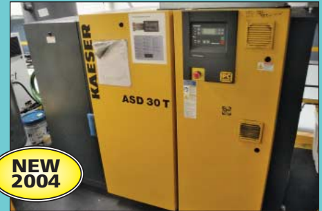
30 HP Kaeser Model ASD30T Cabinet Enclosed Rotary Screw Air Compressor

Large Quantity of Office Furniture Including: (60) Four-Drawer Files Cabinets, Desks, Lateral File Cabinets, Swivel Arm Chairs, Steel Bookshelves, Partition, (2) Scotchman Model C0522SA-1B Ice Machines, Brake Room Furniture