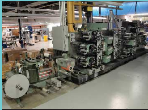
7" Gallus Model R160 B02 Eight-Color Flexographic Printing Press