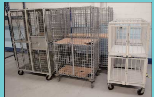
(31) Various Size Steel Wire Cage Carts