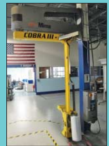
ITW Mima Model Cobra III Column Mounted Swing Arm Rotary Stretch Wrapper