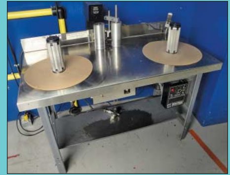
7" Lederle Model 722 Table Top Rewinder

42" X 60" NuArc Model VLT61F Light Table; S/N 124C78-2