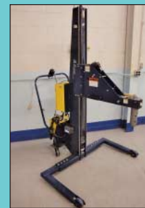
300 Lb. Schlumpf Model ERH-300-PT3 Electric Paper Roll Lifter / Turner