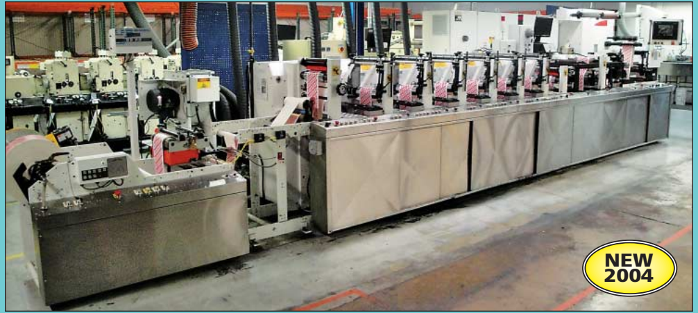
10" Aquaflex Instaprep Model LCQXX1006 Six-Color Flexographic Printing Press