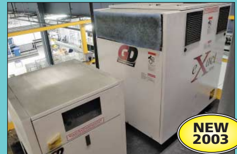
30 HP Gardner Denver Model 300EGB753 Cabinet Enclosed Rotary Screw Air Compressor