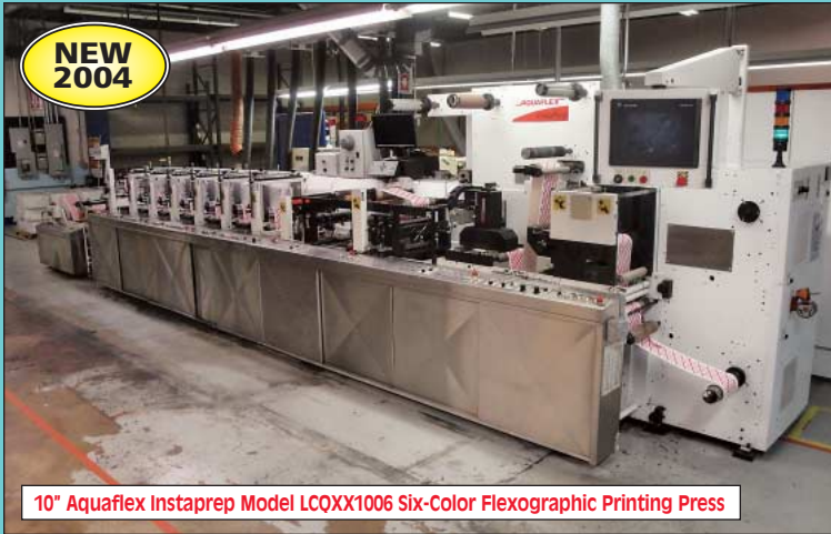
10" Aquaflex Instaprep Model LCQXX1006 Six-Color Flexographic Printing Press

INSPECTION: WEDNESDAY, JANUARY 21ST, FROM 8:00 AM TO 4:00 PM