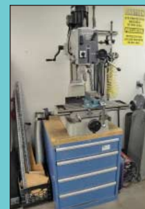
18" MSC Model 09512914 Geared Head Milling and Drilling Machine