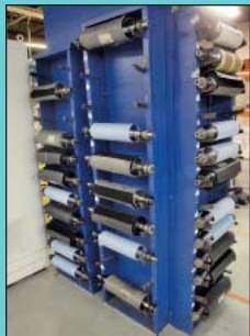
(27) 10" Auqaflex Anilox Cylinders from 165-1000