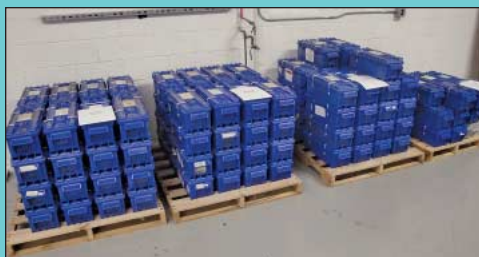
(97) 10" Aquaflex Dies