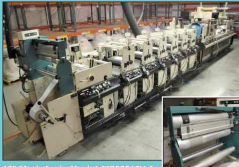
16" Mark Andy Model 41368816Y-A Six-Color Flexographic Printing Press