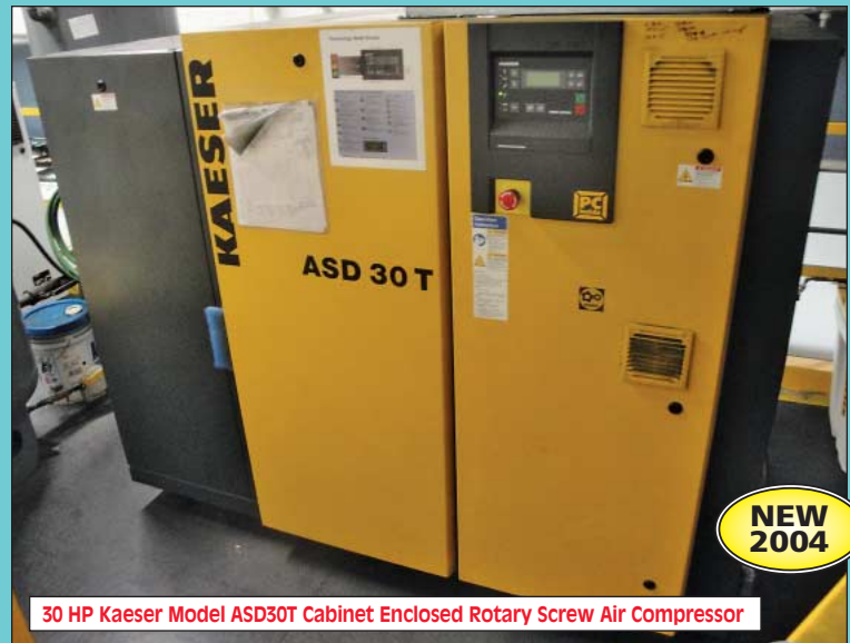
30 HP Kaeser Model ASD30T Cabinet Enclosed Rotary Screw Air Compressor