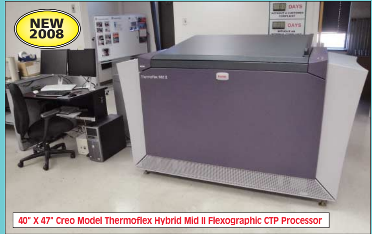
40" X 47" Creo Model Thermoflex Hybrid Mid II Flexographic CTP Processor