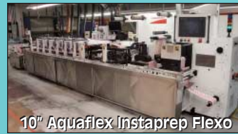
10' Aquaflex Instaprep Flexo

Contact Information 2020 Dunlap St. Cincinnati, Ohio 45214 Phone 513-241-9701 Fax 513-241-6760 www.cia-auction.com