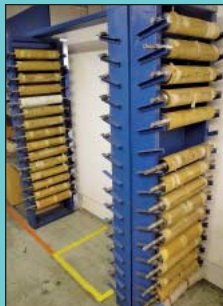
(43) 16" Mark Andy Anilox Cylinders form 400-1200