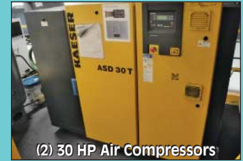
(2) 30 HP Air Compressors