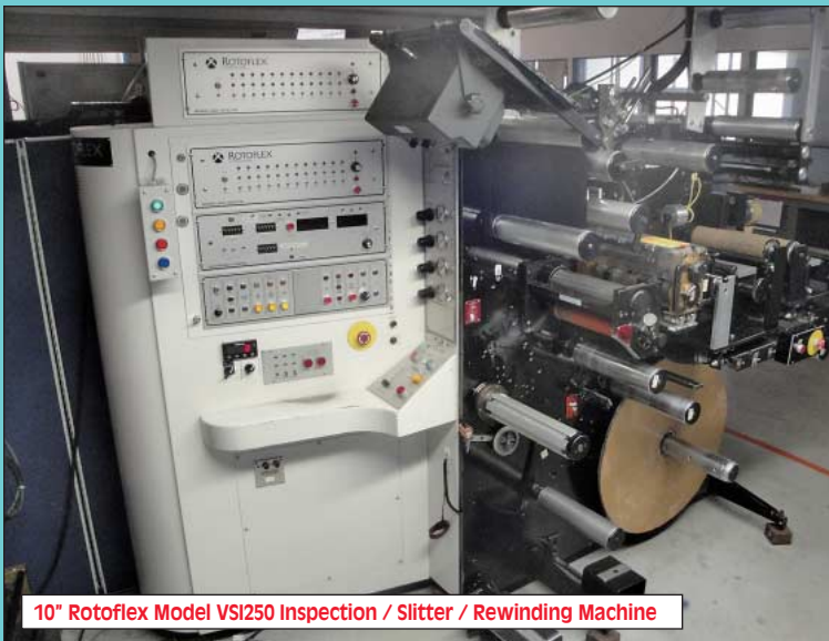
10" Rotoflex Model VSI250 Inspection / Slitter / Rewinding Machine