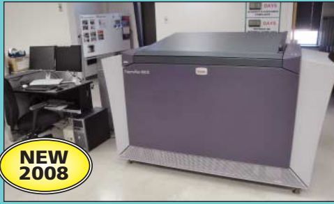
40" X 47" Creo Model Thermoflex Hybrid Mid II Flexographic CTP Processor