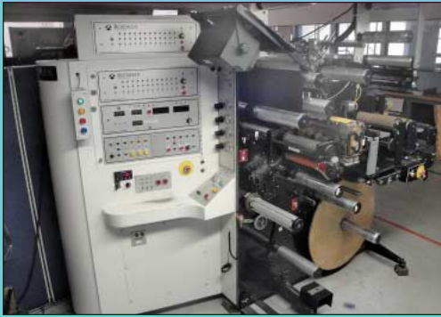
10" Rotoflex Model VSI250 Inspection / Slitter / Rewinding Machine