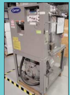
30 Ton Carrier Model 30HWA028-D-520KA Chiller