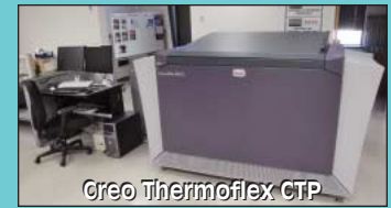
Creo Thermoflex CTP