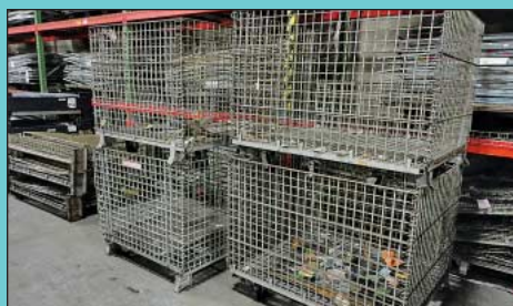
(150) 40" X 48" X 34" High Collapsible Wire Baskets