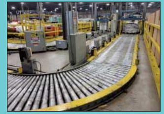
(2) Integrated Palletizing / Stretch Wrap / Power Roller Conveyor Lines