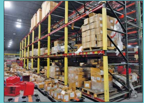
(18) Sections – 84" D X 96" W X 18' High Ridg-U-Rak "Push-Bak" Push/Pull Pallet Racking

Large Assortment Fiberglass Step Ladders & Warehouse Ladders (10) Banding Carts w/ Cordless Electric Banding Tools SEE PHOTO Toro Power Shift 1232 Gas Powered Snow Blower