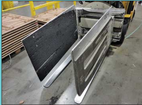
(3) Cascade Cat No. 35D-BBH-156 Rotating Tilting Attachments