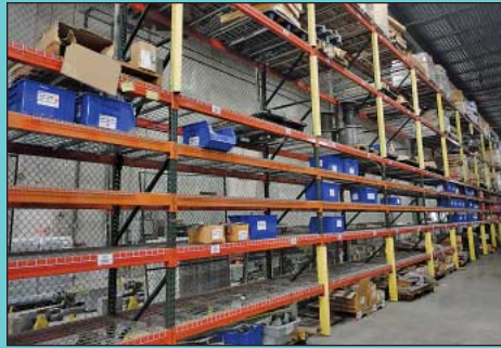
(63) Sections – 42" D X 96" W X 16' High Adjustable Beam Pallet Racking w/ Decking