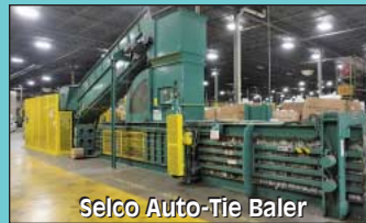
Selco Auto-Tie Baler

Contact Information 2020 Dunlap St. Cincinnati, Ohio 45214 Phone 513-241-9701 Fax 513-241-6760 www.cia-auction.com