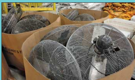
Large Quantity of Column Mount Fans & Pedestal Fans

POSSIBLE SCRAP OPPORTUNITIES AT BOTH LOCATIONS LOTS BEING ADDED DAILY