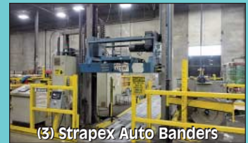
(3) Strapex Auto Banders