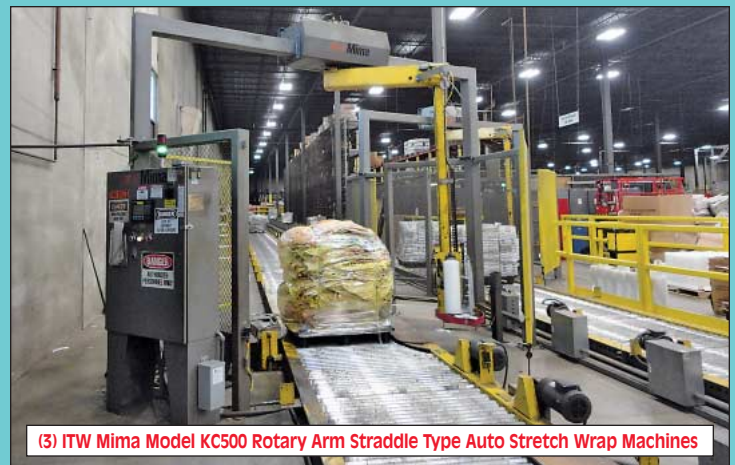
(3) ITW Mima Model KC500 Rotary Arm Straddle Type Auto Stretch Wrap Machines