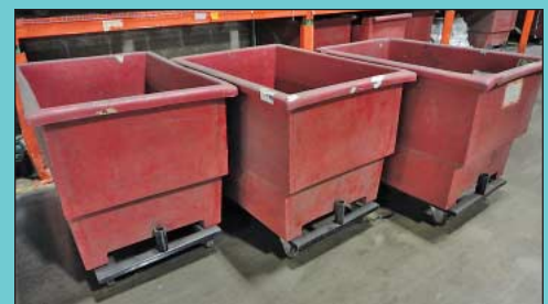
Portable Plastic Totes