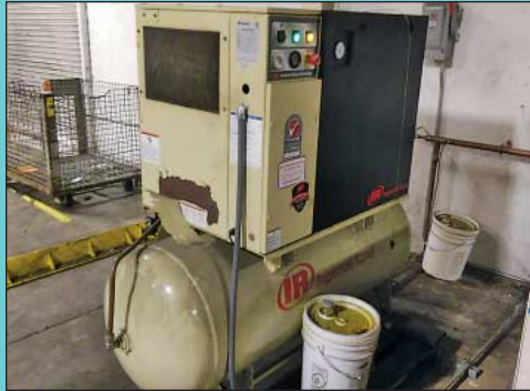
25 HP Ingersoll-Rand Model SSR-EP25SE Air Compressor