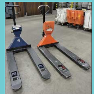
(3) 500 LB LTS Scale Corp Model PTEF-16-B1 Hand Pallet Truck w/ Built in Scale