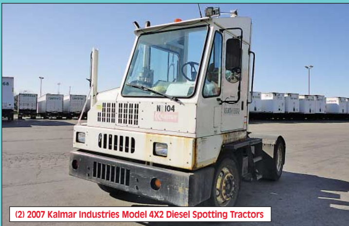
(2) 2007 Kalmar Industries Model 4X2 Diesel Spotting Tractors