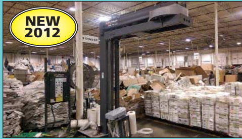
NEW 2012 Wulftec Model WRT-150 Floor Mounted Rotary Arm Stretch Wrapper