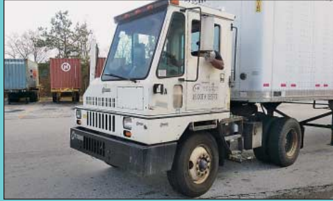
1998 Ottawa Model Commando 30 Single Axle Diesel Spotting Tractor