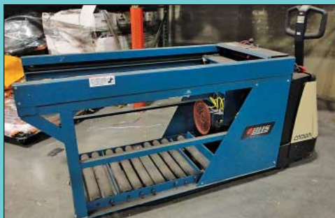
Crown Model WP2030-45 Electric Pallet Truck w/ BHS Battery Handling System