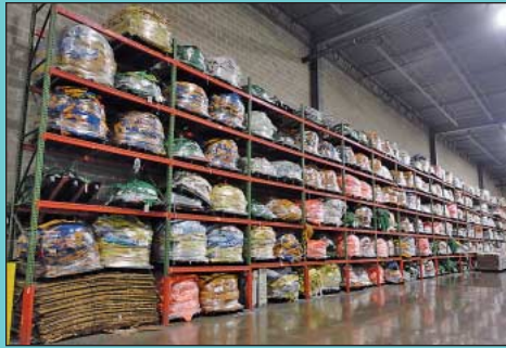
(86) Sections – 42" D X 96" W X 20' High Adjustable Beam Pallet Racking w/ Decking