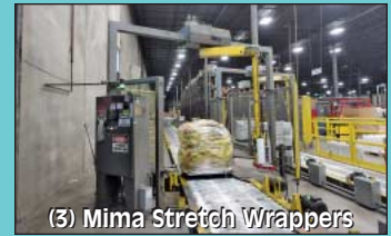
(3) Mima Stretch Wrappers