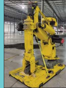
Fanuc Model S-420-F Six- Axis Material Handling Robot