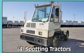
(4) Spotting Tractors