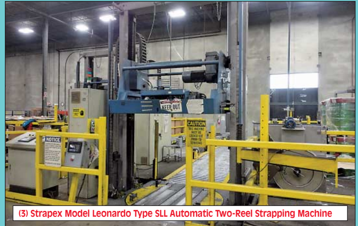
(3) Strapex Model Leonardo Type SLL Automatic Two-Reel Strapping Machine