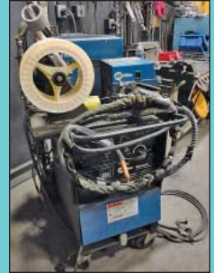
(2) 300 Amp Miller Shopmaster Welding Power Source w/ Wire Feeder