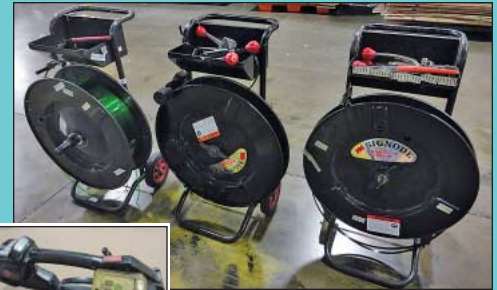
(10) Banding Carts w/ Cordless Electric Banding Tools