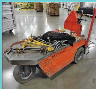
1,000 LB Taylor Dunn Electric Stand Up Cart Tugger

(150) 40" X 48" X 34" High Collapsible Wire Baskets SEE PHOTO