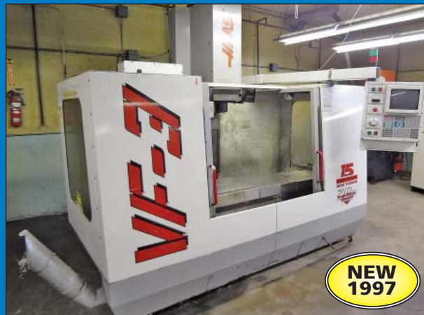
Haas Model VF-3 CNC VMC