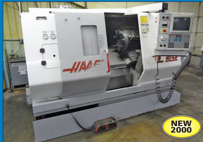
Haas Model SL20T CNC Turning Center

INSPECTION: Monday, June 27th from 10:00 AM to 4:00 PM