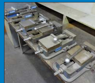
(5) Haas CNC VMC's, Haas Rotary 4th Axis, Toolholders, Vises