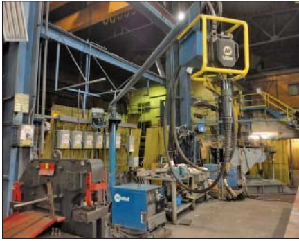
(4) 650 Amp Miller Deltaweld 652 Welders with Booms and Wire Feeds