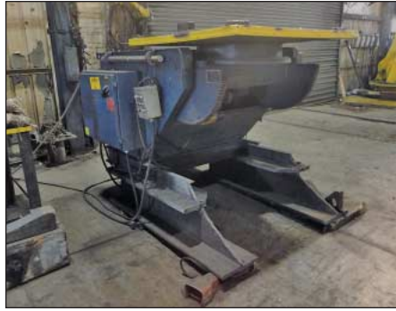
(2) 6,000 Lb. Arsonon Model HD60A Welding Positioners