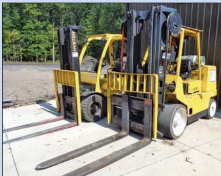
(8) Fork Lifts To 15,000 LB Capacity