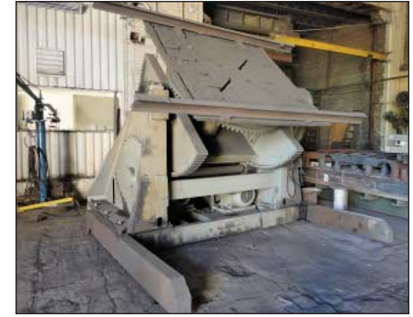
(2) 40,000 LB. Worthington Size 400P Welding Positioners