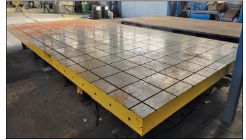
100" Wide X 210" Long X 6" Thick Portage Type Layout Table

10 HP Gardner Denver Horizontal Tank 2-Stage Air Compressor Gardner Denver Size 9X9 Model R9CL Piston Type Air Compressor; S/N 154523