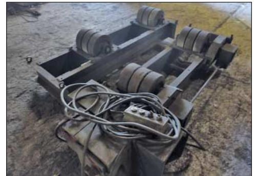
Large Quantity Welding Accessories