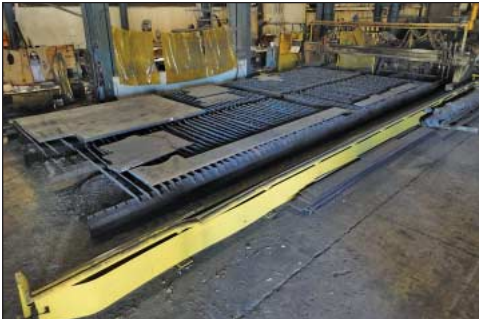
16' X 45' Linde Type CM100-22 4-Torch Oxy-Acetylene Burning Table