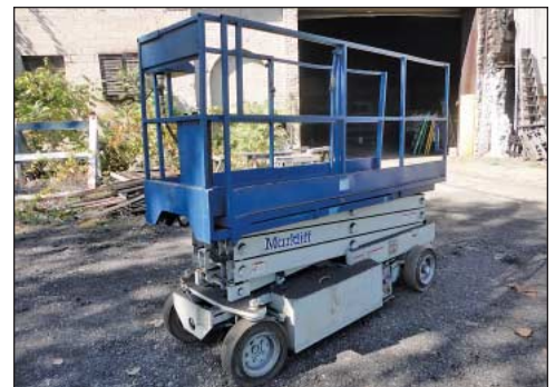
Marklift Model CH20NEP Electric Scissor Lift