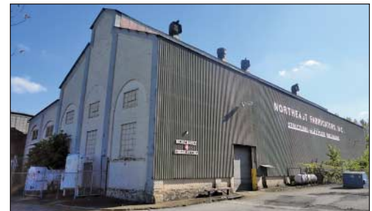
23,000 Sq. Ft. Approx Two Building Facility on Approx 2.88 Acres and (2) Additional Parcels