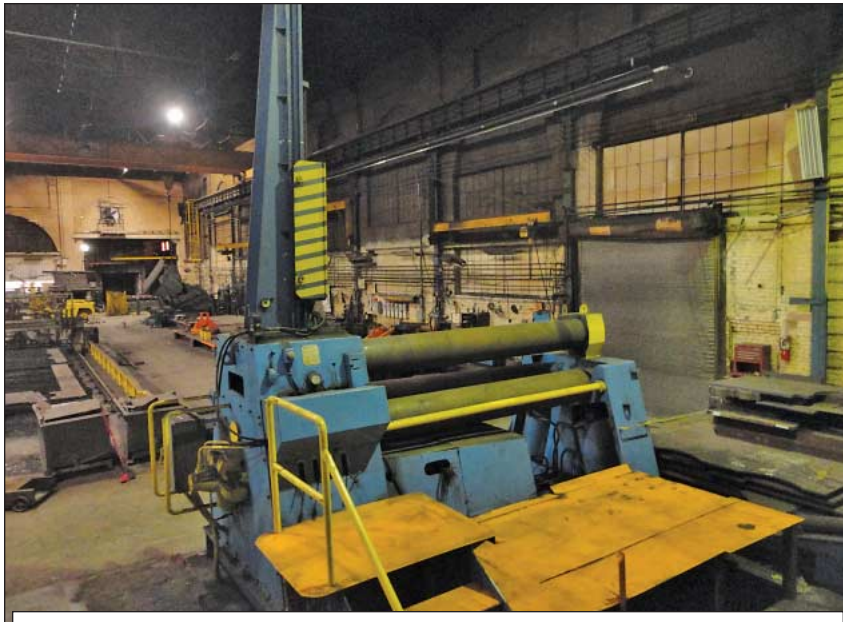
Kumla Mekaniska Type PV7H Hydraulic (3,000 X 25) Plate Bending Rolls

INSPECTION: TUESDAY, NOVEMBER 1ST, FROM 10:00 AM TO 4:00 PM