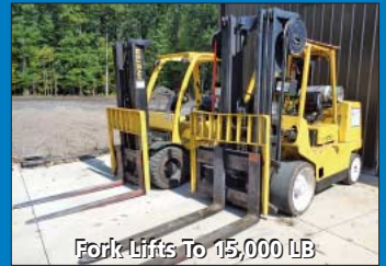
Fork Lifts To 15,000 LB

WEDNESDAY, NOV. 2ND STARTING AT 10:00 AM INSPECTION: Tuesday, November 1st from 10:00 AM – 4:00 PM