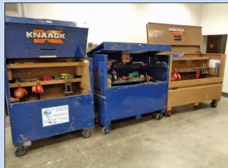
Rigging and Contractors Tools