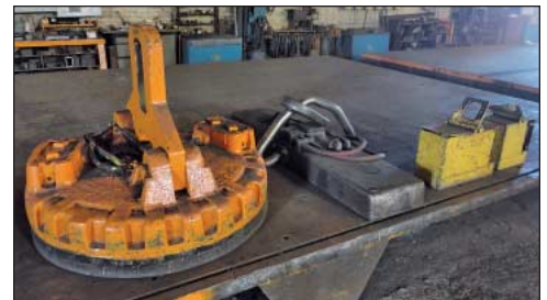
Late Model Lifting Magnets

10" Craftsman Radial Arm Saw, Hydraulic and Electric Pallet Trucks, (3) Parts Washing Tanks, Acetylene Outfits, (2) DE Bench Grinders, H-Frame Shop Press, 10,000 Lb. Floor Scale, Shop Fans, Roto Bins and Shop Carts Loaded with Hardware, Pigeon Hole Racks with Hardware, Large Quantity of Electric and Cordless Hand Tools, Mechanical Tools, 2-Wheel Hand Trucks, Many Other Related Items