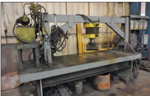
Shop Built HD Hydraulic Straightening Press