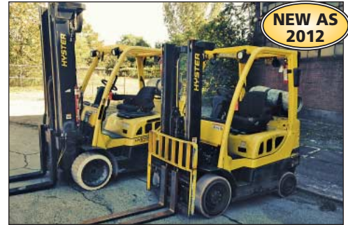
(8) Forklifts To 15,000 LB Capacity

➤ All Internet bidders must Post a Deposit of Approx. 25% of Your Planned Spending Budget or $5,000.00 Minimum with Cincinnati Industrial Auctioneers in Order to be approved to Bid. Those who do Not Post the Deposit Will Not be Approved. Period.