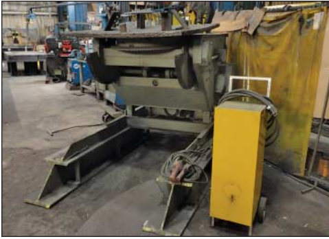
(2) 6,000 Lb. Arsonon Model HD60A Welding Positioners