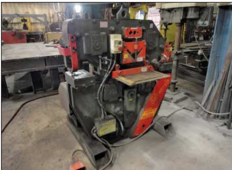
100 Ton Edward Model Deluxe 100 Ton "Jaw V" Hydraulic Iron Worker