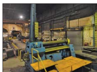
1" X 10' Bending Roll

Important Mail TO BE DIRECTED TO THE ATTENTION OF EXECUTIVE PERSONNEL