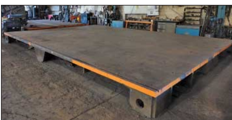
(2) 16' Wide X 24' Long X 2-3/4" Thick Steel Fitting Tables with Edge and Center Machined Squaring Grooves