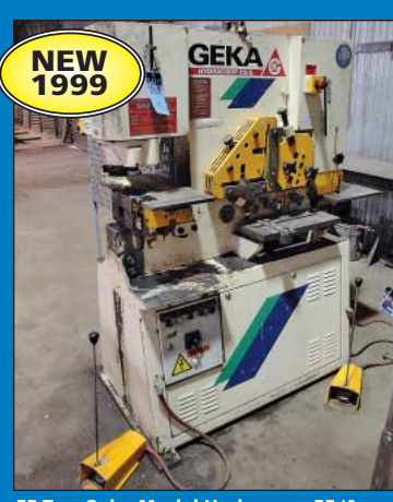
55 Ton Geka Model Hydracrop 55/A Hydraulic Ironworker

DIRECTIONS: From Nashville, TN head East on I-24 to Exit 78B TN-96/Old Fort Pkwy. Turn East onto TN-96/Old Fort Pkwy and Proceed 2.5 Miles to NW Broad St. Turn Right onto NW Broad St and Proceed 0.4 Mile to South Front Street on Right. Turn Right onto South Front Street and Continue 0.2 Mile to Sale Site on Left. Watch for Auction & Parking Signs