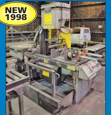
18" HEM Model V100LM-2 Semi-Auto Tilt Frame Vertical Band Saw

18" HEM Model V100LM-2 Semi-Auto 18" HEM Model V100LM-2 Semi-Auto Tilt Frame Vertical Band Saw; S/N 620198, 18" X 20" @ 90 Deg, 18" X 14" @ 45 Deg, 1.25" Blade Size, 60-400 SFPM Blade Speed, 5HP Motor (New 1998) SEE PHOTO 10" HEM Model 10V Tilt Frame Vertical Band Saw; S/N 823403, 10" X 10" @ 90 Deg, 6" X 6" @ 45 Deg, 3/4"w X 10'3" Blade, 1.5HP Motor (New 2003) SEE PHOTO 14" Scotchman Model 350LT/PK Cold SEE PHOTO Saw: S/N N/A. 3HP Motor