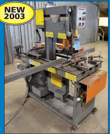
10" HEM Model 10V Tilt Frame Vertical Band Saw

PRE-SORT FIRST CLASS U.S. POSTAGE PAID CINCINNATI, OHIO PERMIT NO. 3593