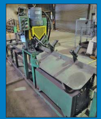
6" X 6" X 5/16" Whitney Model 609483 Angle Iron Shear

8' x 8' Modular Shop Office Genie Superlift SL20 Duct Lift (6) Slugger Mag-Base Drills