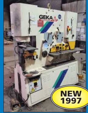
110 Ton Geka Model Hydracrop 110/A Hydraulic Ironworker