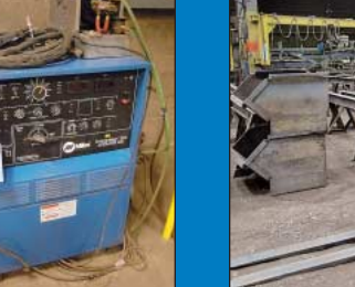
350 Amp Miller Model Syncrowave 350 TIG Welder