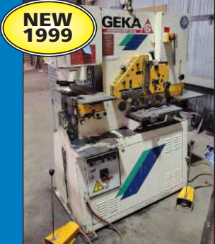
55 Ton Geka Model Hydracrop 55/A Hydraulic Ironworker