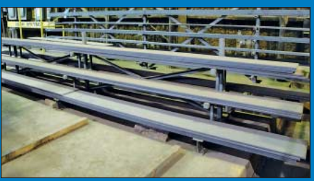
Partial View of Structural Steel