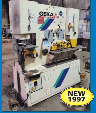
110 Ton Geka Model Hydracrop 110/A Hydraulic Ironworker