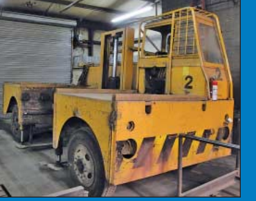
10,000 LB Silent Hoist Model FS-5 Side Loading Carry Deck Yard Lift