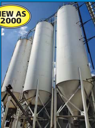
(8) Welded Steel Silos to 14' x 70'