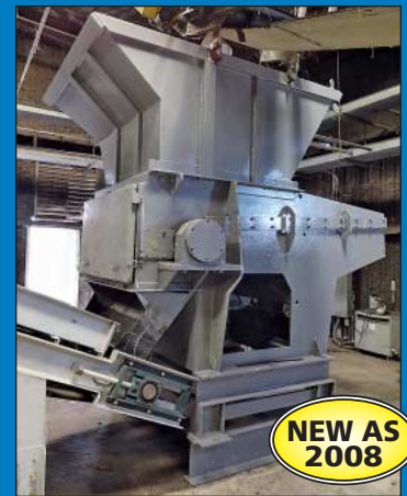
100 HP Vecoplan Model RTR-52/100K Shredder