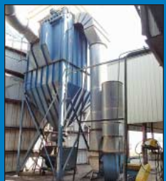
50 HP Mac Dust Collector Bag House