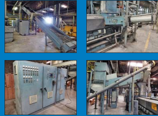
Davis Merritt Extrusion Line Components