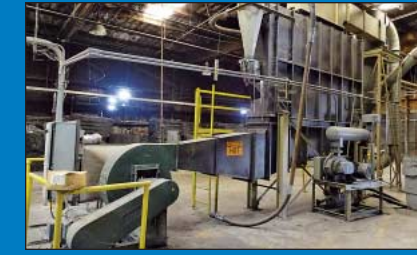
Applied Chemical Technology Natural Gas Fired Fluidized Bed Material Drying Line