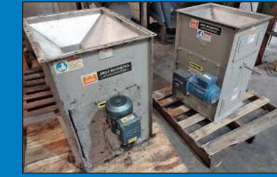
(3) Eriez 12" X 12" and 12" X 24" Drum Magnets