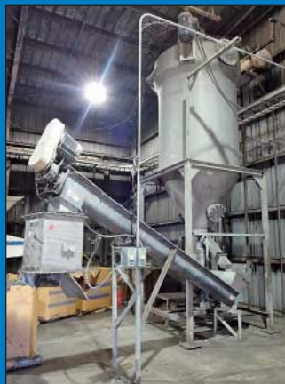
60" Dia. X 10' High Approx. Cone Bottom Stainless Steel Mixer Unit