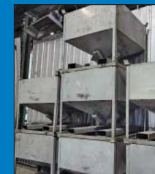
(25) 48" x 48" x 22" Deep Cone Bottom Fabricated Steel Hoppers