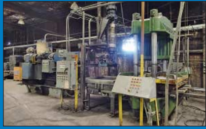
Overall View 60-HP Extruder w/Vertical Accumulator and Slab Press

See website www.cia-auction.com for complete listing, detailed specifications, photos, and link to online bidding. Register for online bidding at www.bidspotter.com .