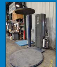
Lantech Q300 Rotary Pallet Stretch Wrapper