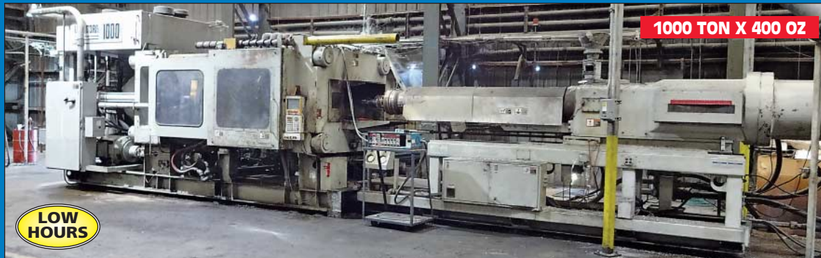
1,000 Ton x 400 Oz. Van Dorn Model 1000HP-400 Plastic Injection Molding Machine

TERMS OF SALE: All equipment described herein will be sold "as is", "where is" to the highest bidder or bidders for cash in accordance with our regular terms and conditions of sale. Unless other satisfactory arrangements are made, a 25% deposit in cash, certified or cashier's check payable to Cincinnati Industrial Auctioneers, Inc., is required on all purchases. Firm and personal checks accepted only if accompanied by a letter from your bank guaranteeing your funds. All sales are subject to state and/or local taxes unless a signed exemption form is presented at the time of purchase. All balances are due at the conclusion of the sale. No merchandise may be removed while the sale is in progress. All bidders must comply with our Standard Terms of Sale, copies of which will be available at the sale site or can be obtained from our website.