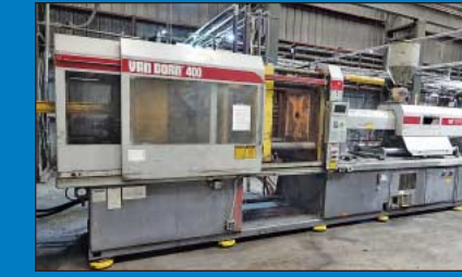
400 Ton x 48 Oz. Van Dorn Model 400-RS-48F-HT Plastic Injection Molding Machine