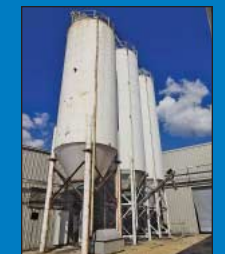
(2) 12' x 60' Peabody Tectank Fabricated Steel Silos