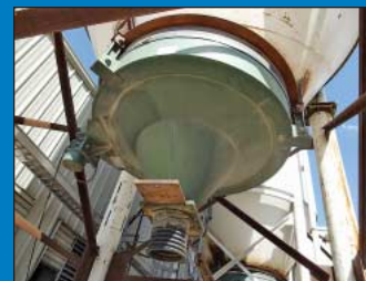
(1) w/ Carman Model 6CBD Bottom Valve