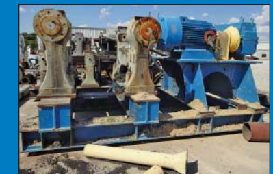
(4) Farrell Cracker Mill Housings