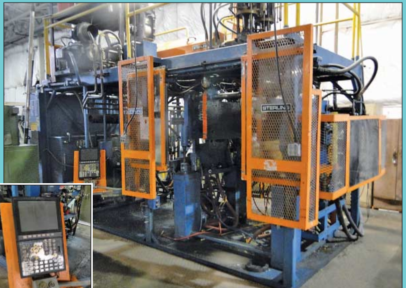
Sterling Dual 3 Lb. Shot Accumulator Head Blow Molding Machine