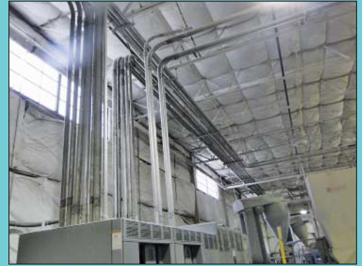
Heavy Copper Wire from Service Panel to Machines