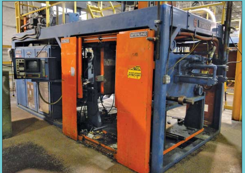
Sterling Dual 5 Lb. Shot Accumulator Head Blow Molding Machine