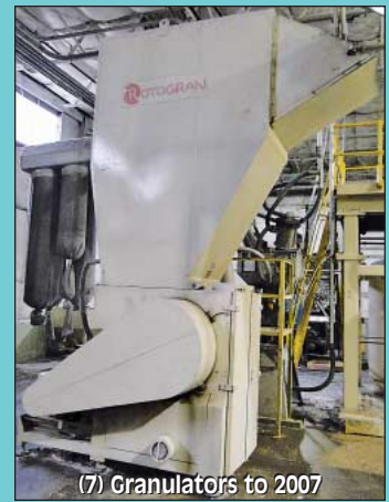
(7) Granulators to 2007