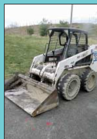
Bobcat Model 763 Solid Tire Skid Steer Loader