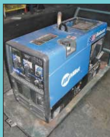
Miller Bobcat 225 Welder / Generator