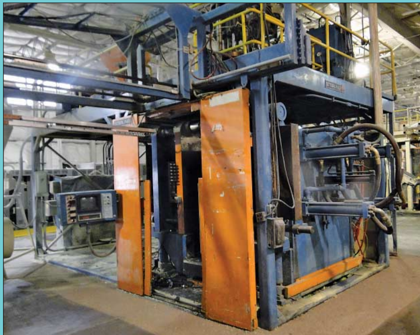
Sterling Dual 15 Lb. Shot Accumulator Head Blow Molding Machine