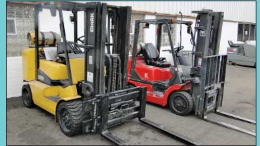
(3) Lift Trucks to 10,000 Lb. by Clark, Kalmar, and Komatsu