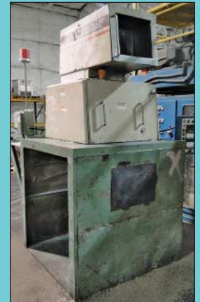
(2) 14" X 16" Cumberland Plastic Granulators