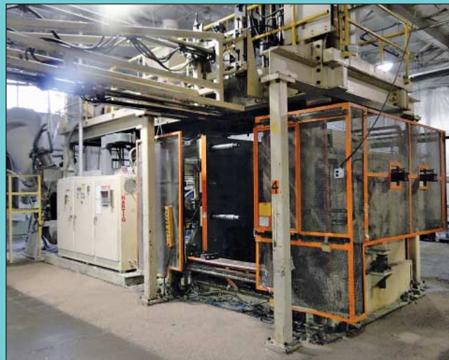
(2) Hartig Single 25 Lb. Shot Accumulator Head Blow Molding Machines