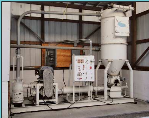
75 HP MAC Colt-On Push/ Pull Vacuum / Pressure Railcar Unloading System