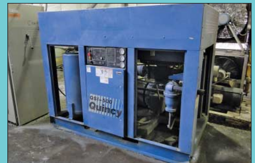
100 HP Quincy Model QS1500ACA3ISD Air Cooled Rotary Screw Air Compressor