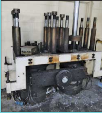
Hartig Dual 25 Lb. Head