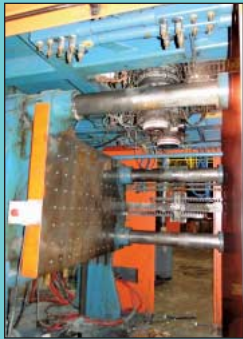
Inside View Sterling Dual 5 Lb. Blow Molder