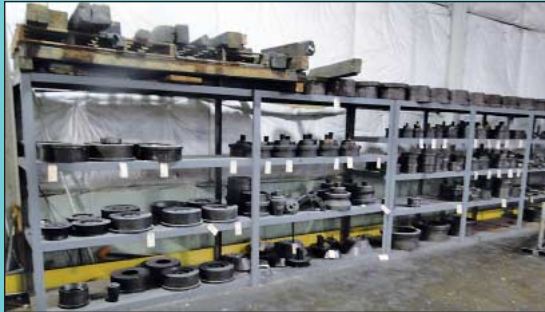
Large Quantity Blow Molder Head Tooling