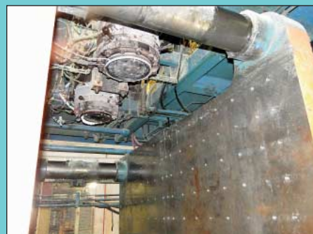
Inside View Sterling Dual 15 Lb. Blow Molder

Sterling Dual 3 Lb. Shot Accumulator Head Blow Molding Machine; S/N N/A, 17" Head Center Distance, 75 HP Balder Spectrum DC Motor / Drive, 35" Wide X 20" High Clear Platen Area, Assorted Head Tooling (Estimated 1994) SEE PHOTO