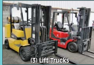
(3) Lift Trucks