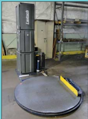
Lantech Q Series Automatic Stretch Wrapper

12' Gator USA 2,990 Lb. GVWR Utility Flat Bed Single Axle Trailer with Fold Down Loading Ramp; VIN # 4Z1UA1210CS022855 (New 2012)