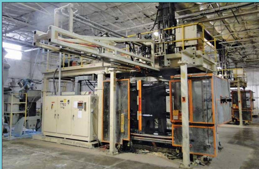
(2) Hartig Single 25 Lb. Shot Accumulator Head Blow Molding Machines