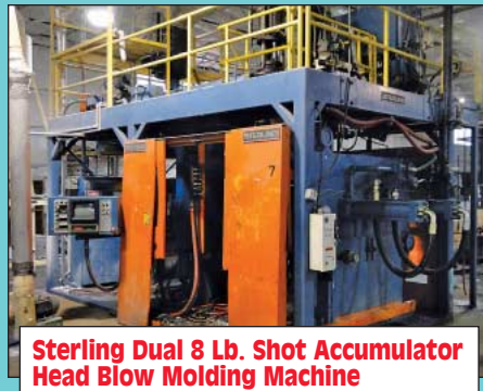
Sterling Dual 8 Lb. Shot Accumulator Head Blow Molding Machine