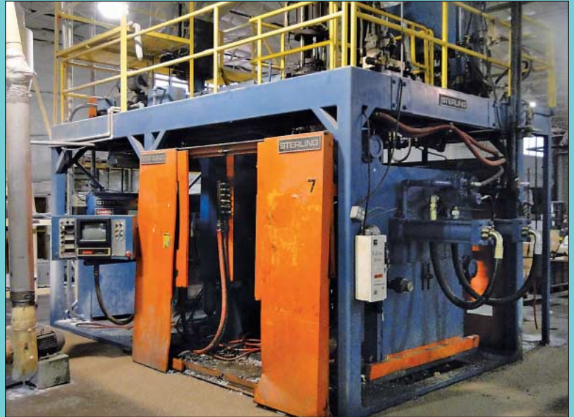
Sterling Dual 8 Lb. Shot Accumulator Head Blow Molding Machine