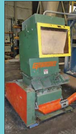
16" X 24" Granotec Model TFG1624 Plastic Granulator