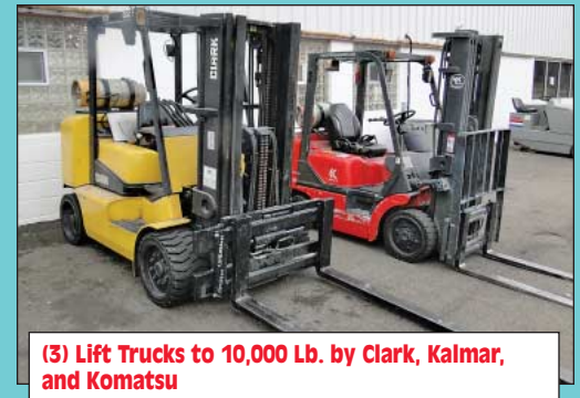
(3) Lift Trucks to 10,000 Lb. by Clark, Kalmar, and Komatsu

CINCINNATI INDUSTRIAL AUCTIONEERS auctioneers | appraisers | since 1961