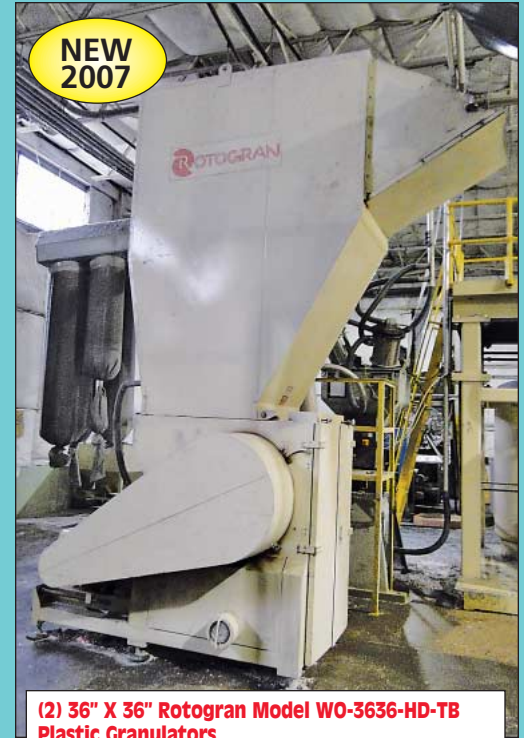
(2) 36" X 36" Rotogran Model WO-3636-HD-TB Plastic Granulators