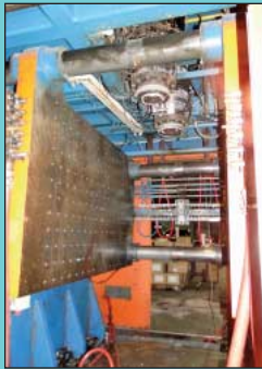
Inside View Sterling Dual 8 Lb. Blow Molder