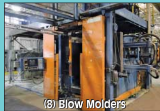
(8) Blow Molders

Contact Information 2020 Dunlap St. Cincinnati, Ohio 45214 Phone 513-241-9701 Fax 513-241-6760 www.cia-auction.com