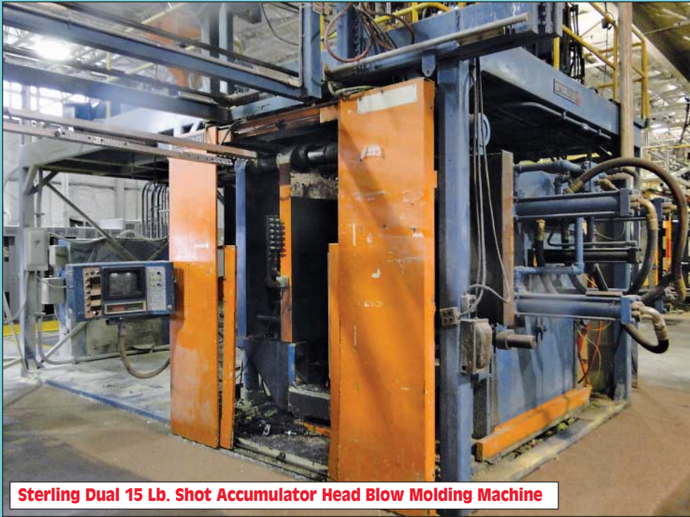
Sterling Dual 15 Lb. Shot Accumulator Head Blow Molding Machine

INSPECTION: TUESDAY, JANUARY 21ST FROM 10:00 AM TO 4:00 PM