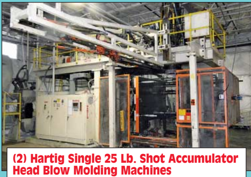
(2) Hartig Single 25 Lb. Shot Accumulator Head Blow Molding Machines