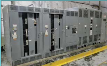
Complete Electrical Distribution Panel. See Page 5 For Details