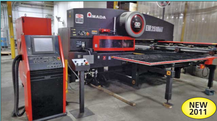
22 Ton Amada Model EM-2510NT Electric Power Twin Servo Driven Heavy Duty High Speed CNC Turret Punch

INSPECTION: TUESDAY, SEPTEMBER 27TH FROM 10:00 AM TO 4:00 PM