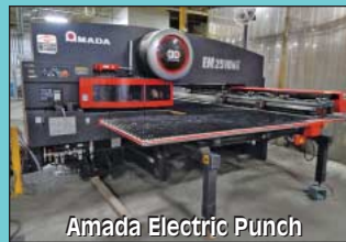
Amada Electric Punch

Contact Information 2020 Dunlap St. Cincinnati, Ohio 45214 Phone 513-241-9701 Fax 513-241-6760 www.cia-auction.com