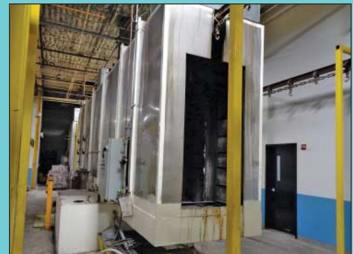
35' Long Col-Met / Diversified Finishing Systems Stainless Upper Pass-Thru Parts Washer