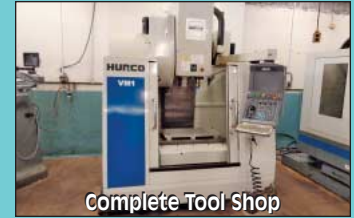
Complete Tool Shop