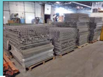
Large Quantity Pallet Rack