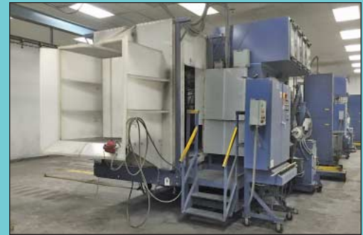
(3) Nordson Model XL-2001 Eight-Gun Automatic Poly Upper Pass-Thru Powder Coat Booths