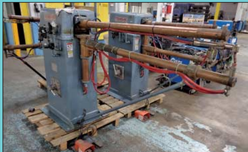
100 KVA Standard Rocker Arm Type HR3-60-100 Spot Welder