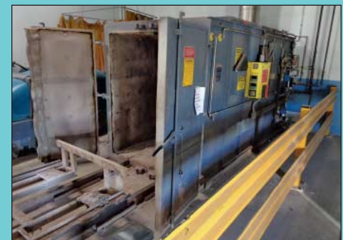
Controlled Pyrolysis Model PTR-300 Natural Gas Fired Burn-Off Oven