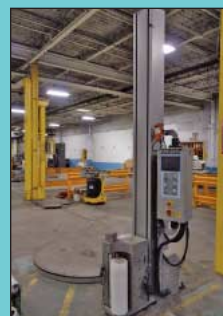
5' Highlight Predator Platinum Rotary Pallet Stretch Wrapper