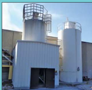
(2) 12' x 25' Mfg. Unknown Welded Steel Concrete Storage Silos