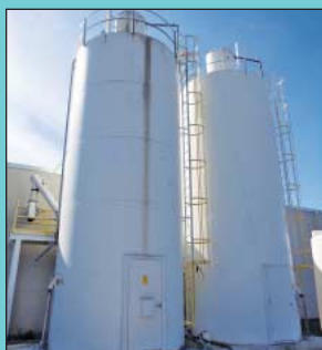
(2) 12' x 36' Peabody Tectank Welded Steel Poly Storage Silos