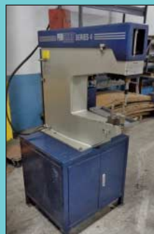
Pem Senter Series 4 Hardware Insertion Press