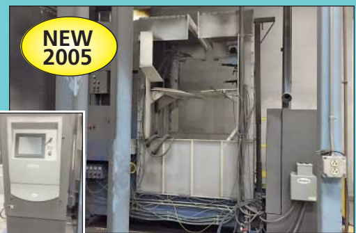
Nordson Model Versa Coat Three-Gun Automatic Poly Upper Pass-Thru Powder Coat Booth