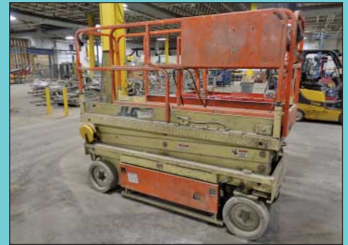
(2) JLG Model 2032E2 Electric Scissor Lifts

Support Equipment; (6) Lista and Kennedy Multi-Drawer Tooling Cabinets with Perishable Tooling, Machine Parts and Hardware, (5) Die Lifts, Grinders, Drills, Saws, Tooling and Machine Accessories, Steel and Maple top Benches, Inspection Equipment, Granite Surface Plates and Other Related Items