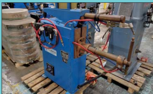
75 KVA TJ Snow / Federal Type RA-30-3 Rocker Arm Spot Welder