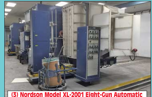
(3) Nordson Model XL-2001 Eight-Gun Automatic Poly Upper Pass-Thru Powder Coat Booths