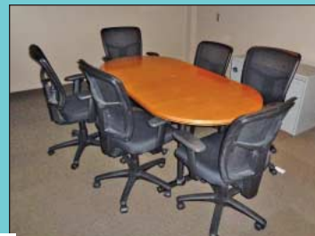
Large Quantity Office Furniture