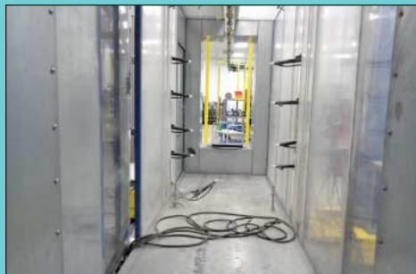
Nordson Model XL-2001 Twelve-Gun Automatic Pass-Thru Powder Coat Booth