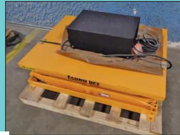
Late Model Shop Equipment