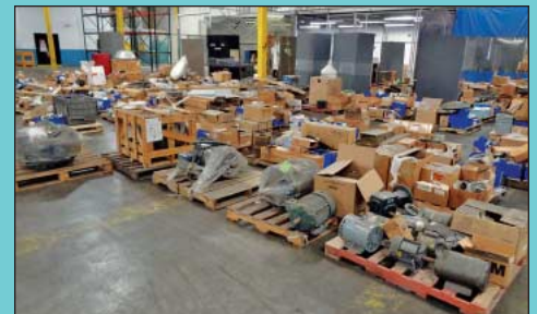
(100) Skids Building and Machine Maintenance Parts