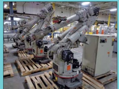
(4) Motoman Model SK-150 Six-Axis Robots