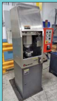
Amada TOGU III Punch Grinder

Rite Model 600W Natural Gas Fired Boiler; s/n 26461, Boiler Assembly, No. AS632229