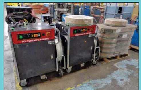
(2) Polychem Model PC-650-RPS 1572YD Automatic Strappers