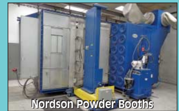
Nordson Powder Booths