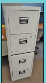
(100) Fireproof File Cabinets