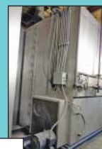
25' X 30' COL-MET DRY-OFF AND CURE OVEN NEW 2005