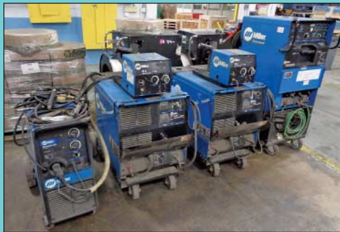
(10) Miller and Lincoln Mig and Tig Welders