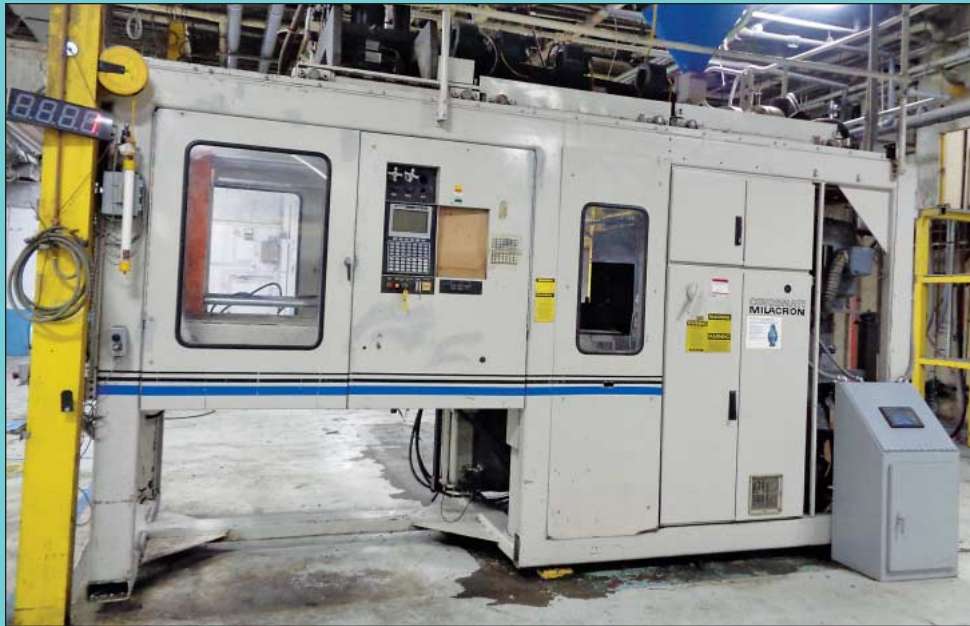
8 1/2 LB Cincinnati Model 90-D-4000C Single Head Blow Molder