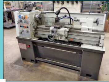
Complete Machine Shop