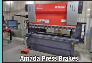
Amada Press Brakes