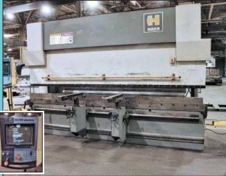
250 Ton X 12' Haco/Atlantic "EuroMaster" Model ERM-250-12 CNC Six-Axis Hydraulic Press Brake