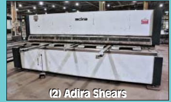
(2) Adira Shears