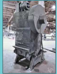
90 Ton Niagara Model A4-1/2 OBI Press