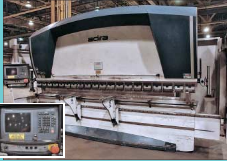
175 Ton X 13' Adira Model QIHD-175-40 CNC Four-Axis Hydraulic Press Brake