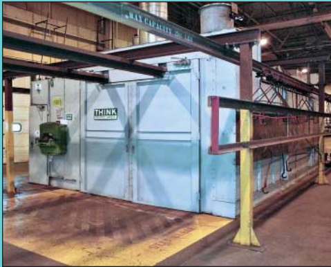
16' Wide X 27' Long X 11' High Devilbliss Drive-In Type Paint Spray Booth