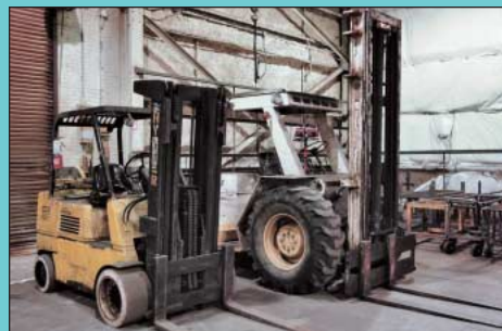
Bank View of Hyster and Master Craft Lift Trucks To 10,000 LBS