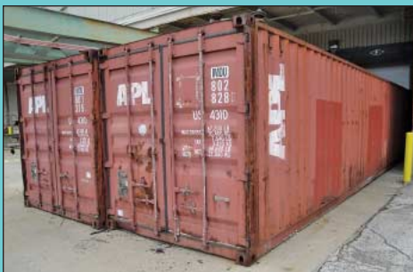
(2) 40' X 8' Shipping Containers

Large Quantity of Shop Equipment; (75) Steel Horses, (200) Steel Cart and Warehouse Trucks, Roller Conveyor, Steel Benches, Cabinets, Dump Hopper, Part Cabinet, Collapsible Plastic Totes, Dock Plate, (35) Pedestal Fans, Parts and Maintained Crib Items Locker, Cafeteria Tables, Chairs, Steel Scrap