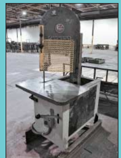
8" Roll-In Model EF1459 Vertical Band Saw