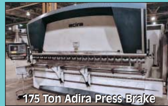
175 Ton Adira Press Brake

2020 DUNLAP ST., CINCINNATI, OHIO 45214 PHONE (513) 241-9701 / FAX (513) 241-6760 WEBSITE: cia-auction.com