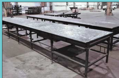
(4) 4' X 24' H.D. Steel Layout/Welding Tables