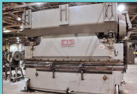
150 Ton X 12' Chicago Model 1012-R Mechanical Press Brake