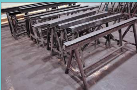
Large Quantity of Steel Saw Horses, Carts, Tubs