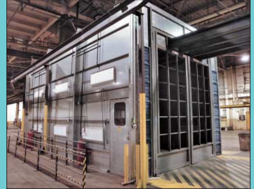
16' Wide X 34' Long X 14' High Global Finishing Solutions Model CDG-1616-NDT Crossdraft Drive Type Paint Booth