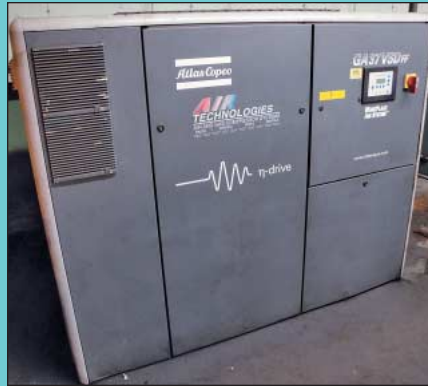
50 HP Atlas Copco Model GA-37VSD "N" Drive Rotary Screw Air Compressor