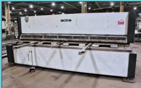
3/8" X 13' Adira Model GHR1040 Hydraulic Squaring Shear