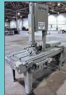
18" Starite Model VT-460 Tilt Frame Vertical Band Saw