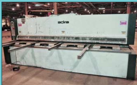
1/4" X 13' Adira Model GHR0640 Hydraulic Squaring Shear