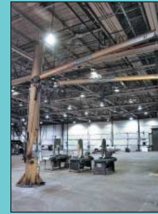
1 Ton David Round and Son Dual Arm Jib Crane