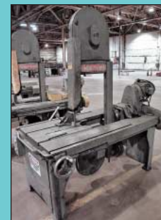
18" Marvel Model 8M8-4 Tilt Frame Vertical Band Saw