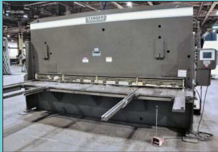
3/8" X 12' Standard Model AS375-12 Hydraulic Squaring Shear