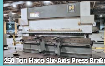
250 Ton Haco Six-Axis Press Brake