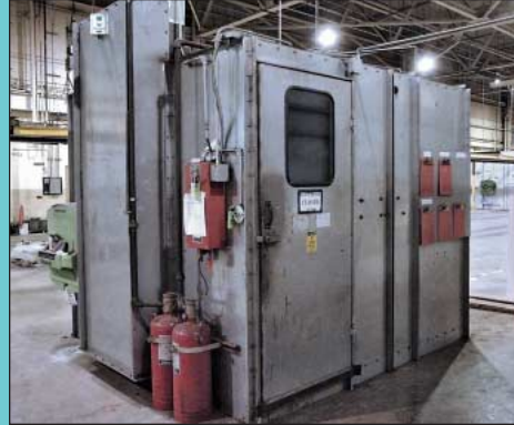
9' X 9' Global Finishing Systems Model PM-R-89N Paint Mixing Room