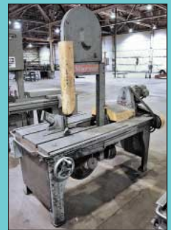
18" Marvel Model 8M8-4 Tilt Frame Vertical Band Saw