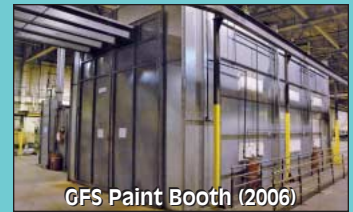
GFS Paint Booth (2006)