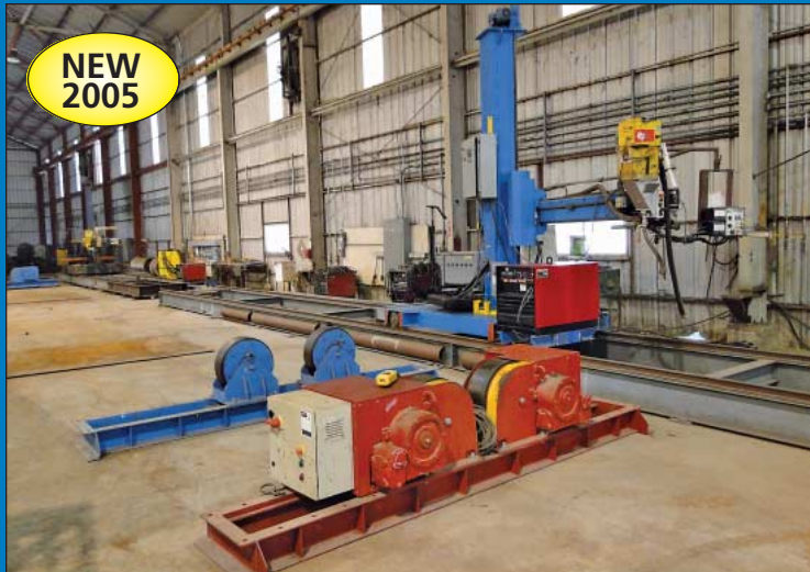
Romar Model RM3025-TCM Track Mount Welding Manipulator