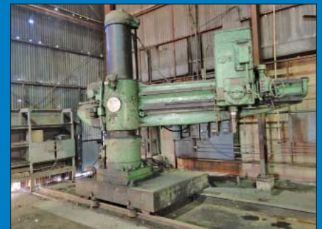
9' Arm X 17" Column X 45' Track Cincinnati Bickford Super Service Track Mounted Radial Arm Drill