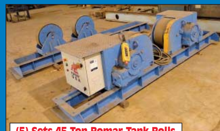
(5) Sets 45 Ton Romar Tank Rolls