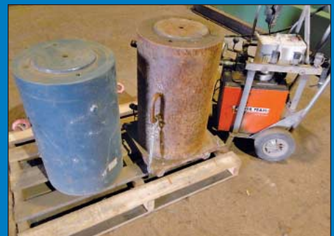
(2) 664 Ton Simplex Hydraulic Jacks w/ Electric Pump System