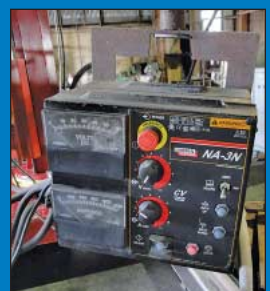
Close Up View Romar Manipulator Welding Equipment