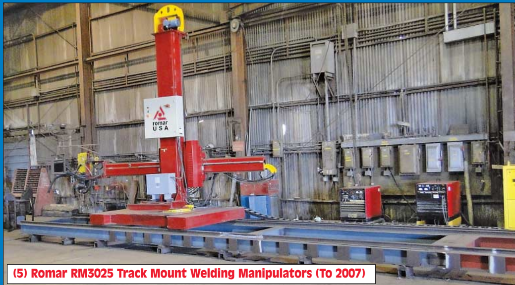
(5) Romar RM3025 Track Mount Welding Manipulators (To 2007)

INSPECTION: WEDNESDAY, NOV. 13TH FROM 10:00 AM TO 4:00 PM