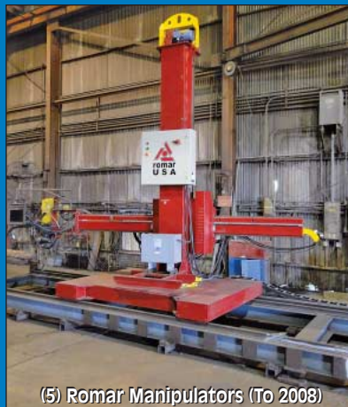
(5) Romar Manipulators (To 2008)

2020 DUNLAP ST., CINCINNATI, OHIO 45214 PHONE (513) 241-9701 / FAX (513) 241-6760 WEBSITE: cia-auction.com