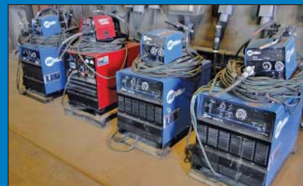
(50+) Lincoln & Miller Welders (To 2008)