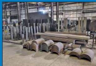
Large Quantity Steel Floor Plate and Steel Scrap