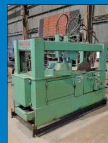
24" Trennjager Model PMC8 Upacting Mitre Head Cold Saw