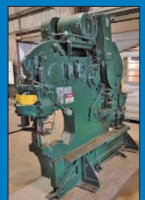
Buffalo No. 2-1/2 Unistructural Mechanical Iron Worker