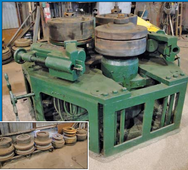
6" X 6" X 7/8" Buffalo No. 3 Horizontal Angle Bending Roll

No Last Minute Registrations will be accepted. Make Sure to Register & Post Your Deposit No Later than 48-Hours Prior to the Start of the Auction.