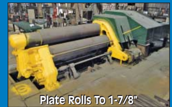
Plate Rolls To 1-7/8"