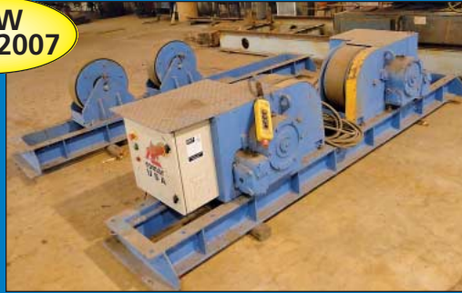
(5) 45 Ton / 30 Metric Ton Romar Model PR30/45DM Motorized Tank Turning Roll Sets w/ Idlers