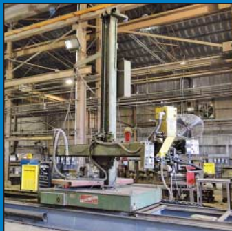
10' X 10' Pandjiris Model 30565-CAR Track Mount Welding Manipulator

10' X 10' Pandjiris Model 30565-CAR Track Mount Welding Manipulator; S/N 800-4980, 58" Wide X 70' Long Track, 1,000 Amp Lincoln DC-1000 Welding Power Source, Lincoln NA-3A Wire Feed Control, Sub-Arc System SEE PHOTO