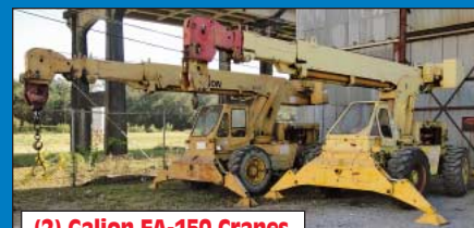
(2) Galion FA-150 Cranes