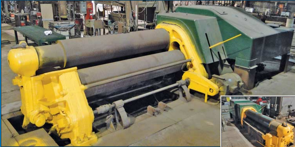
1-7/8" X 10' Webb Model 24L Mechanical Plate Bending Roll