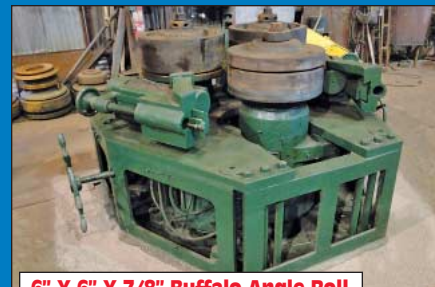
6" X 6" X 7/8" Buffalo Angle Roll