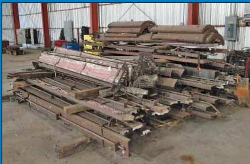
(22) PDS Corp 9-Zone and 6-Zone Weld Heaters