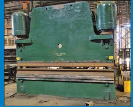
600 Ton X 12' Pacific Hydraulic Press Brake