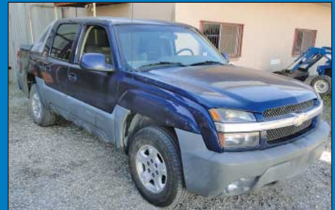
2002 Chevrolet Model Z-66 Avalanche 4-Door SUV