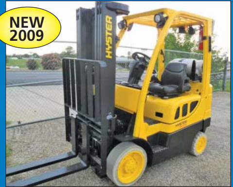
6,000 LB Hyster Model S60FT LP Gas Cushion Tire Lift Truck (New 2009)