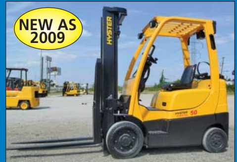
5,000 LB Hyster Model S50FT & S50XM LP Gas Cushion Tire Lift Trucks (New to 2009)