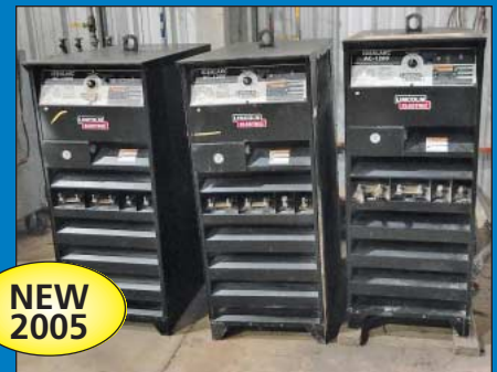
(32) 400 Amp Lincoln Idealarc DC-400 Mig Welders with Lincoln LF72 and LN7 Wire Feeders