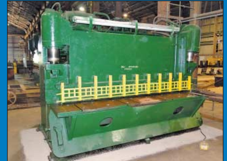
3/8" X 10' Pacific Model 375HD Hydraulic Power Squaring Shear