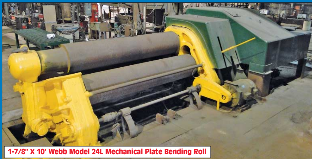
1-7/8" X 10' Webb Model 24L Mechanical Plate Bending Roll