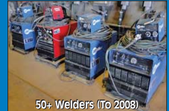
50+ Welders (To 2008)