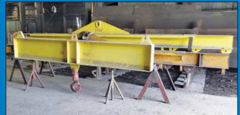
Large Quantity Lifting Equipment Including Spreader Bars, Chanins, Plate Grabbers and Related