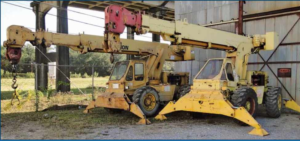
15 Ton Galion Model 150FA Rubber Tire Hydraulic Crane