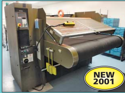
Atom Model S677-1 Programmable Die Cutting Press