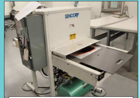
Sencorp Model 630 Two-Station Shuttle Type Blister Pack Vacuum Sealer