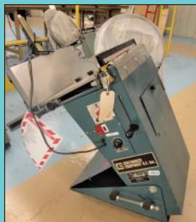
(15) 12" - 18" Wide Customized Equipment Southeast, Inc. Model SC16 Bar Sealers