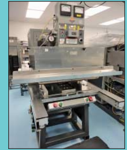
10 KW Callahan Model 20X30 RF Single Station Sealer