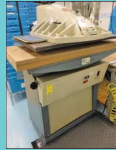
Emhart Model B-1 Hydraulic Die Cutting Machine