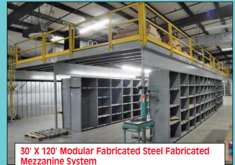
30' X 120' Modular Fabricated Steel Fabricated Mezzanine System