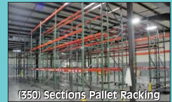
(350) Sections Pallet Racking