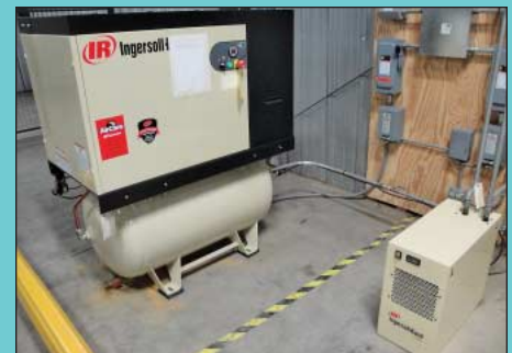
7.5 HP Ingersoll Rand Model UNB-7-115-L Air Compressor