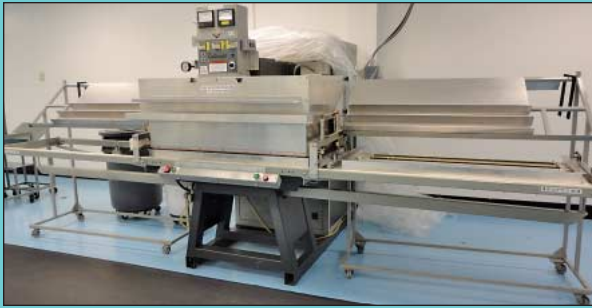
(2) 12.5 KW Callahan Model 20X48 Left & Right Shuttle Type RF Sealers