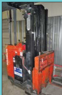
2,000 Lb. Raymond Model 20R30TT Electric Reach Truck