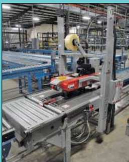
3M Matic Model 700-RKS Top and Bottom Case Sealer

The Above Listed Machines are Located at 2301 Speedball Road, Statesville, NC 28677 and Will Be Sold Via Photograph at the Main Plant Location. The Machinery will be Available for Inspection on August 18th or by Appointment with the Auctioneer.