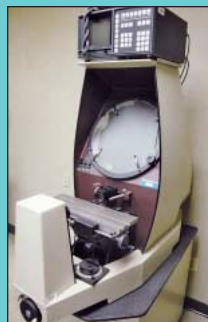
14" Brown & Sharpe Optical Comparator w/Quad Check 3000 DRO