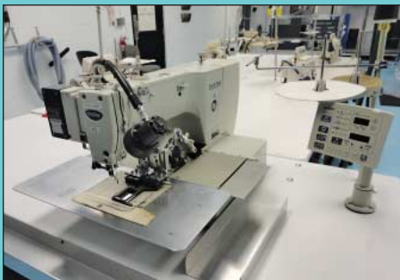
(3) Brother Model BAS-311E-21 Bar Tacker Sewing Machines w/ Brother BA-300E Control