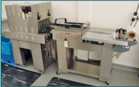
14" X 20" Heat Seal Model HS1520SD Stainless Steel "L" Sealer w/ 14" X 19" Heat Seal Model T261SS8-PMB Shrink Tunnel