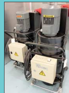
(2) 10 HP Ruetec Portable Vacuums