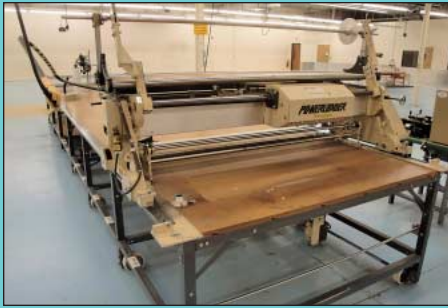
60" Wide CRA Model Champion Foam / Cloth Spreader / Cutter