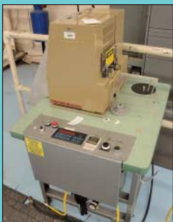
(5) 4" Wide ACE Model SC-HC-D-1000MP Strip Cutter with Durand PLC Control