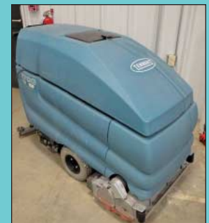
Tennant Model 5700XPES Electric Walk-Behind Floor Scrubber