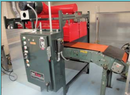
Dri Quick Infra Red Oven Model Dri Quik 2-60-1500