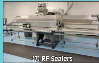
(7) RF Sealers

Contact Information 2020 Dunlap St. Cincinnati, Ohio 45214 Phone 513-241-9701 Fax 513-241-6760 www.cia-auction.com