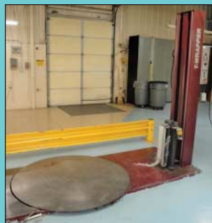
60" Lantech Model T-Wrapper Rotary Pallet Stretch Wrapper