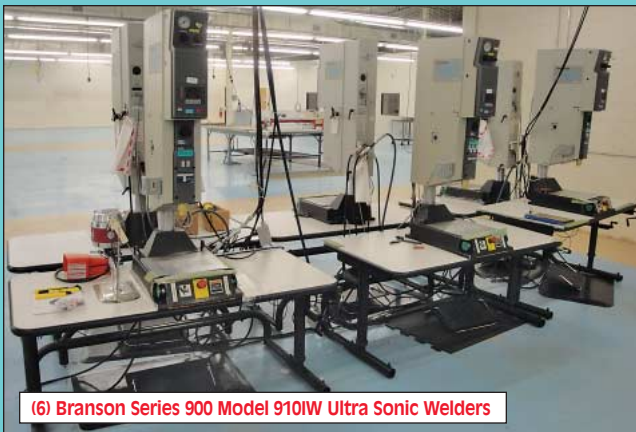
(6) Branson Series 900 Model 910IW Ultra Sonic Welders