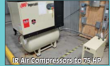
IR Air Compressors to 75 HP