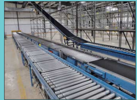
2000' Belt and Power Roller Conveyor