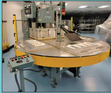
20 KW Kabar 20" X 48" Model DH-20000 RF Sealer w/ 96" Four-Station Rotary Table