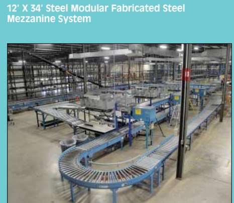
12' X 34' Steel Modular Fabricated Steel Mezzanine System