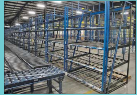
(42) Sections Flow Rack

(15) 12" - 18" Wide Customized Equipment Southeast, Inc. Model SC16 Bar Sealers SEE PHOTO